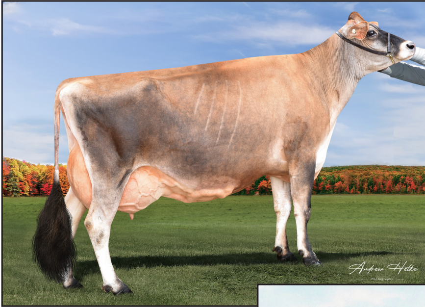
Ratliff Excitation Alana-ET EX-90 Dam of Lot 1