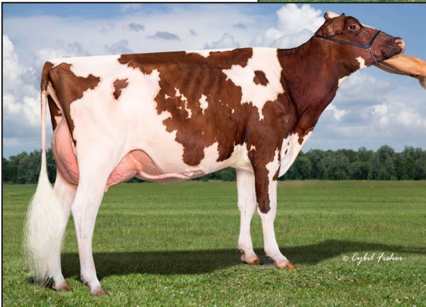
Hosking Jordy Alabama-Red VG-88 Lot 3