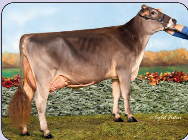
Cutting Edge CP Spirit '3E94/E93ms' Protein Plus 5/05 365d 2x 42220 4.8 2040 3.4 1439 DHIR Nom All American Jr 2 Yr Old 2016 Dam of Lots 41 & 42