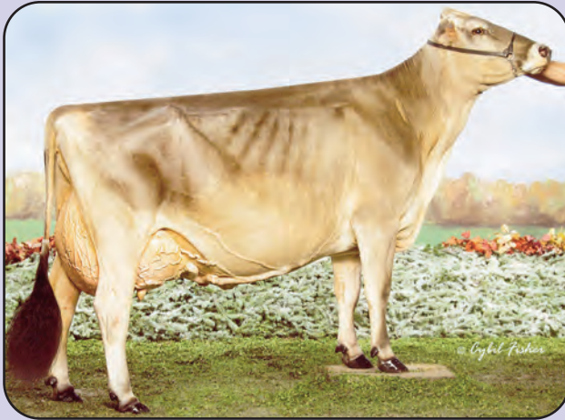
Cutting Edge T Delilah '2E95/E95ms' Protein Plus 6/05 365d 2X32770 4.7 1554 3.6 1170 DHIR All American Aged Cow 2019, AA Sr 2, 3 & 5 Yr Old 2015, 2016, 2018 Supreme Champion WDE 2018, 2019 - Donor Dam of Lots 7E & 8E