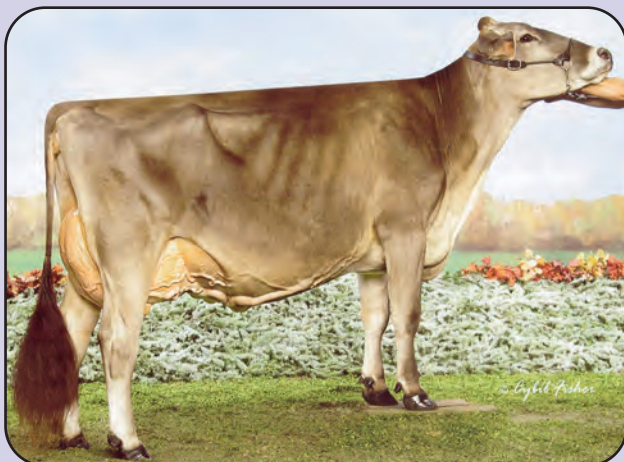
Cutting Edge Fawn 'E93/E94ms' 3/07 351d 2X 24650 4.3 1054 3.4 827 DHIR Reserve All American 4 Yr Old 2018 MGD of Lot 14