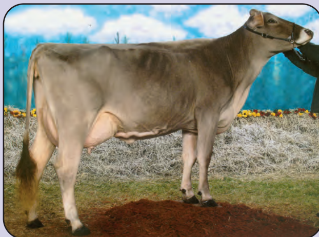
Brothers Three Wisper OCS *TM '2E92/E91ms' All American Jr 2 Yr Old 2002, HM AA Jr 3 YO 2001 *Superior Brood Cow* - MGD of Lot 20