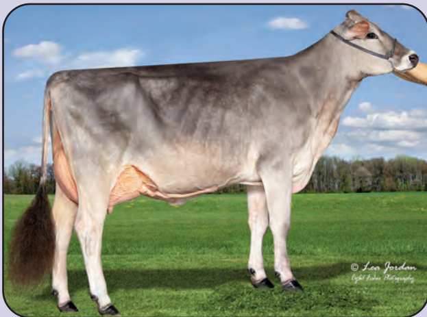
Stef-N Famous Kelsi ETV 'V87/V87ms' @2yr All American Fall Yrlg Hfr 2023, Res AA Fall Calf 2022 Maternal Sister to Lot 53