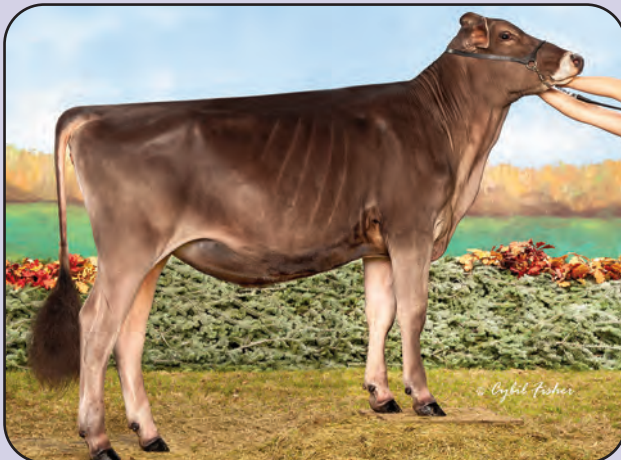
Top Acres Famous Winzer ETV 'V88' All American Summer Yrlg Hfr 2021 2nd Summer Jr 2 Yr Old Eastern National 2022 3/4 Sister to Lot 19, Mat Sis to Dam of Lot 18 & 19

MY T FINE WHISPER *TW 749328 2E90 - 2E90ms' *Certified* 04/01 365d 2X 25020 4.6 1145 3.8 947 DHIR RES ALL AMERICAN 5 Yr Old 1991 & AGED Cow 1992 Hm ALL AMERICAN 4 Yr Old 1990 GRAND CHAMPION EASTERN NATIONAL 1991 RES GRAND CHAMP EASTERN NATIONAL 1990, 1992