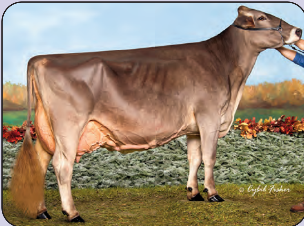
Jo-Dee Nemo Risky '2E94/E95ms' 8/08 365d 2X 33740 4.1 1367 3.1 1058 DHIR Reserve All American 4 Yr Old 2014 Dam of Lot 44