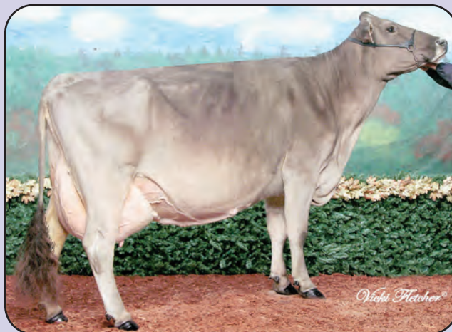
Nor Bella Jetway River ET '3E94/E92ms' 8/03 350d 2X 28440 4.2 1204 3.4 953 DHIA Reserve All American Jr 3 Yr Old 2003 3rd Dam of Lot 40