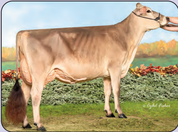
A Joy CP Snow White 68206689 'E91/E92ms' 3/03 333d 2X 25160 4.3 1078 3.5 886 DHIR Nom All American Jr 2 & Jr 3 Yr Old 2022, 2023 Maternal Sister to Lot 52Ch