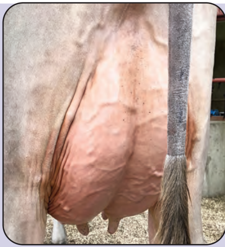
Rosey D Total Paris ET '2E90/E91ms' 5/03 327d 2X 26610 3.9 1049 3.4 899 DHIR 1st Jr 2 Yr Old WI State Fair 2017 - Dam of Lot 39