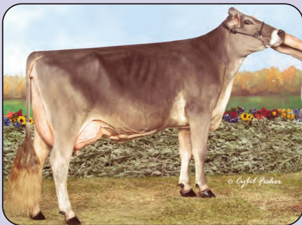
Cutting Edge JP Stacy '3E92/E92ms' 6/03 365d 2X 29540 4.2 1247 3.5 1039 DHIA All American Sr 3 Yr Old 2014 - MGD of Lots 41 & 42