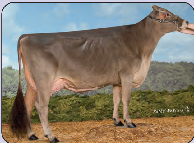
Brothers Three TV Wisco ETV '2E93/E93ms' 4/11 305d 2X 21490 3.6 772 3.5 755 DHIR Nom All American Sr 2, 3, 4 Yr Old 2016, 2017, 2018 Dam of Lot 20