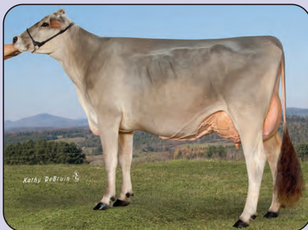
Cutting Edge WF Fargo '2E93/E93ms' 5/00 305d 2X 21860 3.9 859 3.3 716 DHIA Nom All American Jr 3 Yr Old 2020 MGD of Lot 15