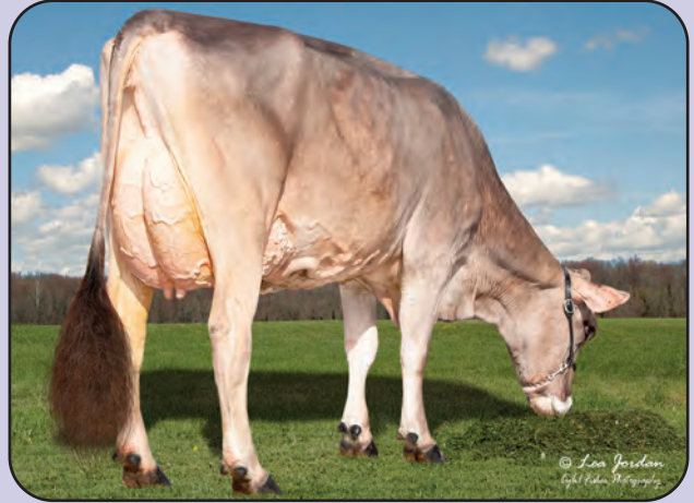
Lot 1's 10th Dam: ARBOR ROSE STRETCHY SPICEY 595898 '2E90' All American 4 Yr Old 1977 & HM AA Aged Cow 1978 Grand Champion Central National 1977 11th Dam: ARBOR ROSE PUNCH LILY 448368 '5E90/E90ms' 11/04 354d 2X 18470 4.3 803 ROP