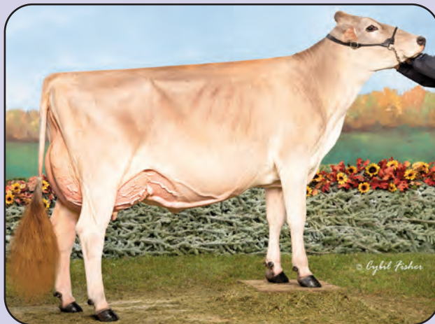
R N R Durham Ally '2E91/E91ms' 2/02 360d 2X 25651 5.3 1355 3.5 897 DHIA All American Jr 2 Yr Old 2021, Res AA Jr 3 2022 Dam of Lot 22

04/01 365d 2X 25020 4.6 1145 3.8 947 DHIR RES ALL AMERICAN 5 Yr Old 1991 & AGED COW 1992 HM ALL AMERICAN 4 Yr Old 1990 GRAND CHAMPION EASTERN NATIONAL 1991 RES GRAND CHAMP EASTERN NATIONAL 1990, 1992