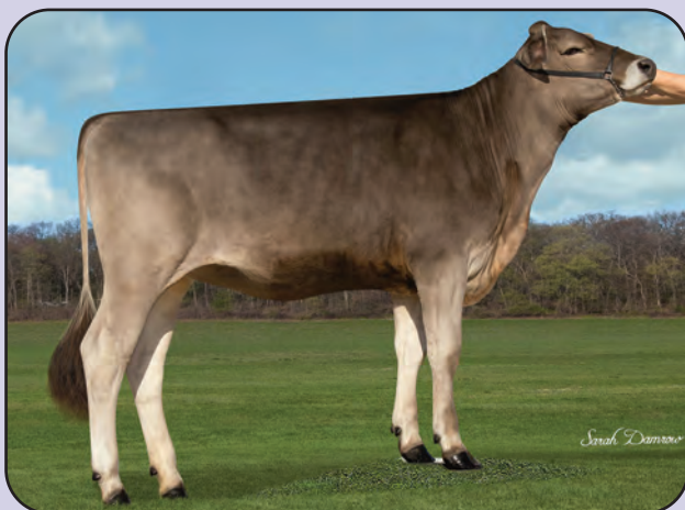
Hilltop Acres Nightlife ET +186 PPR, BC: A2/A2, KC: B/B Donor Dam of Lot 33E