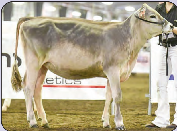
Knapp Norwin Disturbia ETV

J K SYMBOLIC LA JESTA TINA 626412 "4E90" 10/02365d 2X 16090 3.7603 3.4 553 DHIR