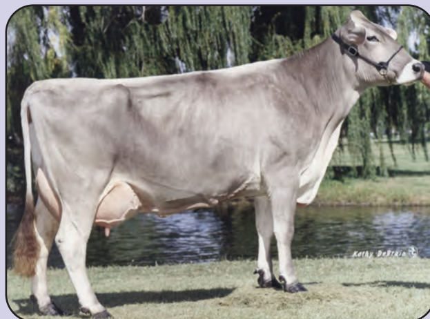
Onword Combo Viola '4E92/E91ms' 7/02 365d 2x 42140 5.2 2204 3.4 1426 DHIR HON MENTION ALL AMERICAN 5 YEAR OLD 1999 5th Dam of Lot 47