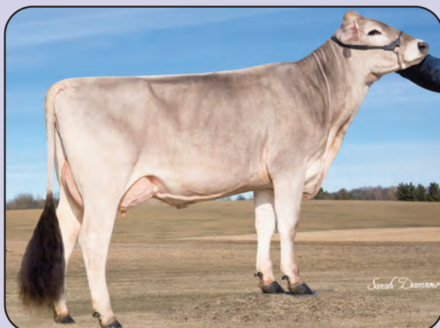
HF Cadence Dream ET 'E90/E90ms' *Certified* 5/08 315d 2X 27170 4.6 1247 3.3 901 DHIR Maternal Sister to Dam of Lot 34