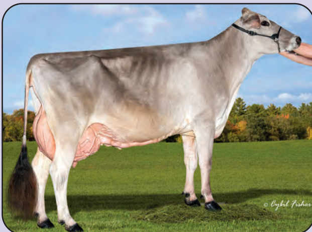
Cutting Edge F Diamond '2E92/E92ms' *4/10 365d 2X 29065 4.1 1200 3.5 1019 DHIR 2nd 5 Yr Old Northeast National 2023 Donor Dam of Lot 9E