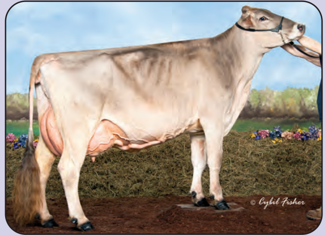
Towpath Agenda Dancer '2E92/E93ms' Hon Men All American Winter Yrlg 2010 MGD of Lots 7E & 8E