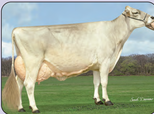
Hilltop Acres Delphi Dazzle ET '2E94/E94ms' 4/01 365d 3X 38390 4.5 1727 3.5 1352 DHIR Nom All American Component Merit Cow 2023 Protein Plus - Dam of Lot 48

Lot 48's 6th Dam: '3E94 - E94ms' *Certified* ARTHURST GARBRO DIXIE ET 892453 04/07 305d 2X 27860 4.3 1208 3.2 901 DHIR 06/08 305d 2X 26420 4.1 1075 3.4 911 DHIR 08/04 365d 2X 33470 4.8 1620 3.3 1112 DHIR Lifetime: 2704d 198580m 8623f 6960p * ALL AMERICAN Sr 3 & 4 Yr Old 2003, 2004 * NOM ALL AMERICAN COMP MERIT COW 2008