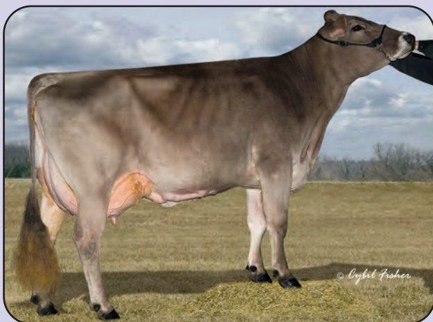
Sun-Made Garbro EG Patsy ET '3E93/E93ms' 5/02 365d 2X 52360 5.0 2592 3.4 1794 DHIR JP Eves Milk & National Protein Award 2009 1st 5YO 365d Milk, Fat, Protein Honor Roll Donor Dam of Lot 50 E