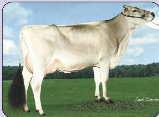
Eachibon Essence D Dolly 'E91/E91ms' 4/10 365d 2X 21500 4.4 947 3.3 718 DHIR MGD of Lot 51E