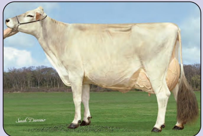
Cutting Edge D Dharma ETV 'E92/E91ms' 4/06 305d 2X 37240 4.1 1509 3.1 1153 DHIR Protein Plus - Dam of Lot 28