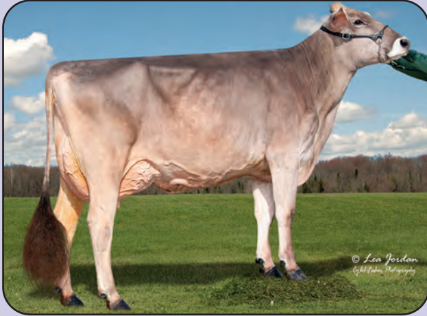
V B Phantom Sinister 'E90/E92ms' 2/02 292d 3X 18320 4.4 798 3.6 663 DHIA Dam of Lot 1