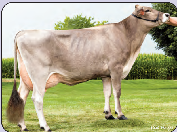
Sun-Made HP Wndrmnt Echo ET 'E91/E90ms' 4/02 365d 2X 33590 3.5 1184 3.3 1119 DHIR *Certified* - MGD of Lot 13

4th -8th Dams of Lot 13: LYNDALE EMORY ENID ET 803839 '2E91/E90ms' 03/04 365d 2x 31690 3.3 1050 3.3 1039 DHIR 05/04 365d 2x 40610 4.2 1697 3.3 1320 DHIR TOTAL PERFORMANCE WINNER SOUTHEAST NATIONAL 1997 LYNDALE CONVINCER ELAINE 728651 "5E93/E93ms" "Certified" "Superior Brood Cow" 05/02 365d 2x 33260 3.8 1264 3.4 1143 DHIR 11/05 365d 2x 34920 3.5 1229 3.4 1195 DHIR UNANIMOUS ALL AMERICAN 1988, 1989, 1990 GRAND CHAMPION CENTRAL NATIONAL 1988, 1989, 1990 SUPREME CHAMPION WORLD DAIRY EXPO 1988, 1989 WIND MILL TALISMAN ELLEN 681873 'V86 - Certified' 03/02 305d 2X 11830 4.0 475 3.7 442 DHIR WIND MILL EILEEN 625791 "V87 - Certified - Superior Brood Cow" 06/10 364d 2X 21000 4.5 943 3.9 823 DHIR HAZEL ALARIC MAGGIE 577133 "4E90 - Elite - Superior Brood Cow" 08/04 334d 2X 22300 4.3 953 DHIR