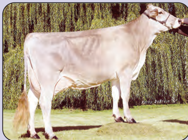
Sun-Made BG Plt Pretzel ET '3E93/E94ms' 2/03 365d 2X 32770 4.4 1453 3.5 1135 DHIR 2nd Sr 3 yr Old IN State Show & Fair 2011 Maternal Sister to Lot 50 Embryos