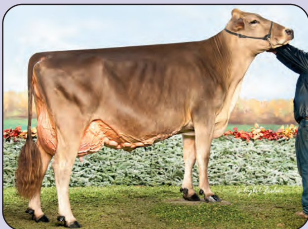
Top Acres Garbro S Wish ET E93/E93ms' 3/04 365d 3X 37320 4.3 1594 3.4 1254 DHIR All American Jr 2 & 4 Yr Old 2015, 2017 Dam of Lot 21