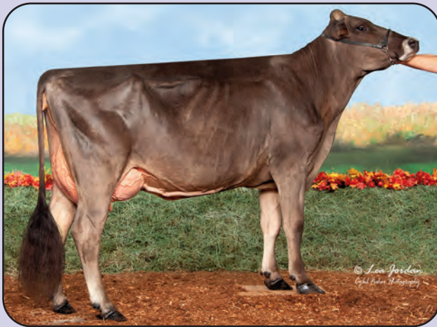
Top Acres Braiden Wizki ETV 'V87' 1st Jr 3 Year Old Southeast National 2022 Full Sister to Dam of Lots 18 & 19