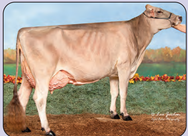
Cutting Edge S Dagmar 'E91/E90ms' 04/02 305d 2X 30900 4.4 1373 3.2 989 DHIA HM All American Jr Best 3 Fmls Member 2018 Nom All American Summer Yrlg Hfr 2018 Maternal Sister to Dam of Lot 10E