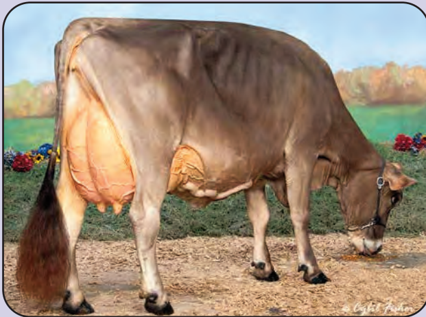
Voelkers Durango Sasha '4E94/E93ms' *Certified* 5/07 365d 2X 36860 6.8 2523 3.7 1361 DHIR Res All American Sr 3 Yr Old 2016 Protein Plus - Dam of Lot 26