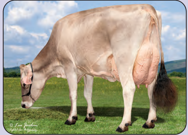
Hilltop Acres DDevil Kassidy ET '2E91/E91ms' 5/10 265d 3X 45920 4.4 2030 3.5 1622 DHIR Protein Plus - MGD of Lot 43