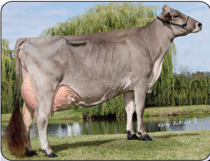
Top Acres Supreme Wizard ET '3E95/E95ms' 7/05 365d 2X 35400 4.9 1737 3.5 1246 DHIA All American Component Merit Cow 2017 Dam of Lot 17, MGD of Lots 18 & 19