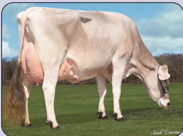
Hilltop Acres Bose Dixiland ET '3E93/E93ms' 4/05 365d 3X 47040 4.8 2235 3.6 1694 DHIR Protein Plus - Dam of Lot 47, MGD of Lot 48