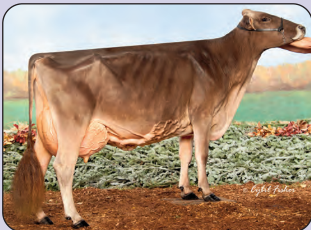
Random Luck V Precious '3E94/E94ms' 5/00 365d 2X 28820 4.2 1201 3.2 921 DHIR All American Summer Yrlg Hfr 2009, Res Jr 3 YO 2011 AA Sr Best 3 Member 2019 - Donor Dam of Lot 49E