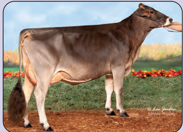
Top Acres Famous Winner ETV 'V88' 2nd Jr 3 Yr Old Southeast National 2023 Reserve National Bell Ringer Summer Jr 2 Yr Old 2022 3/4 Sister to Lot 19, Mat Sis to Dam of Lot 18 & 19