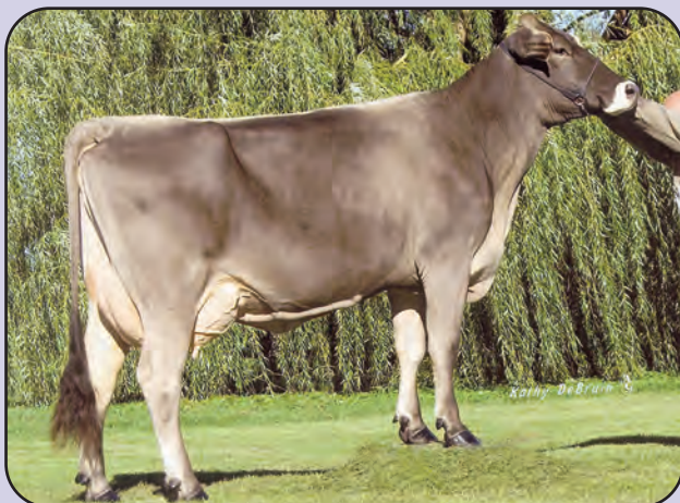
Onword Jetway Vixie ET 'E91/E91ms' 2/02 365d 2X 25080 4.3 1068 3.3 818 DHIR 2ND & 2ND BU SR 2 Yr OLD IA STATE FAIR 2007 4th Dam of Lot 47