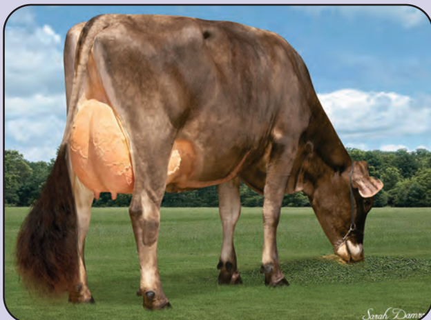
Hilltop Acres DB Tabby ETV 'E91/E91ms' 3/05 365d 3X 40090 5.0 2015 3.7 1500 DHIR Protein Plus - MGD of Lot 32