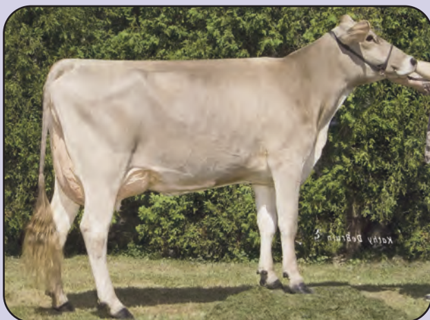
I & M Ch Zeus Pauline ET '2E93/E92ms' Protein Plus 5/08 365d 2X 40840 3.7 1513 3.1 1249 DHIR 3rd Jr 2 Yr Old Eastern National 2009 MGD of Lot 12