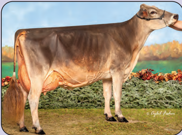
Groves-Sun Jonglr Teacup ET '3E94/E94ms' 5/06 365d 2X 33090 4.1 1369 3.3 1083 DHIA All American 5 Yr Old 2021 - MGD of Lot 27

LA RAINBOW STARFLY 695459 '3E90' 8/04 365d 2X 27450 4.2 1166 3.2 888 DHIR