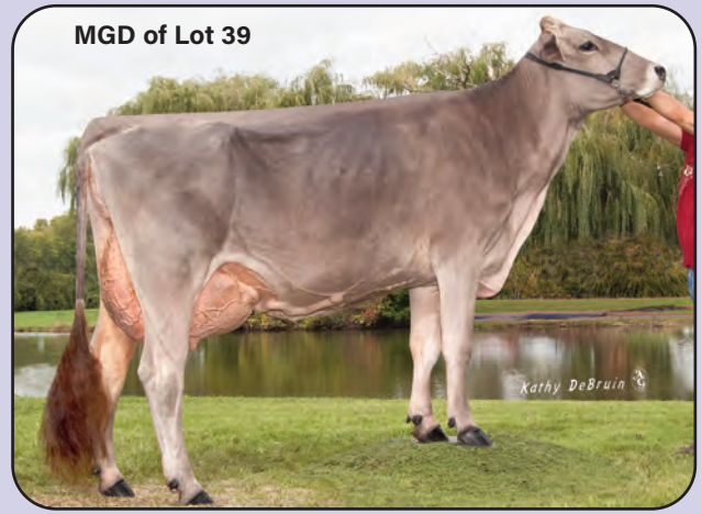
MGD of Lot 39 Random Luck S Peekaboo ET '2E92/E92ms' 4/01 365d 2X 26568 4.3 1138 3.3 871 DHIR Res All American Produce of Dam & Sr Best 3 2015