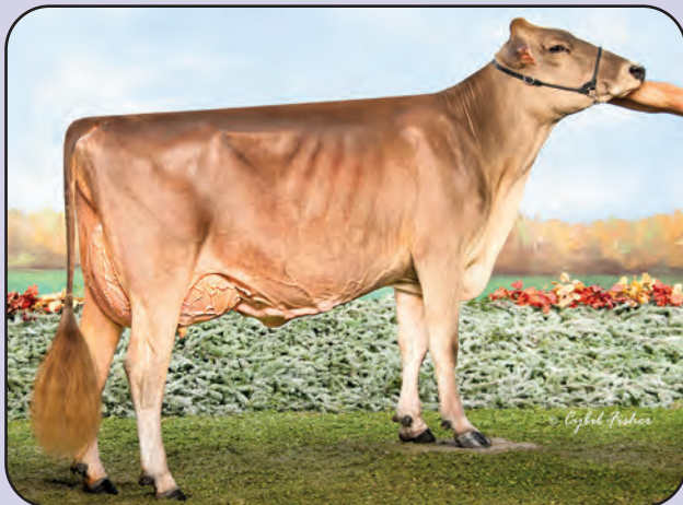
Jenlar Carter Waltz ETV 'E91/E92ms' 3/04 365d 3X 38300 4.2 1607 3.4 1290 DHIR All American Jr 3 Yr Old 2019, Nom AA Jr 2 Yr Old 2018 Dam of Lots 4, 5E, & 6