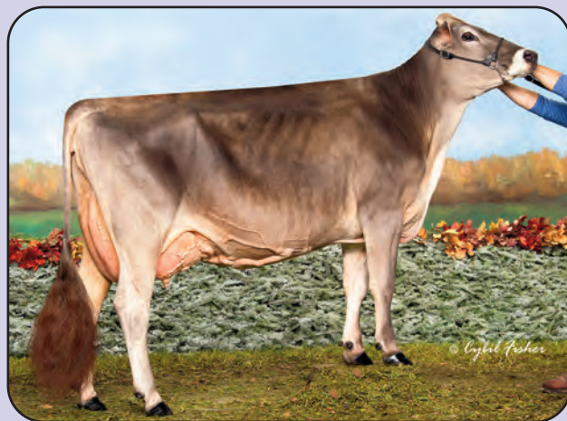
Cutting Edge B Stella 'E93/E92ms' 7/06 365d 2X 39290 4.2 1637 3.3 1283 DHIR 2nd Comp Merit Cow Eastern National 2021 1st Jr 3 Yr Old Southeast National 2016