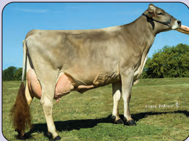
Cozy Nook Pronto Twilight '4E92/E93ms' 4/01 365d 2X 39680 4.0 1569 3.3 1303 DHIR Lifetime: 3487d 300,872m 12,959f 10,553p *Superior Brood Cow* - 4th Dam of Lot 32