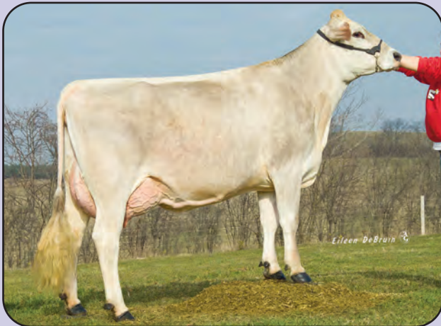
Cozy Nook Beamer Tasha 'E90/E91ms' 4/07 365d 2X 29100 4.6 1345 3.8 1107 DHIR 4th Dam of Lot 3