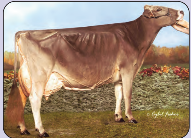
Jo Dee Ensign Rosebud '2E93/E92ms' 8/00 365d 2X 31690 3.4 1070 3.1 972 DHIR All American Aged Cow 2013, HM Jr 3 2009 & 5 YO 2011 MGD of Lot 44