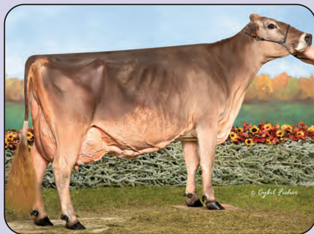
Cutting Edge Stratus Sue '3E94/E95ms' 9/06 365d 2X 60550 6.8 4097 3 .6 2208 DHIR National Fat & Protein Champion Same Maternal Line