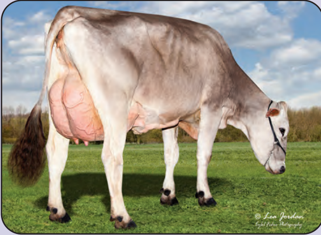
Hilltop Acres S Kadence ET 'E92/E92ms' *3/05 337d 3X 39971 4.7 1884 3.4 1383 DHIR Dam of Lot 43