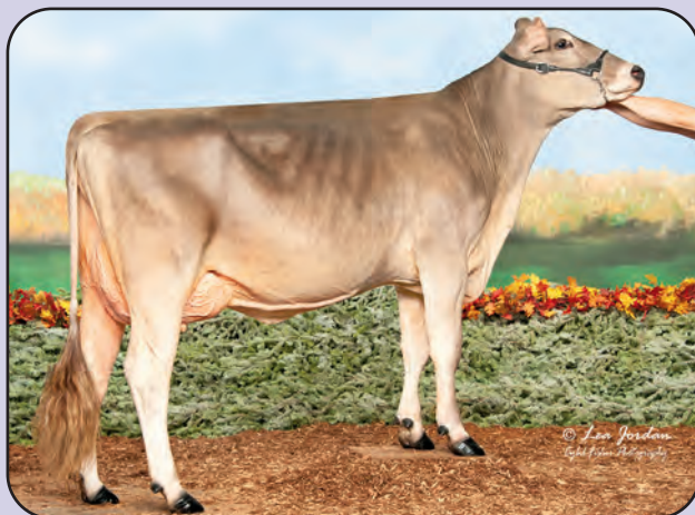
Jenlar FC Windmill ETV 'V89/E90ms' Nom All American Summer Jr 2 Yr Old 2023 Maternal Sister to Lots 4, 5E, & 6