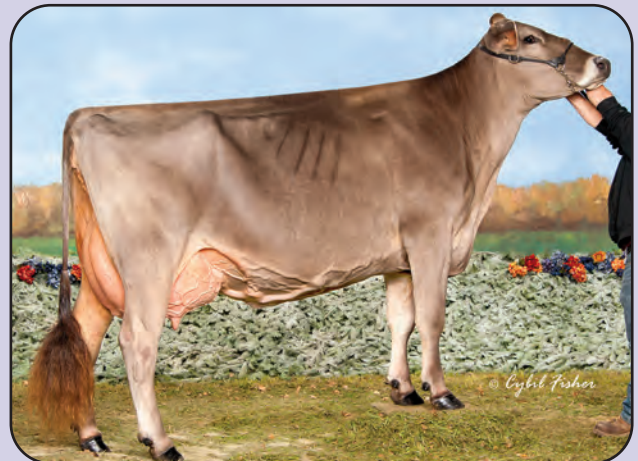
Jo-Dee Wonderment Nuclear ET '2E92/E92ms' 5/02 365d 2X 37750 4.1 1539 3.3 1243 DHIR Nom All American Sr 2 & 5 Yr Old 2012, 2015 MGD of Lots 29 & 30