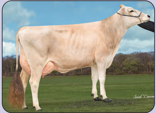
Hilltop Acres CAD Paula 'V87/V88ms' *Certified* 7/03 365d 3X 38860 4.8 1878 3.7 1433 DHIR MGD of Lot 2