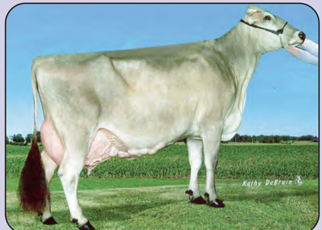
MGD of 45: Jenlar Legacy Taffy '3E93/E93ms' Maternal Sister to: Jenlar Dynasty Treat '5E91' Lifetime: 5340d 364,105m 16,760f 12,771p #1 Living Lifetime Cow 2023