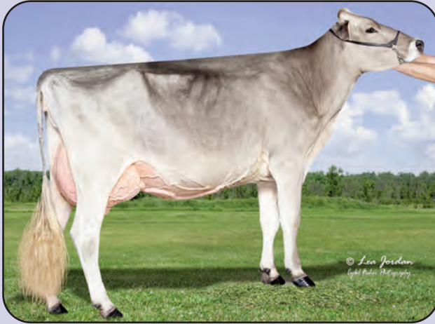
Sun-Made Elite Neith ET 'E90/V89ms' Hon Men All American Winter Calf 2016 Nom AA Win Yrlg 2017 - Dam of Lot 29