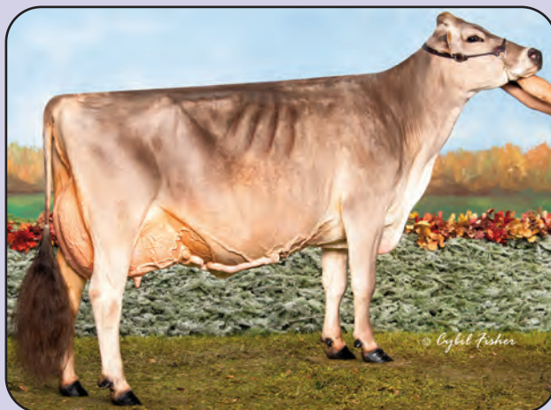
Brown Heaven Glenn Fantasy 'E97/E97ms' Canada 5/11 365d 2X 35556 4.7 1658 3.4 1208 DHIA All Am 4&5 Yr Old & Aged Cow- 3rd Dam of Lot 16