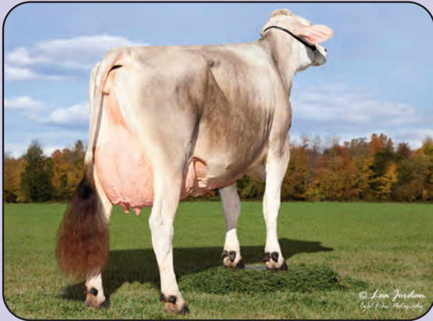
Hilltop Acres Princess ETV 'E91/E91ms' 2/11 365d 3X 44160 5.7 2525 3.8 1696 DHIR Dam of Lot 2