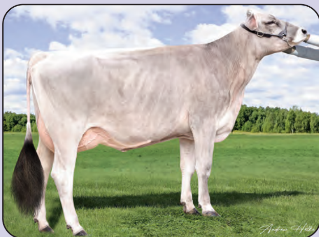
Just So D Faraway ET 'E92/E92ms' *3/10 203d 2X 22163 3.7 809 3.2 703 (RIP) Dam of Lot 15