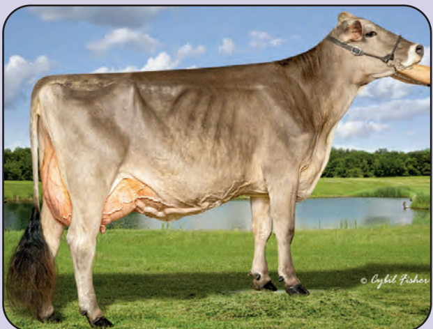
WF Biver Northernlights ET '2E94/E94ms' 4/07 354d 2X 30282 4.8 1441 3.7 1114 DHIA HM All American Sr 3 Yr Old & POD 2021 Nom AA Sr 2 & 4 Yr Old 2020, 2022 - Donor Dam of Lot 31E