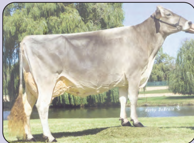
Random Luck KB Phoebe '2E93/E94ms' 5/08 365d 2X 34210 4.5 1541 3.1 1048 DHIR Hon Men All American Sr 3 YO 2006, Nom AA Aged 2010 MGD of Lot 49E