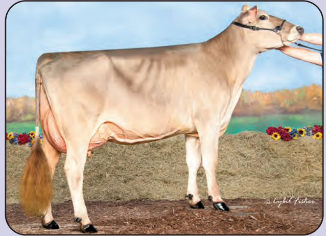
Cutting Edge D Neema ETV 'E91/E90ms' *Certified* 2/04 365d 2X 22990 3.5 816 3.6 819 DHIR Nom All American Sr 2 Yr Old 2020 Maternal Sister to Dam of Lot 29