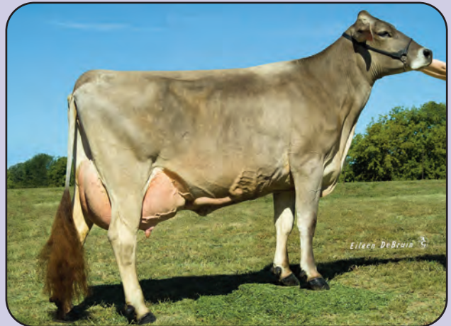
Cozy Nook Pronto Twilight '4E92/E92ms' 4/01 365d 2X 39680 4.0 1569 3.3 1303 DHIR 5th Dam of Lot 3