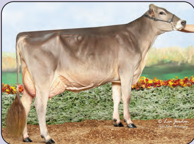
Mayers Bank It Natalia 'V88/V88ms' *Certified* 2/00 365d 2X 25280 4.3 1087 3.3 824 DHIR Junior Champion Southwest National 2022 1st Jr 2 Yr Old Southwest National 2023 Maternal Sister to Lot 30