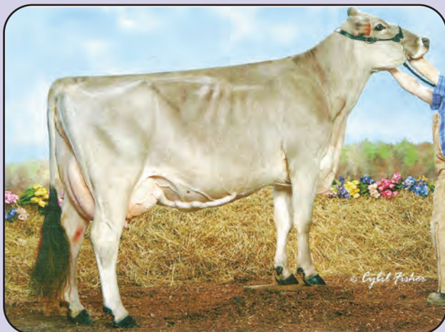
Cutting Edge Zeus Ruffle ET '3E93/E93ms' 8/06 365d 2X 38340 5.0 1904 3.5 1345 DHIR 2nd 5 YO & Aged Cow Eastern BS Show 2011, 2013 Protein Plus - MGD of Lot 40