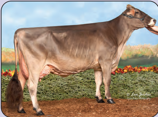
Cutting Edge B Daybreak ETV '2E91/E90ms' 2/06 365d 2X 27290 4.5 1238 3.6 972 DHIR Maternal Sister to Lots 7E, 8E, & Donor Dam of Lot 9E