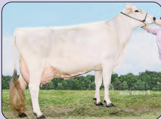
Snow Valley Vigor Poohbear '2E92/E91ms' *Certified* 6/05 365d 2X 25720 4.4 1143 3.5 895 DHIR MGD of Lot 11