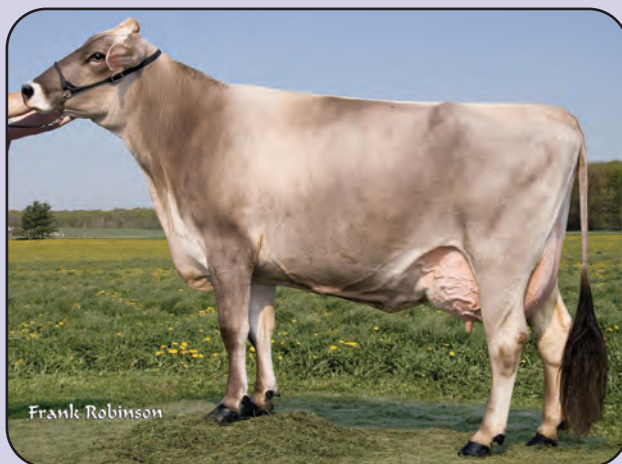
Round Hill Pre Wishful ET '2E91/E90ms' 4/03 365d 2X 25840 4.7 1214 3.3 854 DHIR All American Winter Hfr Calf 2003 MGD of Lot 21