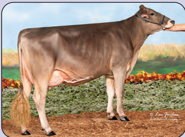
Jenlar Rasta Welcome ETV 'V89/V89ms' Nom All American Yearling in Milk 2023 Maternal Sister to Lots 4, 5E, & 6