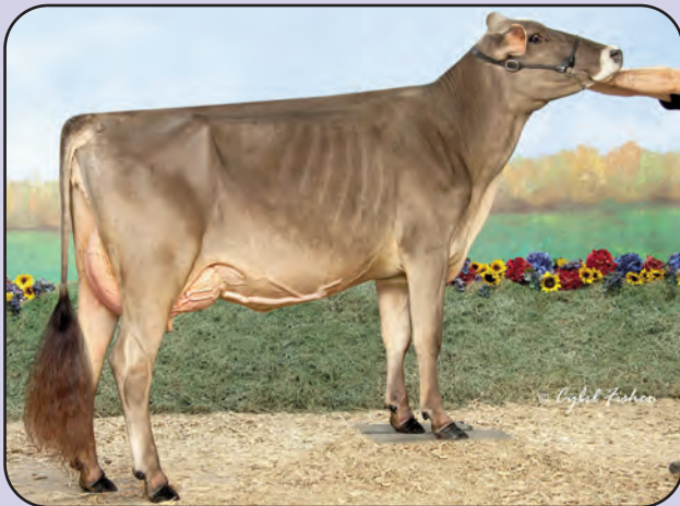
Kuhlkwows Braiden Snowdrop 'V87/V86ms' 1st Futurity Winner Eastern National 2017 MGD of Lot 52 Ch

KILRAVOCK MIDNIGHT SNOW 512559 "5E90" *Superior Brood Cow* 11/04 365d 2x 22050 4.2 931 DHIR ALL AMERICAN PRODUCE OF DAM MEMBER '71, '72, '73