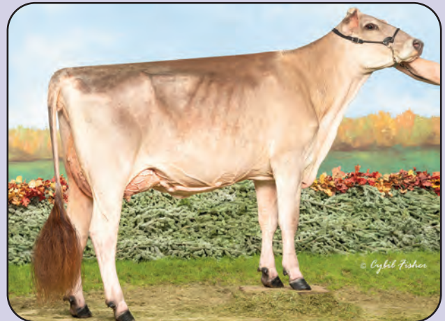
Edge View C Deanna ETV 'V89/E90ms' Hon Men All American Sr 2 Yr Old 2023 Maternal Sister to Lots 7E, 8E, & Donor Dam of Lot 9E