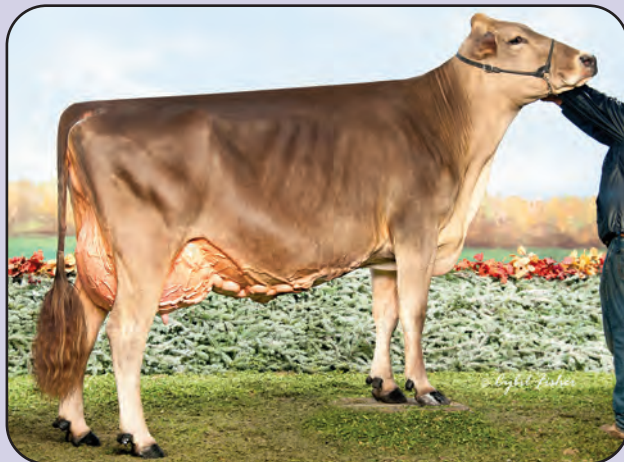
Top Acres Garbro S Wish ET E93/E93ms' 3/04 365d 3X 37320 4.3 1594 3.4 1254 DHIR All American Jr 2 & 4 Yr Old 2015, 2017 MGD of Lots 4, 5E, & 6