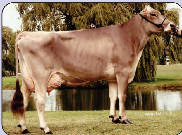
Top Acres Coll Party '2E93 - E92ms' *Certified* 2/00 365d 2x 28950 5.9 1708 3.5 999 DHIR All American Jr 3 Yr Old 2003 & AA Spring Calf 2000 4th Dam of Lot 12