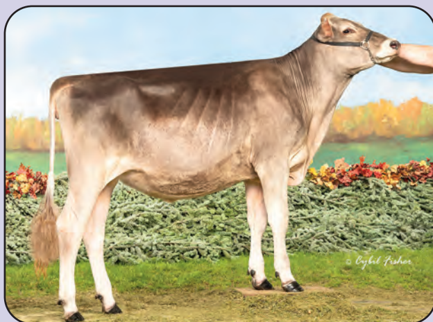
Jenlar Diego Worthwhile ETV Hon Men All American Fall Calf 2023 Full Sister to Lot 4, Maternal Sister to Lots 5E & 6