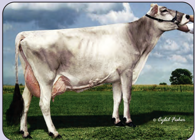
Kuhlkwows Col Snowflake Twin 'E90/E90ms' 3rd Dam of Lot 52Ch