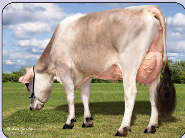
Hilltop Acres S Nutella 'E90/E91ms' 2/08 365d 3X 39060 4.9 1902 4.0 1575 DHIR MGD of Lot 33E