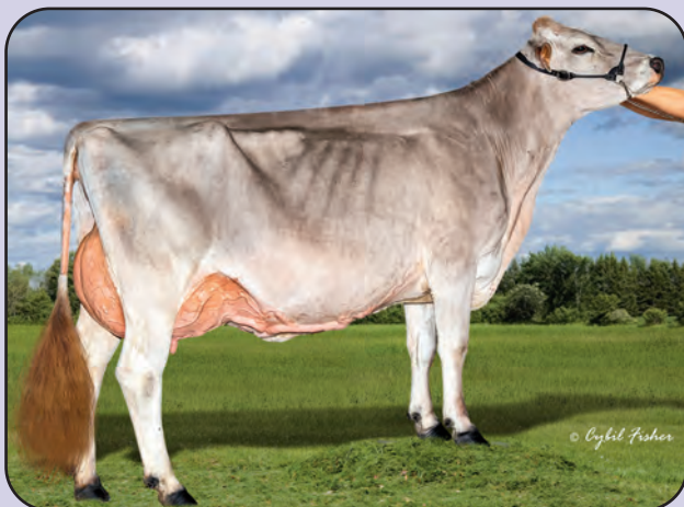
Eachibon Dolly FF Dixie '2E91/E91ms' 4/09 305d 2X 19490 4.2 818 3.3 642 DHIA Donor Dam of Lot 51E