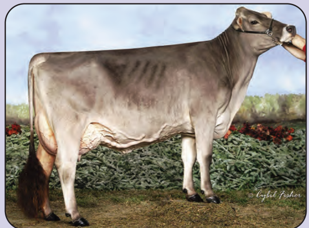
Jo-Dee Denmark Nookie ET '2E92/E91ms' 3/05 341d 2x 26340 4.0 1064 3.2 840 DHIR Hon Men All American Jr 3 Yr Old 2012 *Superior Brood Cow* - MGD of Lot 31E