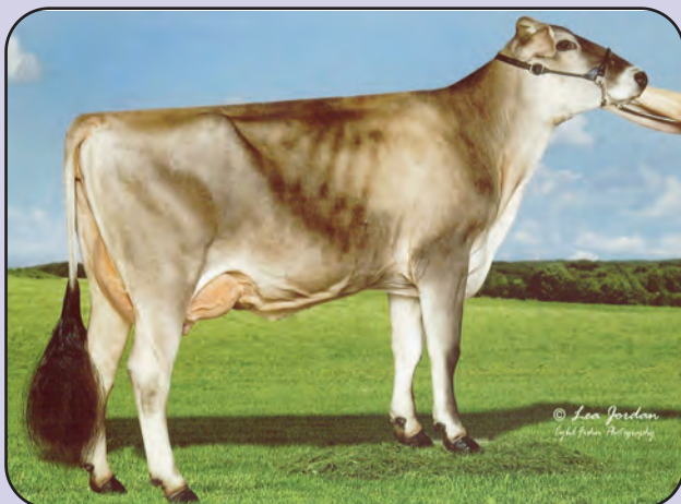
On-A-Whim Cadence Pauline ET '3E92/E92ms' 3/06 365d 2X 28500 4.6 1310 3.5 995 DHIR Dam of Lot 11