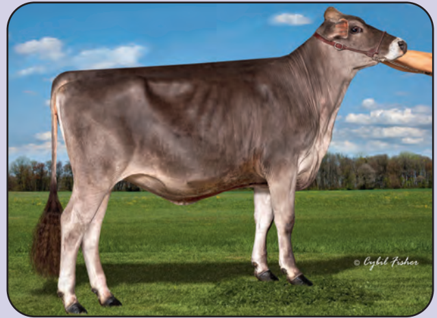
Top Acres Cadence Winona ETV Selling - Lot 17 Maternal Sister to Dam of Lots 18 & 19