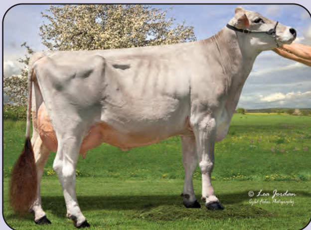
Brown Heaven N Falbala '2E92/E92ms' 4/07 365d 2X 21484 4.7 1005 3.3 716 DHIR Dam of Lot 16