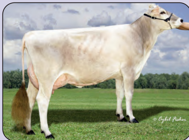
Hilltop Acres Gln Dignity ET 'E90/V88ms' 4/02 305d 3X 30960 4.6 1435 3.6 1121 DHIR 1st Jr 2 Yr Old IA State Fair 2012 - MGD of Lot 47