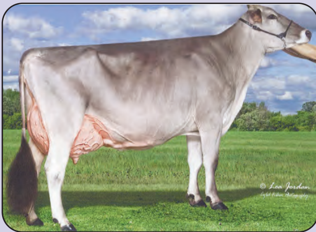
Jenlar Seaman Tinsel '2E93/E92ms' 3/04 365d 3x 31350 3.9 1236 3.3 1043 DHIR Hon Men All American Jr Best 3 Member 2017 Nom AA Winter Yrlg 2018 - Dam of Lot 45