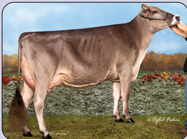
Cutting Edge Elite Fayann 'E90/E90ms' 3/02 301d 2X 21030 4.0 831 3.2 679 DHIR All American Jr 3 Yr Old 2014 3rd Dam of Lot 14