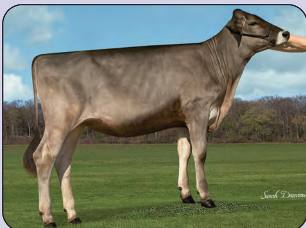
HF Biniam Ditto 6053