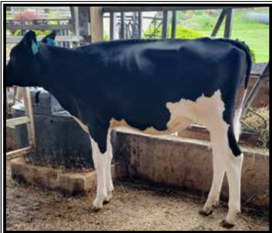
Ms Darkhorse Unix Romex-ET (She sells as Lot 110)

JL Hollybrooks Doorman Road 4-09 EX-94 EEEEE 3146780650 1-11 322 26270 3.3 857 3.4 883 3-00 328 31420 3.3 1023 3.2 1010 4-01 365 38700 3.4 1308 3.2 1241 Sire: Val-Bisson Doorman-ET (Pictured above) *1st Sr 3yr-old & Reserve Grand Champion PA Spring Show 2022