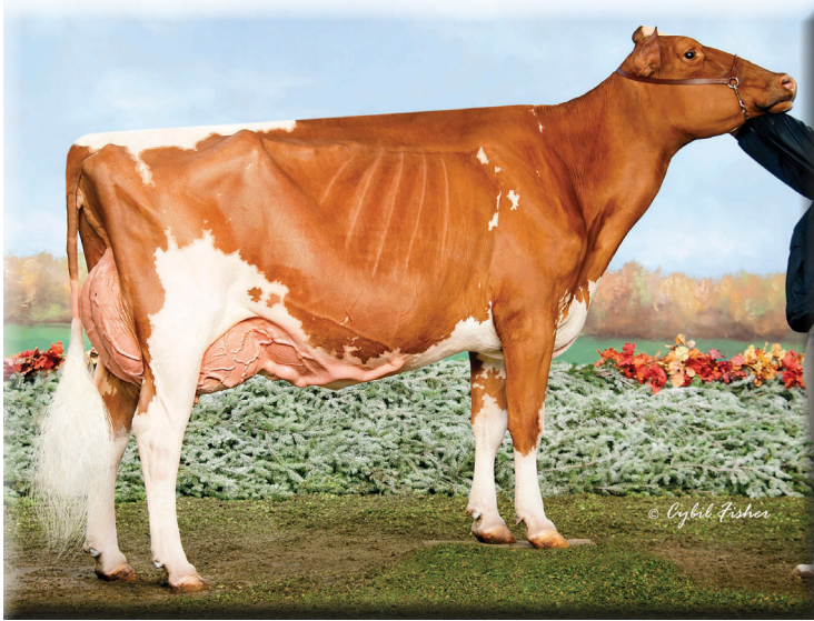
Ms Barb Act Beauty-Red-ET EX-94 Maternal Sister to Lot 13