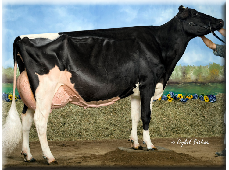
Rainyridge Talent Barbara-RC EX-95 EEEEE Full Sister to Dam of Lot 13 & Same Family as Lot 14