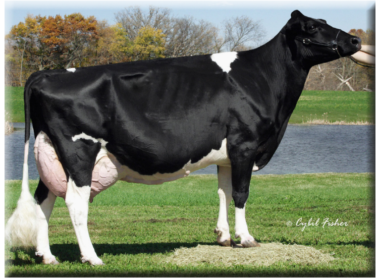
Ernest-Anthony Tyra-ET EX-94 EEEEE GMD DOM 3rd Dam of Lots 9 & 10