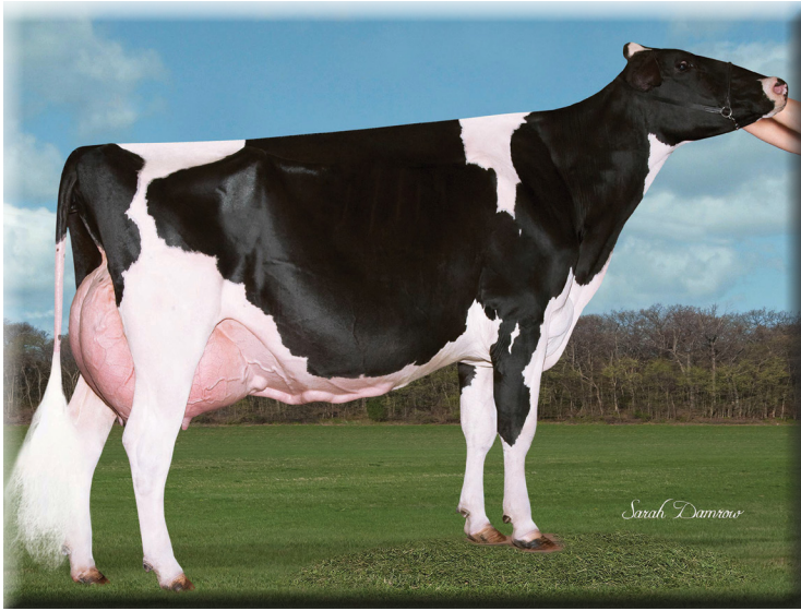
Carters-Corner Atwood Priss EX-94-2E 3rd Dam of Lot 17