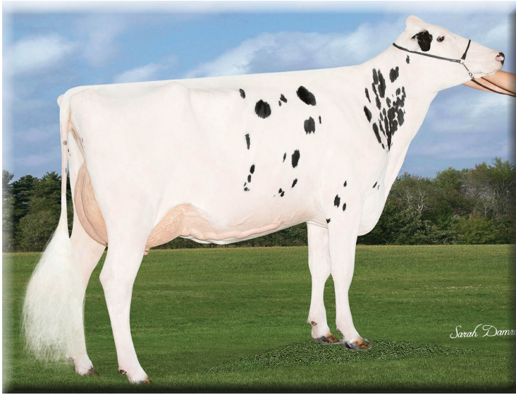
Oakfield Arch Dorrie VG-87-2Y Dam of Lot 2