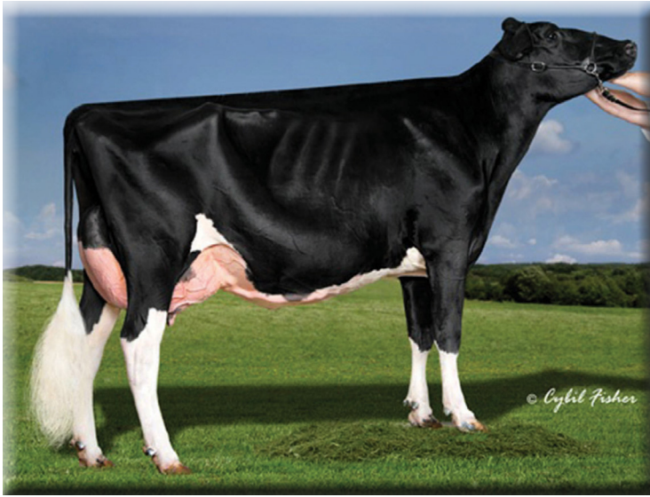
Garay Alexander Destiny-ET EX-94 Dam of Lot 12