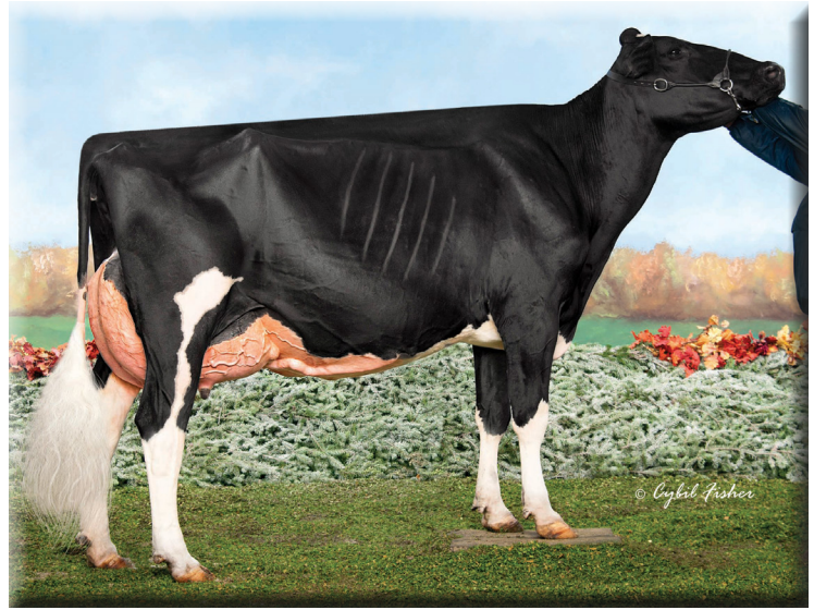
Oakfield GC Darby-ET VG-87 Maternal Sister to Dam of Lot 2