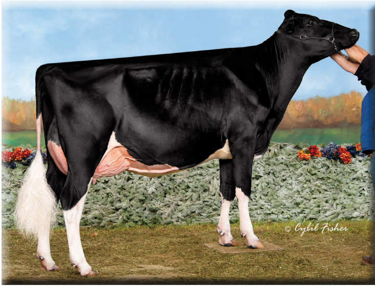
Arethusa Sid Tess EX-92 EX-MS Dam of Lots 9 & 10