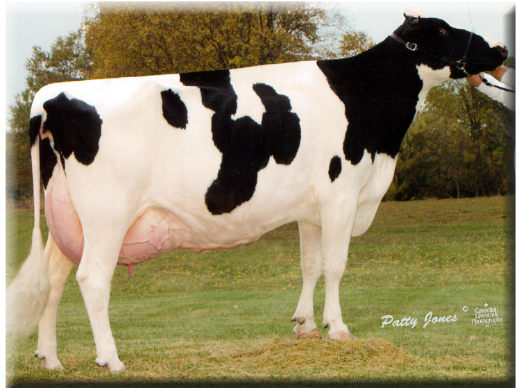
Tri-Day Ashlyn EX-96-2E EX-MS GMD DOM 4th Dam of Lot 16