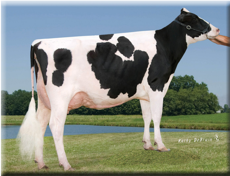
Butz-Hill Atwood Amy-ET EX-91 EX-MS 2nd Dam of Lot 16