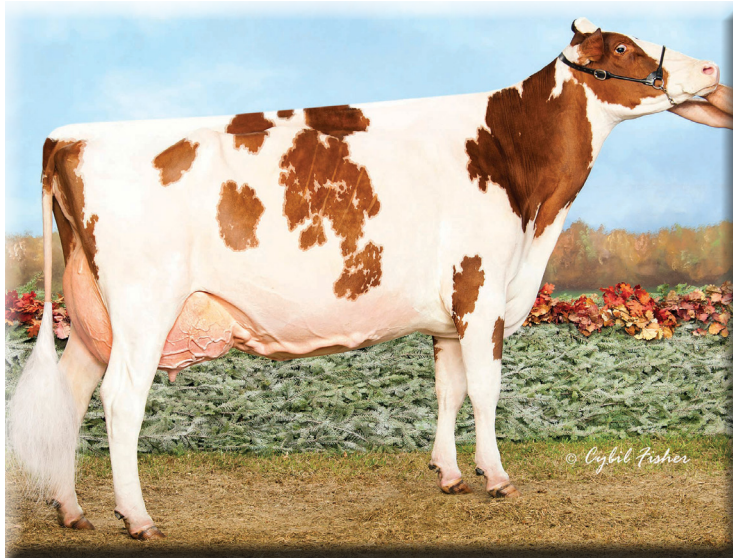
L-Maples Hvezda Calli-Red EX-94-2E EEEEE 2nd Dam of Lot 11