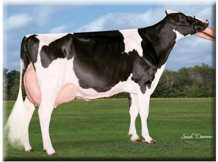
Carters-Corner Fever Pen-ET EX-94 Maternal Sister to 3rd Dam of Lot 17