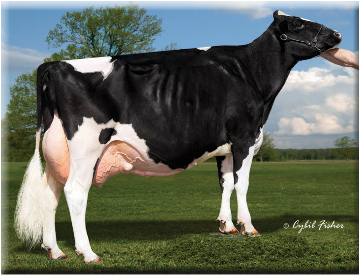
Ziems-LKH Damion Muddy-ET EX-92-2E EX-MS Dam of Lot 7