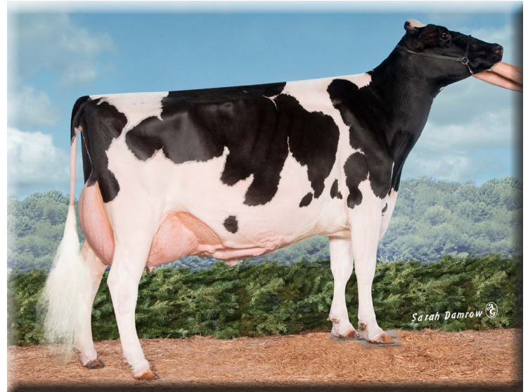
Holbric Genuine Antoinette EX-94-3E EX-MS 2nd Dam of Lot 4