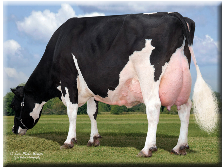
Ziems-LKH Outside Mis Mud-ET EX-94-3E EX-MS 2nd Dam of Lot 7