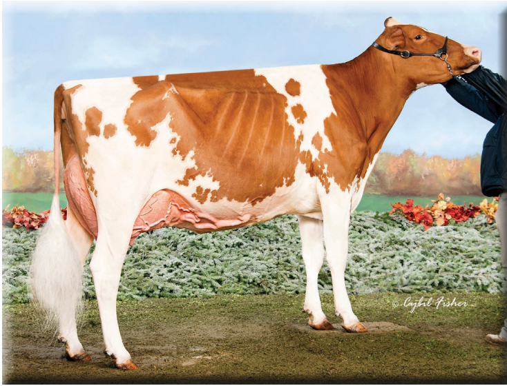
Holbric Spa Chisel-Red EX-91 EX-MS Dam of Lot 3