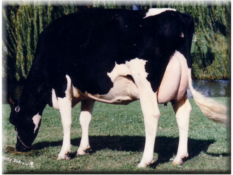
Snow-N Denises Dellia EX-95-2E GMD DOM 5th Dam of Lot 12