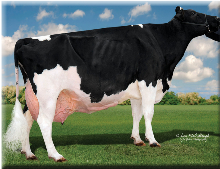
Rolling-Lawns Allen Bell-ET EX-91-3E EX-MS 3rd Dam of Lot 5