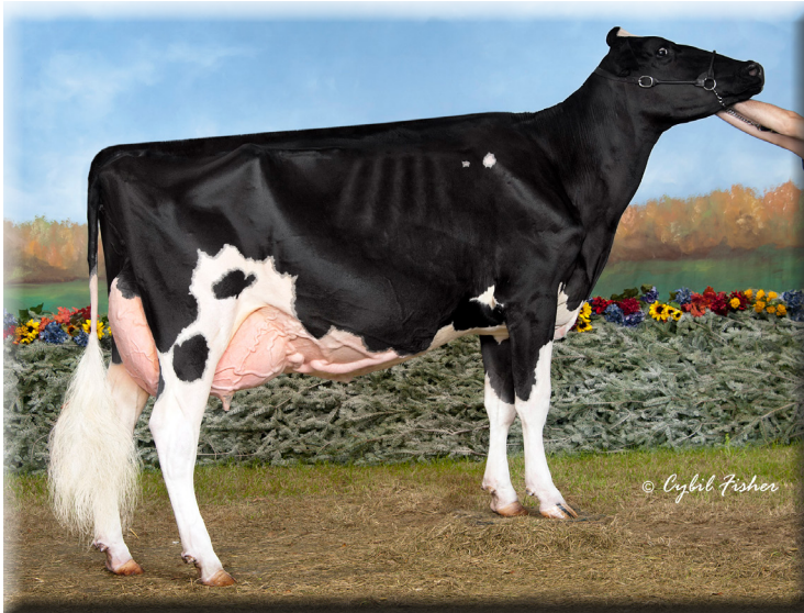
Holbric Destry Analiese-RC EX-94-3E EX-MS Dam of Lot 4