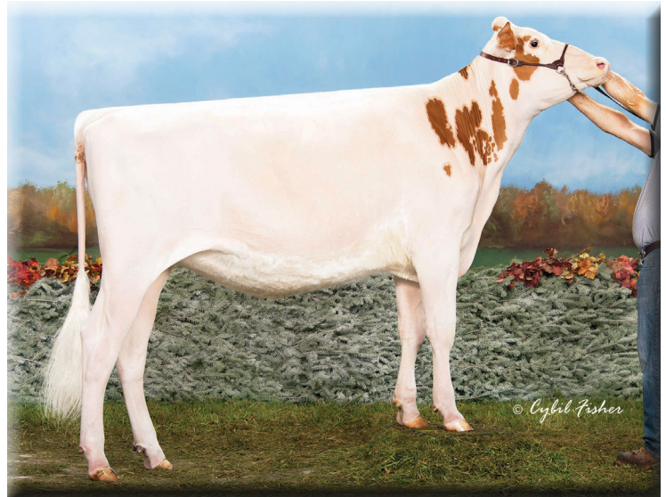
Schluter Sydney Lee-Red-ET VG-86-2Y Maternal Sister to Dam of Lot 6