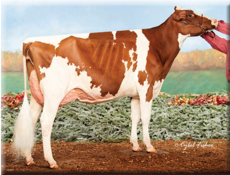
Schluter Shelby Lee-Red-ET EX-92 Maternal Sister to Dam of Lot 6