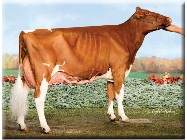
Holbric Action Chill-Red EX-91 EX-MS Dam of Lot 3