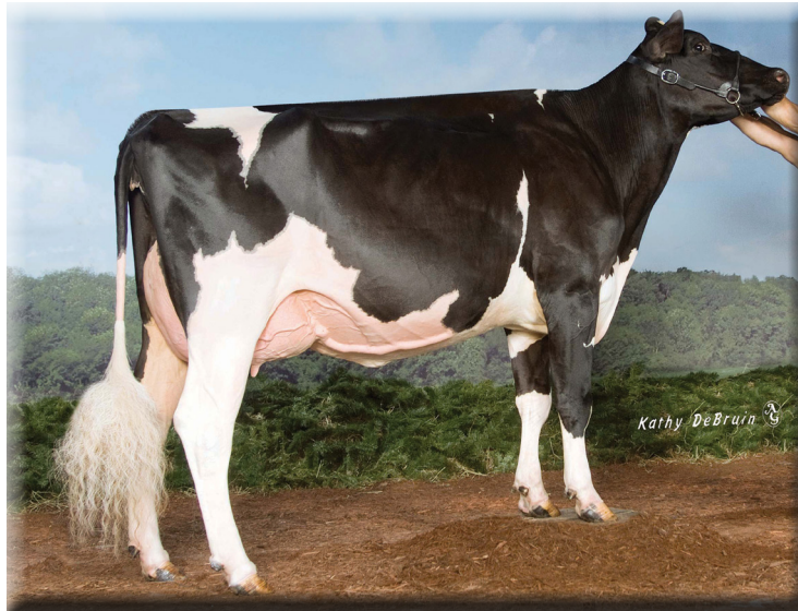
Ms Dundee Petra EX-94-2E EX-MS Dam of Lot 18