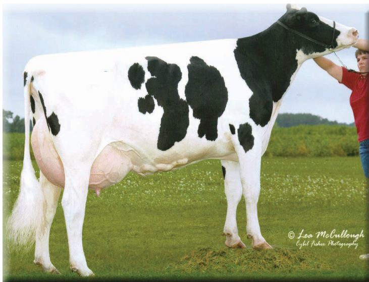
R-Vision Dundee Princess EX-91-2E GMD 2nd Dam of Lot 8