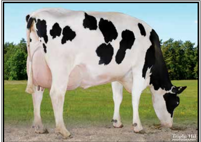
Pine-Tree Era Achie 7593-ET GP-82