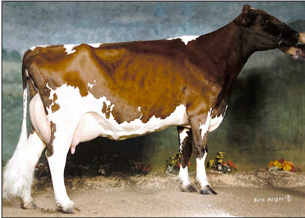
EMERALD-FARMS BRENDENS CHEETAH, VG-89 PATERNAL GREAT-GRANDDAM OF LOT 70