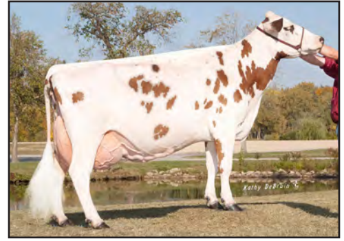
TMB SPECIAL K HELOISE, EX-93 3E THIRD DAM OF LOTS 28 & 29 FOURTH DAM OF LOTS 27 & 30