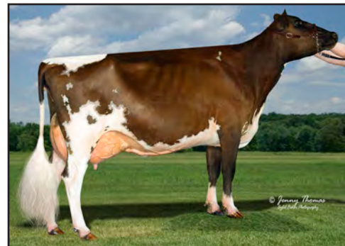
EMERALD-FARMS POKERS SWEETHING EX-94 4E DAM OF LOTS 1 & 2, GRANDDAM OF LOT 3