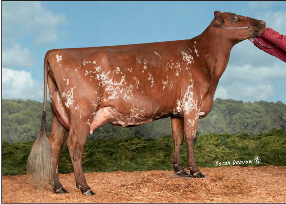
EMERALD-FARMS BURDETTE NITA, EX-91 2E DAM OF LOTS 4 & 5 GRANDDAM OF LOTS 6 & 8 GREAT-GRANDDAM OF LOTS 7 & 9