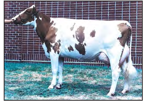
EMERALD-FARMS GALLAGHER CLOVER, VG-86 FAMILY MEMBER OF LOT 77