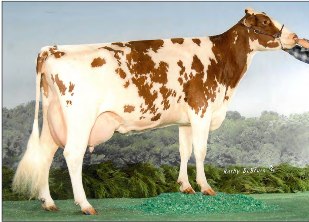
EMERALD-FARMS STAR NITA, VG-87 FAMILY MEMBER OF LOTS 4-9