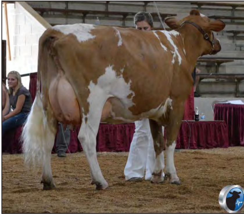
SHIREDALE C R BETHANY, EX-92 3E GRANDDAM OF LOT 71