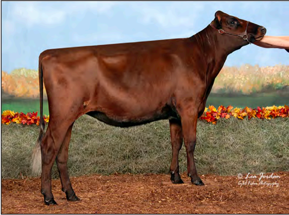
EMERALD-FARMS SWEETD NITA RIDE SELLING AS LOT 4