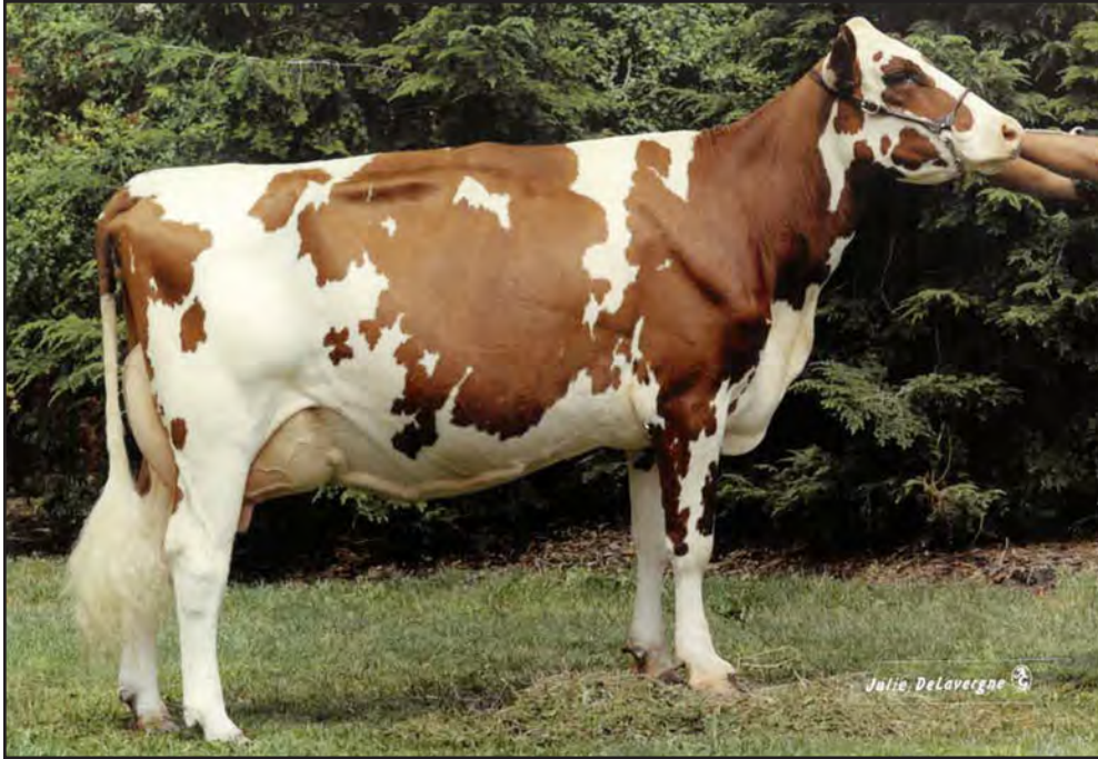
EMERALD-FARMS TRUMP'S VACHI, EX-92 2X NOM ALL-AMERICAN • OHIO STATE FAIR GRAND CHAMPION FAMILY MEMBER OF LOT 55