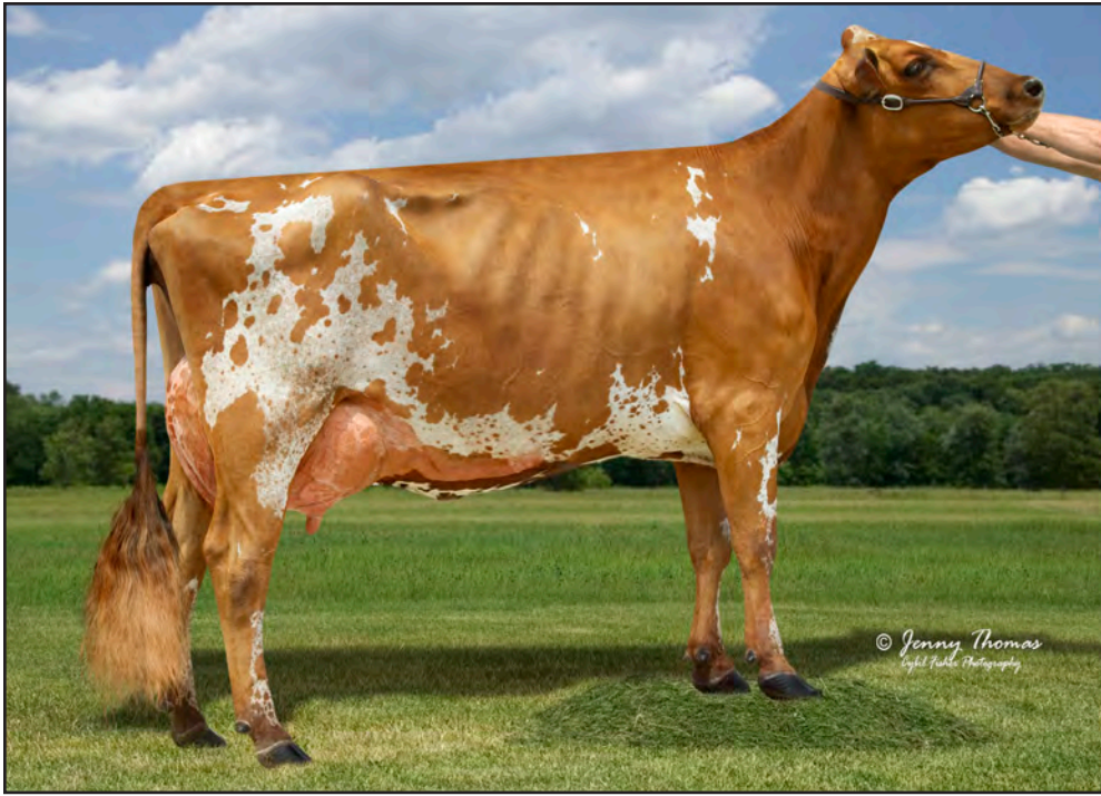
EMERALD-FARMS BURDETTE MARYANN, EX-92 3E DAM OF LOTS 23 & 24