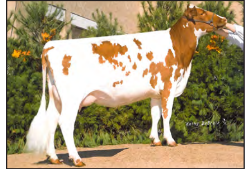
EMERALD-FARMS TRUMP'S ZOE GREAT-GRANDDAM OF LOT 80