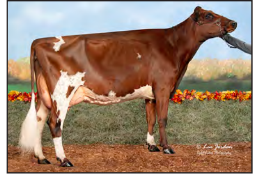
EMERALD-FARMS SWEET DELIGHT-ET, EX-90 FULL SISTER OF LOT 82