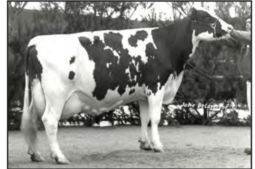
EMERALD-FARMS CLASSY LORI, EX-92 PATERNAL GRANDDAM OF LOT 17