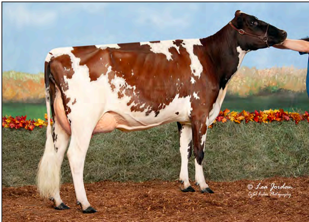
EMERALD-FARMS SWEET REINE-ET SELLING AS LOT 1