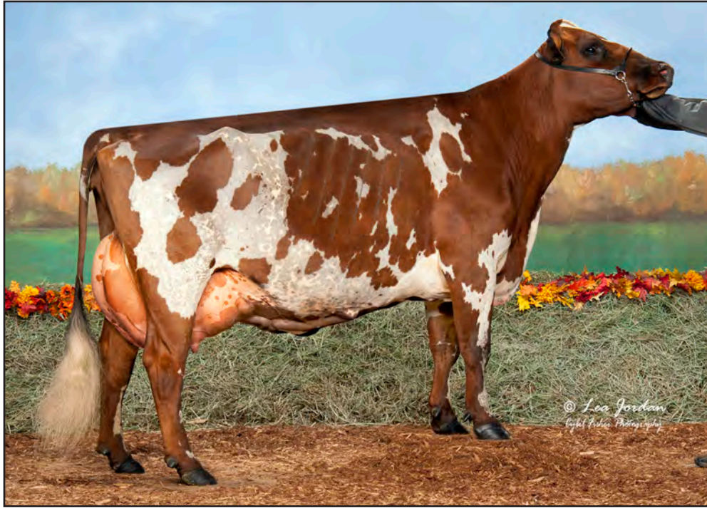
HI-AYR-VIEW BURDETTE ANDIE-ET, EX-94 5-11 305D 22,730M 3.3% 742F 3.3% 750P NOM ALL-AMERICAN AGED COW, 2017 FAMILY MEMBER OF LOT 40