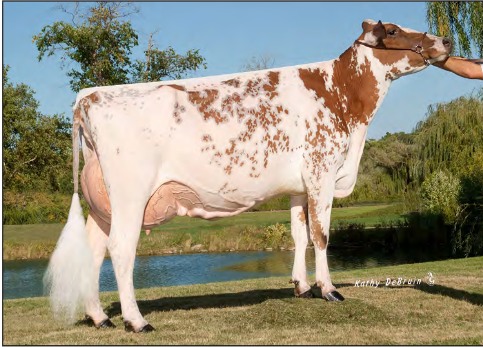
KLER-VU RAMIUS CHRISTMAS, EX-93 4E OVER 120,000M LIFETIME ALL-AMERICAN SR 3-YEAR-OLD, 2013 FAMILY MEMBER OF LOT 38