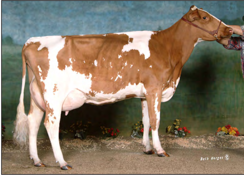
EMERALD-FARMS STAR CLOVER, EX-92 3E 7-03 365D 29,560M 4.2% 1229F 3.2% 934P - OVER 216,000M LIFETIME FAMILY MEMBER OF OF LOTS 17-20