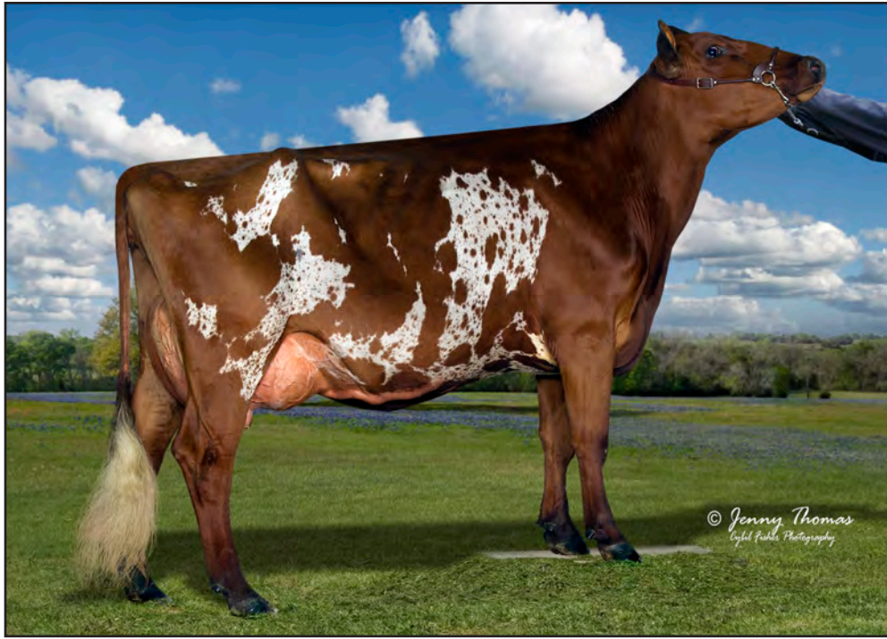
EMERALD-FARMS BURDETTE NUTMEG, EX-90 GRANDDAM OF LOT 34