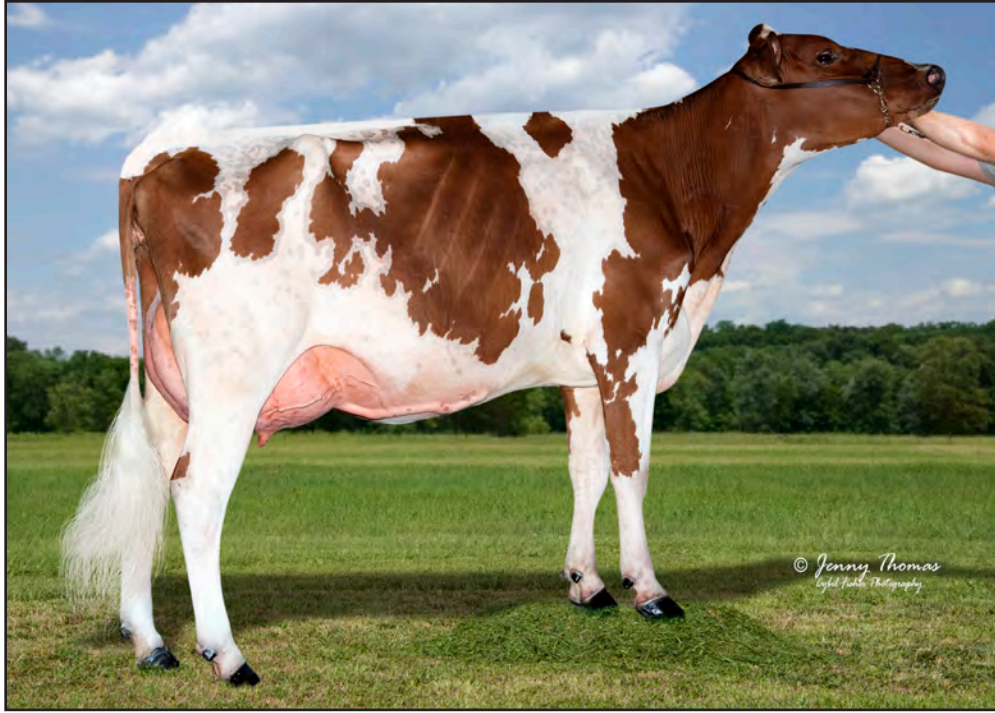
EMERALD-FARMS DREAMER ANABELLE, EX-91 NOM JR ALL-AMERICAN JR 2-YEAR-OLD, 2022 MATERNAL SISTER TO DAM OF LOT 75