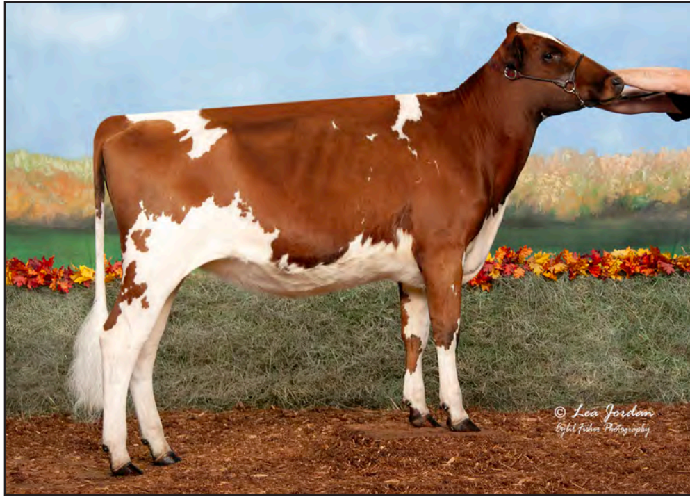
EMERALD-FARMS CHERO JILL SELLING AS LOT 52