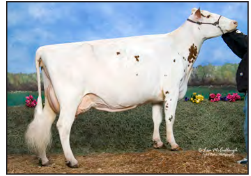
EMERALD-FARMS MISTIQUE ZOE NOM ALL-AMERICAN 5-YEAR-OLD, 2010 FAMILY MEMBER OF LOT 80