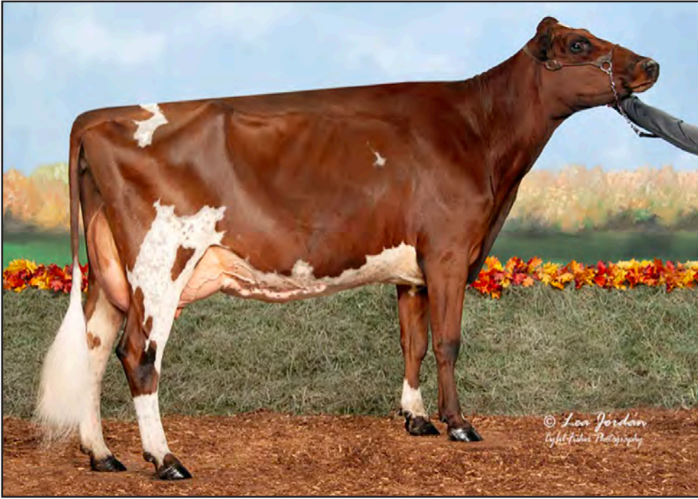
EMERALD-FARMS SWEET DELIGHT-ET, EX-90 DAM OF LOT 3