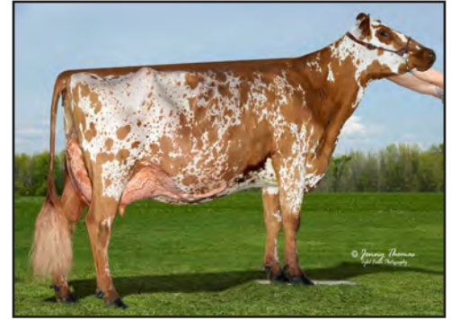
EMERALD-FARMS ROUSH CLOVER, EX-93 3E DAM OF LOT 17 GRANDDAM OF LOT 19 FAMILY MEMBER OF LOTS 18 & 20