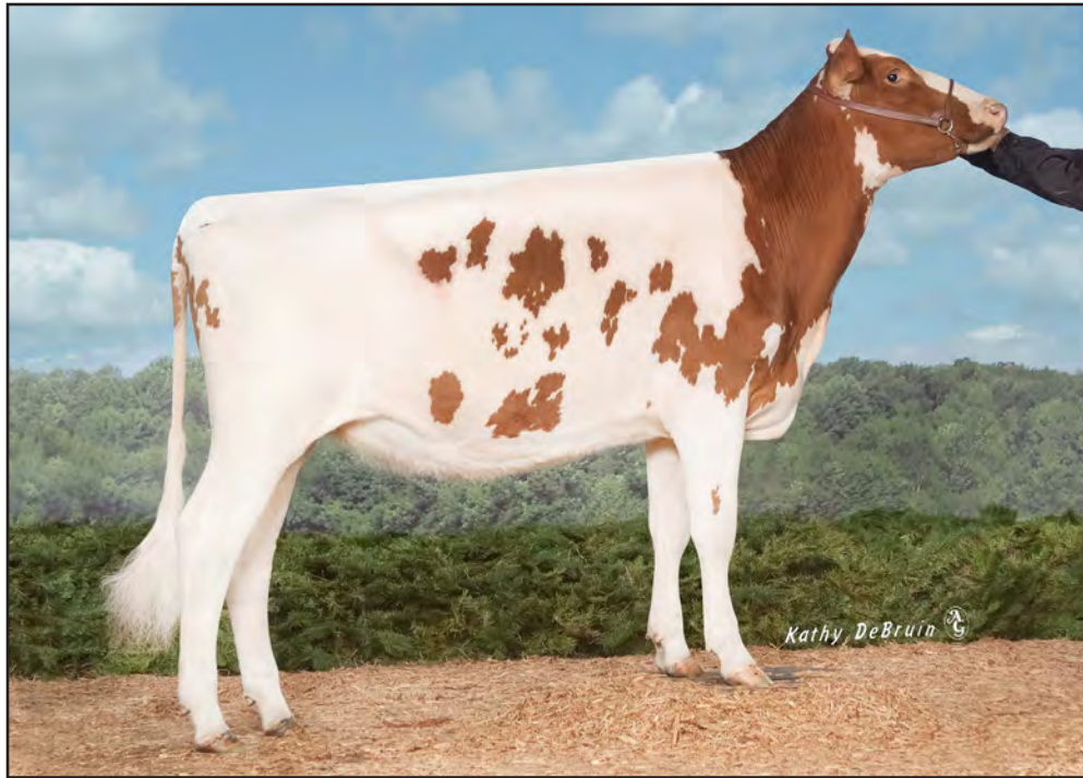
EMERALD-FARMS MOON CLOVER, VG-88 NOM JR ALL-AMERICAN SPRING YEARLING, 2012 FAMILY MEMBER OF OF LOTS 17-20