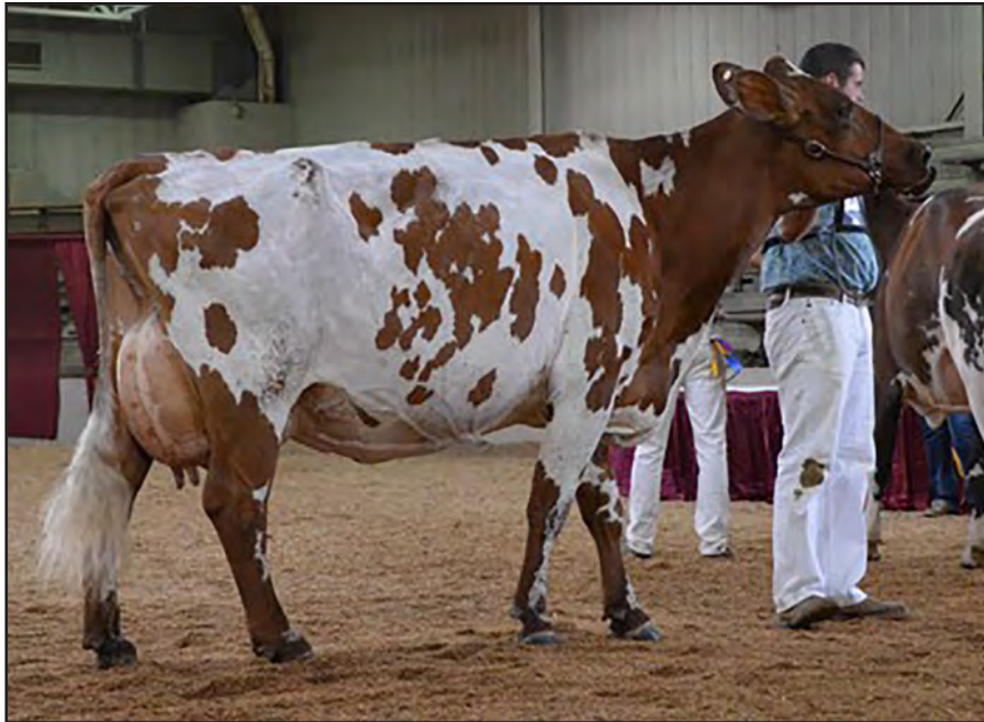
EMERALD-FARMS LOCHINVAR ZOE, EX-92 GRANDDAM OF SERVICE SIRE E