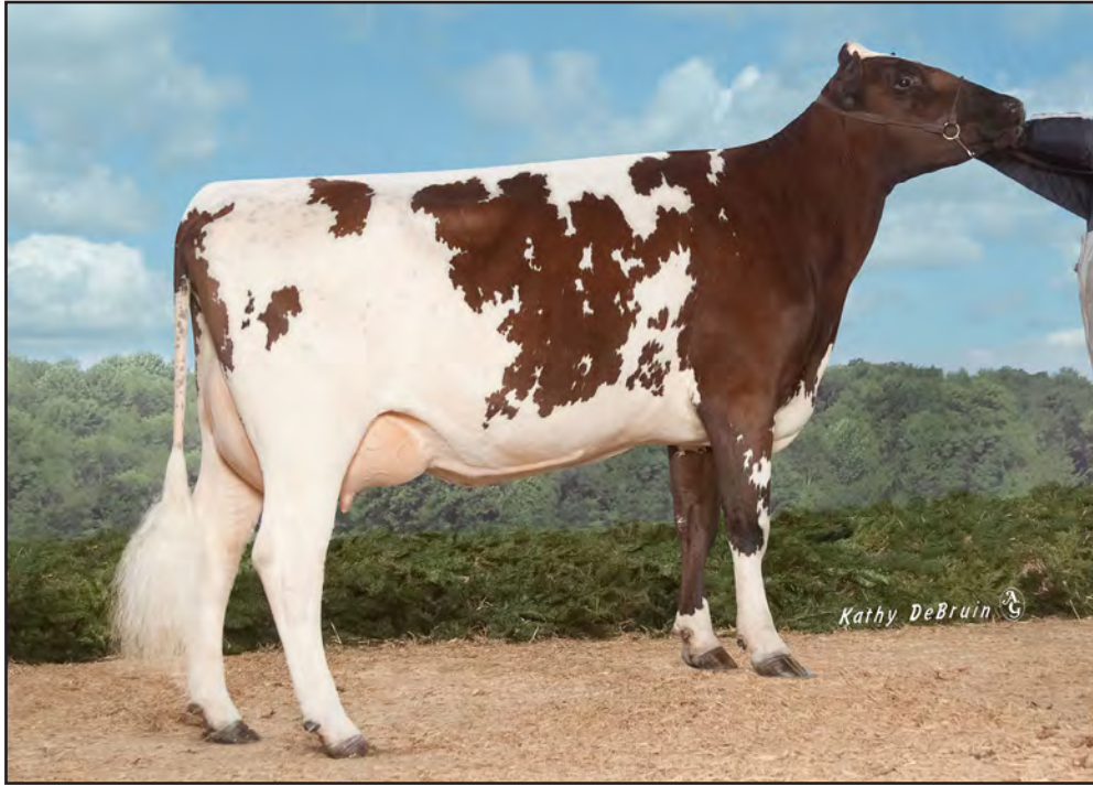
EMERALD-FARMS ZEEK CHEETAH, EX-90 GRANDDAM OF LOTS 10, 11 & 15 THIRD DAM OF LOTS 13, 14 & 16 FOURTH DAM OF LOT 12