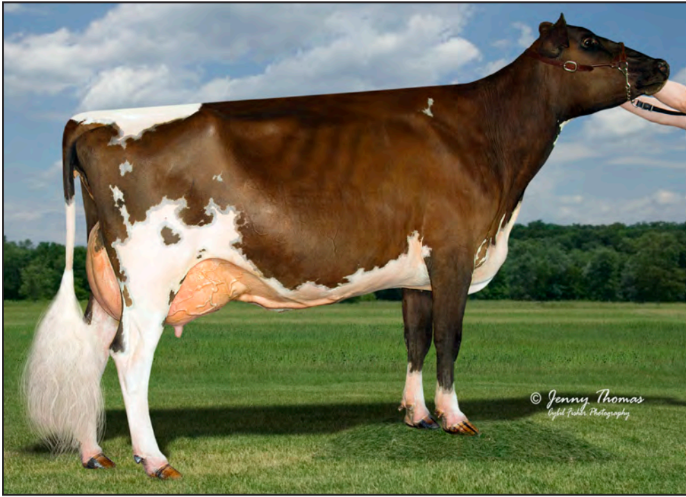
EMERALD-FARMS POKERS SWEETHING, EX-94 4E DAM OF SERVICE SIRE A