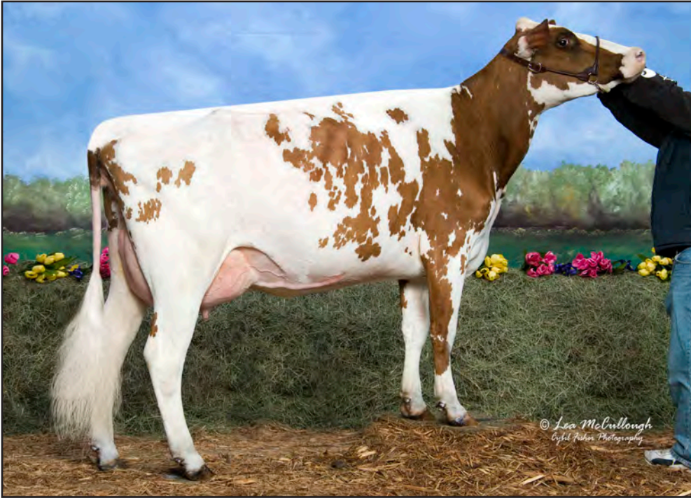
P&A MISTER HELLO, EX-92 3E GRANDDAM OF OF LOTS 28 & 29 GREAT-GRANDDAM OF LOTS 27 & 30