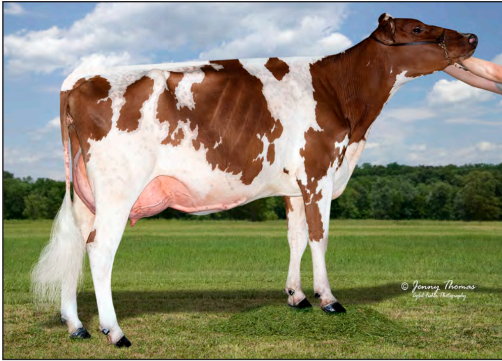
EMERALD-FARMS DREAMER ANABELLE, EX-91 NOM JR ALL-AMERICAN JR 2-YEAR-OLD, 2022 MATERNAL SISTER OF LOT 69