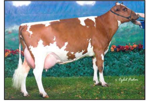
TMB STARDOM HOLLYBERRY, EX-93 6E FOURTH DAM OF OF LOTS 28 & 29 FIFTH DAM OF OF LOTS 27 & 30