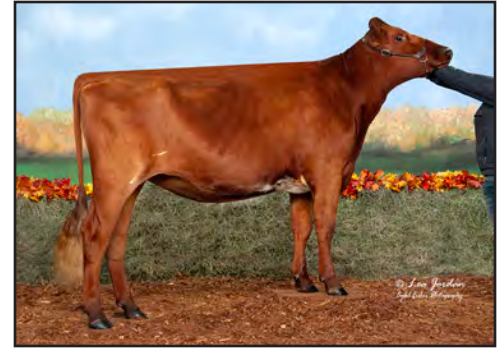
EMERALD-FARMS SWEET MARY ANN SELLING AS LOT 23