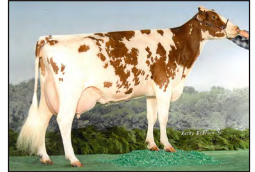
EMERALD-FARMS STAR NITA, VG-87 FAMILY MEMBER OF LOTS 4-9