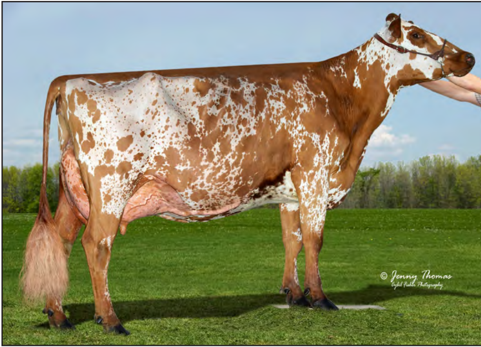
EMERALD-FARMS ROUSH CLOVER, EX-93 3E GRANDDAM OF LOT 77