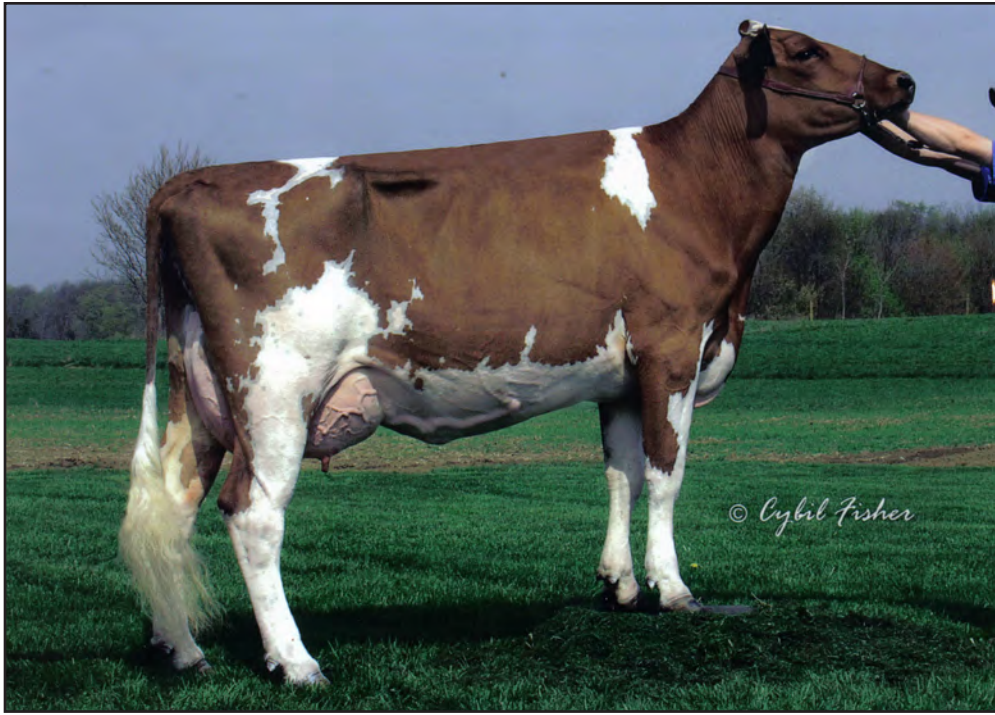
GALNEY-EPC L.H. ROSY-ET, EX-90 DAM OF SERVICE SIRE C