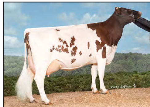
EMERALD-FARMS KELLYBUCK SWEET GRANDDAM OF LOTS 1 & 2 GREAT-GRANDDAM OF LOT 3