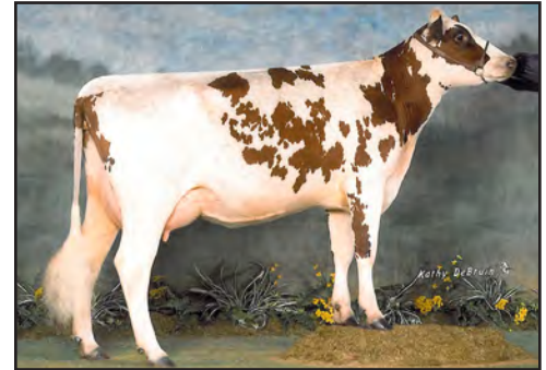
EMERALD-FARMS MISTIQUE LORI, VG-88 OVER 100,000M LIFETIME FAMILY MEMBER OF LOT 67