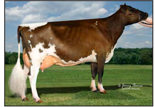
EMERALD-FARMS POKERS SWEETHING, EX-94 4E DAM OF LOTS 1 & 2, GRANDDAM OF LOT 3