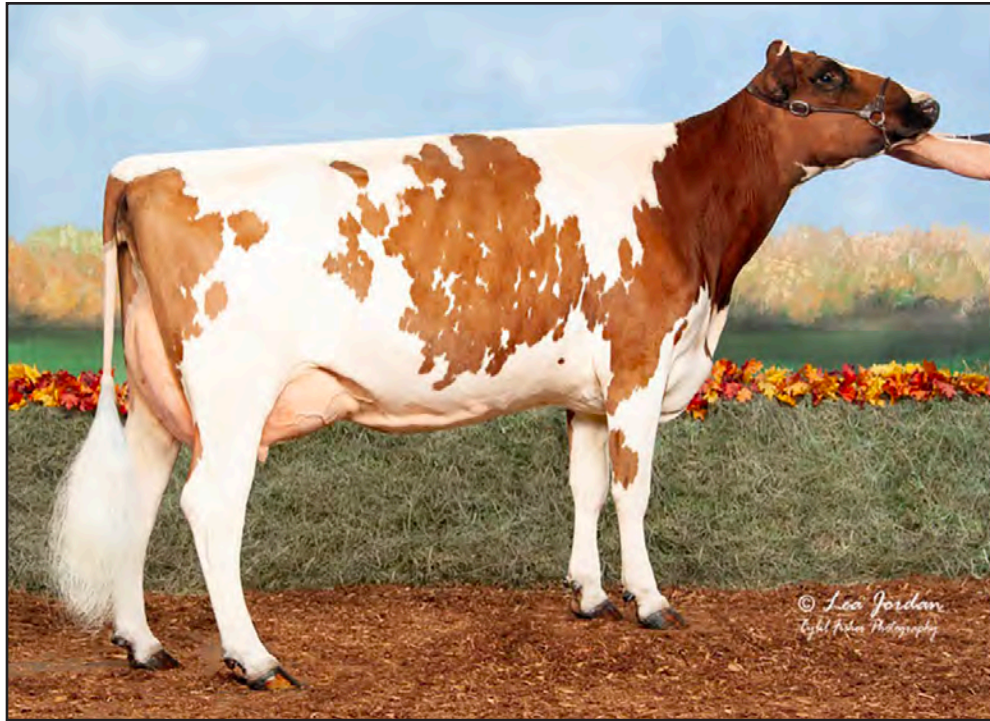
BEN-AYR BURDETTE CHICK, EX-91 SELLING AS LOT 37