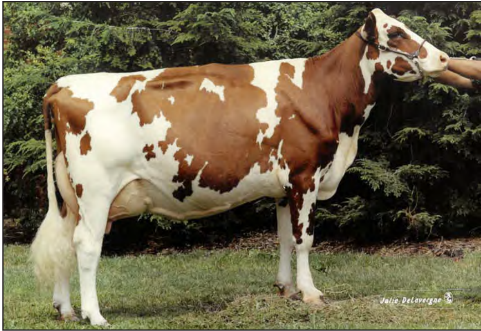
EMERALD-FARMS TRUMP'S VACHI, EX-92 2X NOM ALL-AMERICAN • OHIO STATE FAIR GRAND CHAMPION FOURTH DAM OF LOT 49