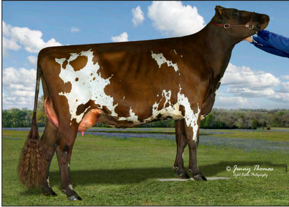
PLUM-BOTTOM BURDETTE COCO, EX-92 2E GREAT-GRANDDAM OF LOT 61