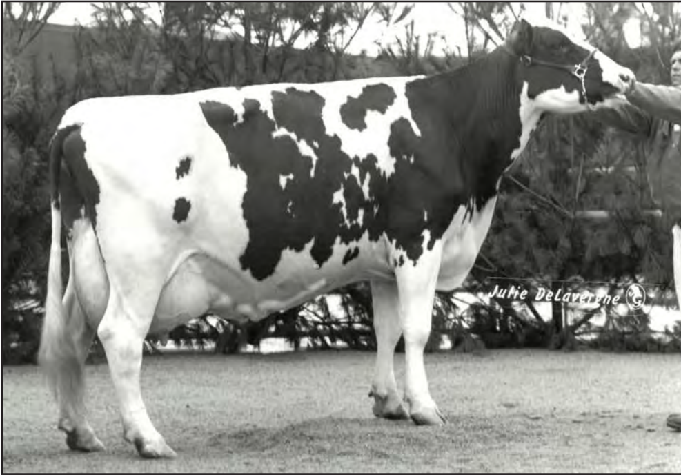
EMERALD-FARMS CLASSY LORI, EX-92 FAMILY MEMBER OF LOT 67