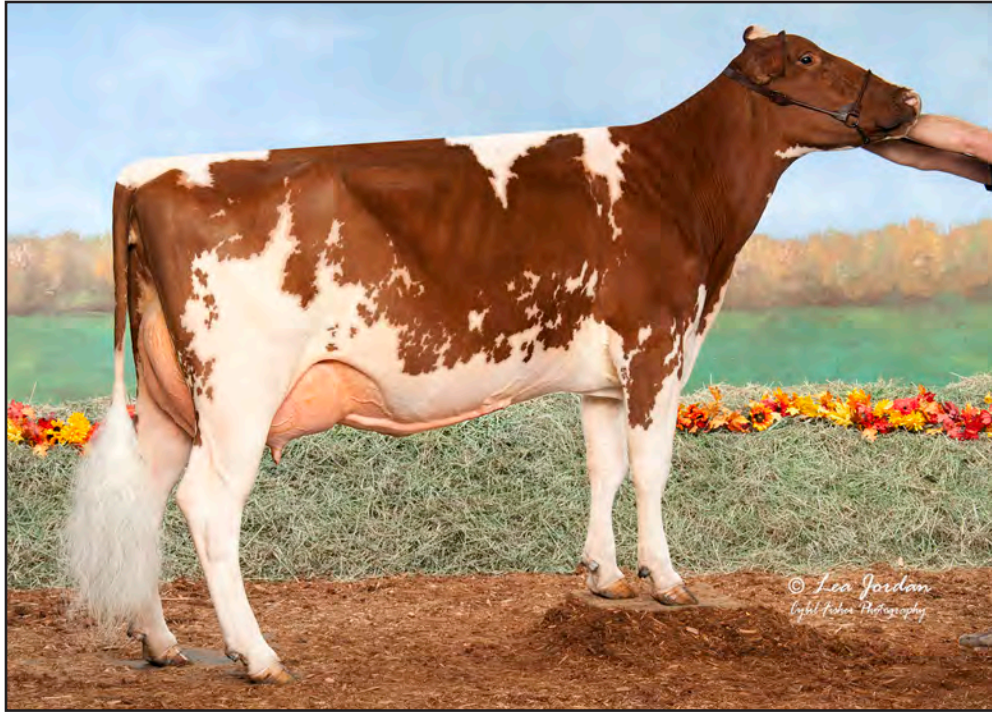
TWIN-VIEW M BRITE MAKEIT MERRY, VG-88 FAMILY MEMBER OF OF LOTS 21-26