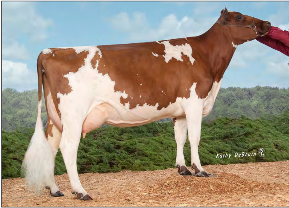
EMERALD-FARMS RAMIUS JAYME, EX-91 3E NOM JR ALL-AMERICAN SR 2-YEAR-OLD, 2011 - OVER 144,000M LIFETIME GREAT-GRANDDAM OF LOT 68