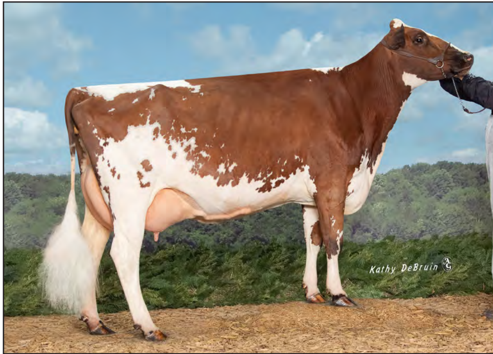
TWIN-VIEW ADRIAN VERY MERRY, EX-92 2E 2X HM JR ALL-AMERICAN DAM OF LOT 25 GRANDDAM OF OF LOTS 21, 23, 24 & 26 THIRD DAM OF LOT 22