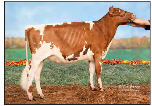
EMERALD-FARMS CHEROKEE BABY NOM ALL-AMERICAN SPRING YEARLING, 2020 MATERNAL SISTER OF SERVICE SIRE A