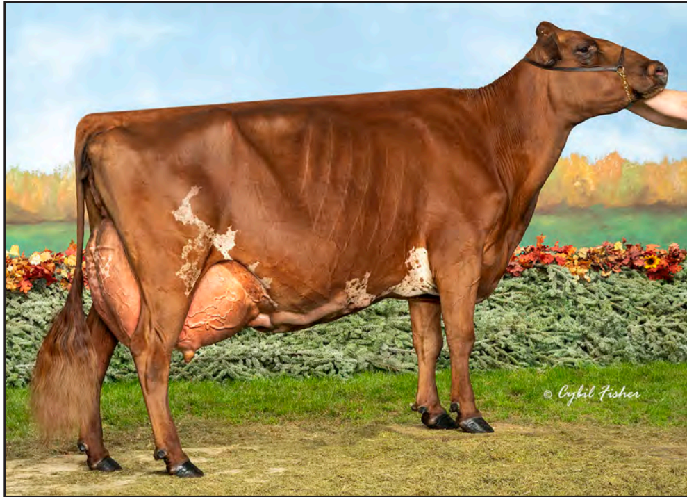
TOPPGLEN WISHFUL THINKING-ET, EX-95 DAM OF SERVICE SIRE D