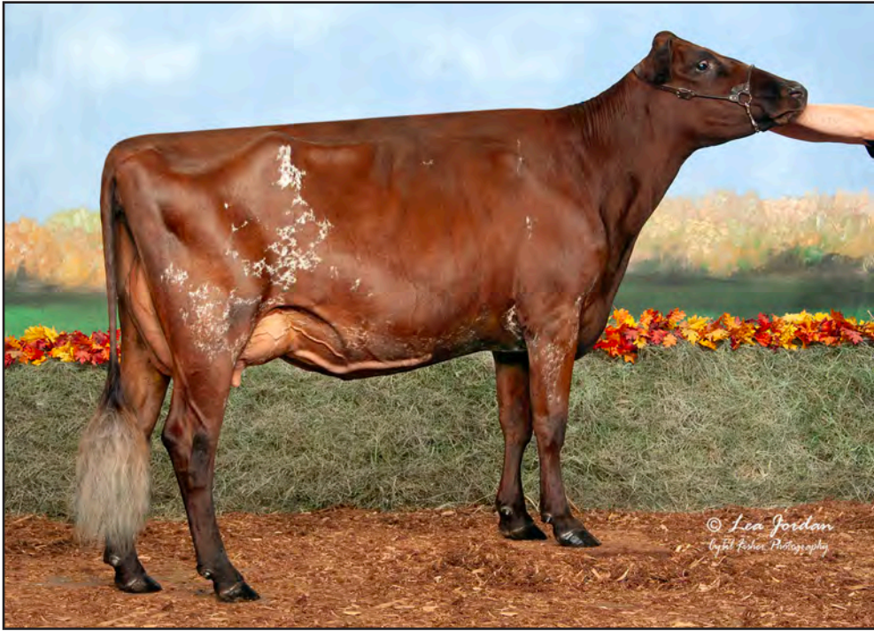
EMERALD-FARMS REAGAN NITA SELLING AS LOT 5