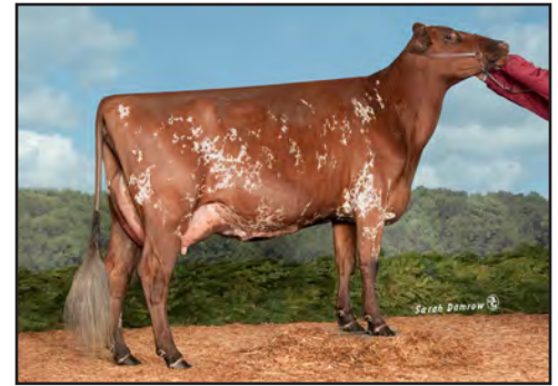
EMERALD-FARMS BURDETTE NITA, EX-91 2E DAM OF LOTS 4 & 5 GRANDDAM OF LOTS 6 & 8 GREAT-GRANDDAM OF LOTS 7 & 9