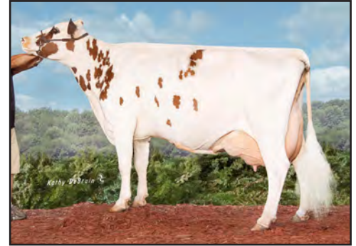
EMERALD-FARMS ESPECIALLY SWEET, VG-87 THIRD DAM OF SERVICE SIRE A