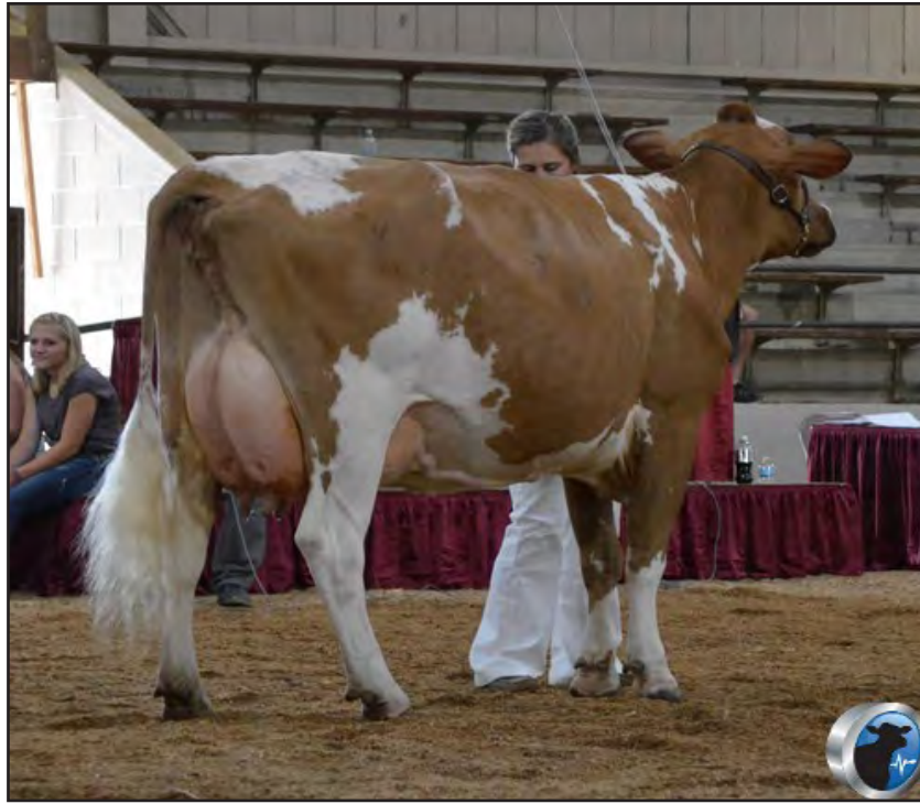
SHIREDALE C R BETHANY, EX-92 3E GRANDDAM OF LOTS 39 & 42