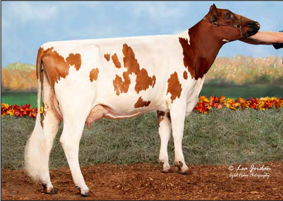
EMERALD-FARMS CHEROKEE CLOVER DAM OF LOT 20