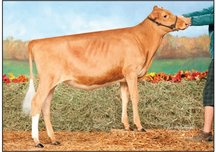
GR-HICKMAN VALLEYS MARTIN GYPSY RES JR CHAMPION, 2016 TN STATE FAIR JR SHOW GRANDDAM OF LOT 34