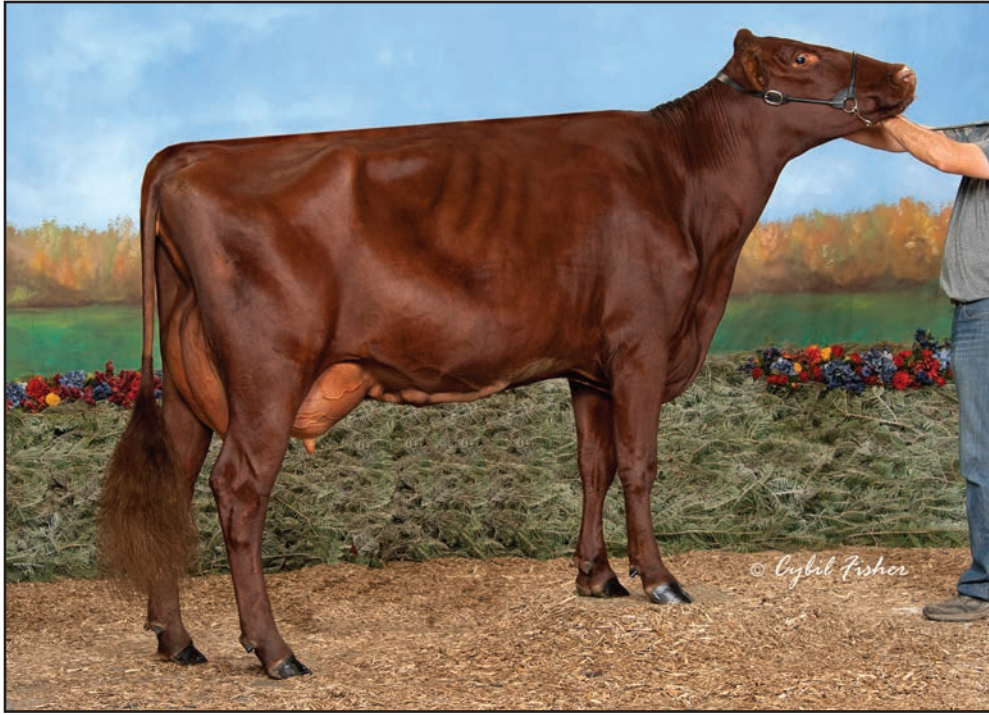
MILLCREEK LOGIC ANGEL, EX-91 4E NOM ALL-AMERICAN SR 2-YEAR-OLD, 2013 3RD DAM OF LOT 44