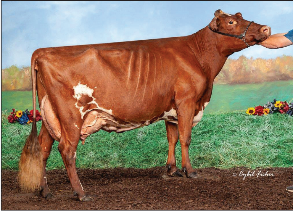
HARD CORE REBEL DAYTONA ET, EX-92 2E NOM ALL-AMERICAN 5-YEAR-OLD, 2021 GRANDDAM OF LOT 41