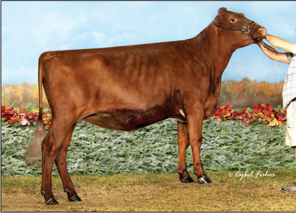
LAZY M LUCK BE A LADY-ET, VG-85 NOM ALL-AMERICAN FALL CALF, 2016 DAM OF LOT 43