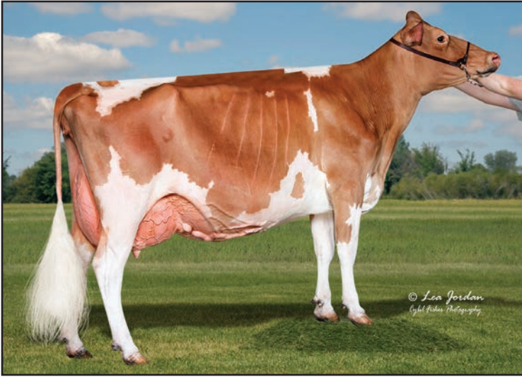
DIX LEE KOJACK DONT DOUBT ME-ETV, EX-92 ALL-AMERICAN SR 2-YEAR-OLD, 2021 FAMILY MEMBER OF LOT 33