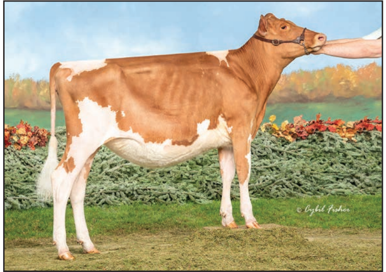
DB VG GP JACK DONT FORGET ME-ETV JR CHAMPION, 2023 WORLD DAIRY EXPO FAMILY MEMBER OF LOT 33