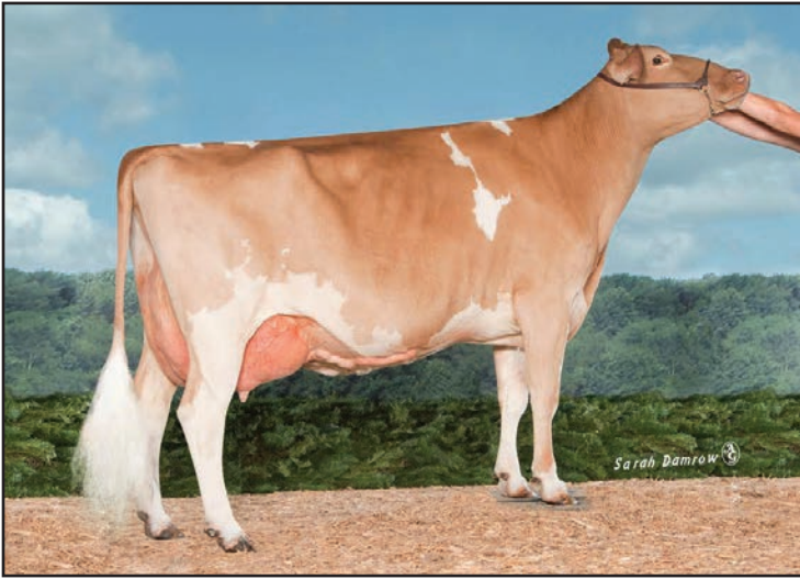
HARTDALE SHOWTIME CONFETTI, EX-91 OVER 115,000M LIFETIME GRANDDAM OF LOT 35