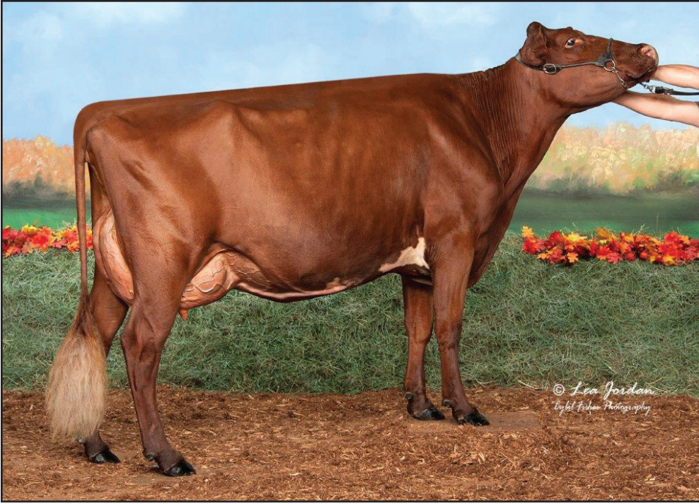
JEWELLS CM WILD BELLE, EX-91 NOM ALL-AMERICAN 4-YEAR-OLD, 2022 GRANDDAM OF LOT 40