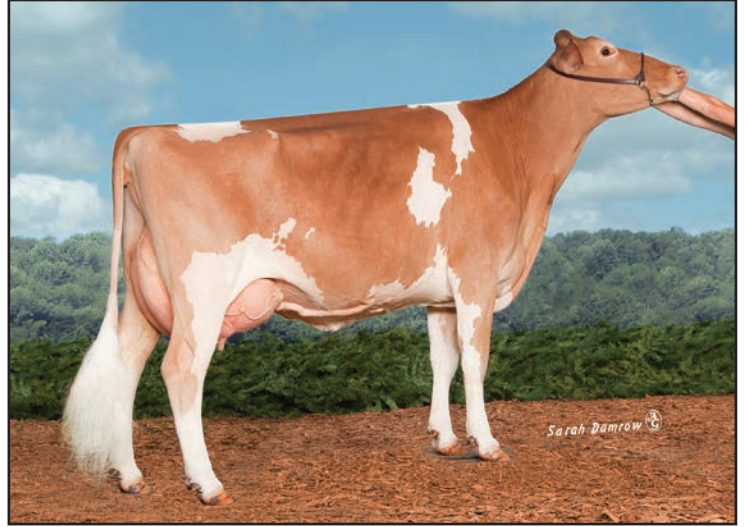
HARTDALE ALSTAR CUTIE, EX-93 2E NOM ALL-AMERICAN JR 3-YEAR-OLD, 2014 MATERNAL SISTER TO DAM OF LOT 35