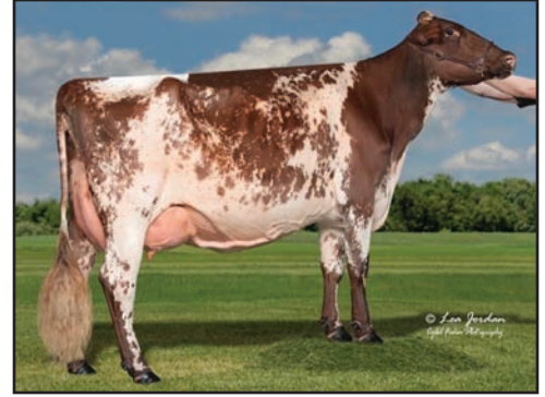
MOR LOG MYZER RUMER, EX-91 GRAND CHAMPION, 2023 OH & IN STATE FAIRS NOM ALL-AMERICAN 4-YEAR-OLD, 2023 RES JR ALL-AMERICAN 4-YEAR-OLD, 2023 DAM OF SERVICE SIRE OF LOT 40