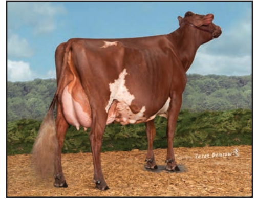
INNISFAIL-WO MEGA LADYLUCK ET, EX-90 ALL-AMERICAN JR 3-YEAR-OLD, 2015 GRANDDAM OF LOT 43