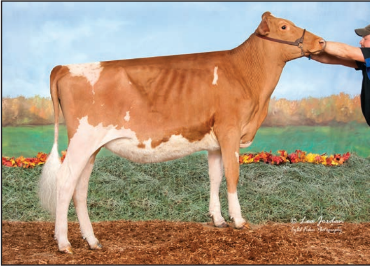
HICKMAN VALLEYS LIGHT GARFIELD HM ALL-AMERICAN FALL CALF, 2020 DAM OF LOT 34