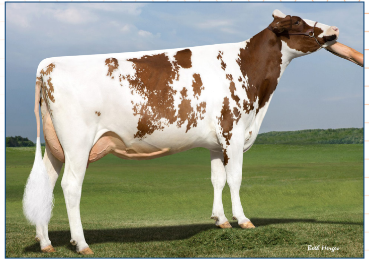
Milksource LD Shania-Red-ET EX-92 2E Dam of Lot 22H