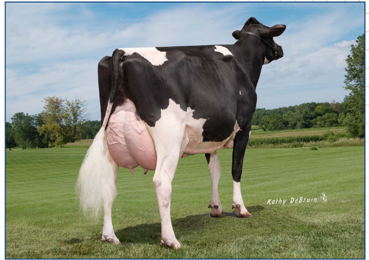
Golden-Oaks Atwood Charla-ET EX-94 Full Sister to Grandam of Lot 24H