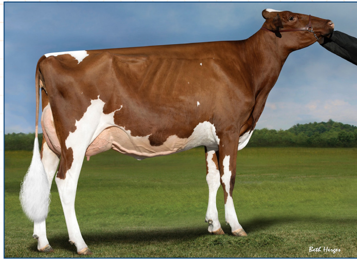
Rosedale Avala Lollipop-Red EX-91 Grandam of Lot 28H