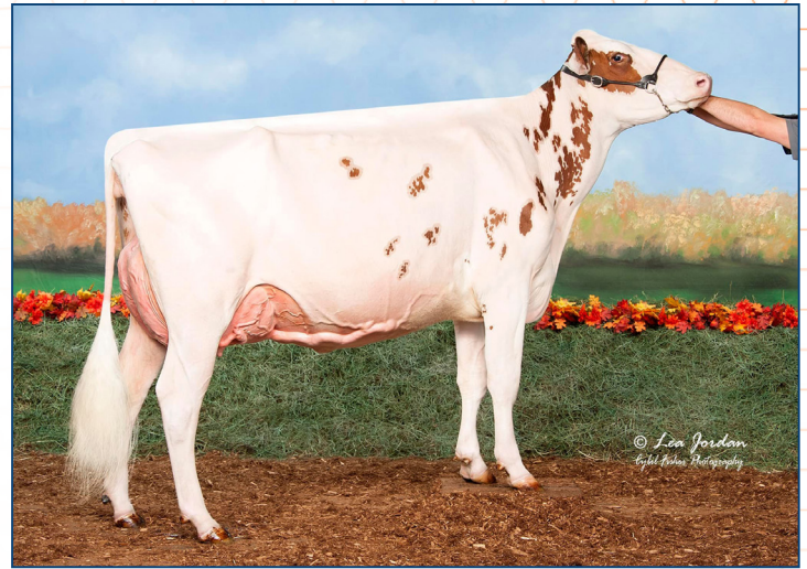
Schluter Twilight-Red-ET VG-88 Maternal Sister to Dam of Lot 38H