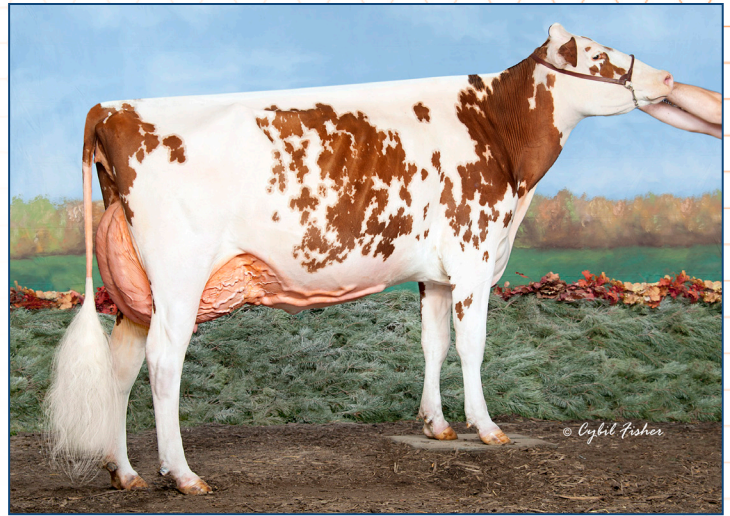
L-Maples Dfnt Casseeey-Red-ET EX-94 2E Grandam of Lot 16H