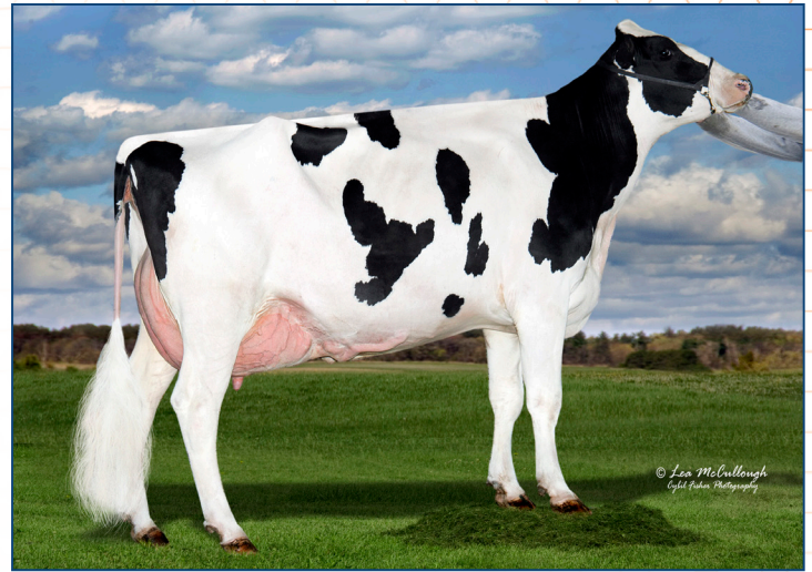
R-Way Atwood Lazer-ET EX-92 2E Grandam of Lot 18H