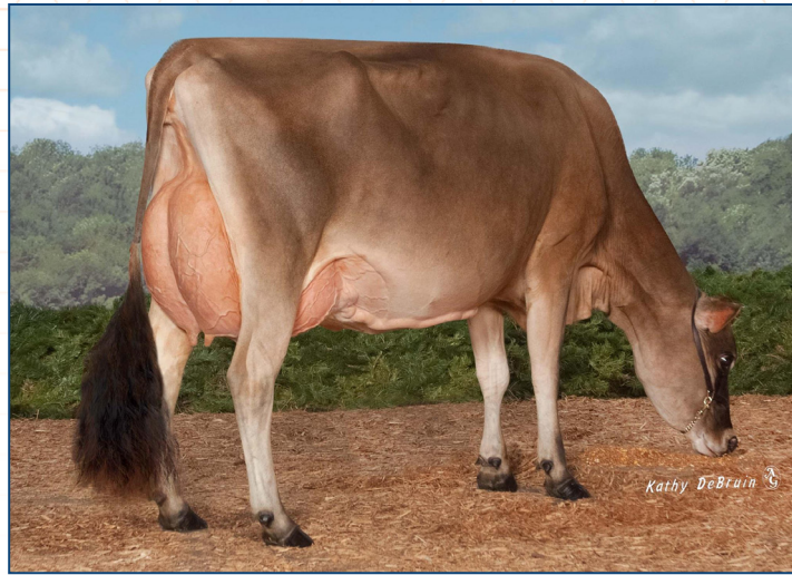
Ahlem Action Winsome 33421 EX-95% Grandam of Lot 43J