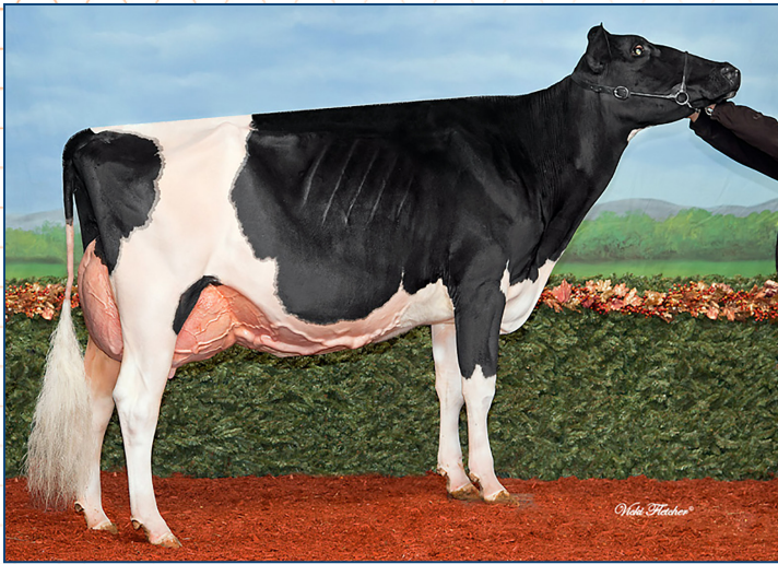
St-Jacobs Goldwyn Hazel-ET EX-94-4E 6* Grandam of Lot 37H