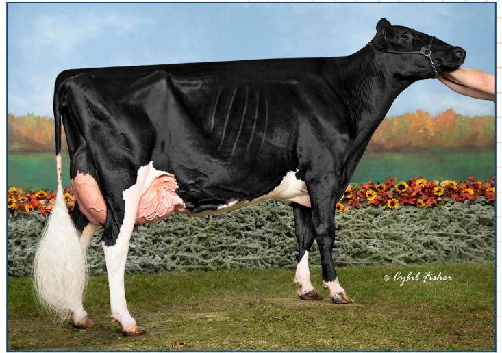
Lakeshore Sid Banana-ET EX-91 Grandam of Lot 26H