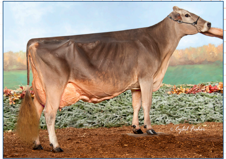
Cutting Edge Stratus Sue EX-94-3E Grandam of Lot 12BS