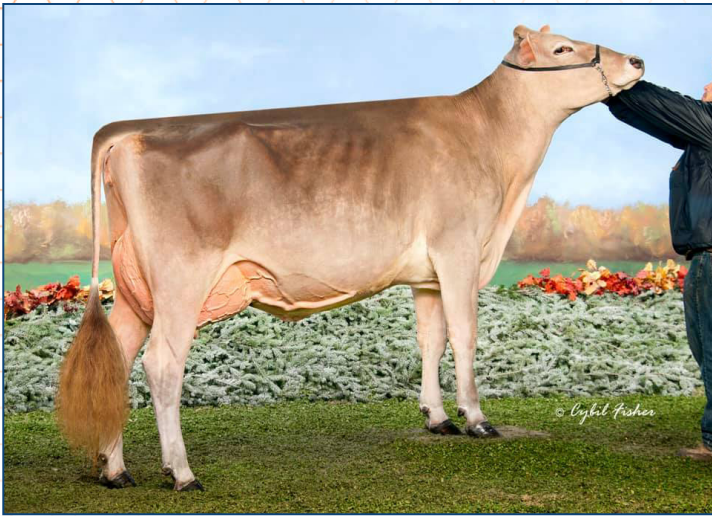
Hartman Hills Duham Charisma EX-91 Dam of Lot 11BS