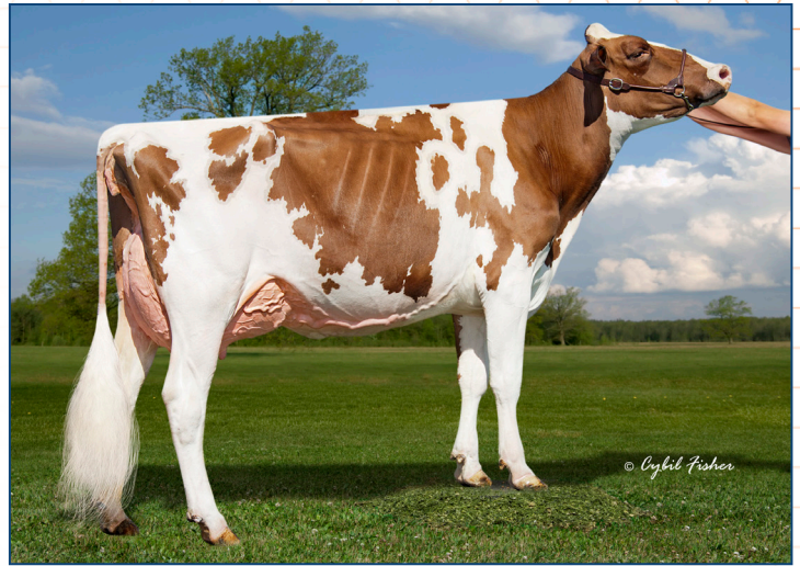
Schluter Summer Lee-Red-ET EX-91 Dam of Lot 32H