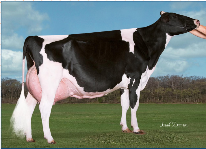
Carters-Corner Atwood Priss EX-94 2E Grandam of Lot 23H