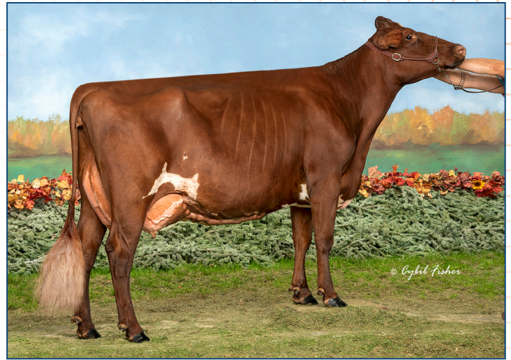
Innisdail RU Stella 803 EXP EX-90 EX-MS Dam of Lot 51MS