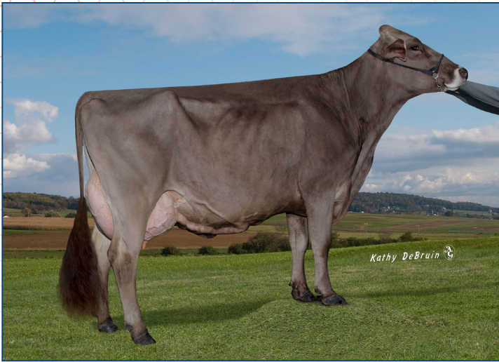
R N R Temtation Berea ET EX-94 Grandam of Lot 9BS