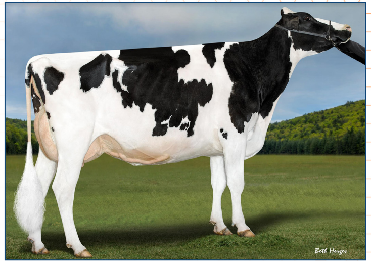
Ms Danielle Dana-ET *RC EX-94 2E Dam of Lot 30H