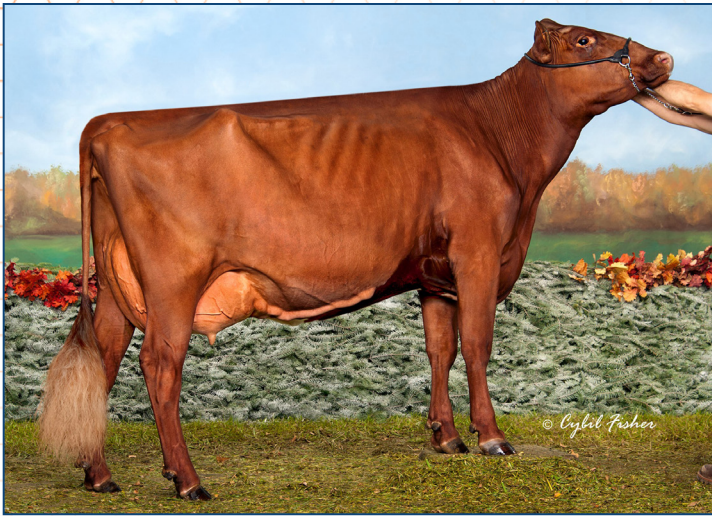
Hard Core Premium Fire Maid EXP EX-94 2E 3rd Dam of Lot 48MS