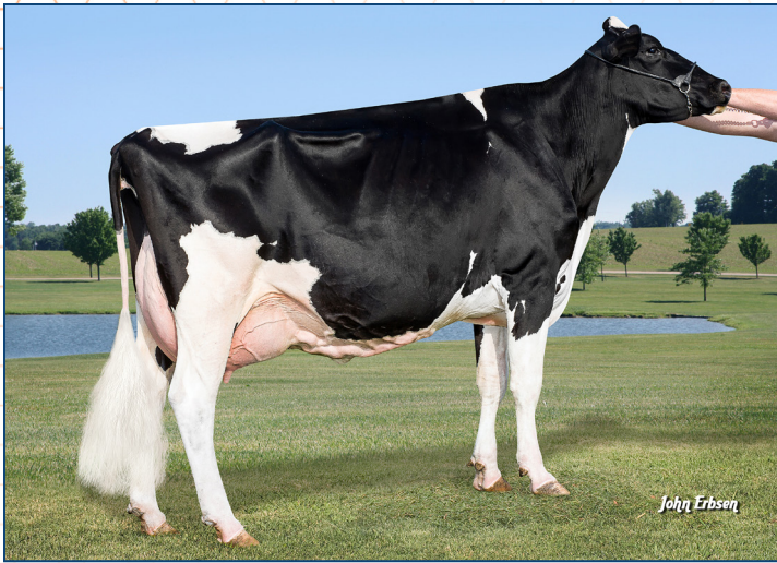
Erbacles Atwood Sophie EX-94 3E Same Family as Lot 29H