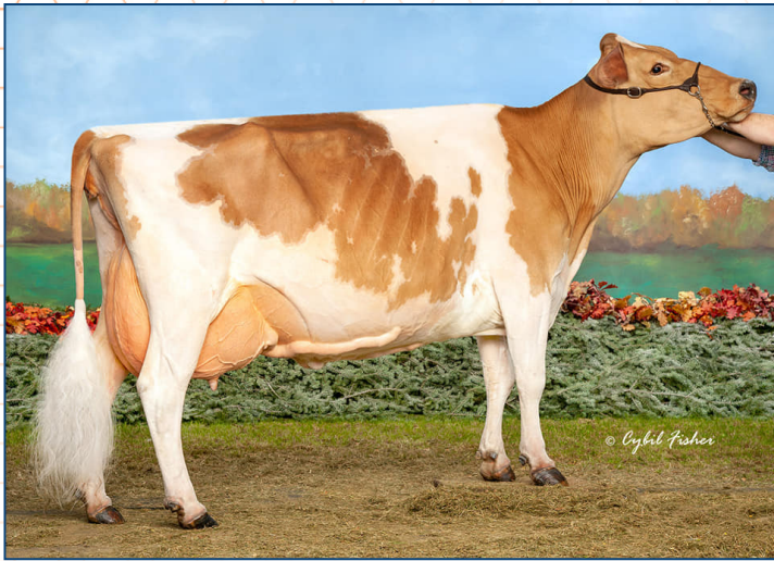
Up The Creek Jester Kazaam EX-91-2E Dam of Lot 7G