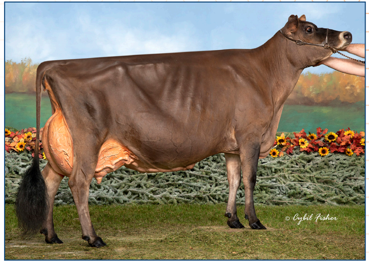
Edgelea Tequila Sheraton EX-95% Dam of Lot 42J