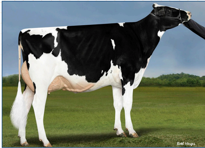
Castleholme Avalanch Forgoid EX-90 3rd Dam of Lot 34H