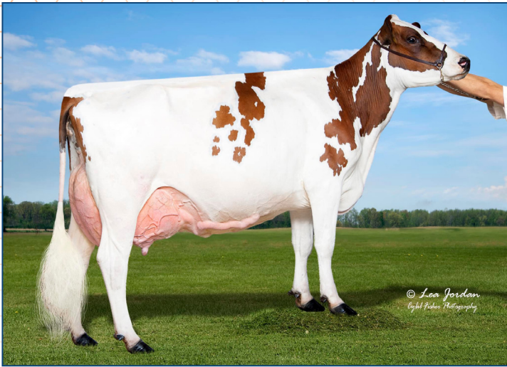
Myline Original Gangster EX-90 Dam of Lot 1A