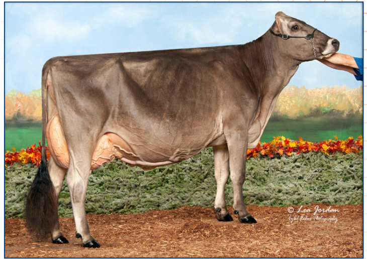
Cutting Edge F Faroh EX-93 Maternal Sister to Dam of Lot 10BS