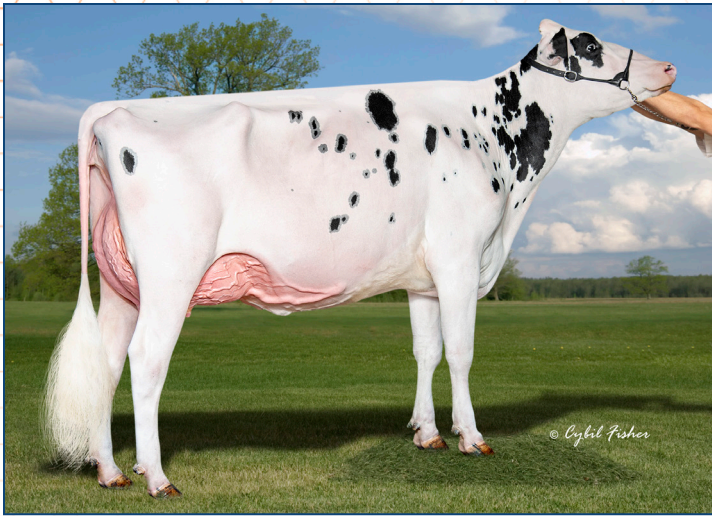
Mc-Country Denver Ingrid EX-92 Grandam of Lot 31H