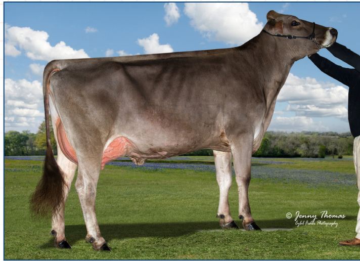
DSKM Legacy Vocalist Twin EX-91 2E 3rd Dam of Lot 13BS