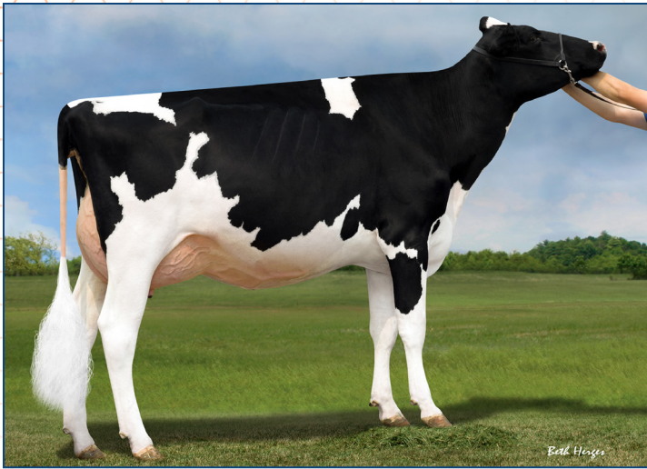
Ms Apple Andorra-ET EX-91 Grandam of Lot 17H