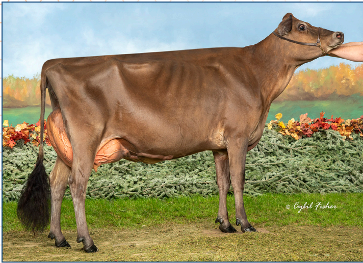
Schulte Bros Colt First Lady-ET EX-91% Maternal Sister to Lot 41J