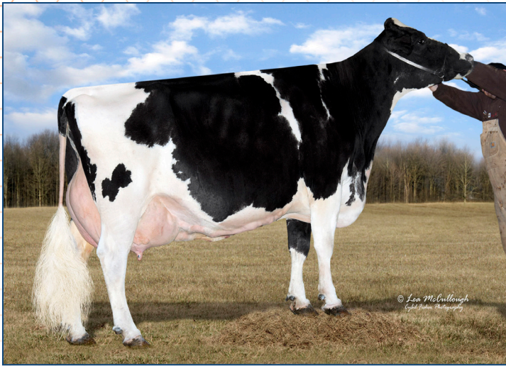
Holbric Linjet Roxette EX-92 2E 3rd Dam of Lot 19H