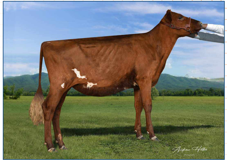
Krauses Tanbark Janet 966 P Full Sister to Lot 49MS