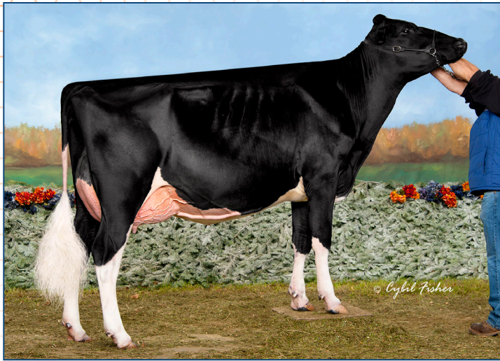
Arethusia Sid Tess EX-92 Dam of Lot 15H