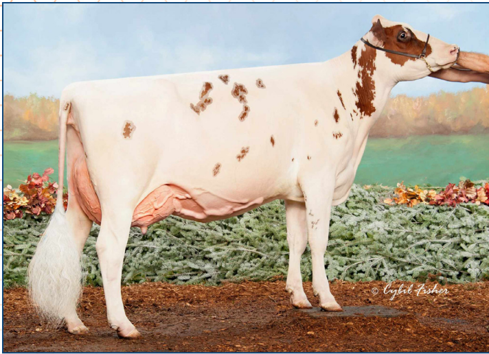
Mackinson Double Dare-ET EX-91 Dam of Lot 3A