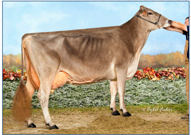
Random Luck PT LG Papaya ET EX-91 2E 4th Dam of Lot 8BS