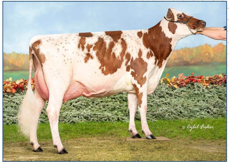
Wingert's Reagan Star Dam of Lot 2A