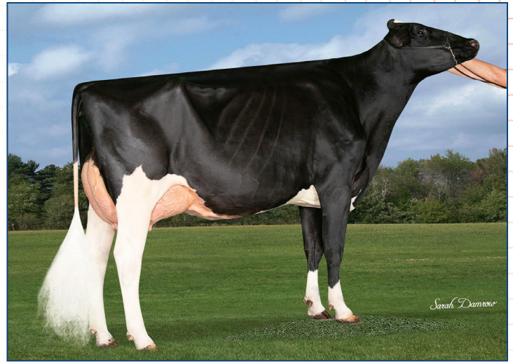
Bluff-Ridge Doorman Bouquet EX-90 Grandam of Lot 20H