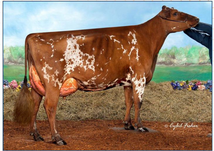
Old-N-Lazy Motion For Mistrial-ET EX-93 3E Grandam of Lot 6A