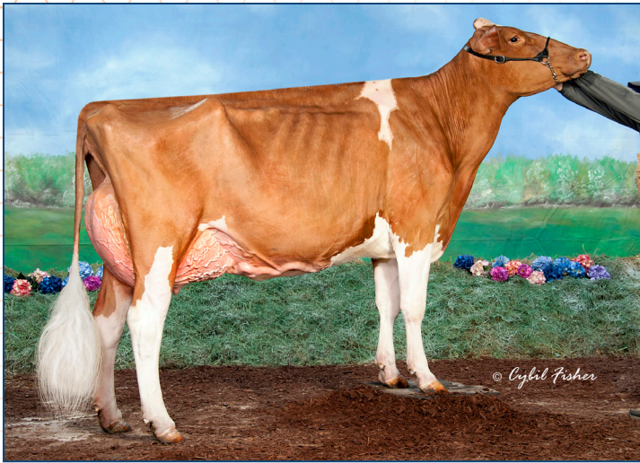
Pamprd-Acres Ab Ivy-Red-ET EX-94 3E Dam of Lot 21H