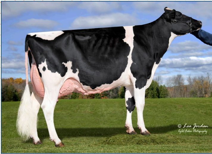
Ludwigs-DG Atwood Adele-ET EX-91 Grandam of Lot 25H