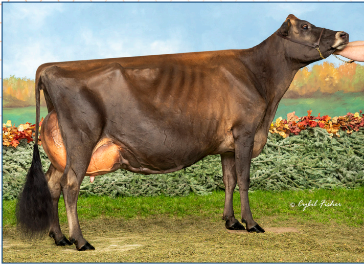
Bri-Lin Valson Spritz EX-97% Grandam of Lot 39J