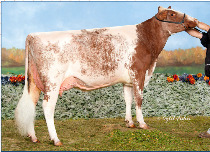
Topp-View Red Robin Alexa EX-91 2E Dam of Lot 50MS