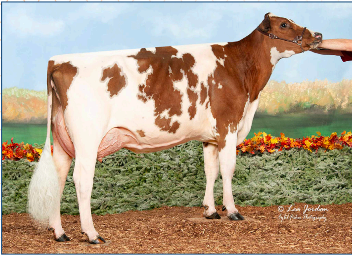
B-Ruthless Kingsire Rose-ET VG-85 Full Sister to Dam of Lot 5A