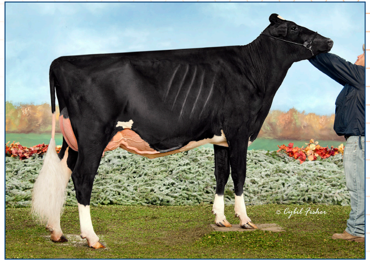
Lakeshore Solomon Emore VG-88 Grandam of Lot 36H