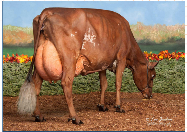
Arthuracres Dempsey Alise-ET EX-93 Dam of Lot 4A