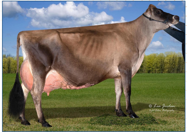
Oakfield Tbone Vivianne-ET EX-96% Grandam of Lot 40J