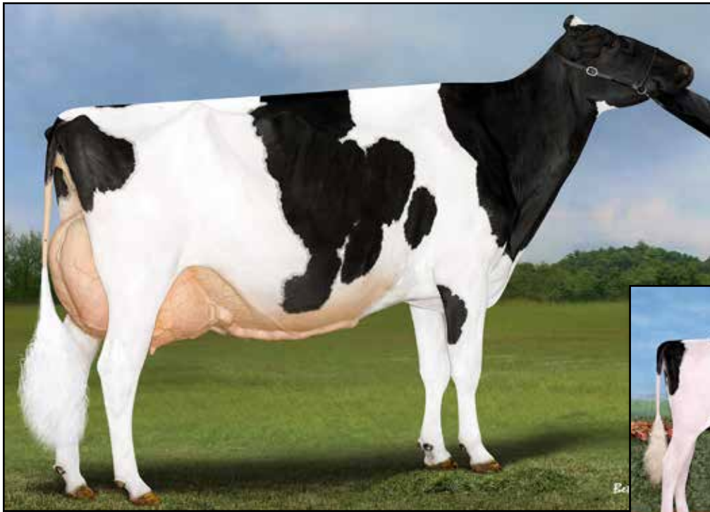
FLOYDHOLM MC EMOJI-ET EX-95 2ND DAM OF LOT 17 All-American Junior 3-Year-Old 2019