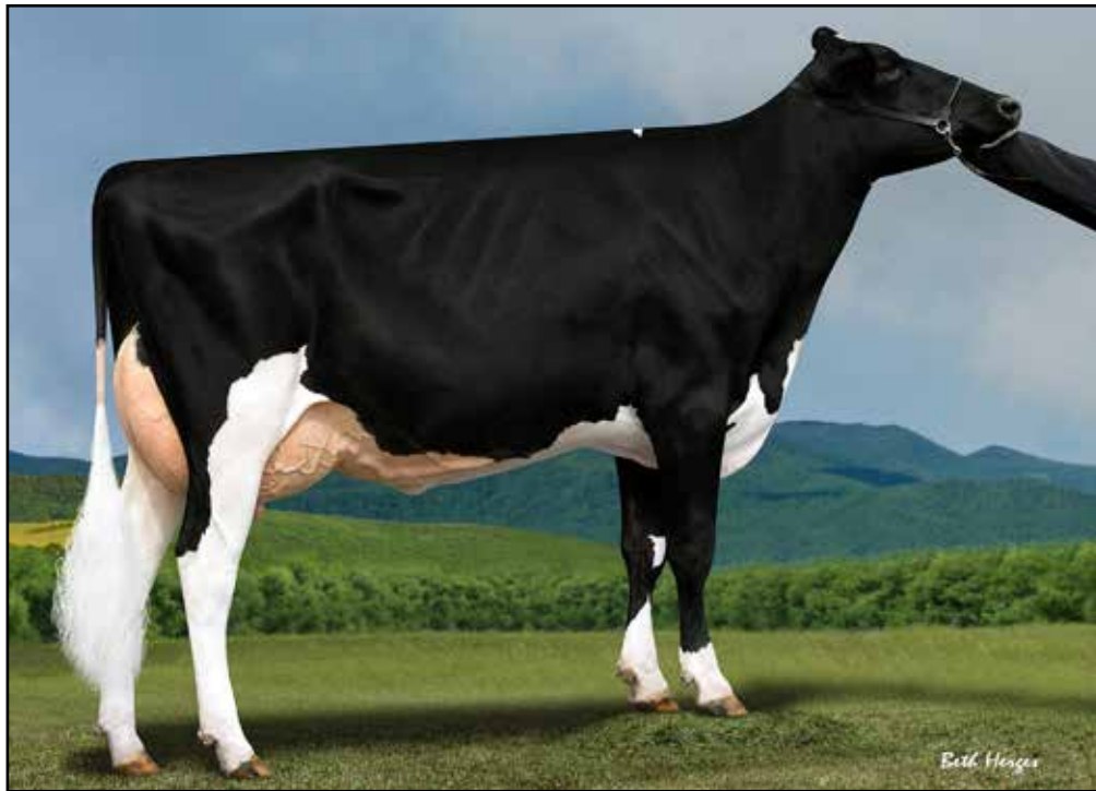
PETITCLERC DEMPSEY SABRINA EX-90 3RD DAM OF LOT 40