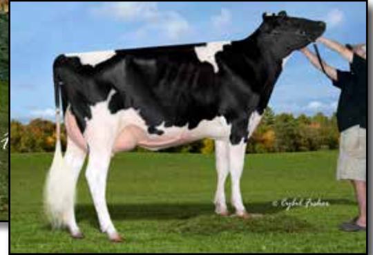
CAMERON-RIDGE JAS LUXURY-ET EX-92 3RD DAM OF LOT 21