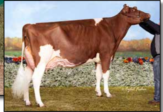
MISS ALABAMA-RED-ET EX-92-CAN MATERNAL SISTER TO LOT 4

Grand Champion, Mid-East Fall R&W Show 2013