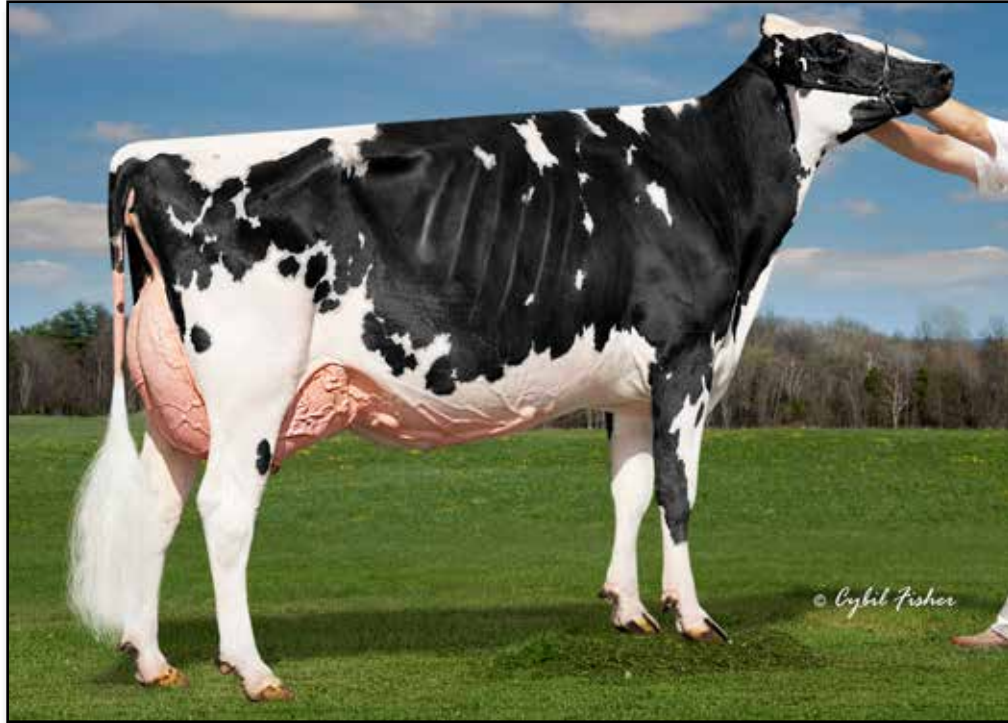
PETITCLERC DOORMAN SAPPHIRE-ET EX-94 2E DAM OF LOT 22

Nominated Junior All-American 4-Year-Old 2021