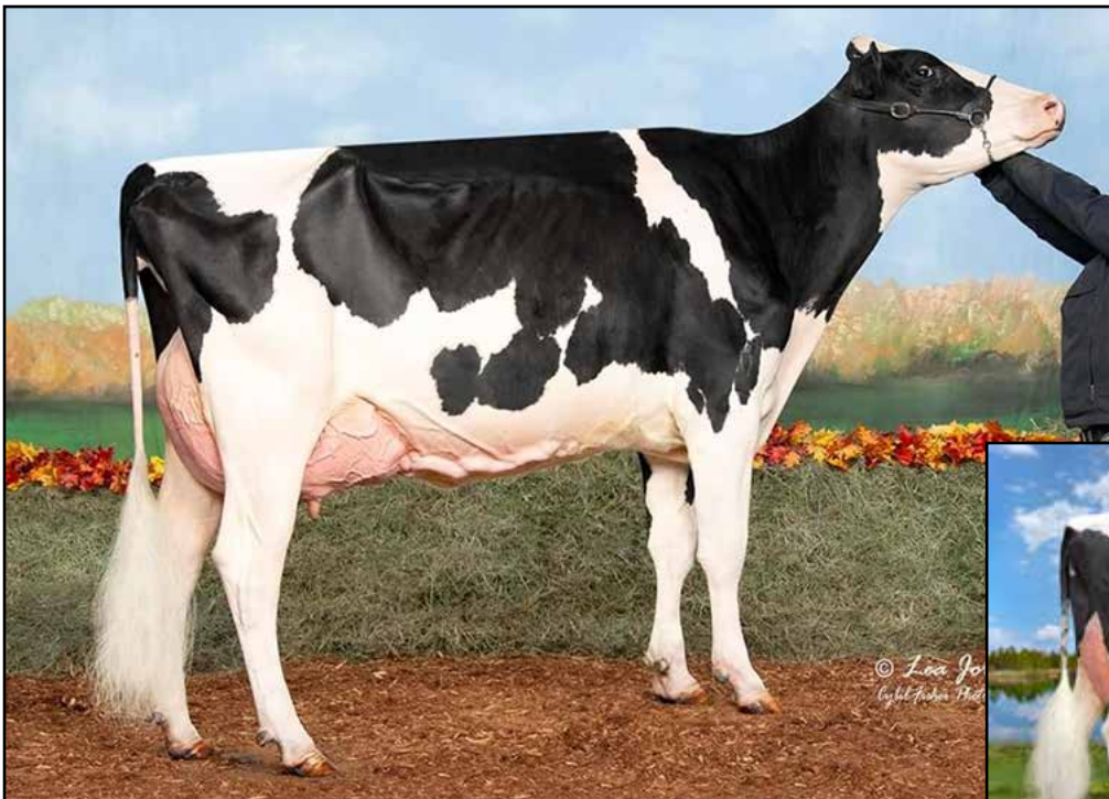
MCWILLIAMS WARRIOR RAINE-ET EX-92 DAM OF LOT 1