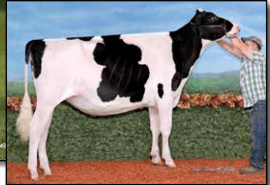
MS THUNDERSTORM ETERNITY-ET VG-89 FULL SISTER TO LOT 17 Reserve All-American Winter Yearling 2022