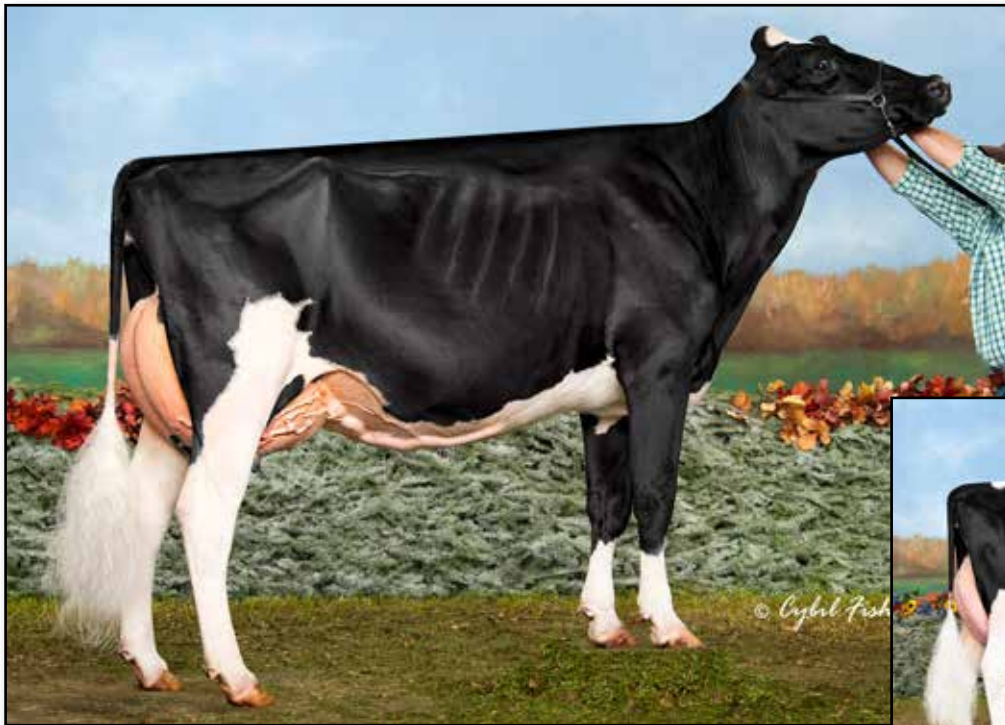
CRAIGCREST RUBIES RACHELE-ET EX-94 DAM OF LOT 6

HM All-American Junior 3-Year-Old Cow 2016