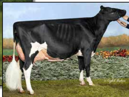
BUDJON-JK DAMION EKLIPSE-ET EX-94 2E DAM OF LOT 42

Nominated Junior All-American Sr 3-Year-Old 2016