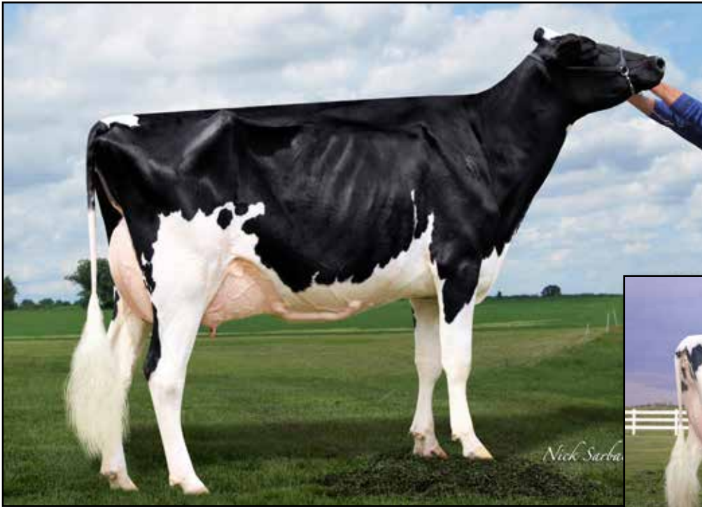
KY-BLUE GW DEBBIE-ET EX-94 MATERNAL SISTER TO 2ND DAM OF LOT 37 All-American Summer Yearling 2009