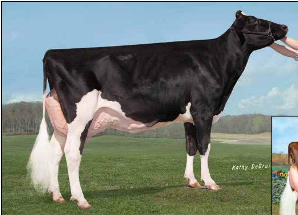
MS APPLES ARIA-ET EX-92 2E 2ND DAM OF LOT 31