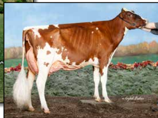
CHERRY-LOR DBK ROBIN-RED EX-92 MATERNAL SISTER TO LOT 16

Reserve All-American R&W Lifetime Production Cow 2021