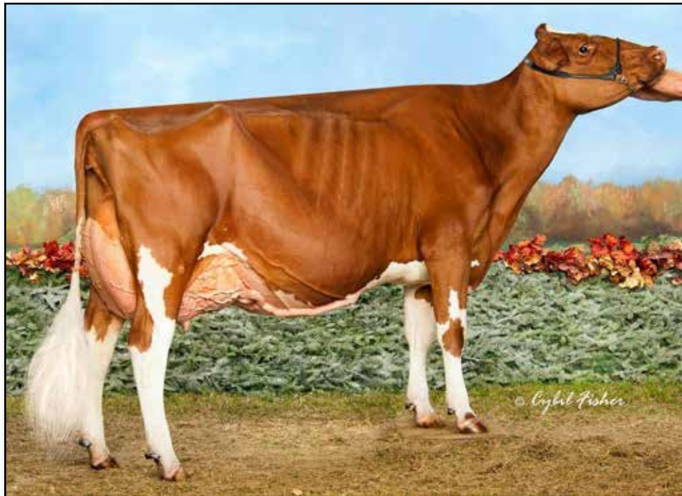
MEADOW GREEN ABSO FANNY-RED EX-96 3E 2ND DAM OF LOT 24

All-Canadian Lifetime Production Cow 2019