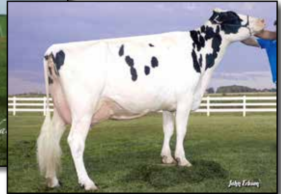
BVK OUTSIDE DIANA-ET EX-92 2E 3RD DAM OF LOT 37