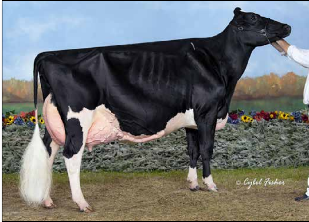
COOKVIEW GOLDWYN MONIQUE EX-96 3E DAM OF LOT 23