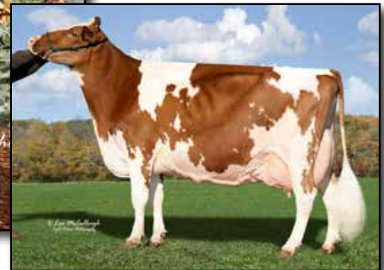
STONY-PILLAR SHARMAINE-RED EX-94 2E 2ND DAM OF LOT 5

Grand Champion, International R&W Show 2018