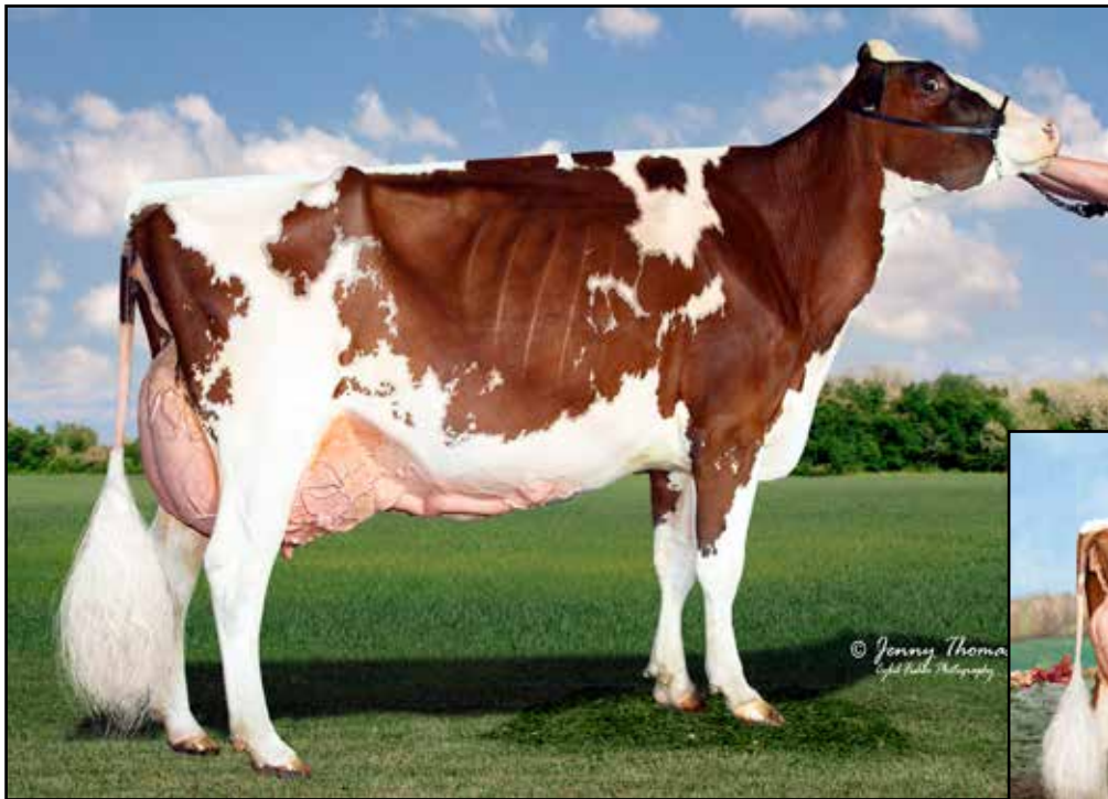
CHERRY-LOR LADD RIPPLE-RED EX-95 3E 3RD DAM OF LOT 32

Reserve All-American R&W Lifetime Production Cow 2021