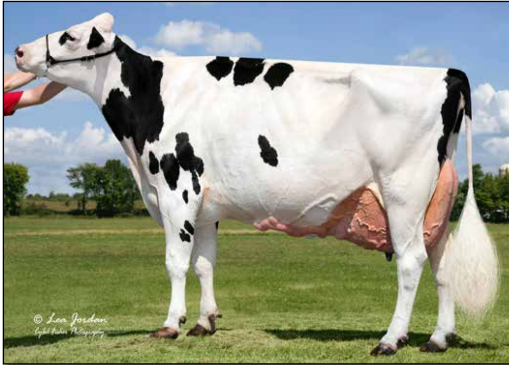
PRICESTEAD ATWOOD LILA-ET EX-94 4E DAM OF LOT 8