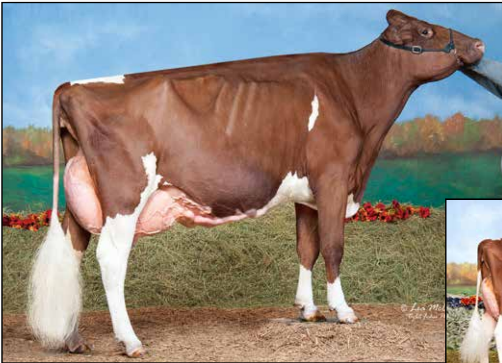
KHW REGIMENT APPLE 2-RED-ETN EX-93 2E DAM OF LOT 4

Grand Champion, Mid-East Fall R&W Show 2013