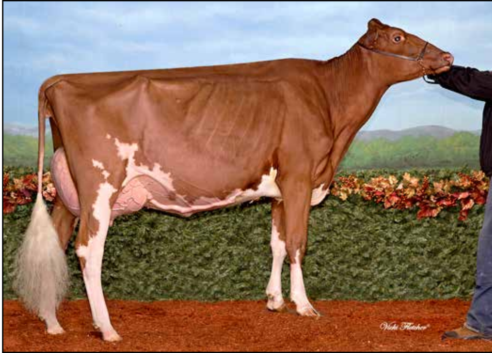
MS-AOL DB RASPBERRY-RED-ET EX-90-CAN 2ND DAM OF LOT 15