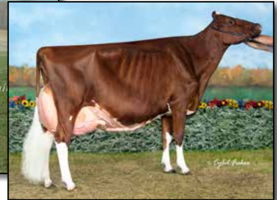
KHW REGIMENT APPLE-RED-ET EX-96 4E 3RD DAM OF LOT 31