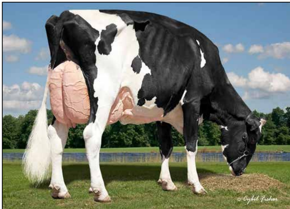
KLINEDELL DEFANT CYNTHIA-ET EX-94 2E DAM OF LOT 3