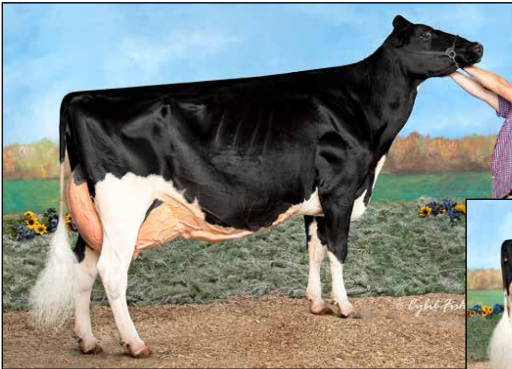
DUCKETT-SA GOLD FAME-ET EX-94 2E 3RD DAM OF LOT 30