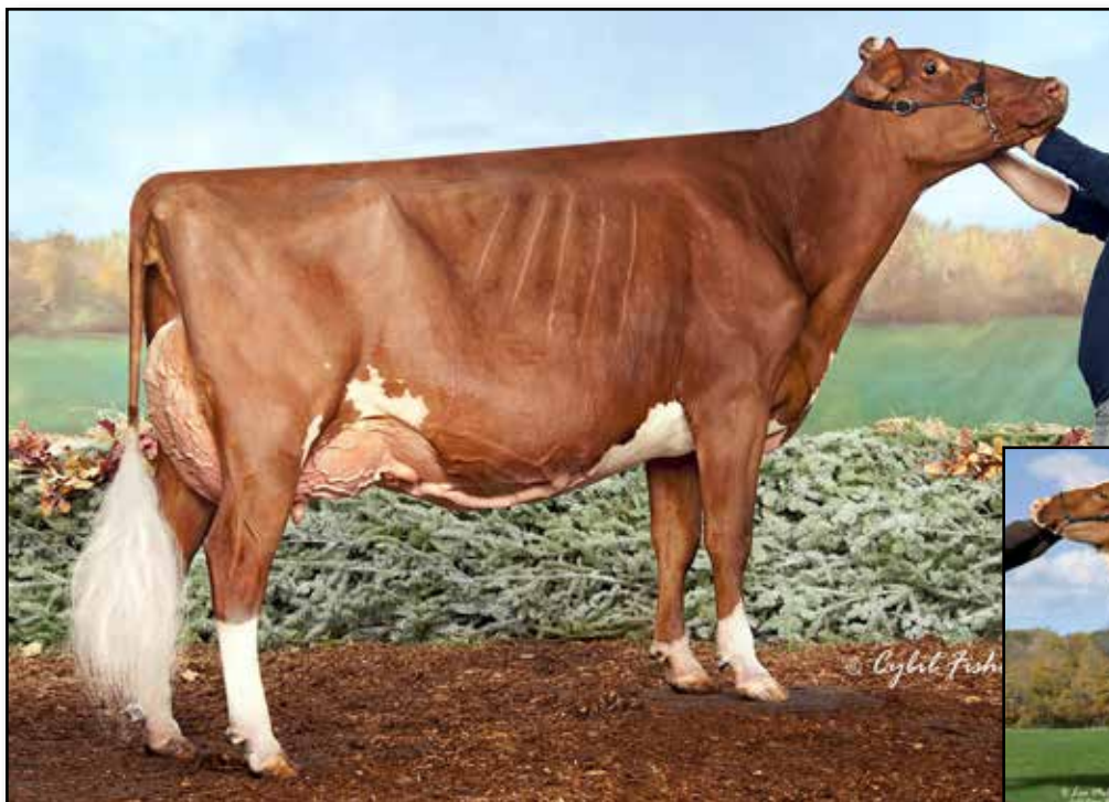
OAKFIELD A SHAMPAGNE-RED-ET EX-94-2E-CAN MATERNAL SISTER TO DAM OF LOT 5

Grand Champion, International R&W Show 2018