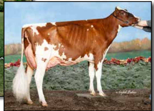
CHERRY-LOR DBK ROBIN-RED EX-92 2ND DAM OF LOT 32

Reserve All-American R&W Lifetime Production Cow 2021