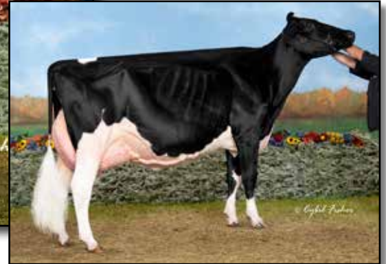
CRAIGCREST RUBIES GOLD REJOICE-ET EX-94 FULL SISTER TO DAM OF LOT 6

HM All-American Junior 3-Year-Old Cow 2016