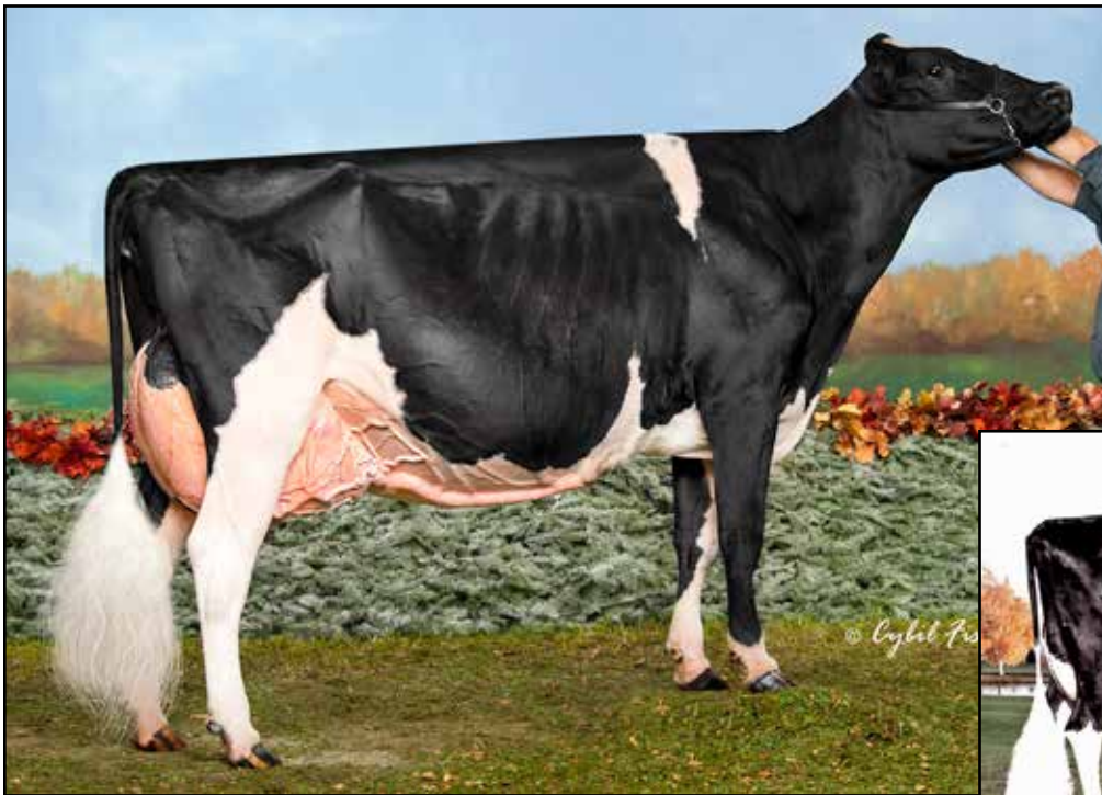
LUDWIGS-DG GOLDWYN ELLIE-ET EX-95 2E 2ND DAM OF LOT 12

Nominated All-American 150,000 Lb Cow 2016