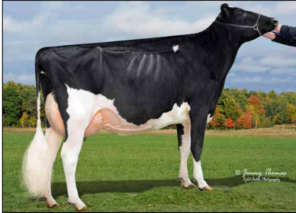
BENRISE DUPLEX ARIENNE EX-95 2E 2ND DAM OF LOT 11

1st Aged Cow, Mid-East Fall National Show 2017