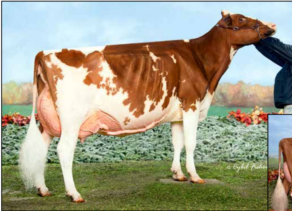
MS-AOL CONTENDER REVIVE-RED EX-95 MATERNAL SISTER TO LOT 2 All-American R&W 5-Year-Old 2019