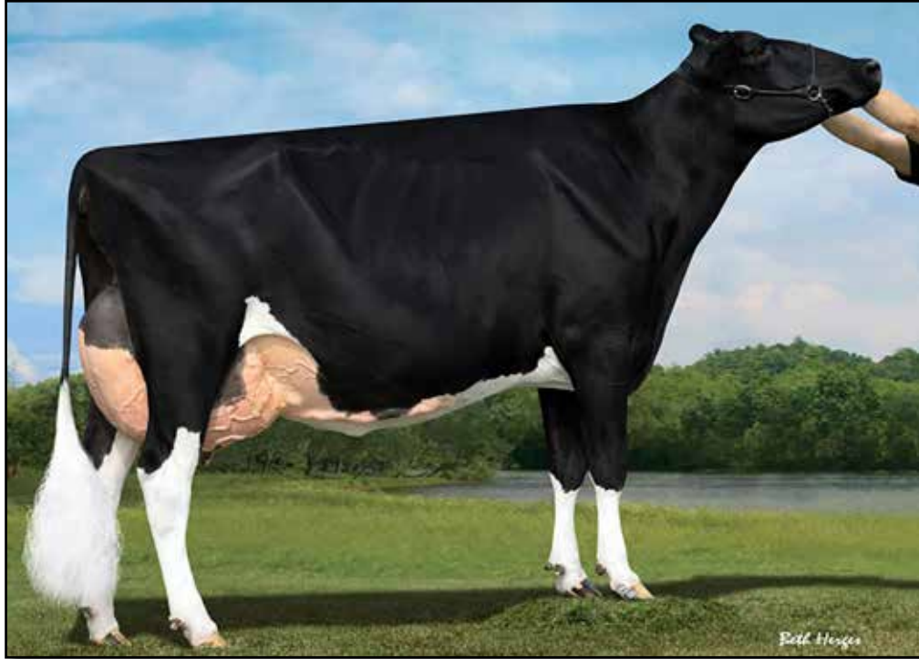
GARAY ALEXANDER DESTINY-ET EX-94 DAM OF LOT 41 All-American Milking Yearling 2011