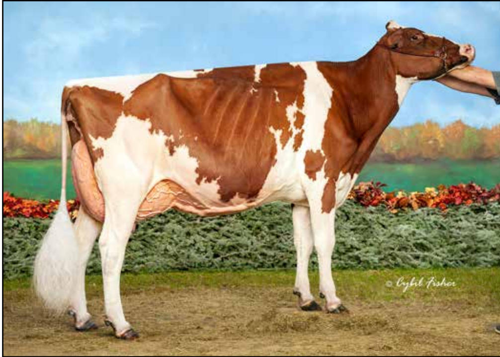
SCHLUTER SHELBY LEE-RED EX-94 2E MATERNAL SISTER TO 2ND DAM OF LOT 27 Nominated All-American R&W 5-Year-Old 2021