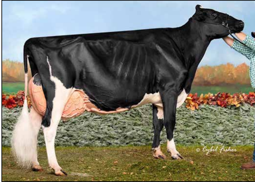
TC SANCHEZ KRISTINA EX-96 3E 2ND DAM OF LOT 18 Reserve All-American Aged Cow 2016