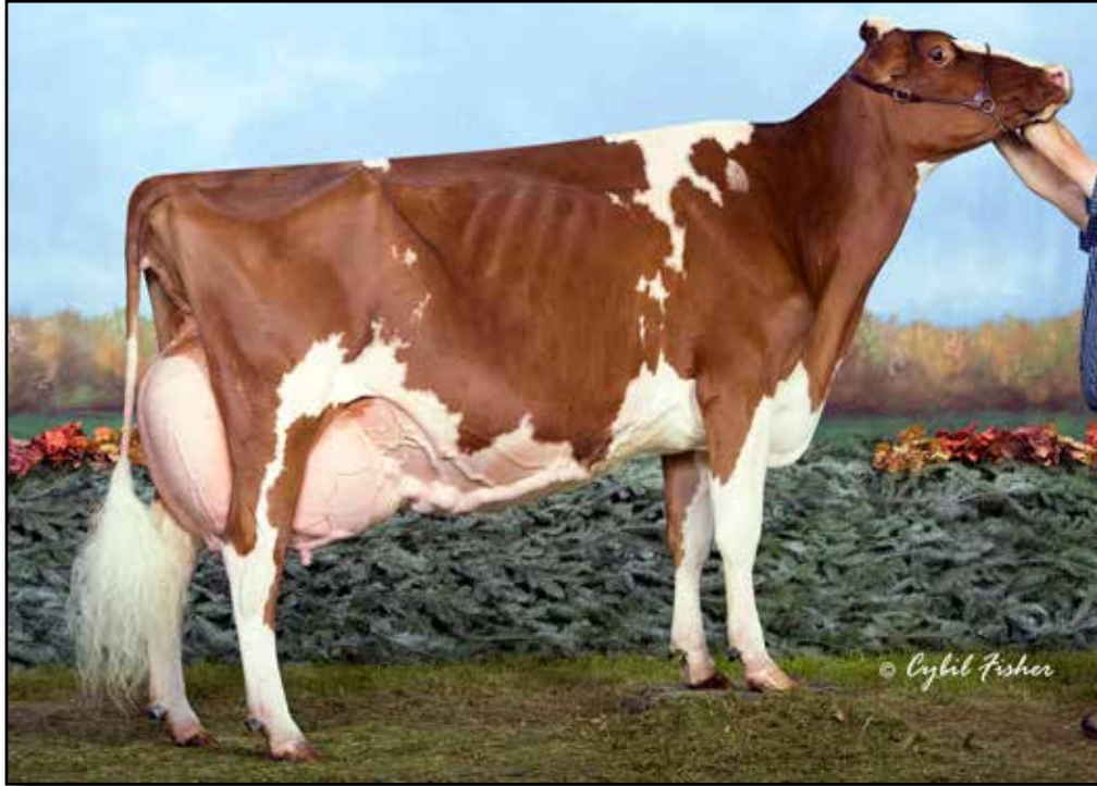
STONE-FRONT RUB INDIGO-RED EX-94 2E 4TH DAM OF LOT 20

Nominataed All-American R&W 125,000 Lb Cow 2010