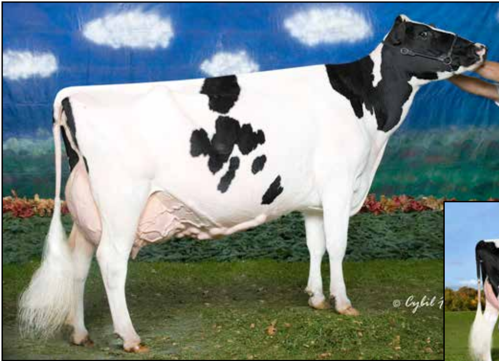
CAMERON-RIDGE BC LISA EX-96 4E 4TH DAM OF LOT 21