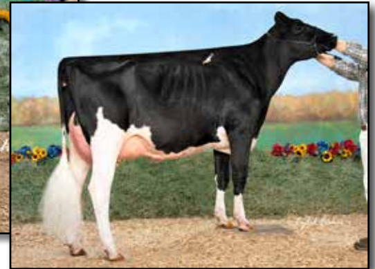
SWEET-PEAS ATW CAREFUL-ET EX-93 2E 2ND DAM OF LOT 30 All-PA Milking Yearling 2017