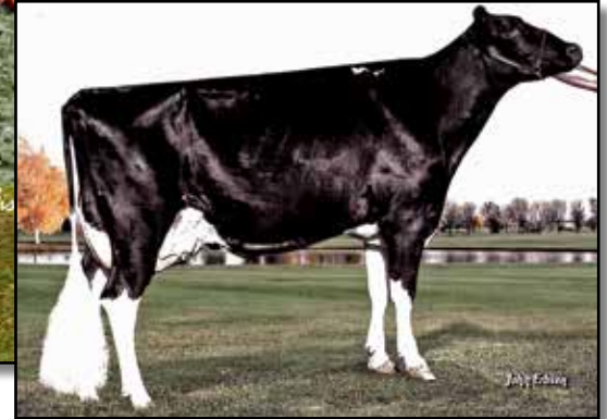
LUDWIGS-DG SID ELECTRA-ET EX-92 DAM OF LOT 12

Nominated All-American 150,000 Lb Cow 2016