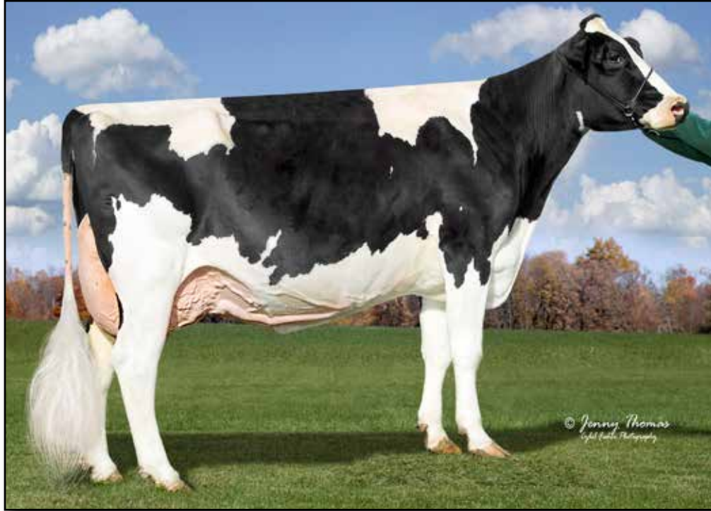
NISE-N-FANCY CHIKIN BISKIT EX-92 3E DAM OF LOT 19