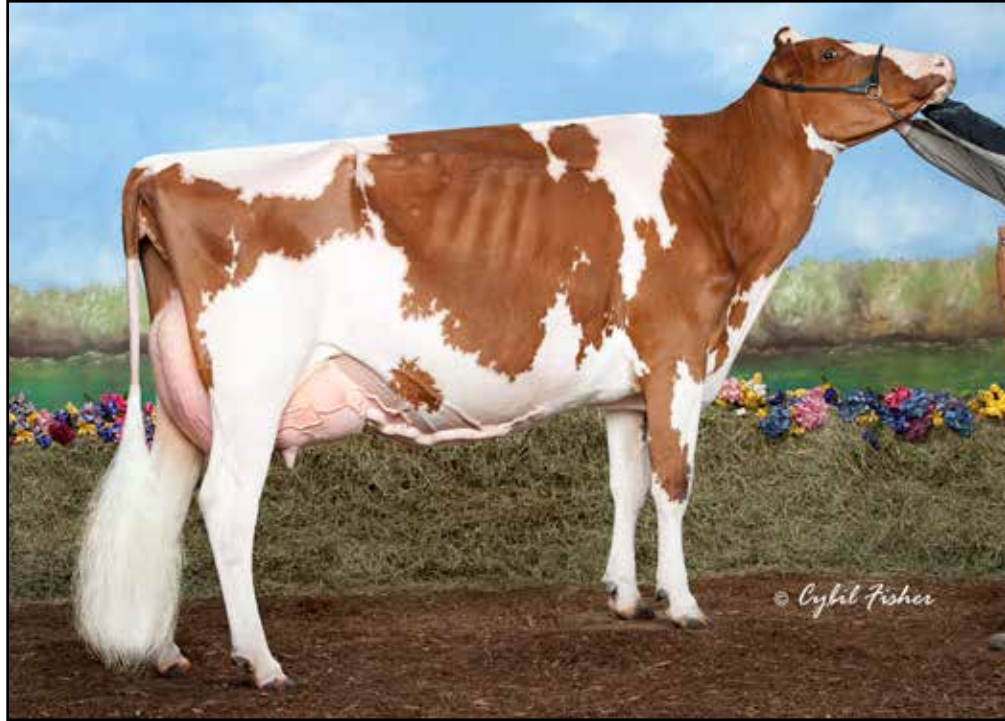
STARMARK AD HOTSTUFF-RED EX-94 2E DAM OF LOT 9; 2ND DAM OF LOT 10 All-American R&W 5-Year-Old 2012