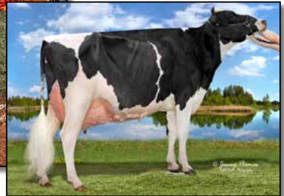
MCWILLIAMS ATWOOD ROSE-ET EX-92 2E 2ND DAM OF LOT 1