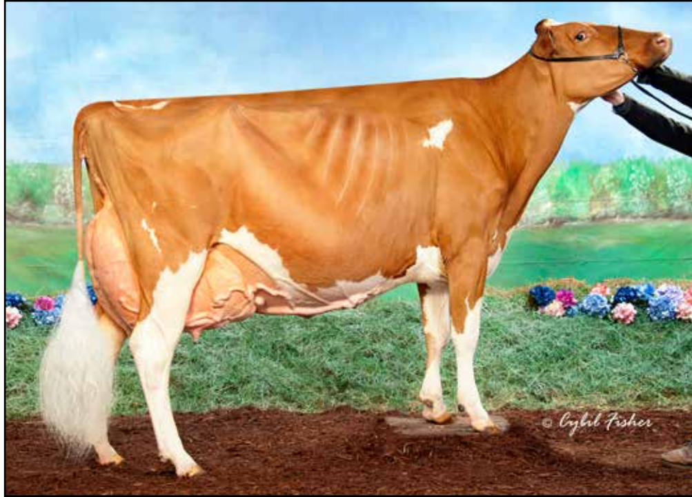
ROSEDALE LUCKY-ROSE-RED EX-94 2E 2ND DAM OF LOT 26 Reserve All-American R&W Aged Cow 2018