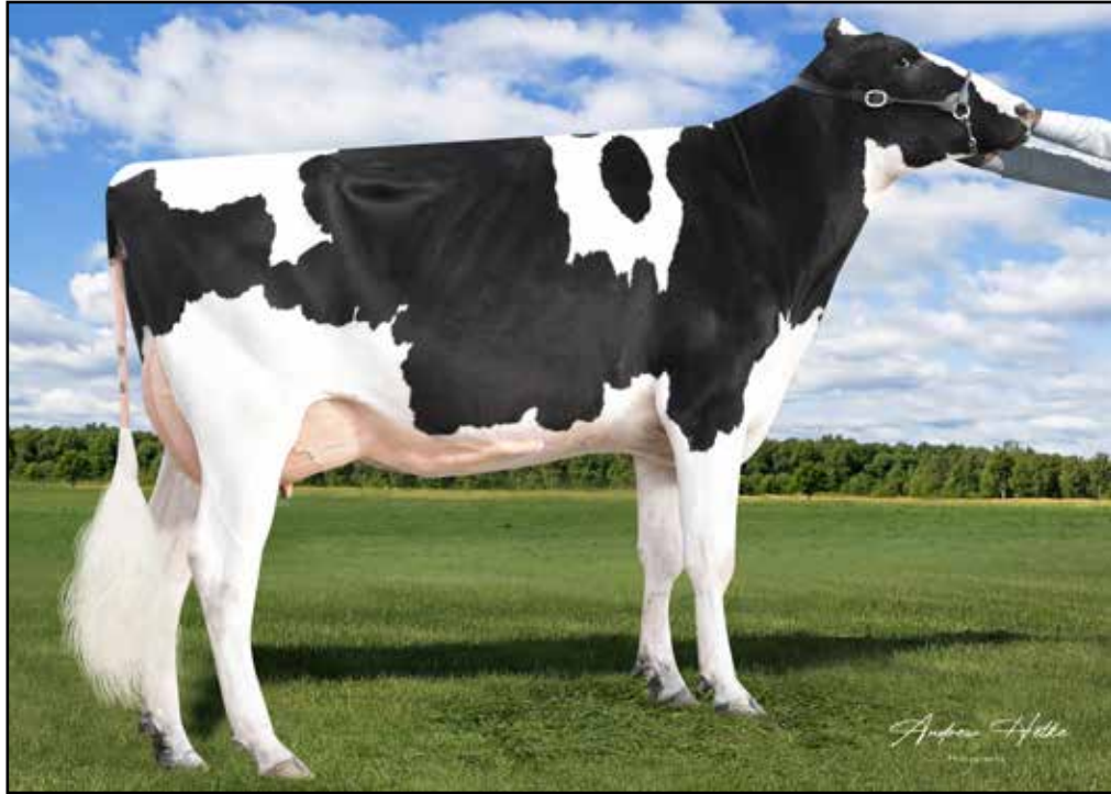
COW-PALACE TATOO 4070 EX-90 SELLS AS LOT 39