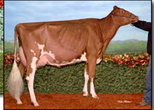
MS-AOL DB RASPBERRY-RED-ET EX-90-CAN MATERNAL SISTER TO LOT 2 All-American R&W Milking Yearling 2018