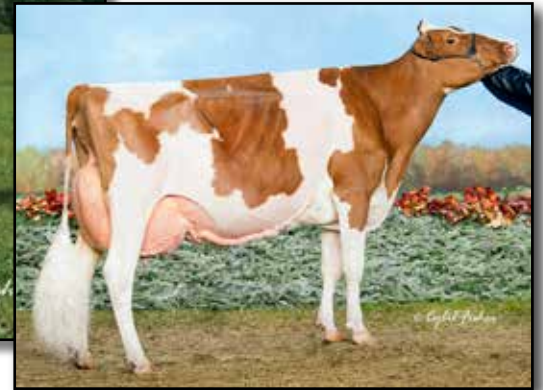
HILROSE ADVENT ANNA-RED-ET EX-95 3E DAM OF LOT 43 Reserve All-American R&W 125,000 Lb Cow 2017