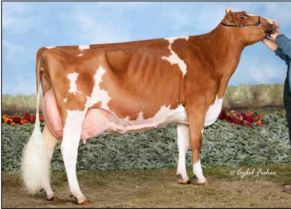
GREENLEA ADVENT LETA-RED EX-94 MATERNAL SISTER TO 3RD DAM OF LOT 38 Reserve All-American R&W 4-Year-Old 2011