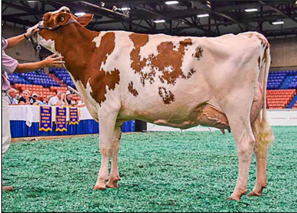
BENTER LAPP LADY-RED DAM OF LOT 34

1st Senior 3-Year-Old, KY State Fair REW Show 2022