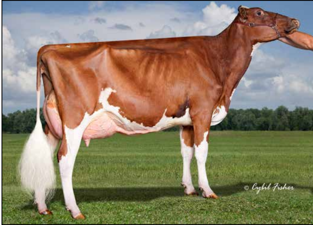
MISS HOT MAMA-RED-ET EX-92 DAM OF LOT 10