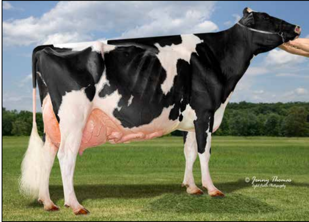
TOPPGLEN ATWOOD WAKI EX-94 2E DAM OF LOT 33