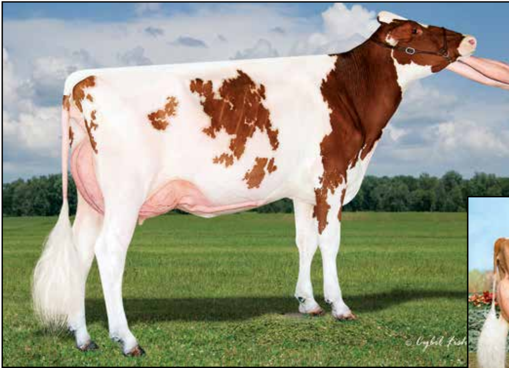
HILROSE AVLANCH ADDY-RED-ET EX-92 MATERNAL SISTER TO LOT 43 HM All-American R&W Milking Yearling 2020