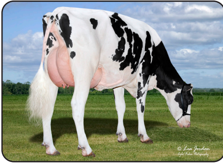
Lars-Acres SSI AHD 26267-ET "GP-83" Dam of Lot 8G