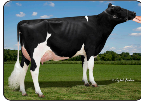
Siemers Doors S-Rozann-ET "VG-86" Fifth Dam of Lot 8G