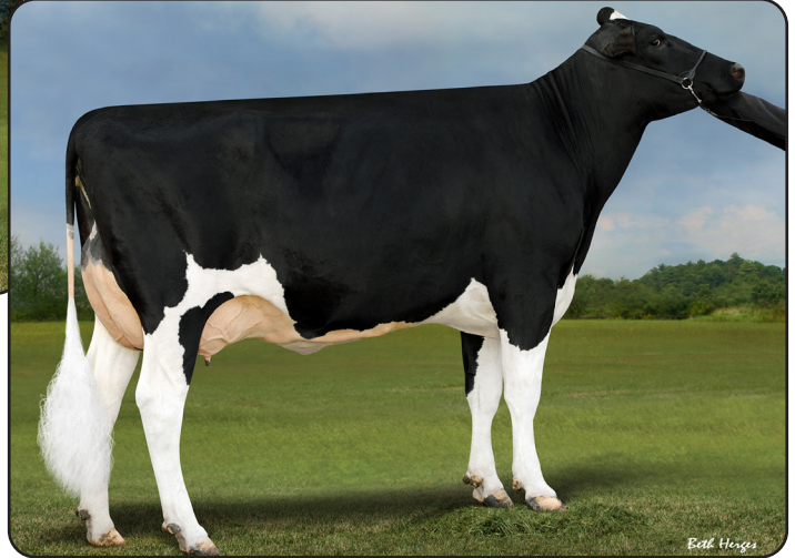
Regan-Danhof R Claudia-ET "VG-85 VG-MS" Granddam of Lot 4G