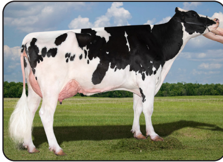
Adaway Riveting 2391-ET "GP-82" Third Dam of Lot 6G