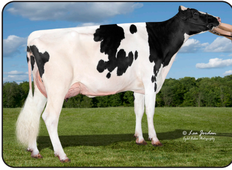
Adaway Ahead 2944-ET "VG-85 VG-MS" Grandam of Lot 6G - Heifer B