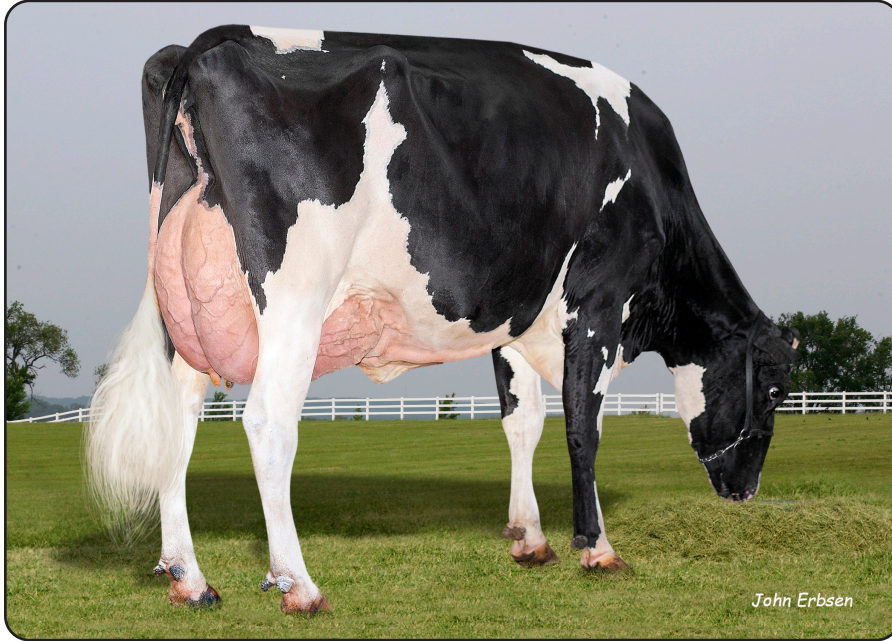
K-Star Renegade Affect-ET "EX-91 MS:93" Granddam of Lot 9G