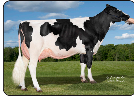
Lars-Acres SSI 22933-ET "EX-90 EX-MS" Third Dam of Lot 8G