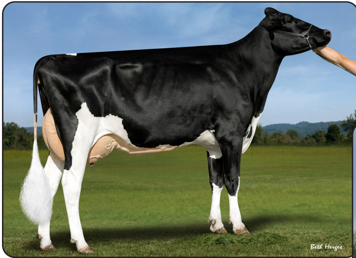
Regan-Danhof G Camilla-ET Third Dam of Lot 4G