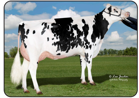
K-Star Delta Answer "VG-86" Third Dam of Lot 9G