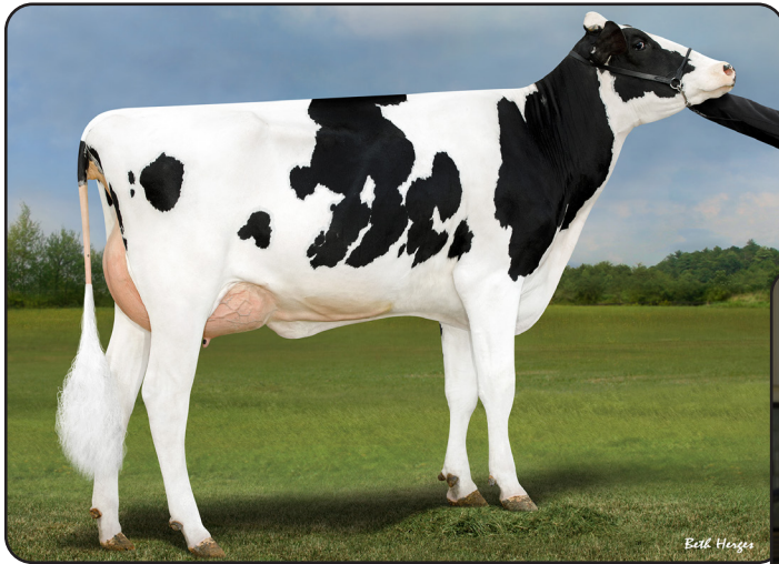
Pine-Three 7831 Lion 598-ET "VG-86 VG-MS" Dam of Lot 7G