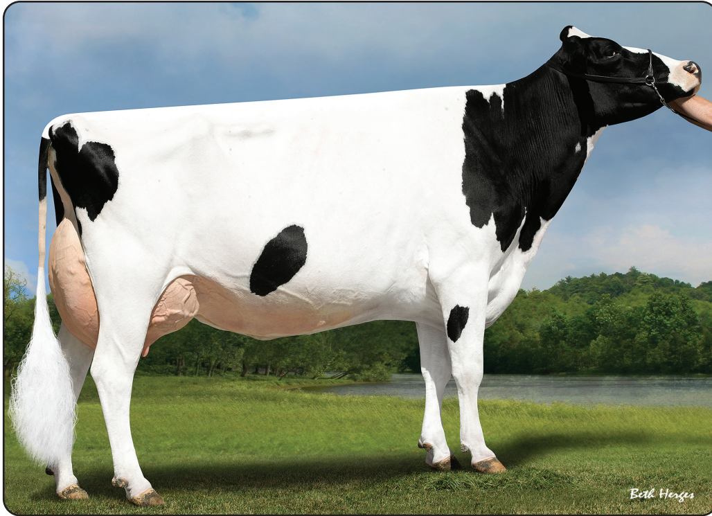
Seagull-Bay Miss America-ET "EX-91" GMD DOM Fourth Dam of Lot 3G