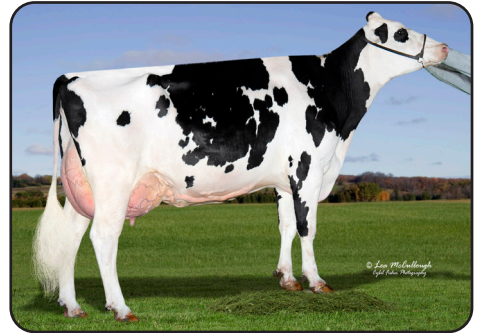
K-Star Facebook Announce "EX-90" Fourth Dam of Lot 9G