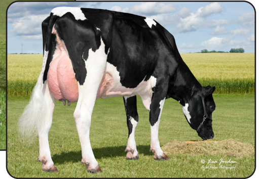
Adaway Helix 1775-ET "VG-86 VG-MS" Fifth Dam of Lot 1G