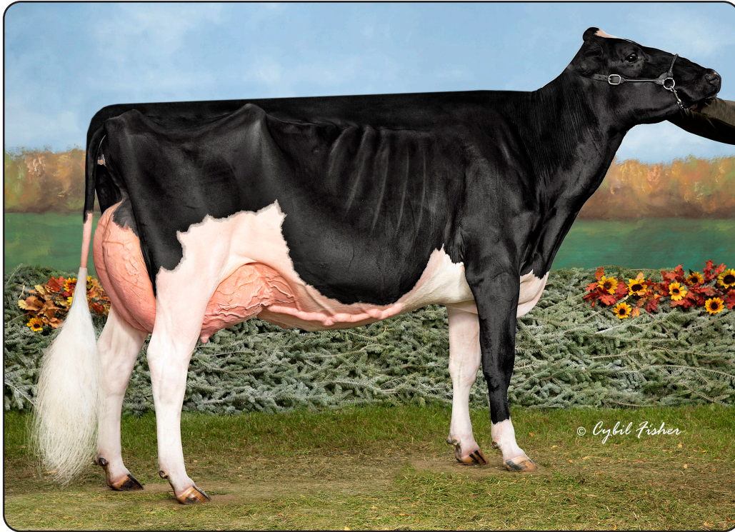
S-S-I Doc Have Not 8784-ET "EX-96"

Res. All-American 4 Year Old 2022 Graddam of Lot 10G