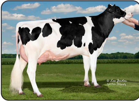
Siemers S-S-I LA 20311-ET "VG-86" Fourth Dam of Lot 8G