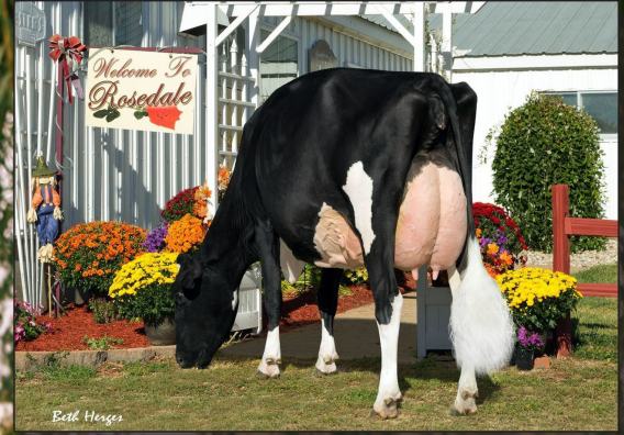
ROSEDALE LEXINGTON-ET - EX95-2E 3 rd DAM