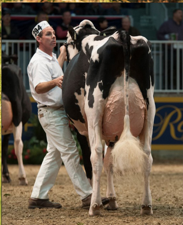
IDEE GOLDWYN LUCIA - EX92 2 ND DAM

2017: All-Canadian Jr 3; HM Grand Champ RAWF | 2016: Grand Champ Quebec Spring