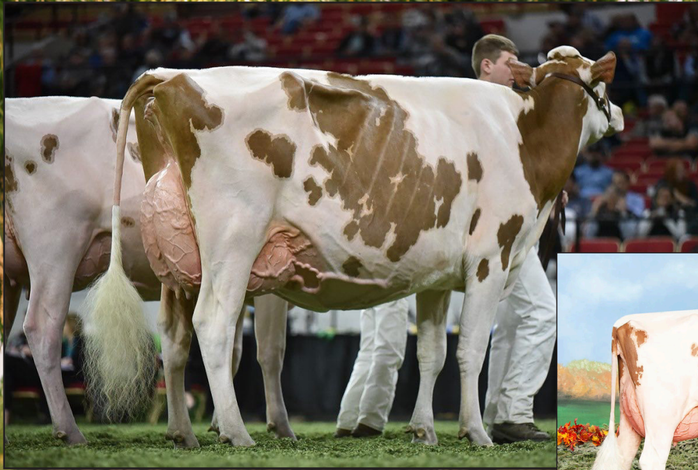
MEAD-MANOR DEF ADELINE-RED - EX94-2E 3 RD DAM