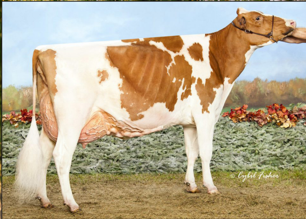
HEATHERSTONE REDHOT-RED - EX92 DAM