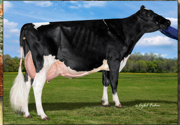
MS MILKSOURCE DANTE-ET - EX92 DAM