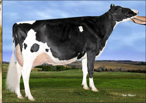
ROSEDALE ISNTSHELOVEABLE-ET - EX90 2 nd DAM