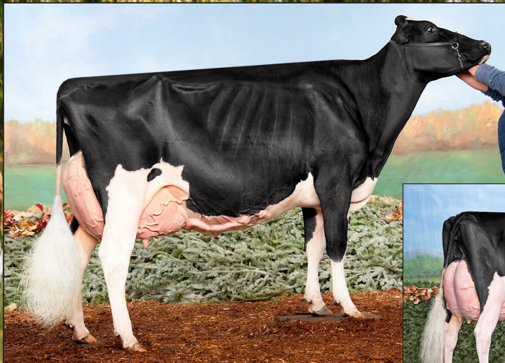
Dina Side