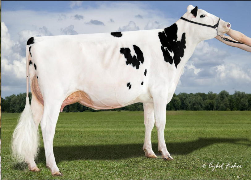
ROSEDALE PLAY HARD TO GET - EX93-2E DAM