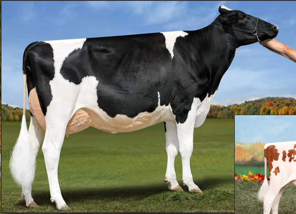
LUCK-E DOC BOPEEP - EX94 DAM