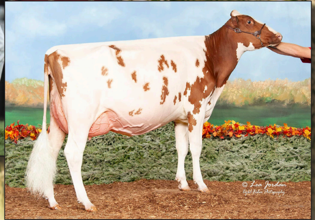
MEAD-MANOR WAR ADS-RED - VG87 FAMILY MEMBER