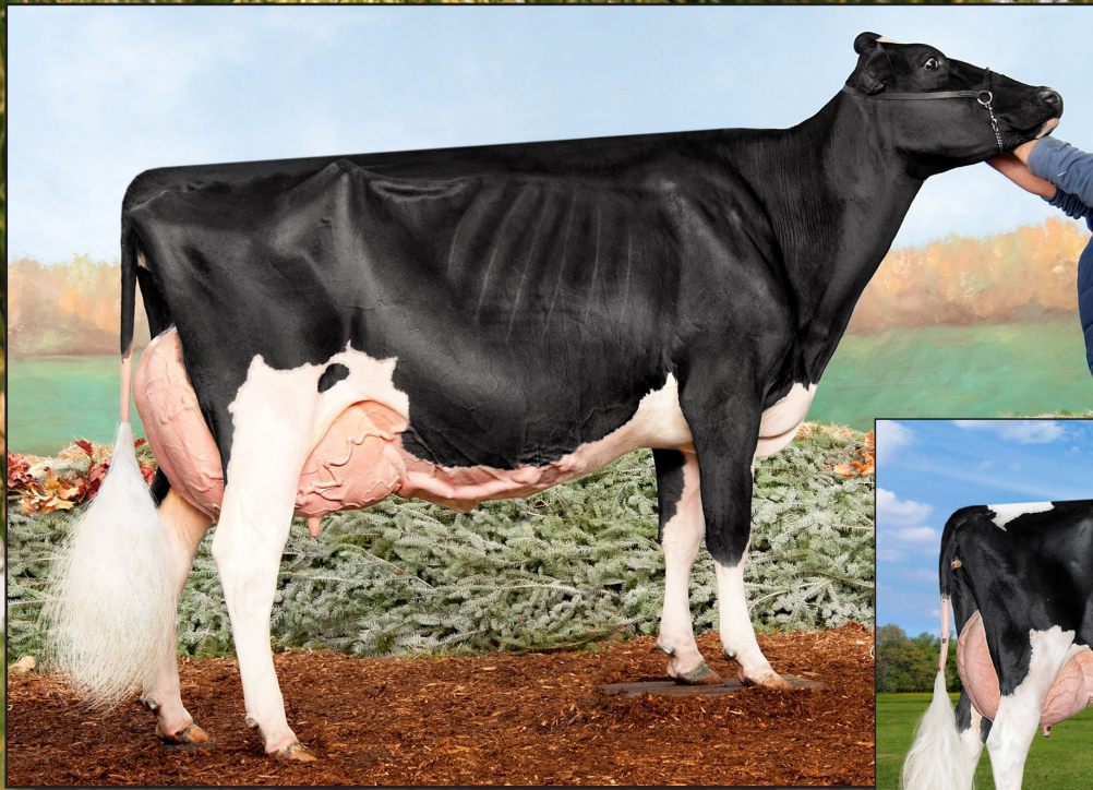
CO-VALE DEMPSEY DINA 4270 - EX96-2E 2 ND DAM