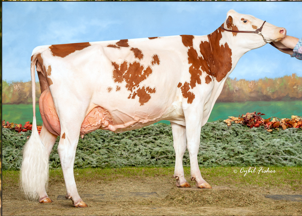
SIEMERS JY GODIVA 29205-RED - EX93 DAM