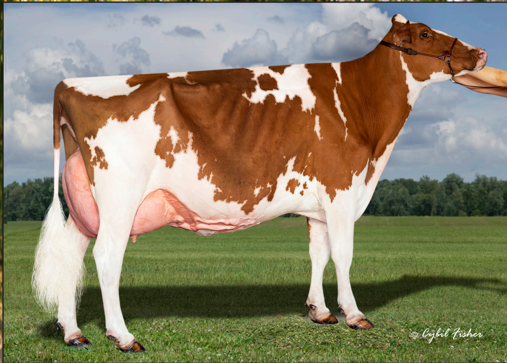
SUERAINES SO CLUMSY-RED - EX93 DAM