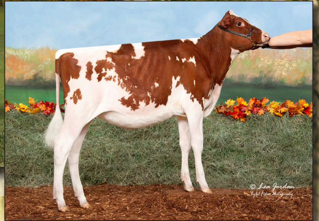
LUCK-E TANGO BELLA FULL SISTER TO EMBRYOS