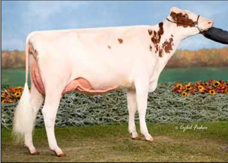
BRICCOVS WR ALLSTAR-RED-ET EX-91 MATERNAL SISTER TO LOT 5