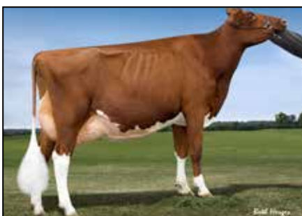
KHW REGMENT APPLE B-RED-ETN EX-90 2ND DAM OF LOT 6