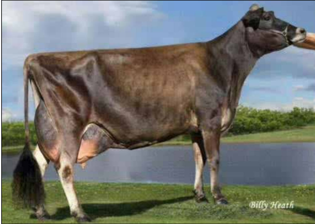
ARETHUSA VIBRANT IMPRESSION EX-93 DAM OF LOT 61