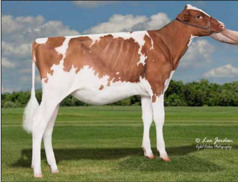
TOPP GUNS WAR HAPPENING-RED SELLS AS LOT 4