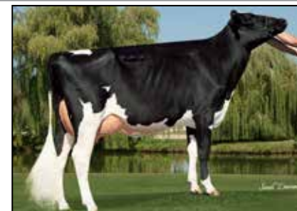
NISE-N-FANCY DBACK WILBER EX-90 EEEEE 2ND DAM OF LOT 29

144860959 99%RHA-I Excellent-90 EEEEE 2-02 2x 365d 26840 3.4 904 2.8 739 3-04 2x 305d 21120 4.0 838 2.8 601