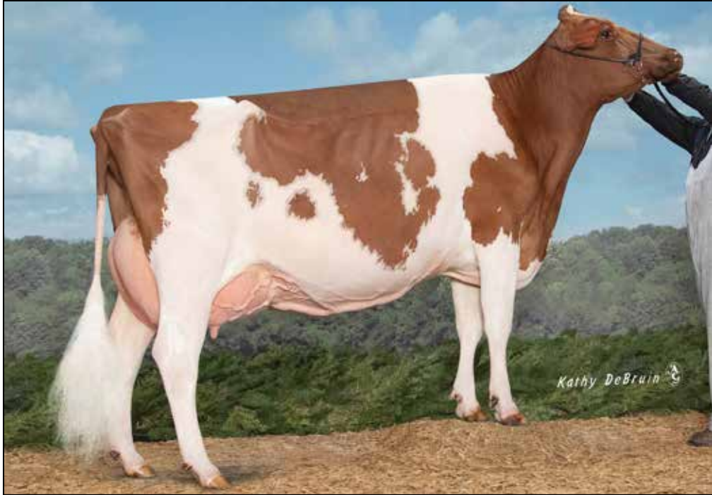
MISS DISARONNO-RED EX-94 EEEEE 2E DAM OF LOT 22