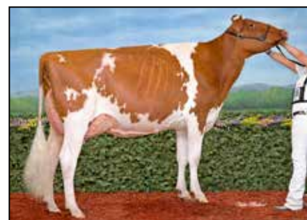
WEEBERLAC TICKLE ME RED VG-89-CAN 91-MS 2ND DAM OF LOT 34