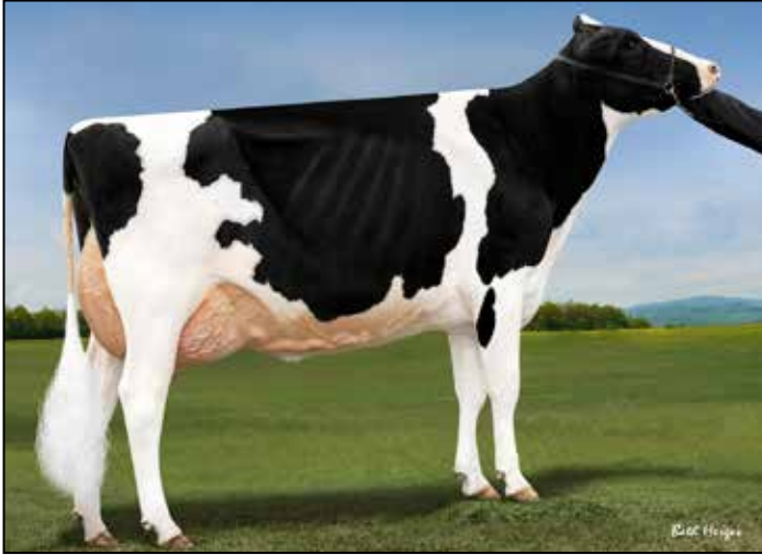
HEZ HEZBOLLAHS HONOUR-ET EX-94 DAM OF LOT 10