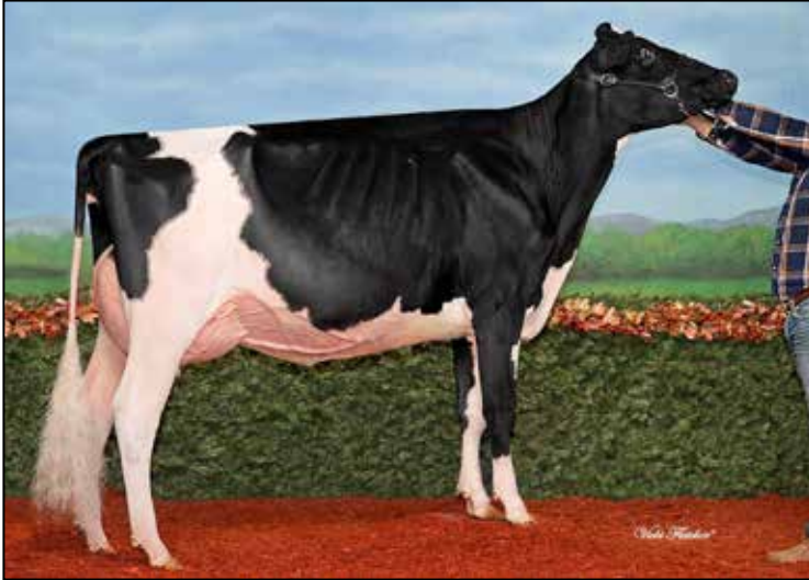
JACOBS GOLDWYN ALIZA-ET VG-88-CAN 2ND DAM OF LOT 14