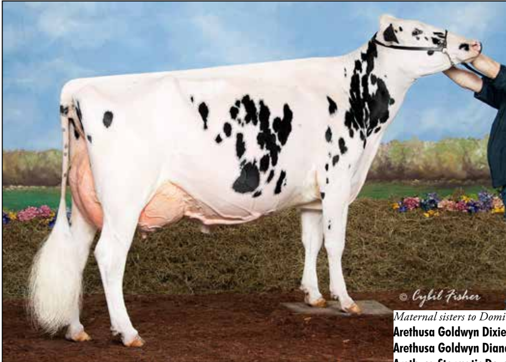
ARETHUSA SANCHEZ DICE-ET EX-96 EEEEE 3E DAM OF LOT 13