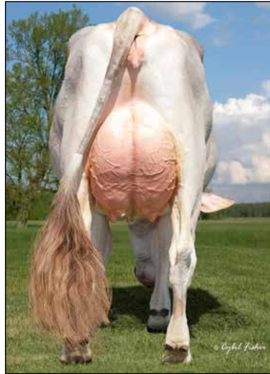
HARTMANHILLS DURHAM CHARISMA EX-91 DAM OF LOT 81