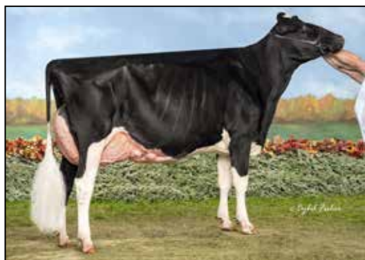
KAMPS-RX APPLEB AMERICA EX-94 MAX FULL SISTER TO DAM OF LOT 6