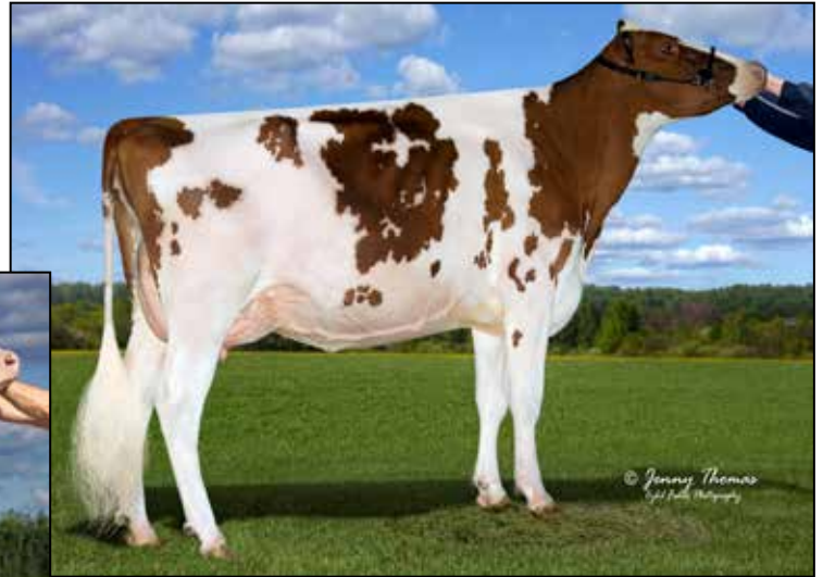
JO-LAN CONTENDR FIRE-RED-ET VG-87 VG-MS 3RD DAM OF LOT 24