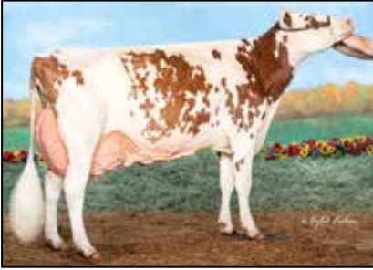
L-MAPLES DFNT CASSEY-RED-ET EX-94 EX-MS 2E MATERNAL SISTER TO LOT 19