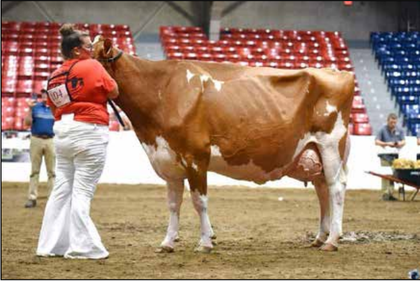
MS DAISY MAE-RED EX-94 EX-MS 3E DAM OF LOTS 7A & 7B