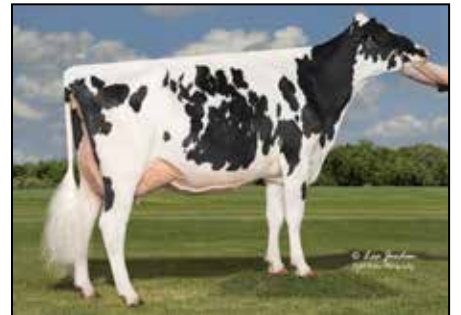
TE-LOU BRAXTON CRISTINA EX-90 EX-MS DAM OF LOT 50