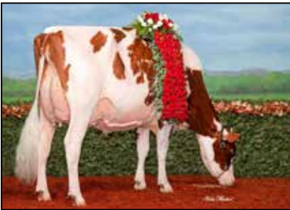
L-MAPLES HVEZDA CALLI-RED EX-94 2E EEEEE MATERNAL SISTER TO LOT 19