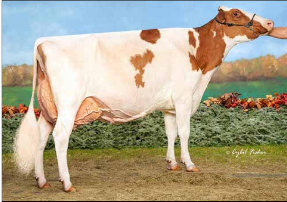
RYEARSON RAINY RAZZY-RED EX-94 EEEEE 2E DAM OF LOT 23