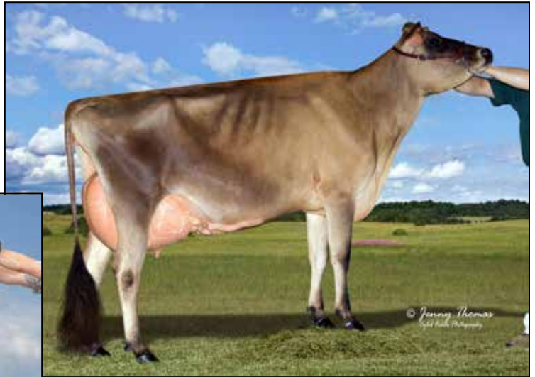
SSF GOVERNOR IRIS EX-93 3RD DAM OF LOT 64