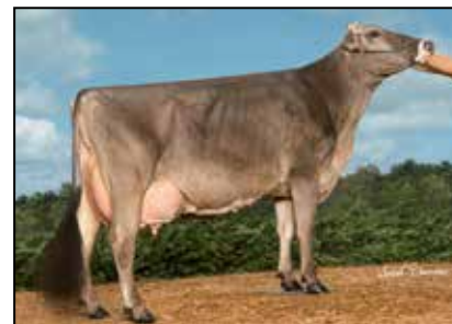
JONLEE SECRET LANGWATHBY EX-94 2E 3RD DAM OF LOT 74