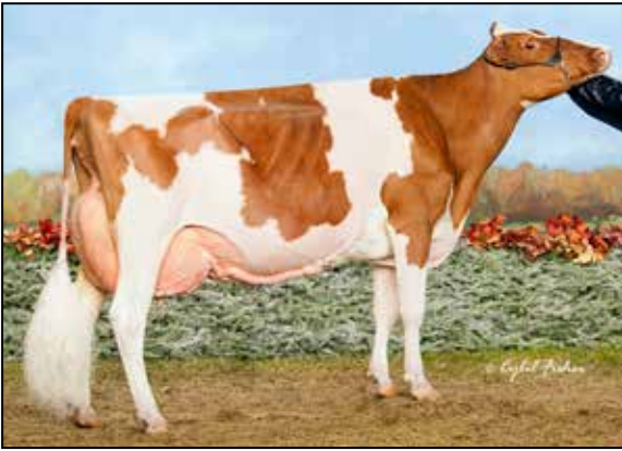
HILROSE ADVENT ANNA-RED-ET EX-95 EEEEE 2E GMD 3RD DAM OF LOT 18