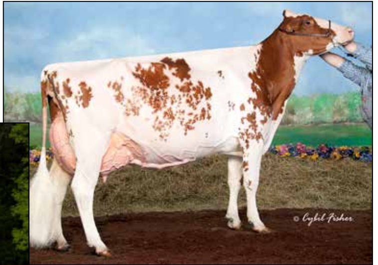
BLONDIN REDMAN SEISME-RED-ETS EX-97 EEEEE 2E 2ND DAM OF LOT 11