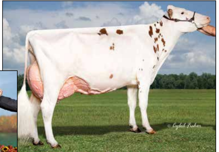
MS ROLL-N-VIEW ALTHEA-RED-ET EX-94 EEEEE 2E DAM OF LOT 5