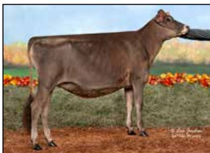
GORDONS JOEL GRACIOUS SAME FAMILY AS LOT 70