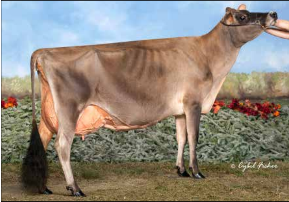
ARETHUSA VERONICAS COMET-ET EX-95 5TH DAM OF LOT 63