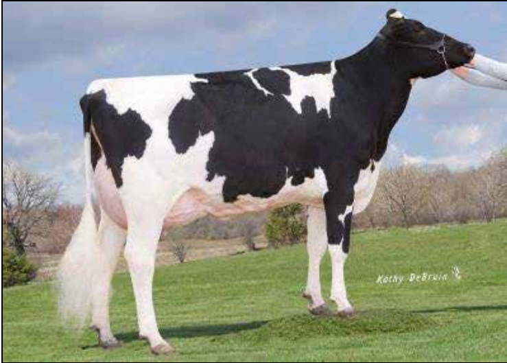
GLORYLAND-LB LINETTE RAE-ET EX-94 EEEEE 3E DOM 3RD DAM OF LOT 30