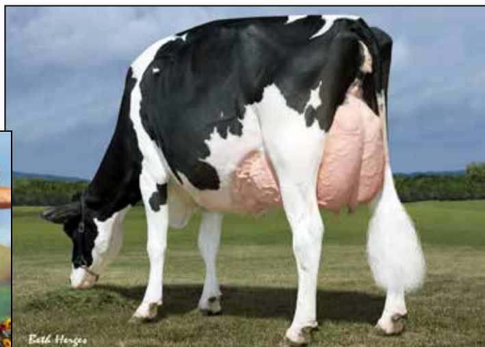
LUCK-E ADVENT ASIA-ET EX-94 EEEEE 3E 2ND DAM OF LOT 8