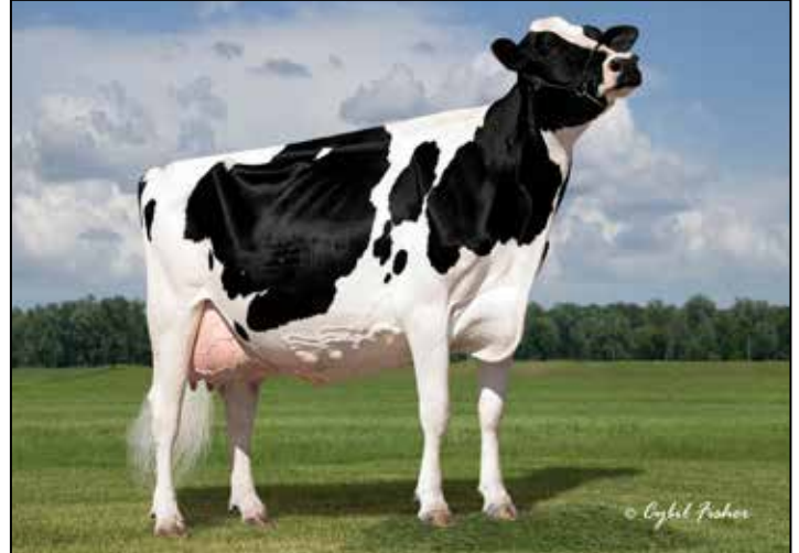
DEBEAU DUNDEE HEZBOLLAH EX-92 EEEEE 2ND DAM OF LOT 10