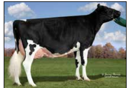
NISE-N-FANCY ATTIC SAVANNAH EX-91 EEEEE 2ND DAM OF LOT 43

145591304 99%RHA-I Born: June 10, 2023 • Herd No. 52