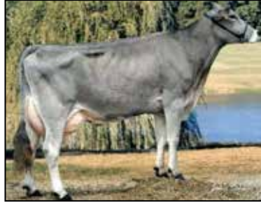
MT MORIAH ZOLDO ZEST 2E-93 4TH DAM OF LOT 77

Registration Pending Born: September 24, 2023