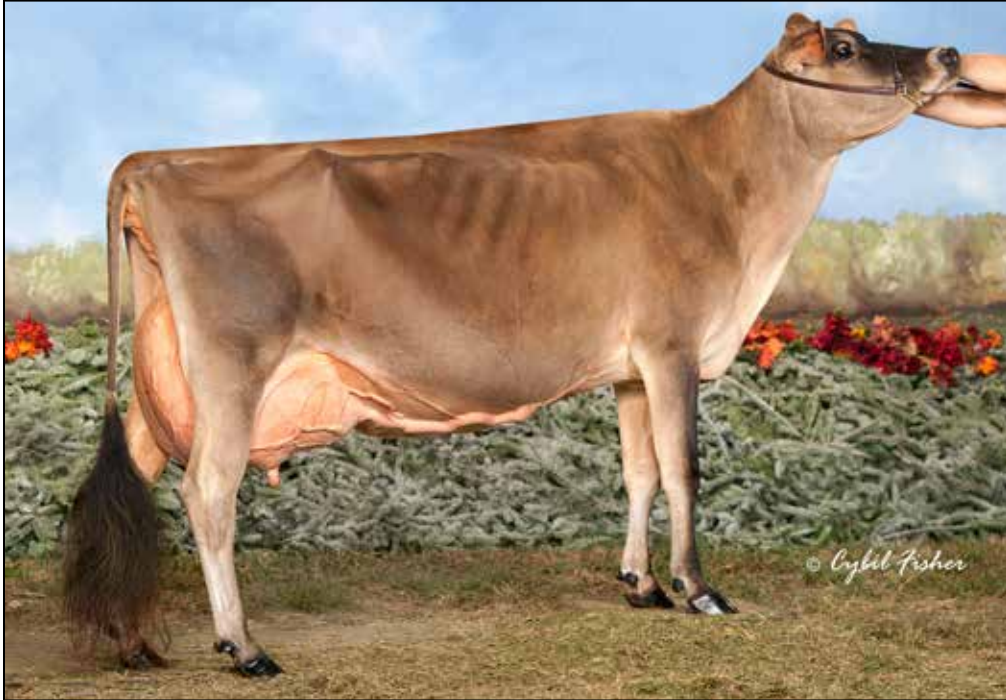
ARETHUSA VERONICAS CUPID EX-94 5TH DAM OF LOT 62