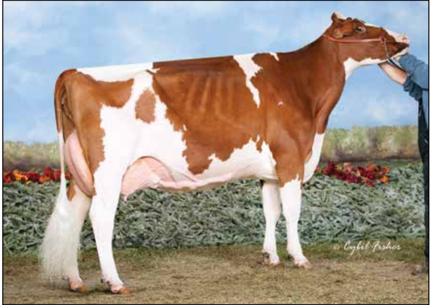
L-MAPLES ADVENT CAIT-RED EX-91 EX-MS 3E DAM OF LOT 19