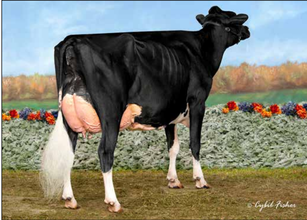
JACOBS SID BEAUTY-ET EX-95 EEEEE 2ND DAM OF LOT 12