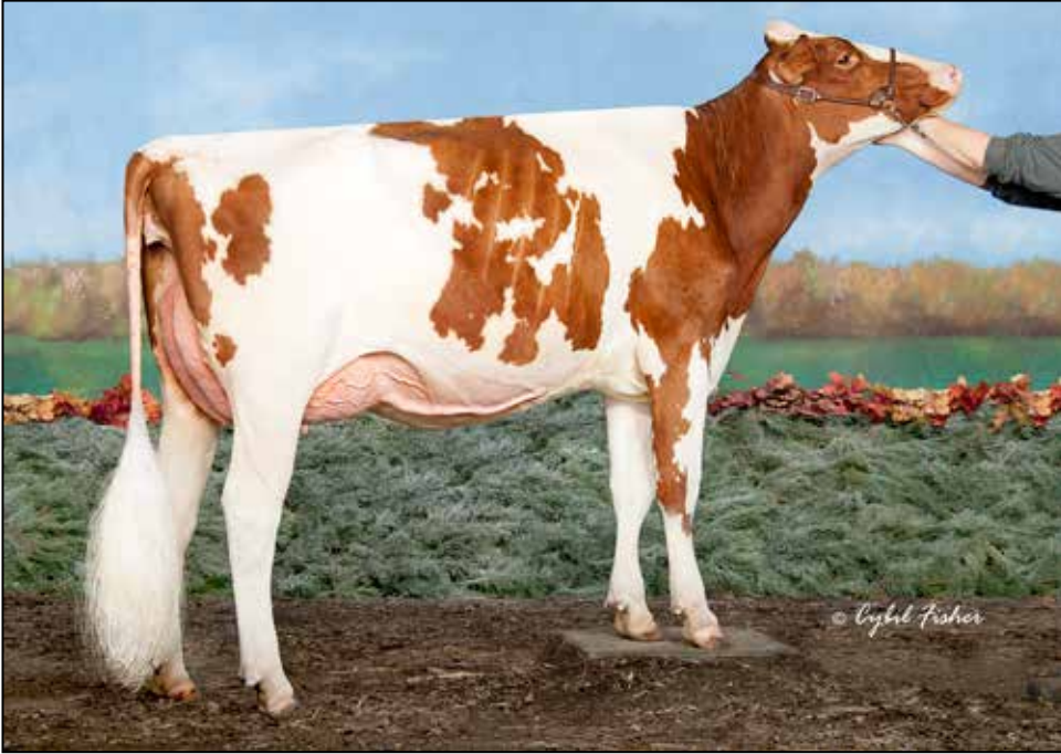
APPLE-PTS ALESSA-RED-ET EX-91 EX-MS DAM OF LOT 3