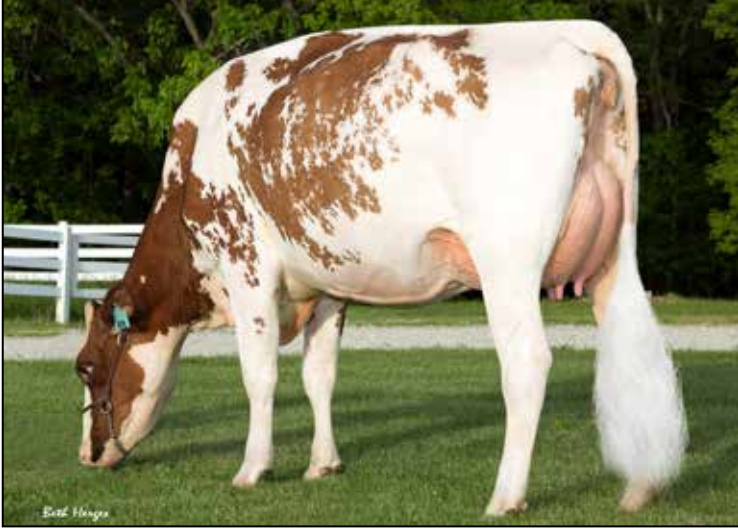
MILKSOURCE LD SHANIA-RED-ET EX-92 EX-MS 2E DAM OF LOT 11