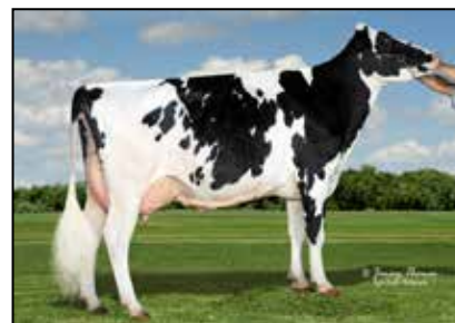
PAUL-FARM SHOTTLE DOLLY-ET EX-90 EX-MS 3RD DAM OF LOT 33

840003274841619 99%RHA-I *RC Born: December 2, 2023 • Herd No. 474