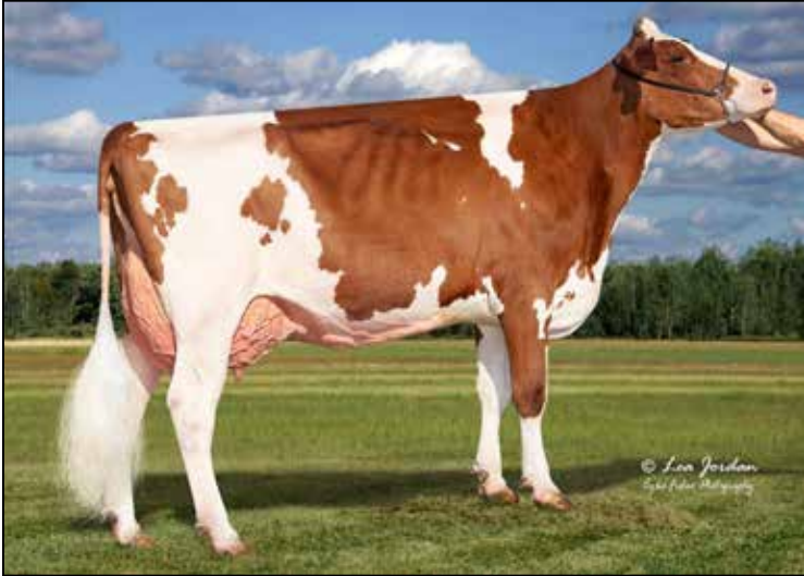
ENTOURAGE-LC CP FROLIC-RED EX-94 MATERNAL SISTER TO 2ND DAM OF LOT 24