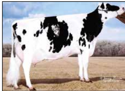
ONEEDA BLITZ KIZZY KAY EX-90 GMD 6TH DAM OF LOT 40

145651305 99%RHA-I *RC *PO Born: December 1, 2023