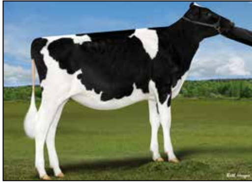
OAKFIELD TATOO FANCYLIKE-ET DAM OF LOT 1