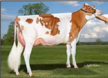
HILROSE ALTITUDE AUDI-RED-ET EX-91 MATERNAL SISTER TO 2ND DAM OF LOT 18