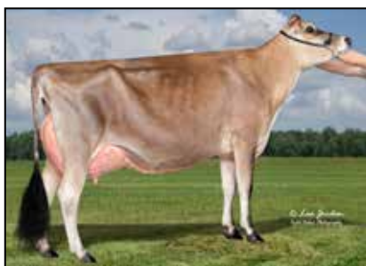
GORDONS VIP GRACEFUL EX-92 MATERNAL SISTER TO DAM OF LOT 70