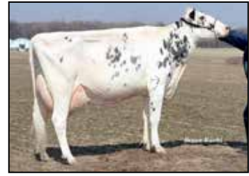
STAR-SUMMIT LINDY SWEET EX-94 EEEEE 3E GMD DOM 4TH DAM OF LOT 37

840003247059495 99%RHA-I Born: March 4, 2023 • Herd No. 701