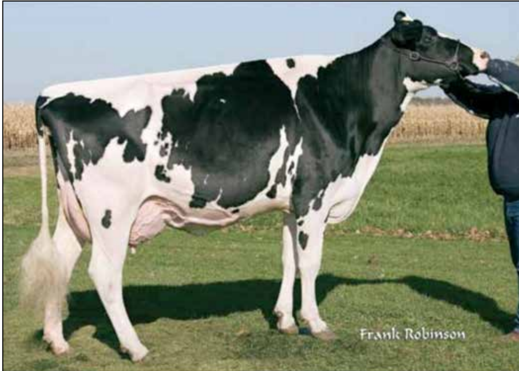
DEBELLO-HILLS CHARDONNAY EX-92 EEEEE 2E 4TH DAM OF LOT 46