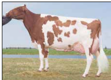
BUCKHORN-ACRES RITA-RED-ET EX-94 EEEEE 2E 7TH DAM OF LOT 57