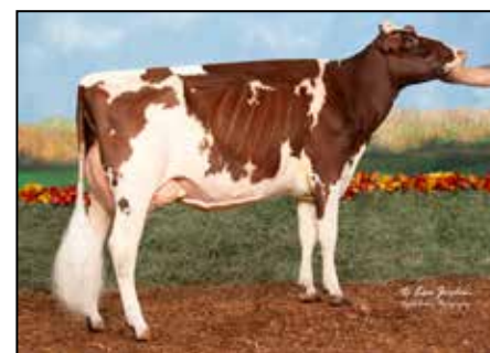
MOLEHILL MYKOLA MYRTLE EX-90 MATERNAL SISTER TO LOT 87

Registration Pending Born: September 2, 2023