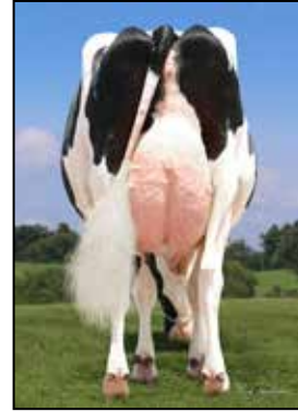
OUR-FAVORITE UNLIMITED-ET EX-94 EEEEE 3RD DAM OF LOT 9