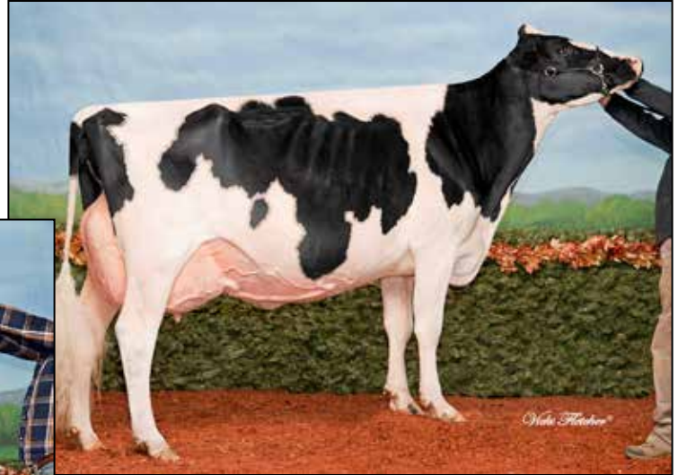
CRASDALE DUNDEE LISA VG-89-CAN 89-MS 3RD DAM OF LOT 14