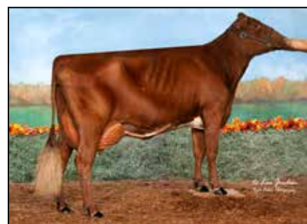
MYSHA-WO NASTIA EXT EX-91 2ND DAM OF LOT 86