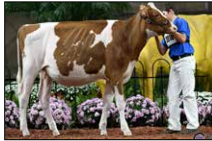
HILROSE UNSTOP ADELA-RED-ET MATERNAL SISTER TO 2ND DAM OF LOT 18