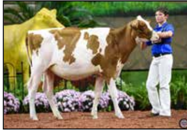
HILROSE UNSTOPABULL ADHA-RED-ET MATERNAL SISTER TO 2ND DAM OF LOT 18