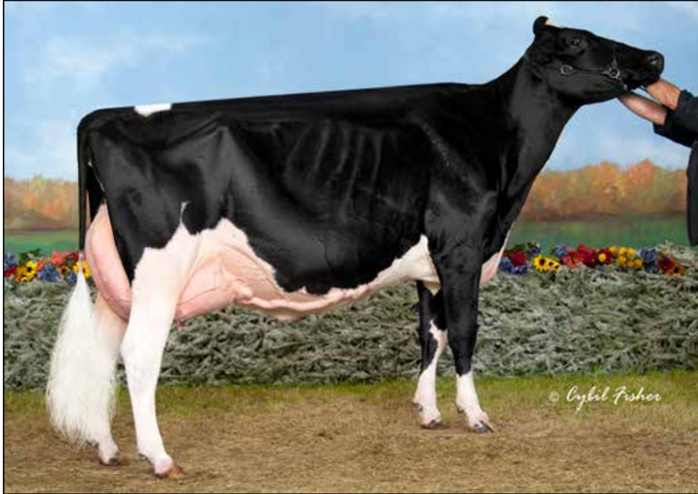
CRAIGCREST RUBIES GOLD REJOICE EX-94 EEEEE 4TH DAM OF LOT 17

All-American & All-Canadian Sr 2-Yr-Old 2011 Res. Int. Champ WDE 2010 Jr Champ WDE 2010