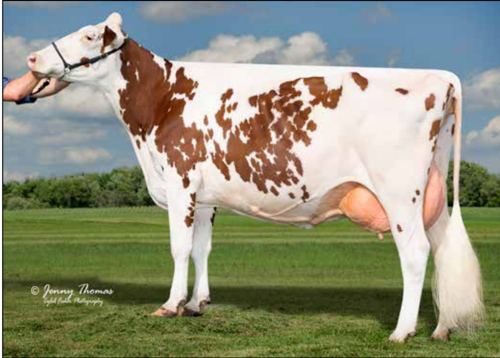
NISE-N-FANCY STOP SIGN-RED EX-92 EEEEE 2E 3RD DAM OF LOT 44