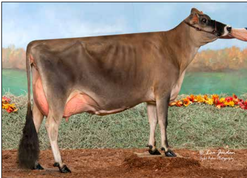
CLOVERFIELD GOLDHAMMER GRACE EX-91 2ND DAM OF LOT 70