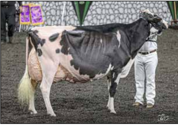
OAKFIELD SOLOM FOOTLOOSE-ET EX-97 98-MS 2E 2ND DAM OF LOT 1