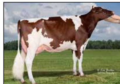
LEANN-ACRES PORSCHE-RED-TW EX-92 MATERNAL SISTER TO LOT 35

• All-IN Sr 2-Yr-Old 2021 • Res. All-IN Fall Yrlg 2020