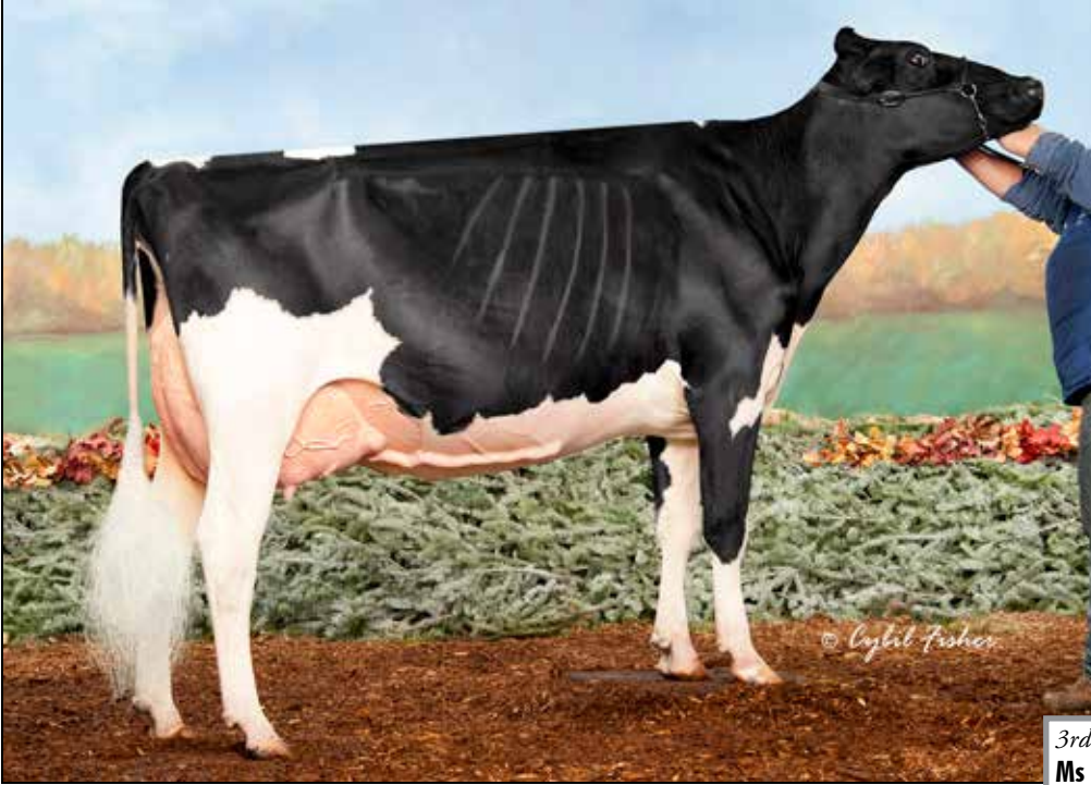
MS LISTERINES LOOK-AT-ME-ET EX-95 FULL SISTER TO 3RD DAM OF LOT 41