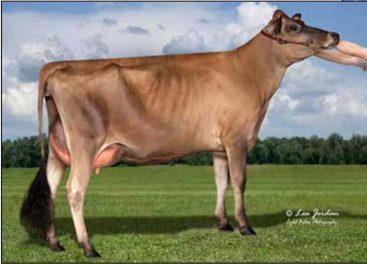
GORDONS COLTON ISADORA EX-90 DAM OF LOT 64