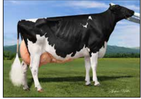
OUR-FAVORITE ENDLESS-ET EX-95 EEEEE 3E 2ND DAM OF LOT 9