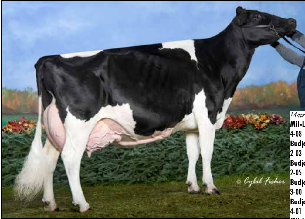
KRULL ENCORE ELSIE-ET EX-94 2E 2ND DAM OF LOT 25