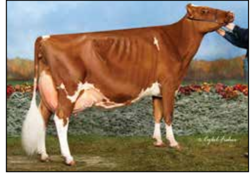
MS DELICIOUS APPLE-RED-ET EX-94 EEEEE 2E 3RD DAM OF LOTS 7A & 7B