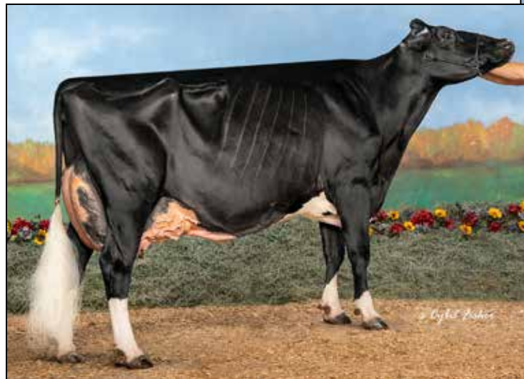
LUCK-E DIAMOND ALLURE-ET EX-94 EEVEE 2E MATERNAL SISTER TO DAM OF LOT 8