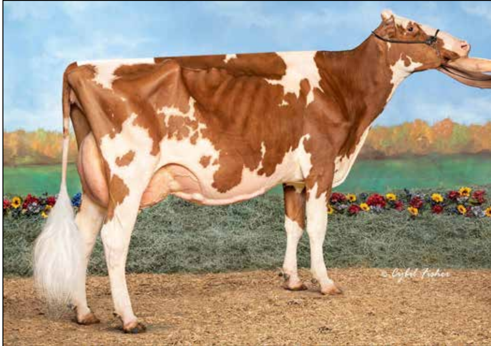
APPLE-PTS APPLEJACKS-RED-ET EX-93 EEEEE 2E MATERNAL SISTER TO DAM OF LOT 2