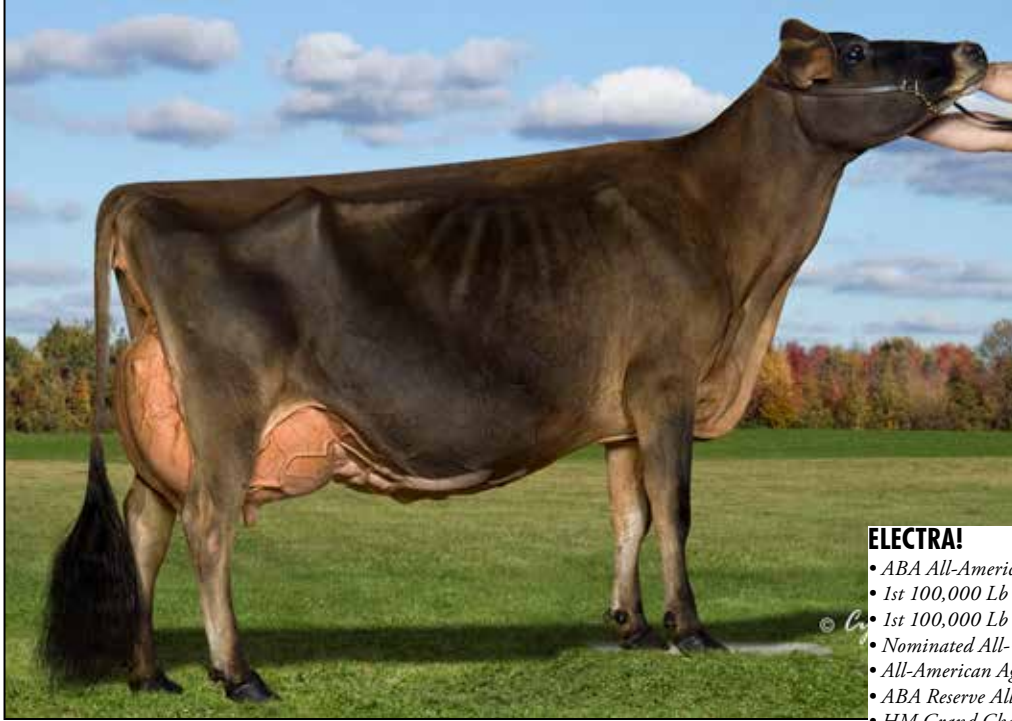
EXTREME ELECTRA EX-95 3RD DAM OF LOT 65