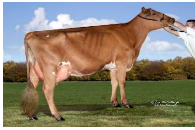
Same family as lot #'s 51, 60, 63, 64, and 444