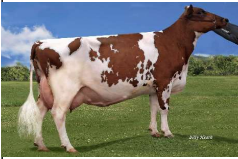
Vales-Pride Supreme Jewel