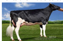
*EX93 Dams & Gr. Dams of many on sale*