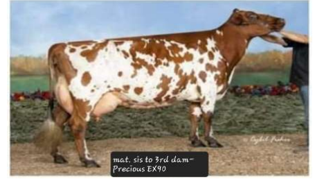
mat. sis to 3rd dam - Precious EX90