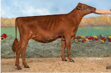
Junebug sells as lot 462

Same family as lot #'s 38 , 39 , 41, 45, 48, 55, 460, 461, 462, and 464