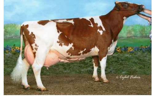
Excellent Vales-Pride Tri-Majic

Same family as lot #'s 38 , 39 , 41, 45, 48, 55, 460, 461, 462, and 464