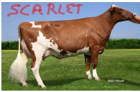
Dam of Jasper + Jamaica