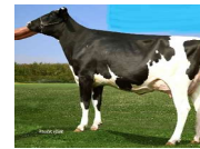
* EX91 Jedi Jamaica sells!

*Nd-Druvale has decided to downsize their herd and sell some of their exciting breeding stock!