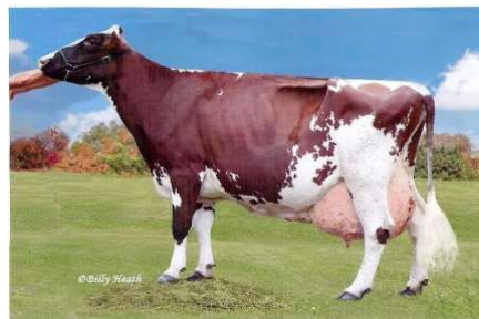
EX93 4E Same family as lots# 70, and 446