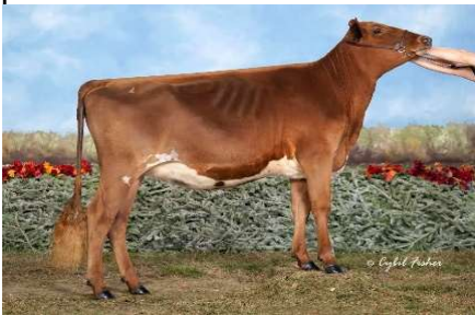
Odeilia EX! See front of catalog.