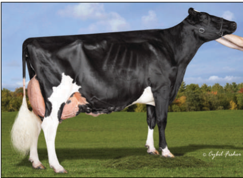
Maternal Sister to 2nd Lot 123 HAZELS GLDWN HATTY-ET 3E-96 9Y EEEEE Elite Performer 2019 NE Fall National Grand Champ 1st 150,00 lb NE Fall National 2019, 2017