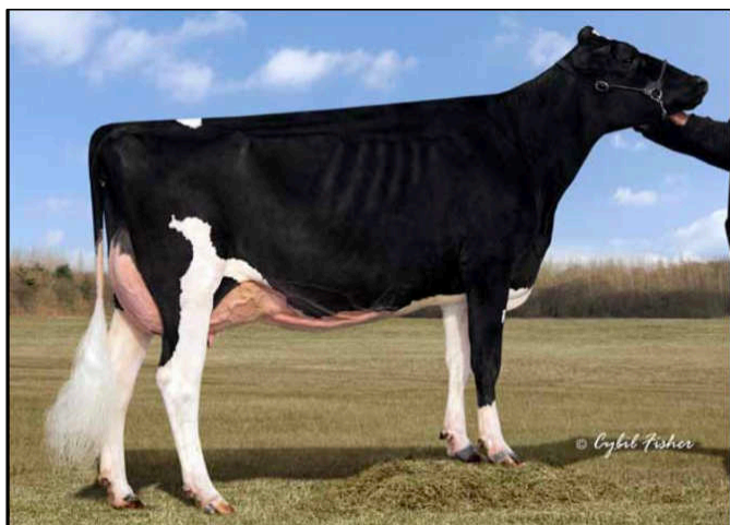
4th Dam Lot 126 MILK&HONEY TALENT MEG 4E-94 EEEE 13Y 1st Northeast Fall Nat'l 150,000 lb 2016

5th Dam: MILK&HONEY ZENITH MAGGIE VG-88 4Y VEV+F 2-02 365 23800 4.5 1069 3.2 762 4-04 365 33130 4.5 1485 3.0 995