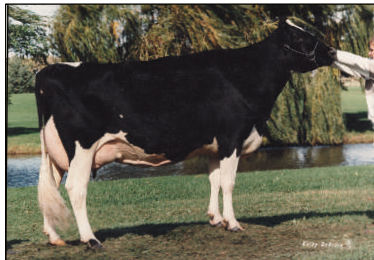
5th Dam Lot 125 SNOW-N DENISES DELLIA (2E-95 GMD DOM)

6th Dam: Snow-N Dorys Denise (2E-90 GMD DOM) 5-09 365 33350 3.8 1256 3.1 1038