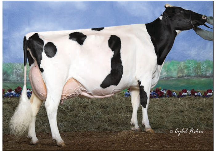
3rd Dam Lot 123 / 4th Dam Lot 124 QUALITY-RIDGE STORMI HAZEL (2E-96 EEEEE) Nom. All-American 7 consecutive years