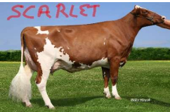
Dam of Jasper + Jamaica