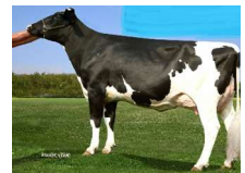
* EX91 Jedi Jamaica sells!

*Nd-Druvale has decided to downsize their herd and sell some of their exciting breeding stock!