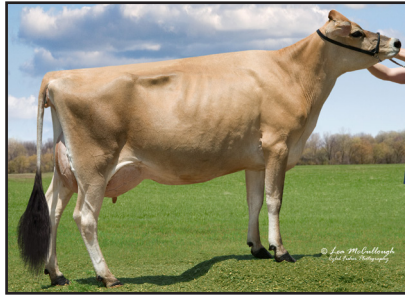
Sar Chairman Allure "EX-94" Fourth Dam of Lot 15