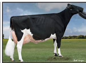
Harvue Roy Frosty "3E-97" GMD Sixth Dam of Lot 11