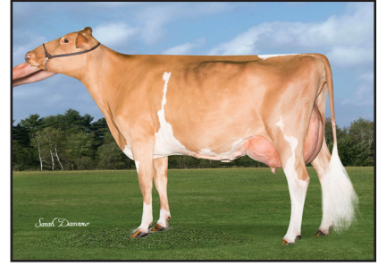
Hartdale Kringle Clementine "EX-91" Maternal Sister to Dam of Lot 27

Gladheart Michelangelo 3206246837 A2/A2 54GU502 PTA +656M +1F +17P 66R 12/23 PTA +0.5T +0.2UDC +0.6FLC GPTI +14