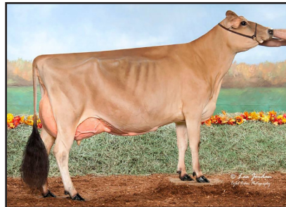
Reich-Dale Sambo Secede-ET "EX-92" Dam of Lot 20

Reich-Dale Joel Seclusive-ET EX-93% Reich-Dale Topeka Slammin VG-87% 2-05 2x 305d 16,300 5.0 821 3.5 566