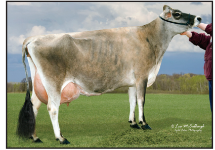
Sar Apollo Allure "EX-91" Fifth Dam of Lot 15