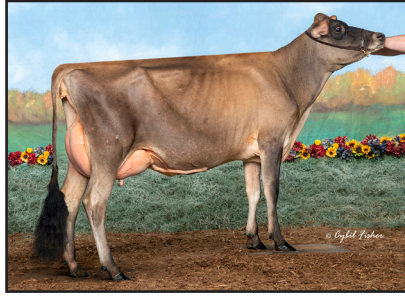
Hearts Desire Magician Faith "VG-87" Dam of Lot 13