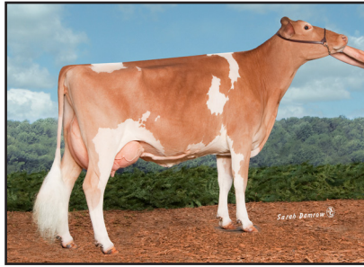
Hartdale Alstar Cutie "2E-93" Granddam of Lot 29