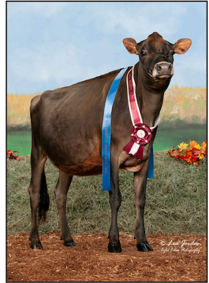
Pride Rock Victorious Secret-ET Res. AJCA All-American Winter Yearling 2023

173228432 EX-90% •3rd Fall Call All-American Junior Show 2018 S: J-Kay Tequila Fizz