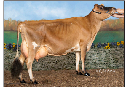
Hearts Desire Primtime Fantastic-ET "EX-95" Granddam of Lot 13