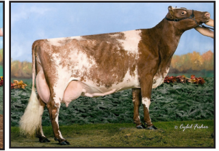
Sunshine Frolic Dorothy "3E-95" Full Sister to Dam of Lot 21