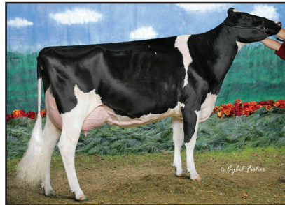
MD-Delight Durham Atlee-ET "EX-92"

CAN14641913 • Born May 12, 2023 H.N. 368 SPRING YEARLING