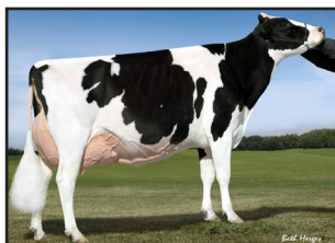
Harvue Dundee Foxy-ET "2E-92" GMD Fifth Dam of Lot 11