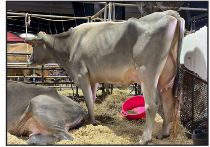
Heiz-Acres Rich Jellyfish "VG-87" Dam of Lot 25

68210717 3/06 'V87' V86 E90 V88 V87 V85 •Res. Grand Champion NC State Fair 2023 S: Jo-Dee Nemo Richard-ET