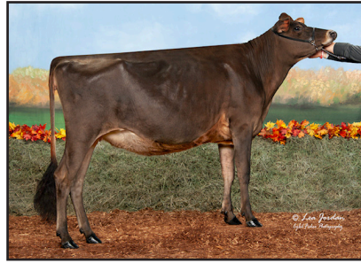
Pride Rock Victorious Secret-ET Maternal Sister to Lot 17