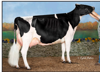
Harvue Atwood Emily Ann "2E-94" Third Dam of Lot 6

840 3272813975 • Born September, 2023 FALL HEIFER CALF