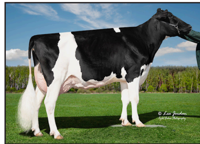
Klinedell Brady 1074 "EX-90 EX-MS" Dam of Lot 4

840 3283517060 • Born September 1, 2023 H.N. 162 FALL HEIFER CALF