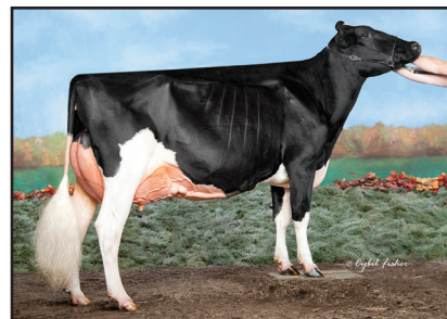
Oakfield Goldwyn Daisy-ET "2E-94" Dam of Lot 8

Oakfield Goldwyn Daisy-ET 3134444794 Excellent-94 EEEEE 2E *TR *CD GPTA +2.04T +1.45UDC +1.54FLC 85R 12/23 4-05 2x 365d 42,090 3.3 1388 3.1 1319 3-03 2x 311d 32,540 3.5 1146 3.2 1037 Life: 1068d 102,430 3.5 3617 3.2 3274 •HM Jr. All-PA 5 Year Old 2022 •2nd 5 Year Old Mideast Spring Natoinal 2022 •HM Sr. Champion Central PA Champ. Jr. Sh. '22 •1st Sr. 2 Year Old WNY Spring Preview 2019 •4th Sr. 3 Year Old New York State Show 2020 •6th Sr. 3 Year Old North American Open 2020 •Member All-American Produce of Dam 2020 •Member All-American Best 3 Females 2020 S: Braedale Goldwyn