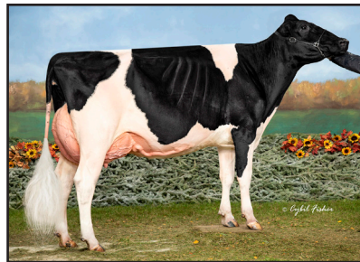
OCD Crushable Sidekick-ET "EX-92" Dam of Lot 10

GPTA +3.10T +2.58UDC +.96FLC 78R 12/23 A1/A2 • BE