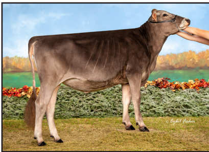
Round Hill Cadence Wave-ETV Dam of Lot 23

68229201 • Born September 1, 2023 Tattoo J381 PT DT MT WT BH2T BH14T FALL HEIFER CALF