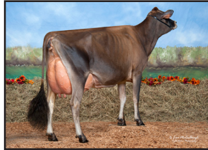
Ratliff Action Dazzle-ET "EX-93" Fourth Dam of Lot 19