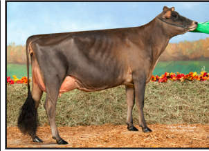
Her-Man Metalica Dazzle Dream-ET "EX-90" Daughter of Action Dazzle

Reich-Dale 7236 Hades Church Rd. Chambersburg, PA 17201-9344 717.263.1705 srgenetics20@gmail.com