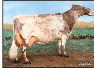
HC-HP Frolic Dixie-ET "4E-E94" Dam of Lot 21