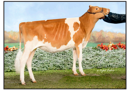
Hartdale Axel Cappucino Maternal Sister to Lot 29