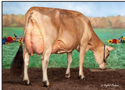
Klinedell TL Colton Jazzie-ET "EX-93" Dam of Lot 16

•Nom. ABA Jr. All-American Summer Yrlg. 2018 •4th Summer Yrlg. All-American Jersey Jr. Sh. '18 •4th Summer Yrlg. PA All-American Jr. Show 2018