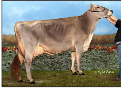
Top Acres Garbro Wanda-ET "EX-91" Granddam of Lot 23