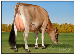
Her-Man Mozart Dazzle Desire-ET "EX-94" Daughter of Action Dazzle

Her-Man Craze Damsel VG-81% 2-03 2x 212d 9,970 5.3 533 3.7 369 Her-Man Scout Dazzles Darling-ET VG-85% 2-00 2x 284d 12,360 4.9 604 3.7 456 Ratliff Action Dazzle-ET EX-93% 3-08 2x 305d 20,000 4.1 811 3.8 756 •Premier Performance Cow All-American 2012 Arethusa Primetime Deja Vu-ET EX-95% 6-10 2x 305d 19,060 6.4 1220 4.2 798 •1st Aged Cow Kansas State Fair 2014 •1st Aged Cow & Res. Sr. Ch. KS St. Fr. 2012 •1st 5 Yr Old & Grand Champ. KS St. Fr. 2011 •Nom. ABA All-American Sr. 2 Year Old 2008 Huronia Centurion Veronica 20J EX-97% 5E 6-08 2x 365d 24,442 5.6 1434 3.6 955 •Grand & Supreme Champ. PA All-American 2006 •Grand & Supreme Champ. Int'l Jersey Sh. 2006 •Supreme Champion PA All-American 2005 •Grand Champion Int'l Jersey Show 2004 & 2005 •National Grand Champion 2004 •All-Canadian Sr. 2 Year Old 2002 Genesis Renaissance Vivianne VG-87-CAN 7* Genesis Juno Virginia EX-92-6E-CAN 4* Swissbell F Veronica 39M SUP EX 4* Swissbell Ella Virginia EX-90 Swissbell Virginia SUP EX-90 Belmont Jester Virginia SUP EX