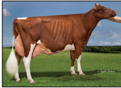
Parkvue Absolute Rap-Red-ET "3E-94" Granddam of Lot 5