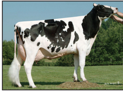
Astrahoe R Lorenzo Rachel "EX-90 EX-MS" Fourth Dam of Lot 3