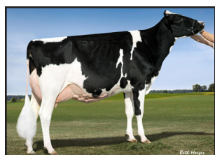
Harvue Goldwyn Foxy Lady-ET "3E-94" Fourth Dam of Lot 11

Remrose Solomon Flame-ET VG-87 3-08 2x 328d 20,700 3.7 759 2.8 584 Harvue Braxton Firefly-ET EX-90 EX-MS 4-09 2x 365d 47,140 2.9 1388 2.9 1376 •1st VA Milk and 2nd VA Protein Life: 1363d 135,900 3.0 4114 2.9 3981 Harvue Goldwyn Foxy Lady-ET EX-94 4E 7-03 2x 365d 42,560 4.2 1795 3.3 1407 Life: 3341d 302,520 4.1 12410 3.2 9590 Harvue Dundee Foxy-ET EX-92 2E GMD 6-00 2x 340d 34,340 3.6 1248 3.3 1120 Life: 2498d 191,940 3.8 7270 3.4 6472 Harvue Roy Frosty EX-97 3E GMD 5* 5-07 2x 365d 44,710 5.0 2222 3.0 1332 Life: 2285d 217,250 4.8 10507 3.0 6447 •Supreme Champion WDE 2009 & 2010 •All-American Aged Cow 2010 •1st Aged Cow & Grand Champ. Int'l Show 2010 •Unanimous All-American 5 Year Old 2009 •1st 5 Yr Old & Gr. Ch. Int'l Hol. Show 2009 •Unanimous All-Canadian 5 Year Old 2009 •1st 5 Yr Old & Res Gr. Ch. RAWF 2009 •All-American Senior 3 Year Old 2007 •Int & Res Grand Champ. International Sh. 2007 Harvue Sam Heidi EX-93 3E DOM Harvue Skybuck Harmony VG-88 Harvue Melvin Hallie VG-86 Harvue Bell Harrison VG-86 GMD DOM Harvue Libido Harrison VG-87