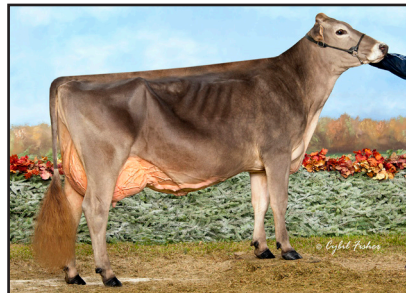
Cutting Edge A Ruby "EX-90" Dam of Lot 22

Maternal sister to Rhapsody: Edge View D Rylee-ETV 'V85' VG-MS 1-11 2x 147d 9,654 4.0 386 3.5 336"RIP •National Junior Bellingringer Milking Yearling 2023 •Nom. All-American Milking Yearling 2023 •1st Milking Yearling International Jr. Show 2023 •5th Milking Yearling International Show 2023