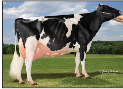
Toppglen Atwood Waki "3E-94" Dam of Lot 1