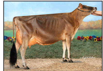
Reich-Dale Vaden Strollin "EX-94" Same Cow Family as Lot 20