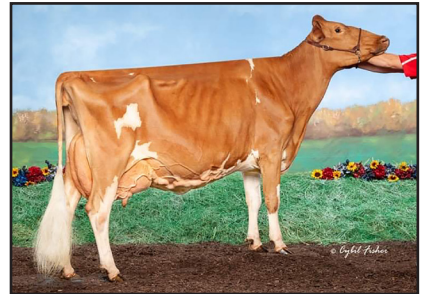
Oakland Latimers Prestidge "2E-94" Dam of Lot 28

Oakland Latimers Prestidge 3131521611 Excellent-94 2E A2/A2 PTAT: +2.3 +2.0UDR +4.0FLC 73R 12/23 4-02 2x 365d 24,120 4.5 1080 3.6 873 5-05 2x 349d 21,700 4.7 1026 3.8 825 3-00 2x 364d 20,470 4.7 958 3.6 738 •#1 PTAT Cow December, 2022 •HM Jr. All-American 5Year Old 2021 •Nom. All-American 5 Year Old 2021 •HM Jr. All-American Sr. 3 Year Old 2019 •Nom. All-American Sr. 3 Year Old 2019 •Nom. Jr. All-American Sr. 2 Year Old 2018 •Nom. Jr. All-American Winter Yearling 2017 S: Coulee Crest Fame Latimer-ET