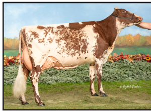
Hard Core MD Justice Dinah Exp "EX-92" Maternal Sister to Lot 21