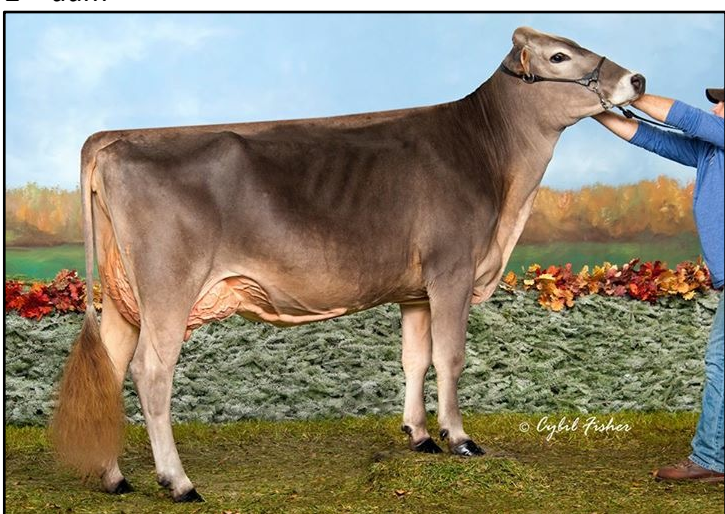
Cutting Edge Thunder Faye EX94 @4 yrs (max score) All American Sr 3, All American Sr 2 Member of 2019 All American Produce of Dam