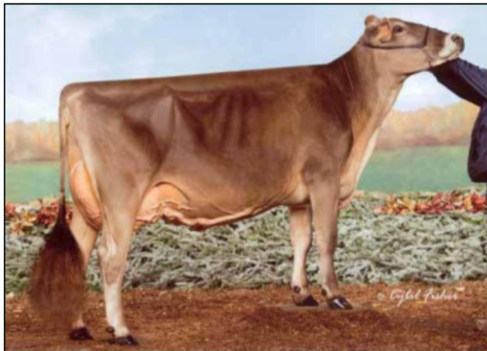
Cutting Edge Fawn EX93

Member of 2019 All American Produce of Dam