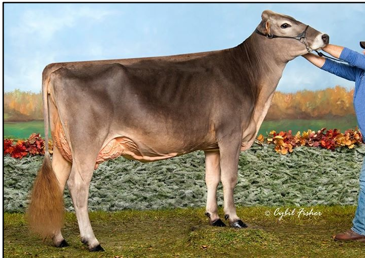
Cutting Edge Thunder Faye EX94 @4 yrs (max score)