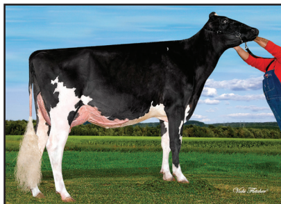
Ms Licorice GC Lovely-ET "VG-88" 5* (Third Dam of Lots 26 & 28 - 31)

Ms Listerines Look At Me-ET EX-95 2E 6-03 2x 365d 34,790 4.1 1417 3.2 1118 •HM All-American Jr. 3 Year Old 2018