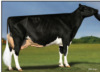
Savage-Leigh Golden Girl-ET "2E-92" Res. All-American Milking Yearling 2014 (Granddam of Lot 38)

840 3275827596 • Born April 13, 2023 99%RHA-I ID 5