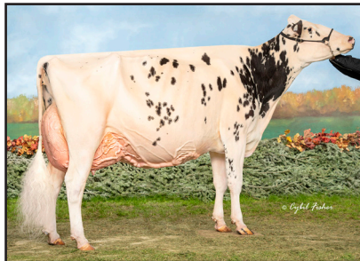
Erbacres Snapple Shakira-ET *RC "3E-97"