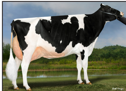
Ms Sid Blexy-ET "EX-94" HHM All-American Jr. 3 Year Old 2020 (Dam of Lot 7)

Blexys Chief Bloody Mary-ET •1st Milking Yearling International Show 2023 Blexys Kngdoc Brilliant-ET VG-86 •Nom. All-American Winter Yearling 2022 Blexys Crush Budweiser-ET EX-91 •Unanimous All-American Winter Yearling 2020 •All-American Winter Calf 2019 Ms Blexys Bounty-ET EX-92 2E 4-09 3x 365d 40,260 4.4 1756 2.9 1171