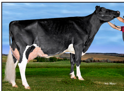
Jacobs Goldwyn Bethaly-ET "EX-91 4E" (Dam of Lot 5)

Jacobs Destiny Balla-ET VG-89 •Nom. All-American Summer Jr. 2 Year Old 2023 •1st Summer Jr. 2 Year Old Royal Winter Fr. 2023 •Int. Champion Royal Winter Fair 2023 •1st Summer Jr. 2 Year Old International Sh. 2023