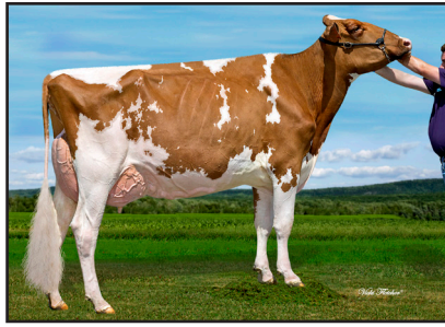
Blondin Avalanche Lovelyn-Red-ET "VG-89" (Dam of Lots 26 & 28 - 31)

CAN121174668 • Born June 4, 2022 ID 4668 Bred 11/22/23 to Golden-Oaks Tango-Red-ET 712HO1018 (sexed semen)