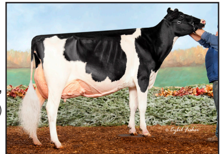
Lingle Gold Freaky Girl-ET "EX-93" (Dam of Lot 62)