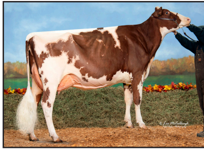
Rosedale Rumor Hasit-Red-ET "2E-94" HM All-American R&W Sr. 3 Year Old 2016 (Granddam of Lot 24)