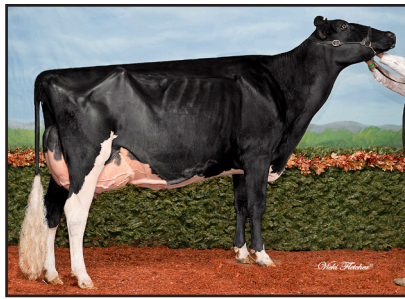
Jacobs Goldwyn Britany-ET "2E-96" Holstein Canada Cow of the Year 2017 (Granddam of Lot 3)

Jacobs High Octane Babe-ET EX-94-5Y-CAN 5-00 2x 365d 40,710 4.1 1660 3.1 1250 Life: 3 lact. 124,796 4.1 5172 3.2 4043 •All-Canadian 5 Year Old 2022 •Res. Grand National Holstein Show 2022 •1st 5 Year Old National Holstein Show 2022 •Canadian Champion Sr. 3 Year Old 2020 •HM All-Canadian Sr. 2 Year Old 2019