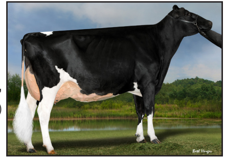
Budjon-Vail Solmn Apache-ET "EX-95" (Dam of Lot 61)