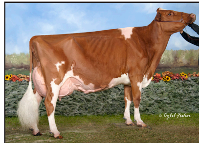
Wilstar-RS Tit Limited-Red "2E-94" Res. All-American R&W Aged Cow 2011 (Granddam of Lots 8 & 10)