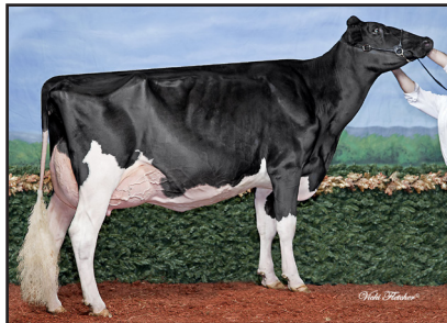
Rockymountain Tal Licorice-ET *RC "EX-95" All-American 4 Year Old 2011 (Fourth Dam of Lots 26 & 28 - 31)

6-03 2x 365d 34,790 4.1 1417 3.2 1118 •HM All-American Jr. 3 Year Old 2018