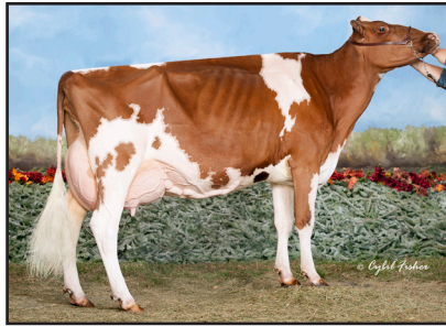
Duchess Advnt Divine-Red-ET "3E-93" Res. All-American R&W 125,000 lb. Cow 2012 (Fourth Dam of Lot 36)

Bred 7/11/23 to Woodcrest King Doc 250HO12961