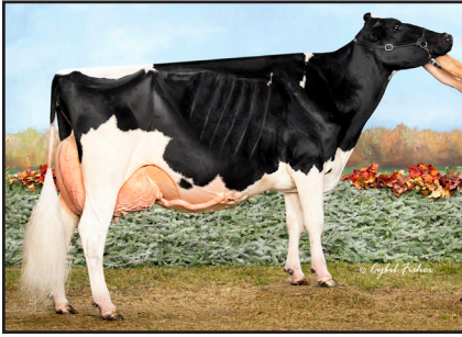
Walk-Era Dundee Annelise "EX-95" (Dam of Lot 58)