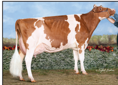
Milgene Advn Jezabel-Red-ET "4E-94" Jr. All-American R&W 4 Year Old 2012 (Granddam of Lot 13)

Bred 6/11/23 to Woodcrest King Doc 250HO12961 (Due 3/20/24)