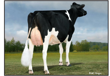
Lylehaven Atwood Lylly-ET "3E-95" (Dam of Lots 42 & 43)

S: Lirr Drew Dempsey 61083609 D: Lylehaven Atwood Lylly-ET "EX-95 3E" 68655585 5-11 2x 365d 41,280 4.4 1831 3.2 1334 8-00 2x 365d 37,190 4.5 1683 3.3 1221 Life: 2794d 224,400 4.7 10467 3.4 7740" •1st 5 Yr Old & HM Sr. Ch. NY Spring Show 2015 •4th Aged Cow Northeast Fall National 2016 •2nd 150,000 lb. Cow Northeast Fall Nat'l 2018 S: Mr Chassity Gold Chip-ET 2D: "EX-94 5E" 6* 5-00 2x 358d 30,190 4.6 1387 3.2 978 3D: "VG-86-6Y-CAN 1**"