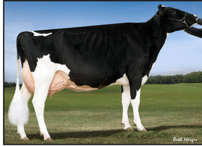
Rosedale Liberty-ET "2E-93" (Granddam of Lot 11)

Ladyrose Caught Your Eye-ET EX-94 (MS:96) •3x International Show class winner in milking form