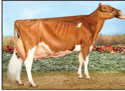
Rosedale Lucky-Rose-Red "2E-94"

•Nom. Jr. All-American Fall Yearling 2020