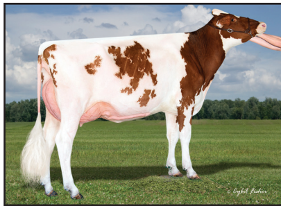
Hilrose Avalnch Addy-Red-ET "EX-92" HM All-American R&W Milking Yearling 2020 (Dam of Lot 19)

•Res. Jr. All-American R&W Winter Calf 2023