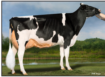
Apple-Pts Amita-ET *RC "EX-93" (Dam of Lot 6)

Miss Apple Snapple-Red-ET EX-96 EEEEE 2E 8-01 2x 332d 46,755 4.4 2055 3.1 1470" •3x Unanimous All-American R&W