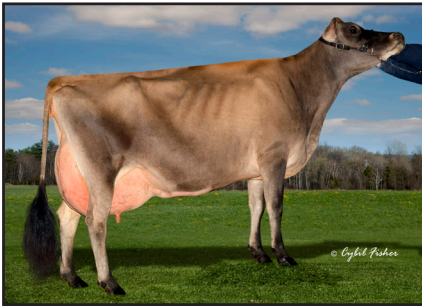
Lost-Elm Action Millie "EX-92" (Dam of Lot 67)