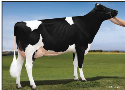
CKO Mogul Aurora-ET "EX-90 EX-MS" (Granddam of Lot 18)

Bred 12/22/23 to Ri-Val-Re Rager-Red-ET 7HO12344