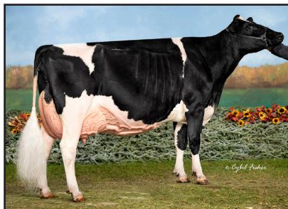
Pierstein Cicero Time Out-ET "EX-96" Res. All-American Aged Cow 2022 (Granddam of Lot 20)

Due 5/10/24 to Kings-Ransom Dropbox-ET 200HO12399 (sexed semen)