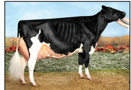
Rosiers Blexy Goldwyn-ET "3E-97" Supreme Champion World Dairy Expo 2017 (Granddam of Lot 7)

3140986188 Excellent-94 EEEVE (MS:96) 4-03 2x 365d 41,910 4.2 1741 3.2 1360 3-04 2x 304d 28,144 4.3 1205 3.2 894 2-03 2x 313d 23,380 3.9 903 3.4 794 •1st 4 Year Old, Senior & Grand Champion, Mideast Fall National Show 2021 •HHM All-American Junior 3 Year Old 2020 •1st Jr. 3 Year Old & Intermediate Champion, Wisconsin Championship Show 2020 •3rd Jr. 3 Year Old NA Open Show 2020