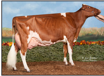
Mystic-Kreek Avlc Banff-Red "EX-94" (Dam of Lot 32)