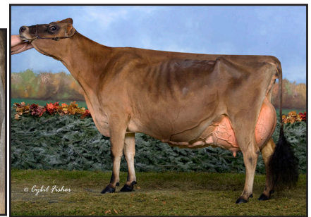
Lloyln Jude Griffen-ET "EX-95" (Third Dam of Lot 63)