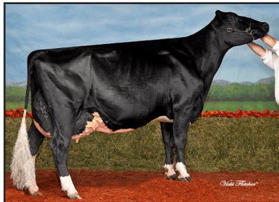
Lexis R T Haven-ET "EX-95 2E" Res. All-Canadian 4 Year Old 2008 (Granddam of Lot 34)

Bred 9/22/23 to S-S-I BG Perfect Pearce-ET 7HO15793