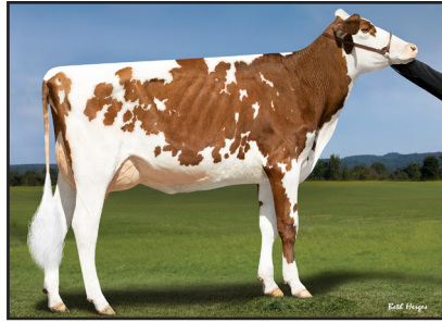
OCD Leap of Fate-Red-ET "2E-93" (Dam of Lot 8)