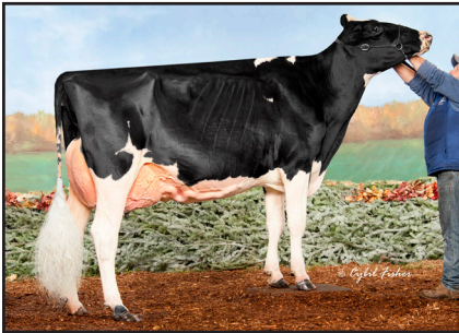
Comestar Hopra Atwood-ET "EX-93" (Dam of Lots 59 & 60)