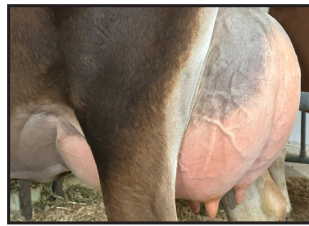
Lost-Elm Colton Berlin (Lot 64)