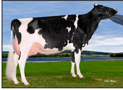
Budjon-JK Wbrk Enthem-ET "VG-89" (Granddam of Lot 22)

Bred 1/22/24 to Trent-Way-JS Rompen-Red-ET 7HO15427