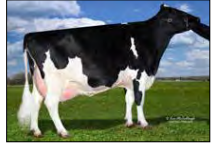
BRANDYVALE SHOTL GLAMOUR-ET EX-92 2E 3RD DAM OF LOT 59