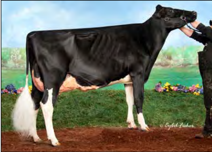
JUST-N-RUST ATWD PLEDGE-ET EX-91 MATERNAL SISTER TO 2ND DAM OF LOT 68