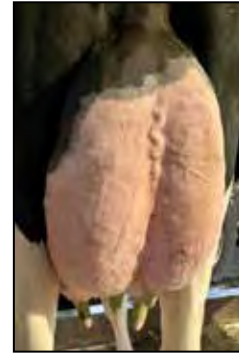
MISS DOORMAN CHEYANNE-ET SELLS AS LOT 5

Due: May 14, 2024 to Stantons Chief-ET (Ultrasounded Female) 552H003190