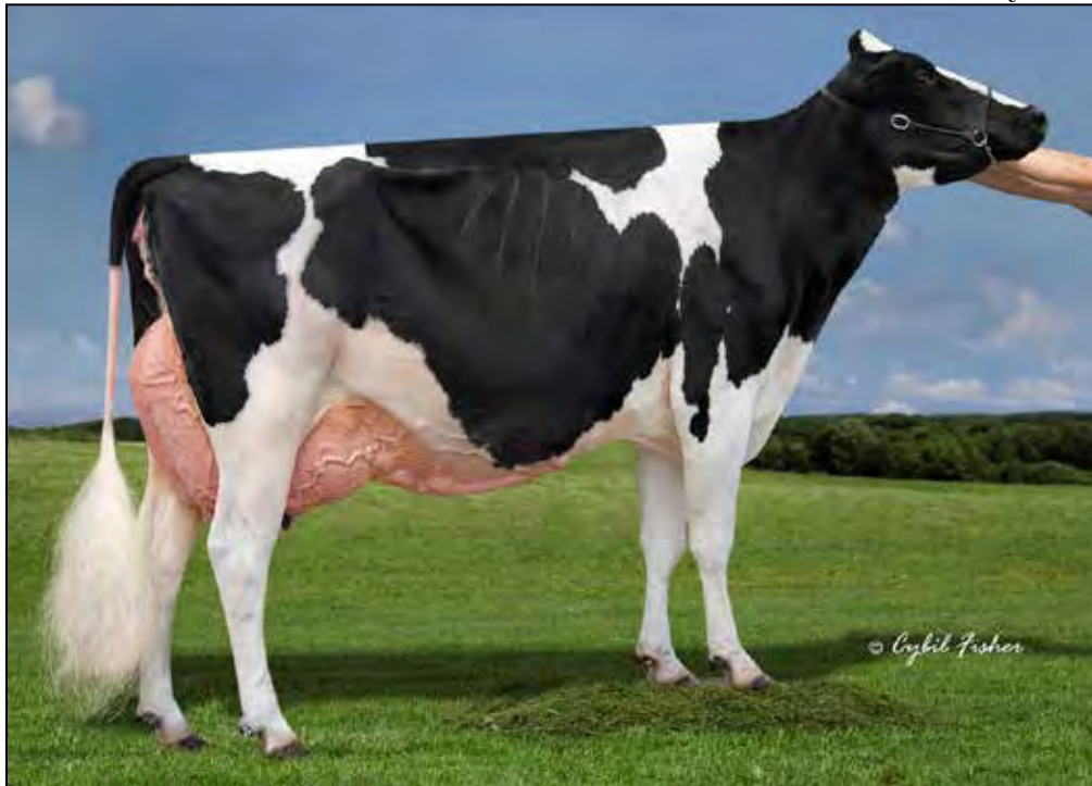
JERICO-DAIRY BARACUDA-ET EX-96 *RC MATERNAL SISTER TO LOT 52 & DAM OF LOT 53