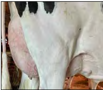
CEDAR-CREST EXCLB LUVLEE SELLS AS LOT 17