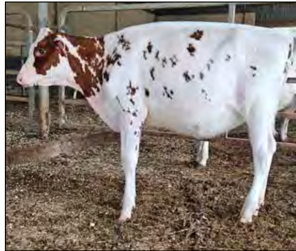
WARRIOR HEIFER-ET-RED SELLS AS LOT 51