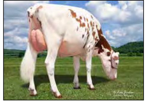
ZBW-JLP MRAND JOYOUS-RED-ET VG-88 @ 2YRS DAM OF EMBRYO IMPLANTED IN LOT 63

Embryo Implanted November 7, 2023 3Star Oh Ranger-Red-ET X ZBW-JRP Mirand Joyous-PP-Red VG-88