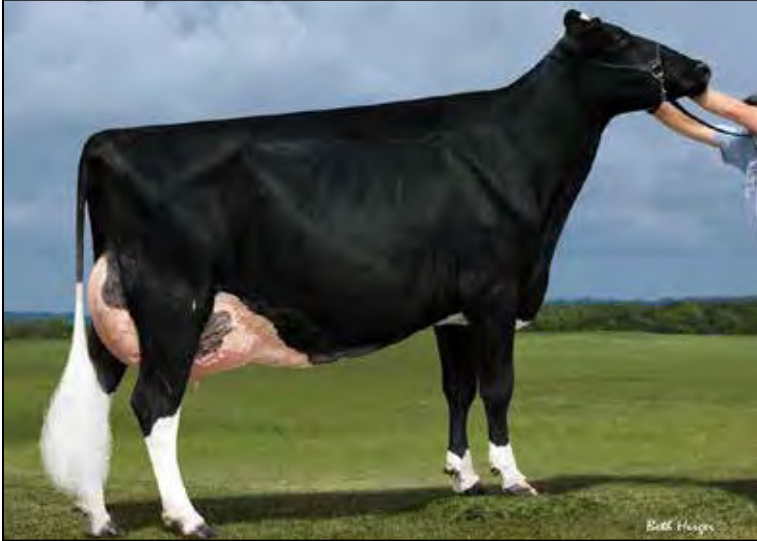
WELK-SHADE ATWOOD KOKO EX-95 2E SAME FAMILY AS LOT 28