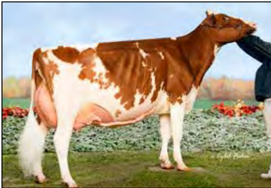
MS-AOL CNTNDR REVIVE-RED-ET EX-94 MATERNAL SISTER TO DAM OF LOT 50