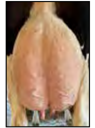
SKILES-VIEW DURABLE PLUM VG-88 EX-MS SELLS AS LOT 61