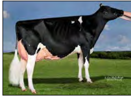
SAVAGE-LEIGH ATWOOD CRIS-ET EX-94 EX-MS 2ND DAM OF LOTS 5 & 6