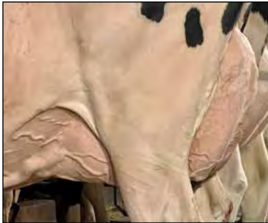
MS WELKCREST DM BABY RAE-ET VG-85 VG-MS SELLS AS LOT 29