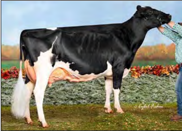
GOLDEN-OAKS CHEYENNE EX-94 EEEEE 2E DAM OF LOT 73