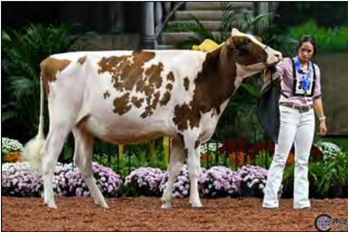
SIEMERS A HOT 36141-RED-ET FULL SISTER TO LOT 107