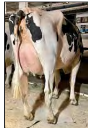
CEDAR-CREST DB FIREFLY SELLS AS LOT 9

840003211987135 99%RHA-I *RC Born: July 2, 2020 • Herd No. 646 2-00 2x 356d 15950 4.1 657 3.5 553 Fresh: October 25, 2023 Milking: 86# 4.0F 2.8P SCC 13,000