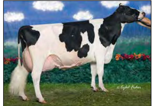
ELLEETA SKYBUCK LUCY EX-95 EEEEE 3E 2ND DAM OF LOT 103