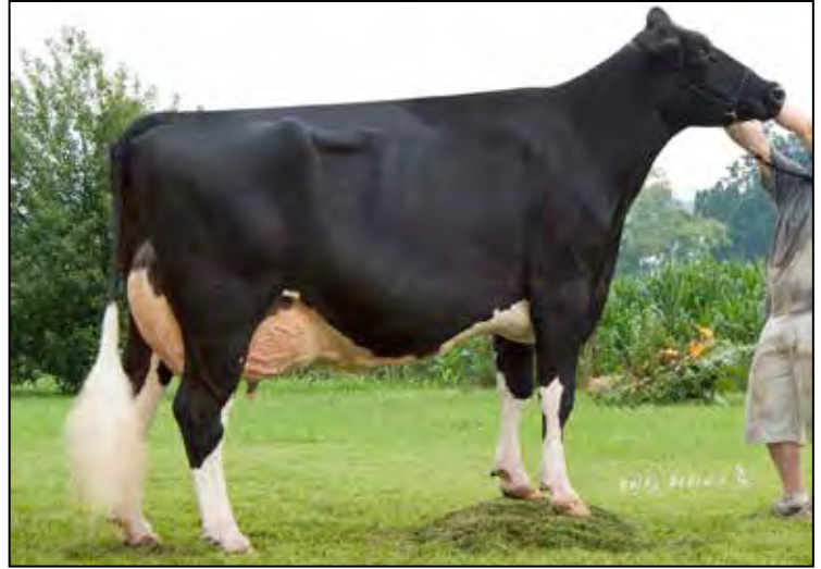
PENN-GATE STORM FLEUREL-ET EX-94 EEEEE 2E DOM DAM OF LOT 84