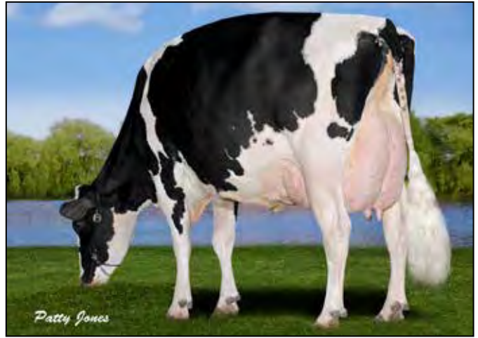
QUALITY GIBSON FINSCO-ET EX-95-CAN 3E 2ND DAM OF LOT 56