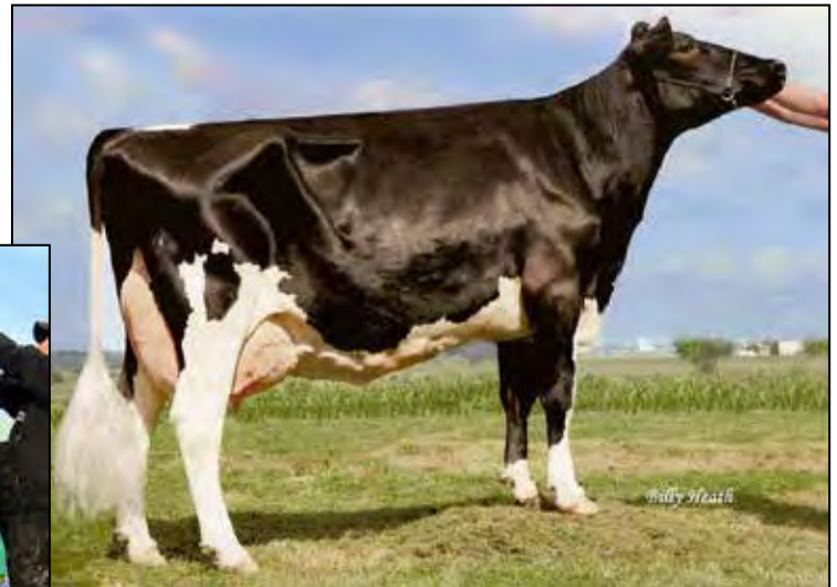
ROCKLAN LEE CHERRY PIE-ET EX-94 EEEEE 3E 2ND DAM OF LOT 27