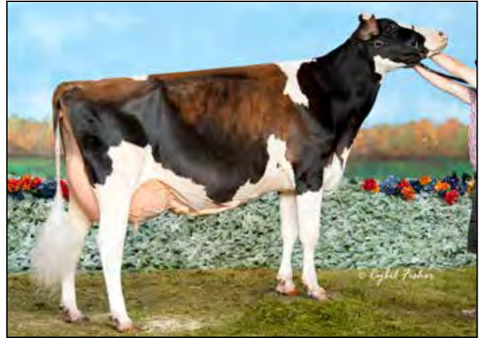
JERICO-DAIRY AD BARLEY-RED EX-94 EEEEE 3E DAM OF LOT 52