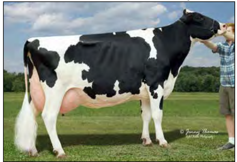
GOLDEN-OAKS DUR RAE2-ET EX-94 EEEEE *RC 2ND DAM OF LOT 29