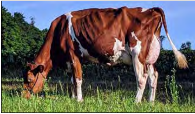
GOLDEN-ROSE BARBRITZIB-RED EX-90 EX-MS 2ND DAM OF LOT 58