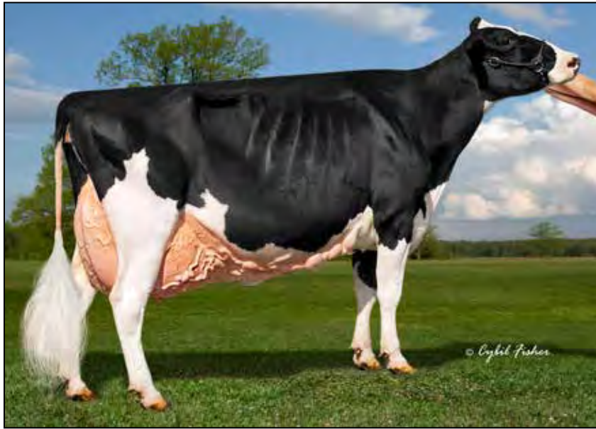
BLONDIN GOLDWYN SUBLIMINAL-ETS EX-97 EEEEE 4E 2ND DAM OF LOT 106