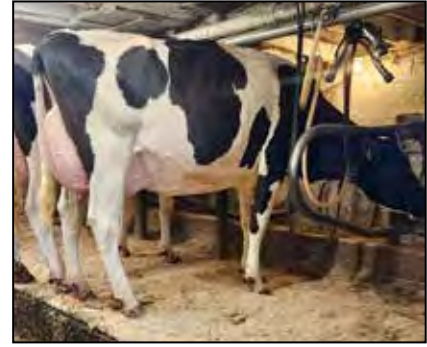
LUCK-E DOC ANACOND-ET EX-93 FULL SISTER TO DAM OF LOTS 65 & 66