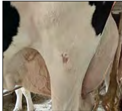
LUCK-E DOC ALBATRZ-ET VG-86 VG-MS DAM OF LOTS 65 & 66