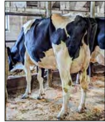
CEDAR-CREST CHEER FANTASTIC GP-84 @ 2-10 SELLS AS LOT 13

Bred: November 20, 2023 to Siemers Rengd Perfect-ET (Sexed Semen) 507H015085