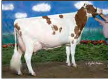
R-PINE RM SARAH-ET EX-93 EEEEE 2E 4TH DAM OF LOT 81

Due: May 10, 2024 to Mr Blondin Warrior-Red-ET (Sexed Semen) 7H014477