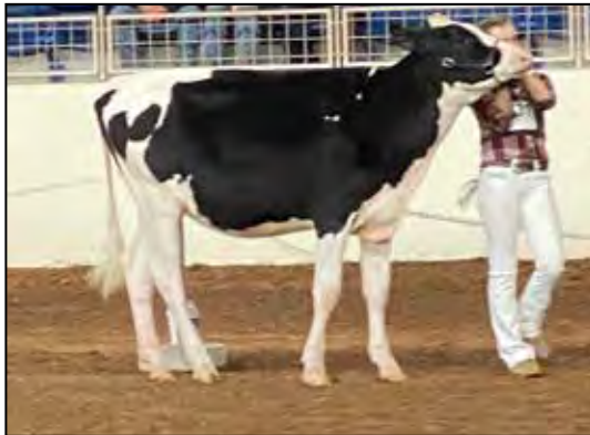
SWEETSWING TATOO AMAZING SELLS AS LOT 71