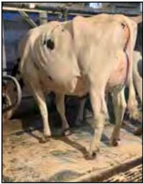
CEDAR-CREST CHEIF LUSCIOUS SELLS AS LOT 16