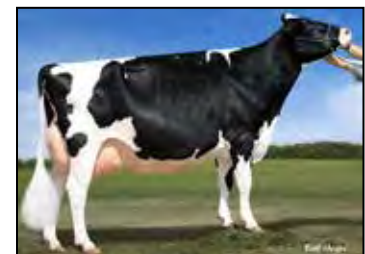
LUCK-E DAMION TASSEL EX-94 2E DAM OF LOT 102

Embryo Implanted November 14, 2023 Thunderstruck X Budjon-JK Damion Eclipse-ET 2E-94