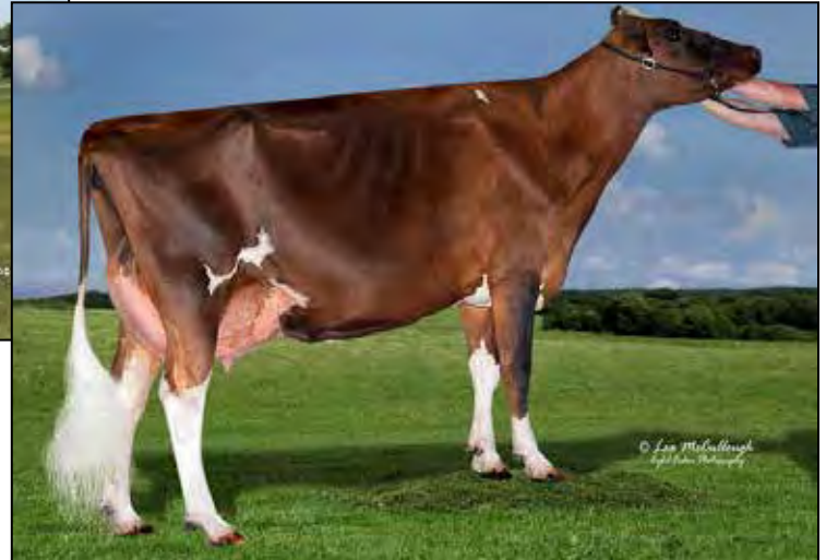
MIDAS-TOUCH CHRY PIE-RED-ET EX-93 95-MS MATERNAL SISTER TO DAM OF LOT 76