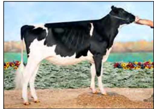
CEDAR-CREST CRUSH LOLLIE VG-89 SAME FAMILY AS LOT 17