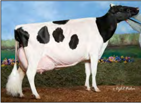
ERNEST-ANTHONY APHRODITE-ET EX-95 EEEEE 2E 3RD DAM OF LOT 7