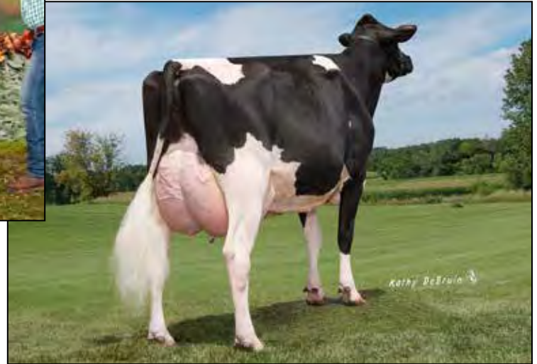
GOLDEN-OAKS ATWD CHARLA-ET EX-93 EEEEE GMD 2ND DAM OF LOT 37