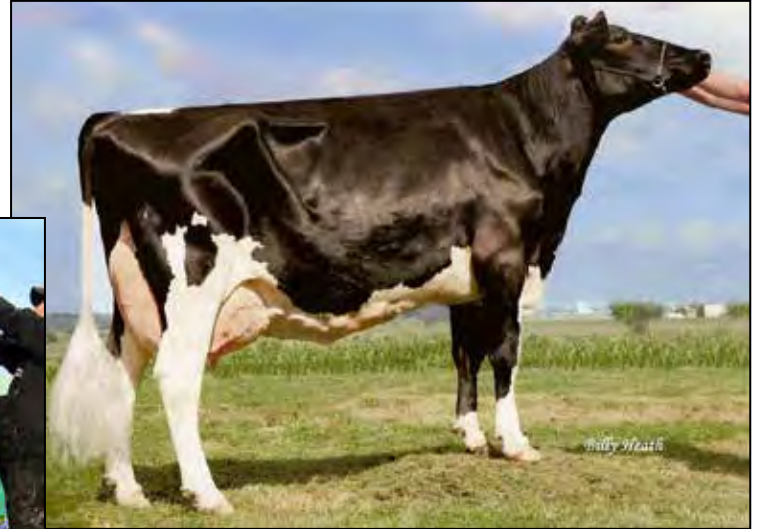
ROCKLAN LEE CHERRY PIE-ET EX-94 EEEEE 3E 3RD DAM OF LOT 68