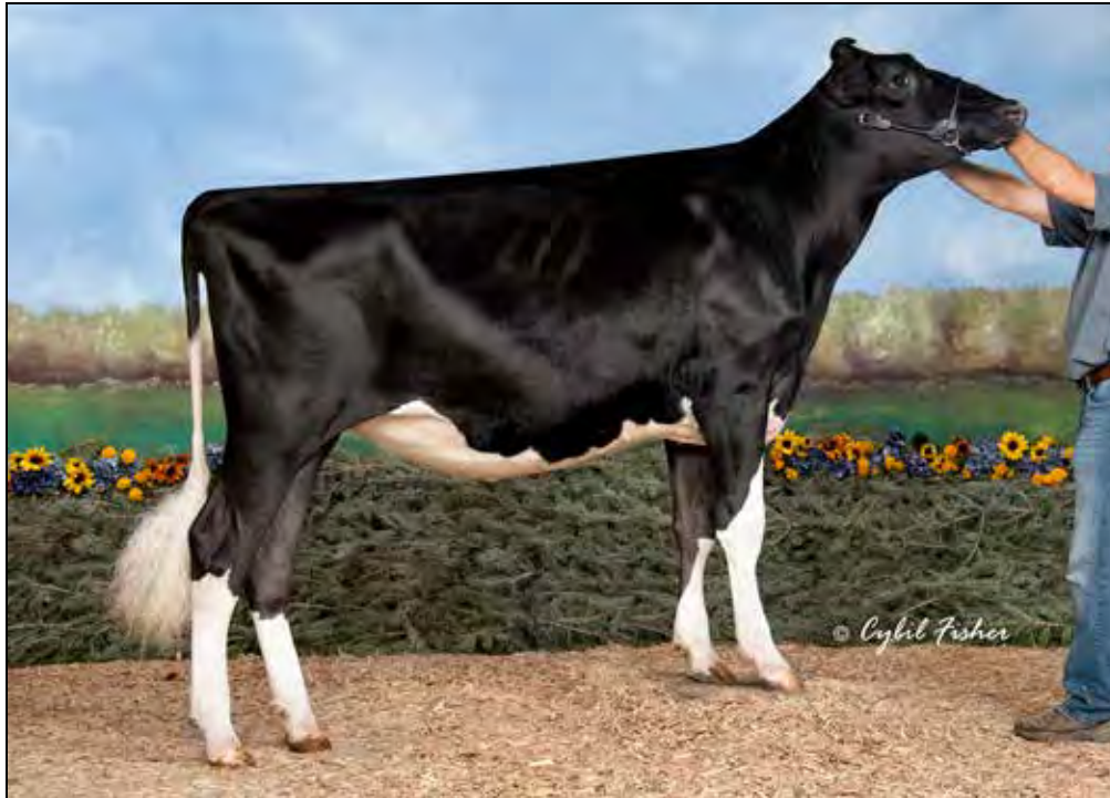
CEDAR-CREST ALEXAN LILLIPOP EX-90 3RD DAM OF LOT 49