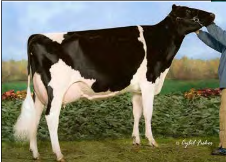
WELK-CREST DUNDEE DELLIA-ET EX-92 MATERNAL SISTER TO 4TH DAM OF LOT 79