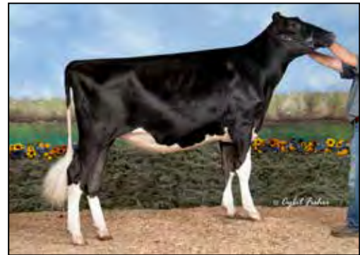
CEDAR-CREST ALEXAN LOLLIPOP EX-90 SAME FAMILY AS LOT 17