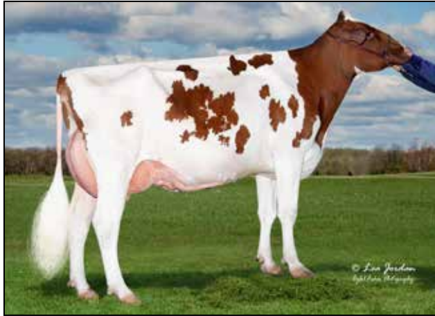
ROCKLAN JORDY GLITTER-RED EX-90 SAME FAMILY AS LOT 58