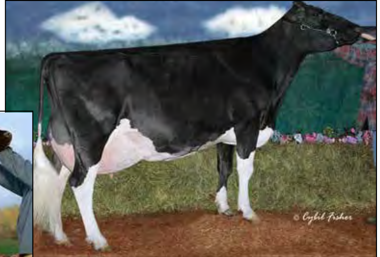
KRISTELLE SKYBUCK DAPHNE-ET EX-94 EEEEE 3E DOM 5TH DAM OF LOT 79

Maternal Sisters to TNT Diamond (4th Dam)