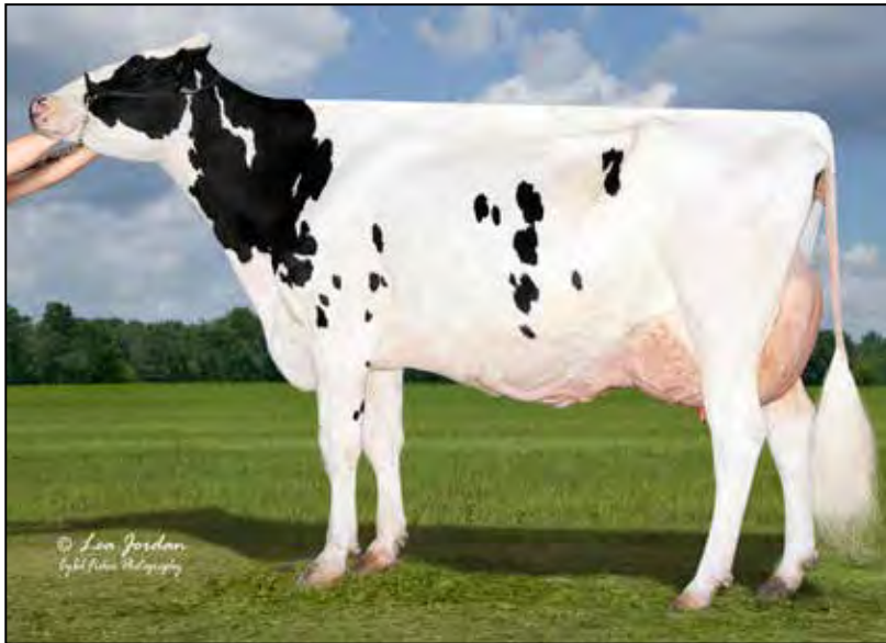
GOLDEN-ROSE AMMO GLEE EX-92 *RC DAM OF LOT 57