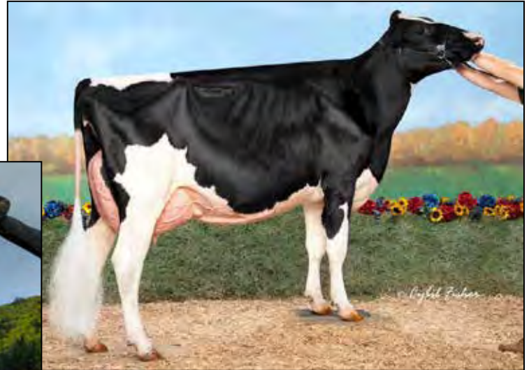
MS KEN-AM BUTZ DMAN ALEYNA EX-92 EEEEE 2ND DAM OF LOT 108