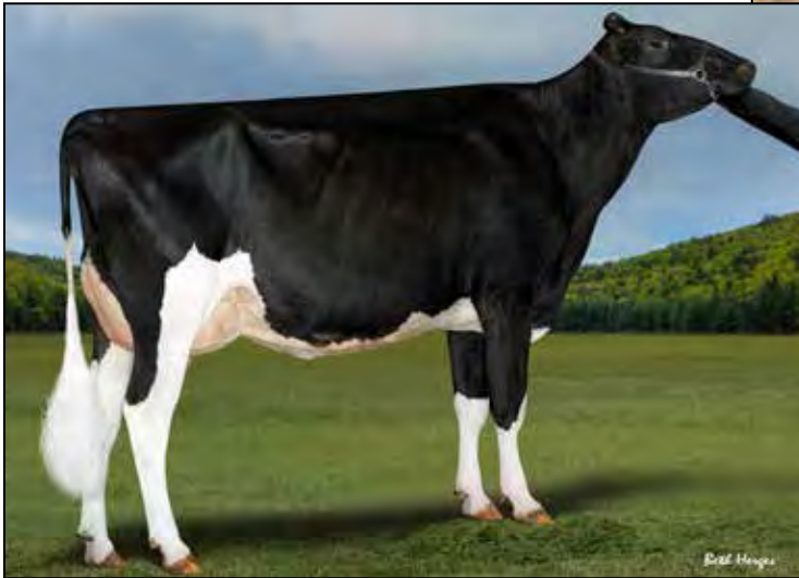
KEN-AM AEYNA VG-87 VVVVV @ 3-07 SELLS AS LOT 108