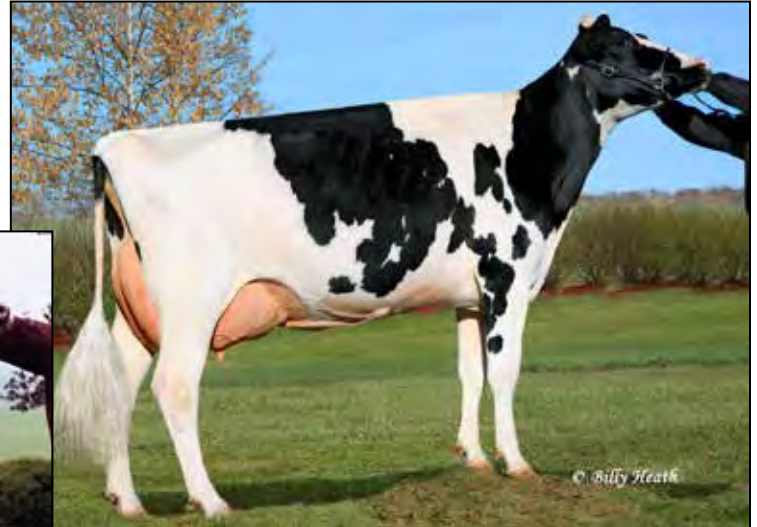
GLORYLAND LORI RAE-ET EX-94 EEEEE 3E DOM 4TH DAM OF LOT 32