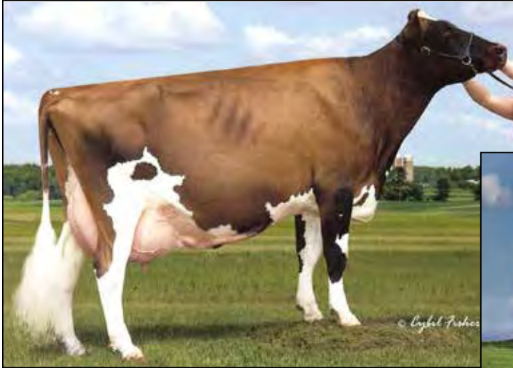
ELLBANK CHERRY COKE-RED-ET EX-92 EX-MS 2ND DAM OF LOT 76