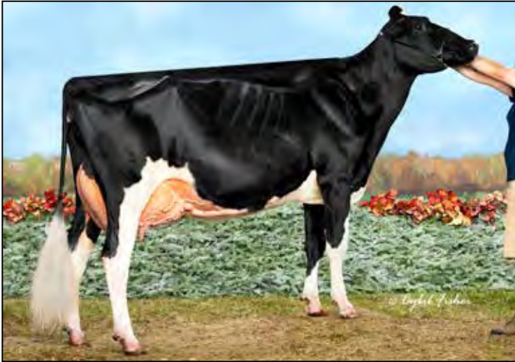
ROSEDALE WORTH REPEATING-ET EX-94 EX-MS 3E DAM OF LOT 72