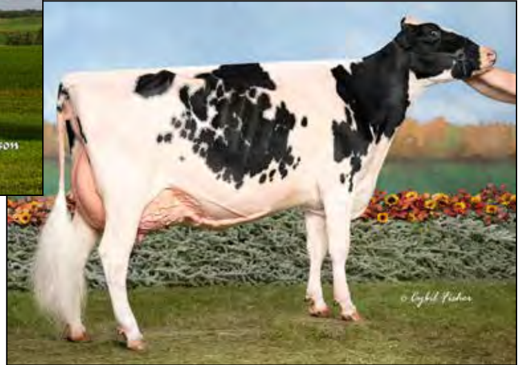
CLASS-L WILDFIRE-ET EX-94 MATERNAL SISTER TO LOT 96