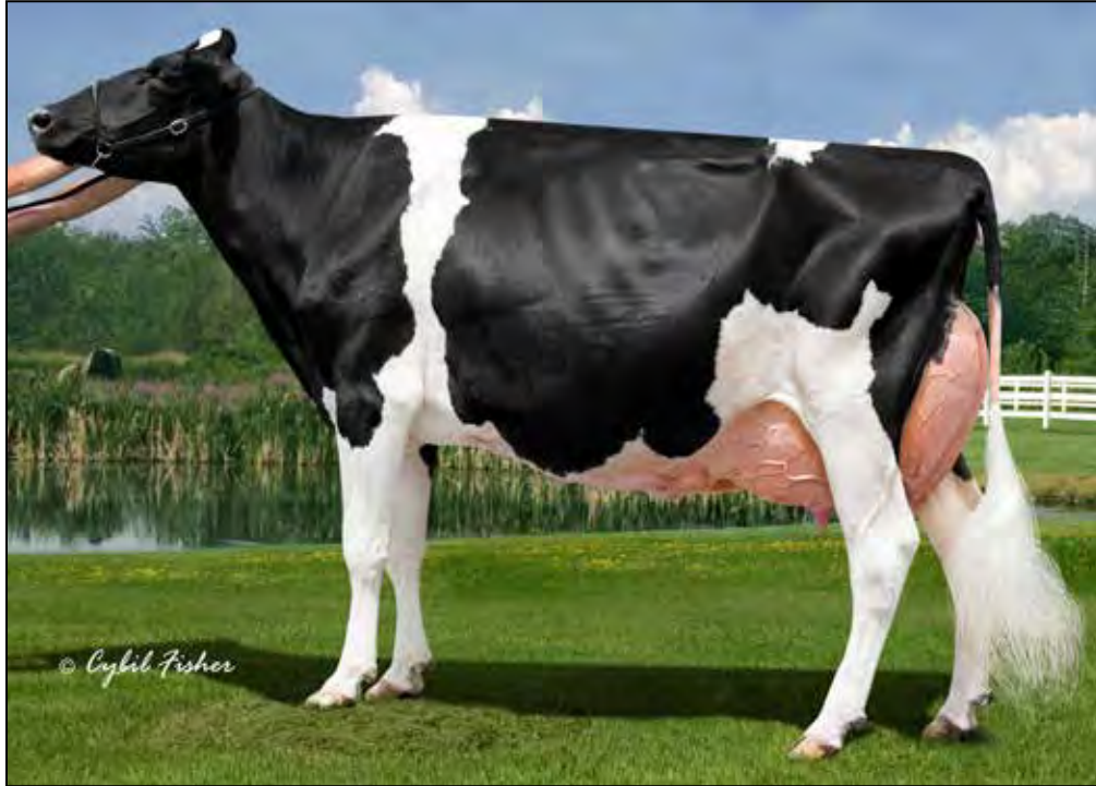
ERNEST ANTHONY ACOUSTIC EX-95 EEEEE 3E DAM OF LOT 95