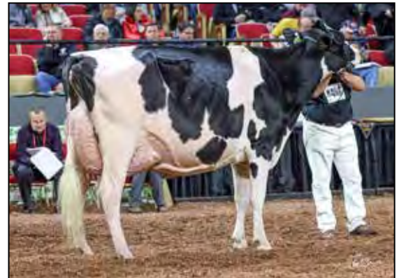
LADYROSE CAUGHT YOUR EYE EX-94 SAME FAMILY AS LOT 72