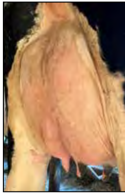
SKILES-VIEW CHIEF CRANBERRY SELLS AS LOT 53