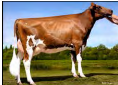
ARTHAVEN LADD LOREAL-P-RED VG-88 VG-MS 4TH DAM OF LOT 64

145309356 99%RHA-I *RC Born: September 5, 2021 • Herd No. 12 Fresh: October 21, 2023