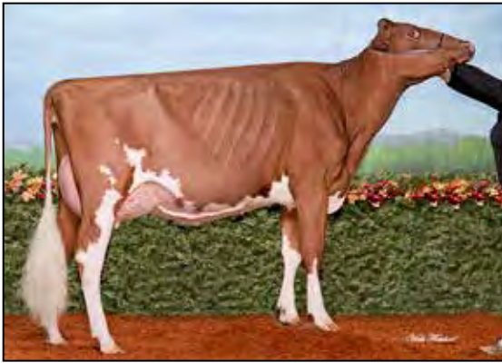
MS-AOL DB RASPBERRY-RED-ET EX-90-CAN 2ND DAM OF LOT 50 & 3RD DAM OF LOT 51