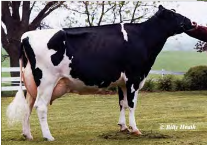
GLORYLAND LANA RAE EX-94 EEEEE 2E DOM 5TH DAM OF LOT 32