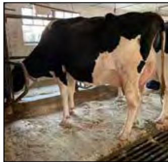
KOZY-KOUNTRY UN-BELIEVABLE EX-90 EX-MS SELLS AS LOT 52