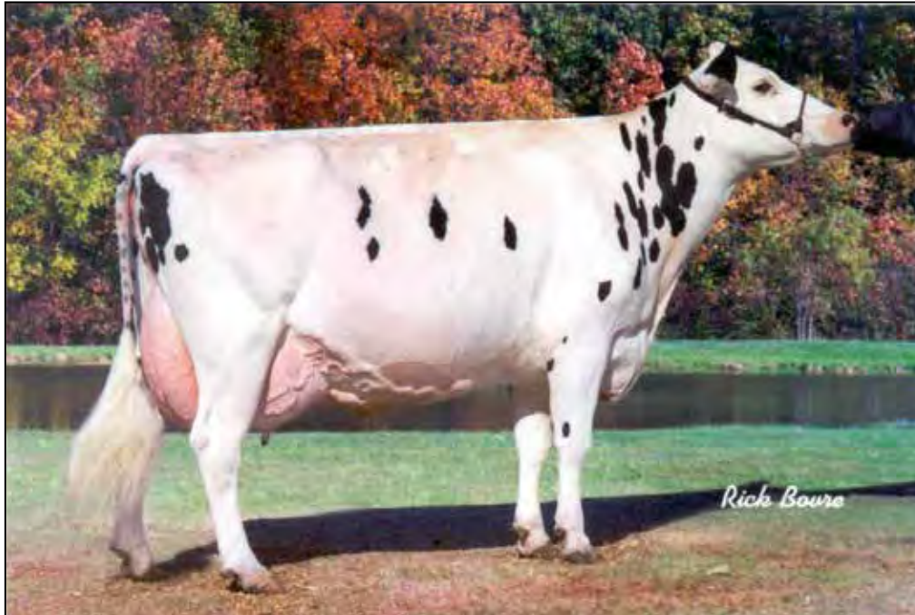
PINEHURST SWEET DUSTY EX-94 3E 6TH DAM OF LOT 80