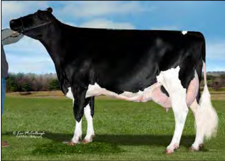
OAKFIELD PRONTO RITZI EX-93 EEEEE 2E 4TH DAM OF LOT 10