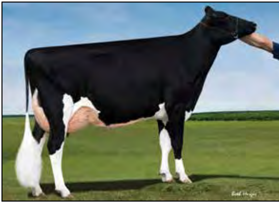
ERNEST-ANTHONY SID AMELIA EX-92 FULL SISTER TO LOT 7