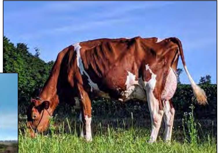
GOLDEN-ROSE BARBRITZI B-RED EX-90 SAME FAMILY AS LOT 10