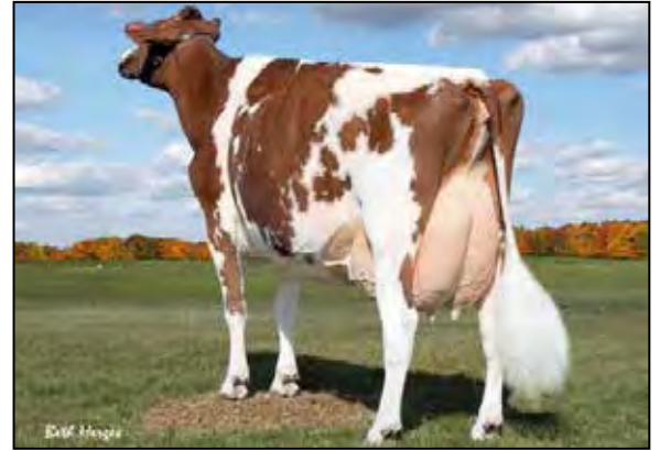
LAVENDER RUBY REDROSE-RED EX-96 EEEEE 4E 2ND DAM OF LOT 72