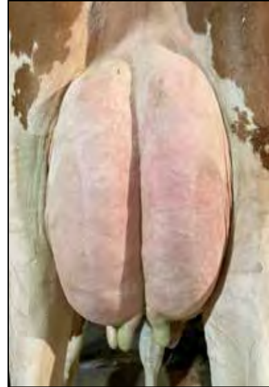
CEDAR-CREST J CARMEN-RED SELLS AS LOT 26