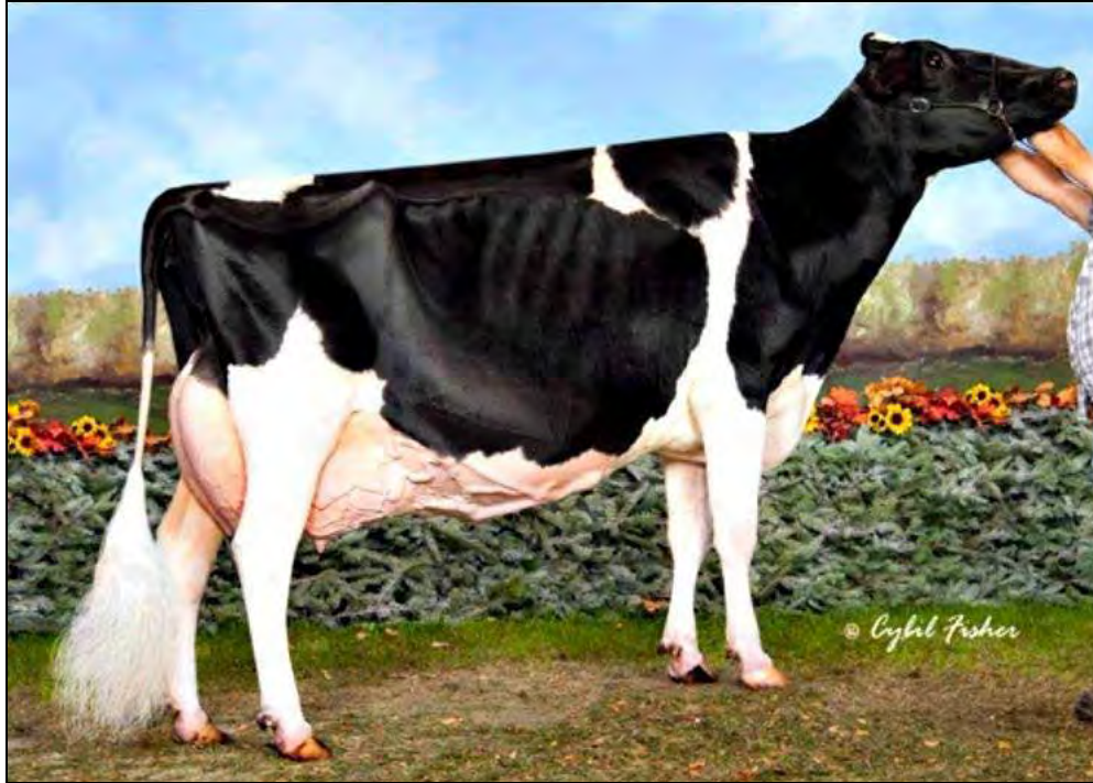
EO SIEMERS ASHLYNS ANGEL-ET EX-96 EEEEE 3E GMD DAM OF LOT 94