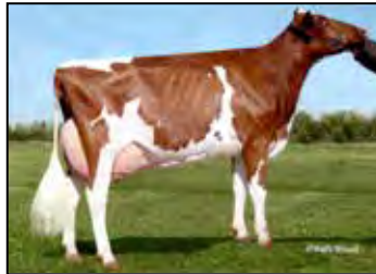
SRP ABSOLUTE FANTASY-RED-ET EX-94 EEEEE 2E DAM OF LOT 90

Moovin RC X Arethusa Solomon Aloha-ET (Sells as Lot 94)