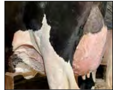
COCALICO SID ASHLYN-ET VG-86 VG-MS SELLS AS LOT 7