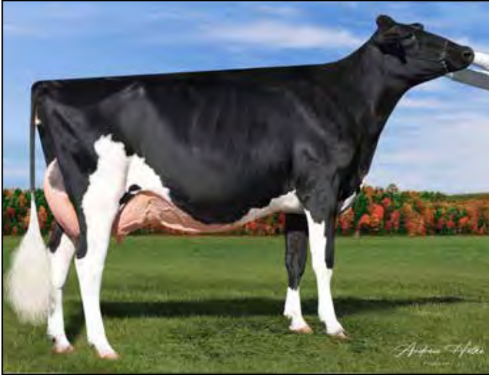
OAKFIELD DOORMAN KARMEN-ET EX-92 FULL SISTER TO LOT 92