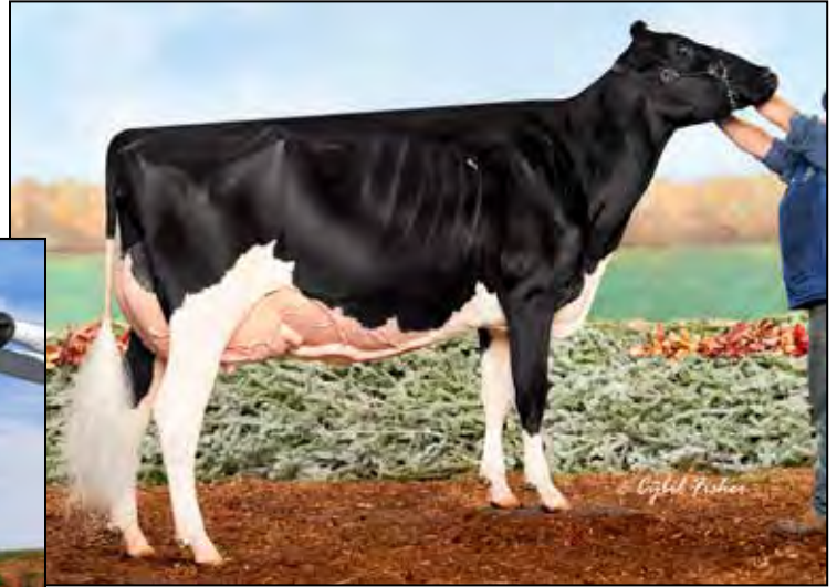
VALE-O-SKENE GOLD KARMILLA-ET EX-94 EEEEE DAM OF LOT 92