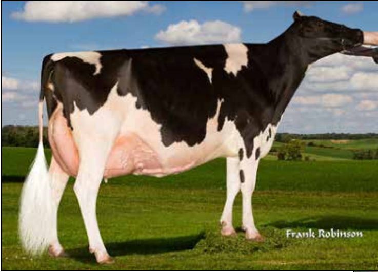
CRAIGCREST REJOICES WIND CH-ET EX-93 EEEEE 2E DAM OF LOT 96