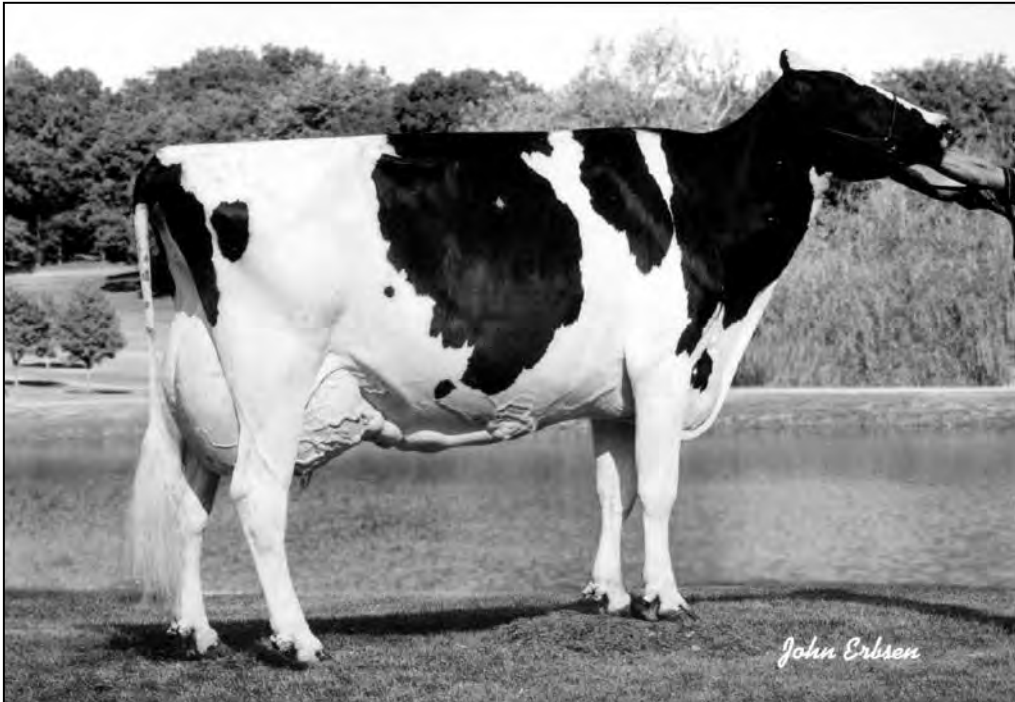
KERNDTWAY JOLT DAISY-ET EX-94 2E GMD DOM 6TH DAM OF LOT 67