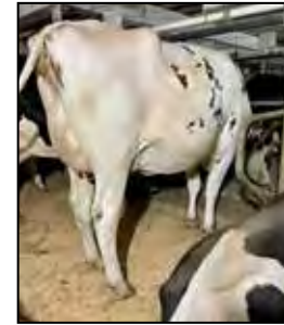
CEDAR-CREST ALTI DISNEY-RED GP-82 @ 2-09 SELLS AS LOT 11

840003222004275 99%RHA-I Good Plus-82 @ 2-09 Born: January 22, 2021 • Herd No. 682 2-04 2x 156d 9522 4.0 379 3.3 318 RIP Fresh: June 12, 2023 Milking: 64# 4.7F 3.5P SCC 20,000