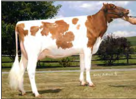
PEACHEY ABSOLUT TANG-RED-ET VG-87 MATERNAL SISTER TO 2ND DAM OF LOT 54