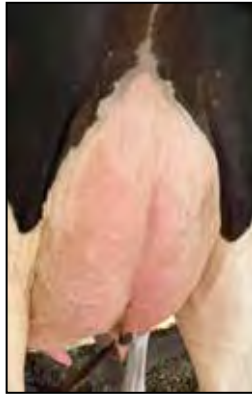
SKILES-VIEW UNIX TULIP VG-85 VG-MS @ 2-06 SELLS AS LOT 54