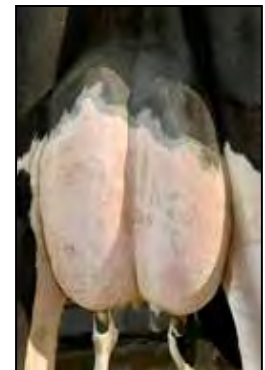
CEDAR-CREST JONAH JENNA SELLS AS LOT 4