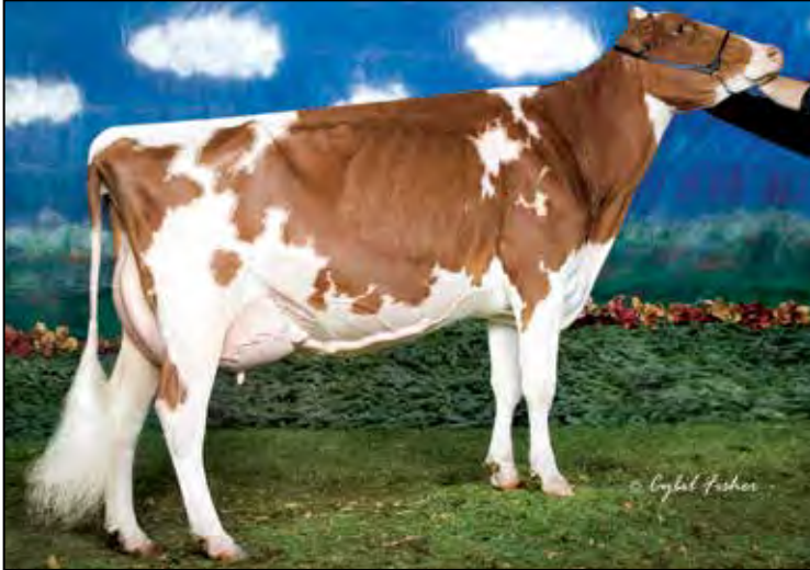
YURSDEN KITE CARAMAC-RED EX-92 EEEEE 3RD DAM OF LOT 26