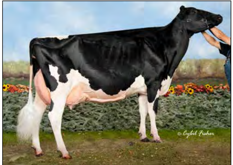
EASTSIDE LEWISDALE GOLD MISSY EX-95-CAN EEEEE 3RD DAM OF LOT 71