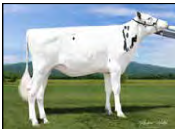
VALIANT MCDONALD POPPY-ET DAM OF LOT 19