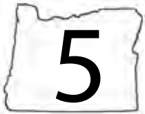
WALNUTLAWN MCCUTCHEM SUMMER-ET EX-95 2E EEEEE 2ND DAM OF LOT 5