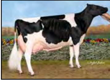
BUDJON-JK EMILYS EDAIR-ET EX-95 EEEEE 2E DAM OF LOT 23

840003239508679 Born: September 11, 2021 • Herd No. 14929 55K GTPI +1757G Due: December 29, 2023 to Jacobs Backflip (Sexed Semen) 7H014324