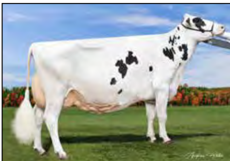
MONUMENT DEFENDER JULIET-ET EX-93 EX-MS 2E DAM OF LOT 13