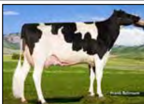
ESKDALE SPLENDID ALMAH EX-90 EX-MS 2ND DAM OF LOT 35

$1,000 Min. Bid Each 100 Unit Min. and Pay all Collection and housing over that time frame