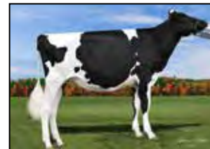
HIGHTIDE GC ROCHELLE-ET DAM OF LOT 26

Buyer keeps all resulting embryos from these controlled IVF sessions. Buyer is responsible for all costs of the aspiration and mating sire decisions