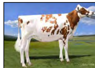
VALIANT RBL S MUFFLER-RED-ET 2ND DAM OF LOT 20

*Buyer is purchasing rights to control the next IVF session(s). Buyer is guaranteed IVF sessions until a minimum of 8 #1 or #2 IVF embryos are produced. Embryo grades are determined at the time of transfer if fresh embryos or at time of freezing if freezing is requested by buyer. Buyer keeps all resulting embryos from these controlled IVF sessions. Buyer is responsible for all costs of the aspiration and mating sire decisions