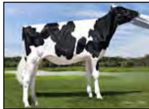
DINOMI RONALD KATAV-ET DAM OF LOT 24

*Buyer is purchasing rights to control the next IVF session(s). Buyer is guaranteed IVF sessions until a minimum of 8 #1 or #2 IVF embryos are produced. Embryo grades are determined at the time of transfer if fresh embryos or at time of freezing if freezing is requested by buyer. Buyer keeps all resulting embryos from these controlled IVF sessions. Buyer is responsible for all costs of the aspiration and mating sire decisions