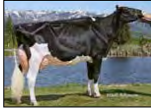
PREMIUM-FARMS ADV ADONIS-ET EX-92 EX-MS 3RD DAM OF LOT 27

840003237975081 99%RHA-I *TC *TL Born: September 17, 2022 • Herd No. 3262 32K GTPI +2059G +129M +0F +7P 81R 8/23 PTA -88NM -.02%F +.01%P PTA +.0PL +2.93SCS -2.5DPR 2.7%DCE PTA +2.39T +1.97UDC +1.03FC 79R 8/23 PTA -12FE -3.1FI 3.9%SCC