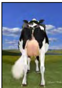
MS RASBERRY TROPIC 1070-ET VG-87 @ 2-10 DAM OF LOT 9