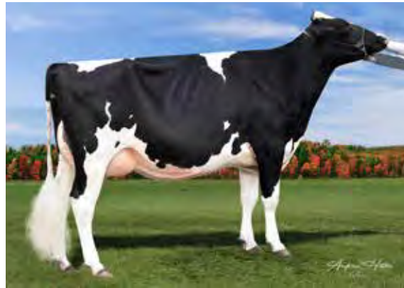
RASBERRY ROC DOC-ET VG-88 2ND DAM OF LOT 7