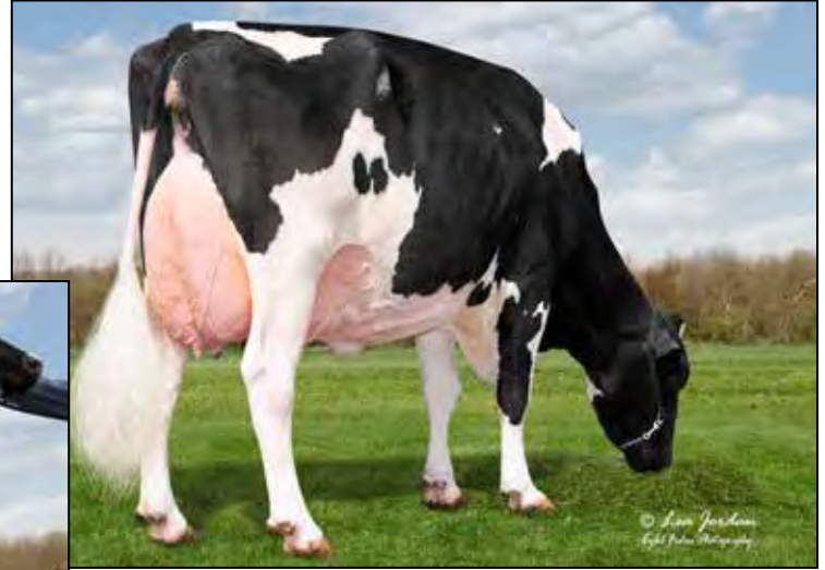
LUCK-E DURBIN TRISTEN EX-94 EEEEE 2E DAM OF LOT 36