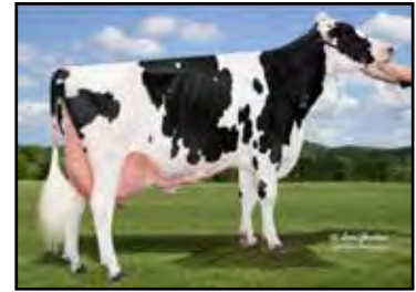
ROBETH ATWOOD PEGUINA EX-94 EEEEE 2E 2ND DAM OF LOT 21

*Buyer is purchasing rights to control the next IVF session(s). Buyer is guaranteed IVF sessions until a minimum of 8 #1 or #2 IVF embryos are produced. Embryo grades are determined at the time of transfer if fresh embryos or at time of freezing if freezing is requested by buyer. Buyer keeps all resulting embryos from these controlled IVF sessions. Buyer is responsible for all costs of the aspiration and mating sire decisions