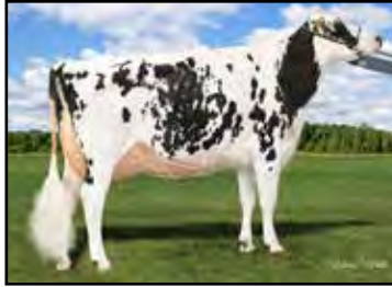
JUNIPER-HAVEN DFANT XOCHILT EX-94 EEEEE 2E SAME FAMILY AS LOT 10

*Buyer is purchasing rights to control the next IVF session(s). Buyer is guaranteed IVF sessions until a minimum of 8 #1 or #2 IVF embryos are produced. Embryo grades are determined at the time of transfer if fresh embryos or at time of freezing if freezing is requested by buyer. Buyer keeps all resulting embryos from these controlled IVF sessions. Buyer is responsible for all costs of the aspiration and mating sire decisions