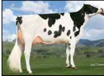
STGEN DISCJOCKEY 5-ET EX-92 EX-MS DAM OF LOT 1

840003271802437 99%RHA-I *RC *PC *TC *TL