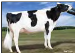
CASTLEHOLM DUNDEE RIBBON-ET EX-90 EX-MS 3RD DAM OF LOT 25