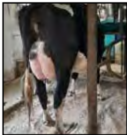
ROBETH DB PATAGONIA EX-92 EEEEE DAM OF LOT 21

840003215741500 99%RHA-I EX-92 EEEEE 2-04 2x 359d 19860 4.0 799 3.2 634