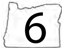
AVANT-GARDE KASHMIR SOUL-ET MATERNAL SISTER TO DAM OF LOT 6