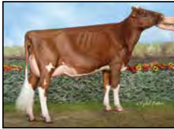
KHW REGIMENT APPLE 3-RED-ETN EX-94-CAN 2ND DAM OF LOT 3

Registration Pending Born: April 7, 2023