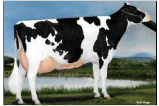
VT-POND-VIEW ATWOOD MABEL EX-93 EEEEE 2E DAM OF LOT 15

84000325071477 Born: June 18, 2022 • Herd No. 10311 Sire: Farnear Delta-Lambda-ET Due: April 4, 2024 to Siemers Wolf Hulu 37006-ET (Sexed Semen) 550H016498