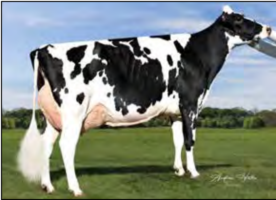
SILDAHL-HK RISE-N-SHINE EX-93 EX-MS 3RD DAM OF LOT 7