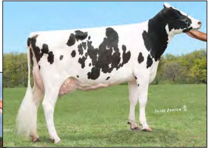
WENDY-OAKS DAZ SS DREAMZ-ET EX-90 EX-MS 2E 2ND DAM OF LOT 21