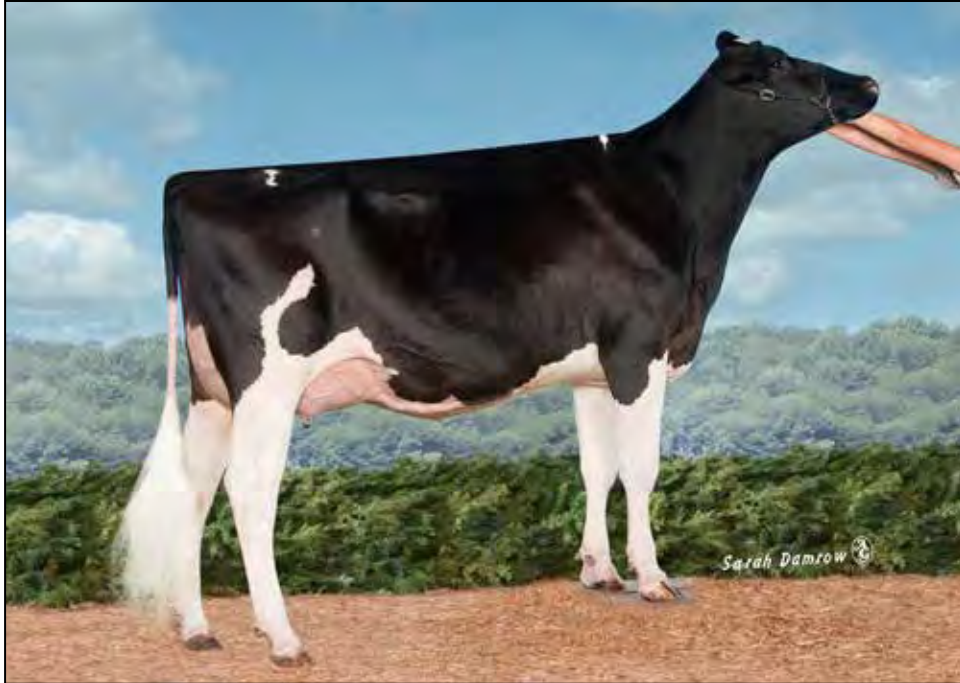
WENDY-OAKS MONUMENT DINA VG-89 EX-MS 4TH DAM OF LOT 6