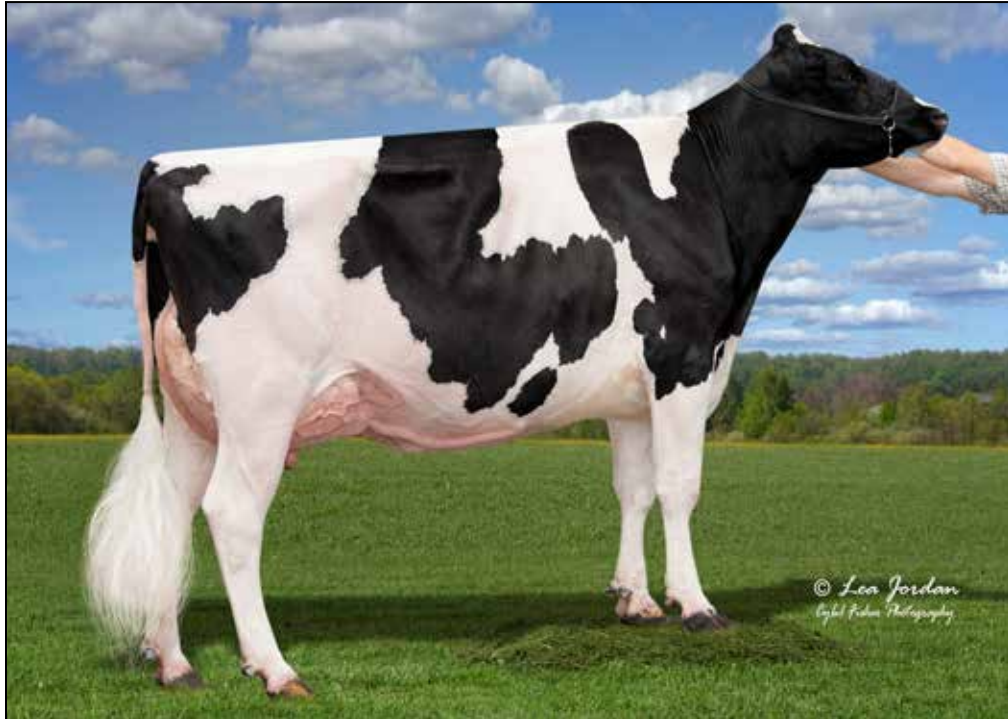
WENDY-OAKS HANCOCK DIJON VG-86 VG-MS SELLS AS LOT 10