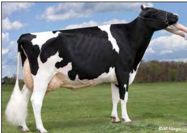
REGANCREST CINDERELLA EX-92 EEEEE 2E GMD DOM 4TH DAM OF LOT 47