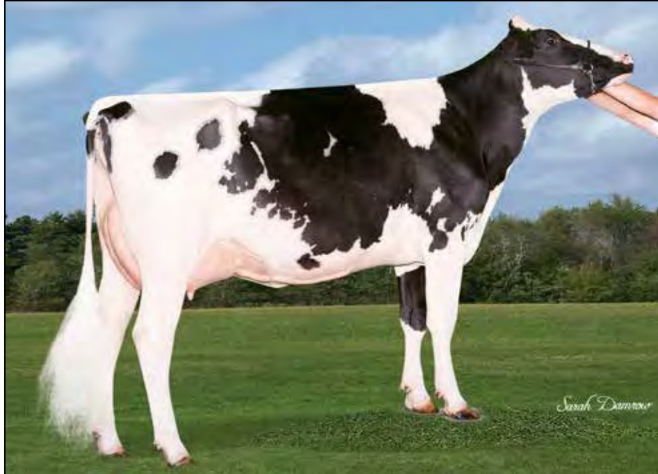
WENDY-OAKS WBRK ZANZABAR-ET VG-88 VG-MS DAM OF LOT 74 2NS DAM OF LOT 75