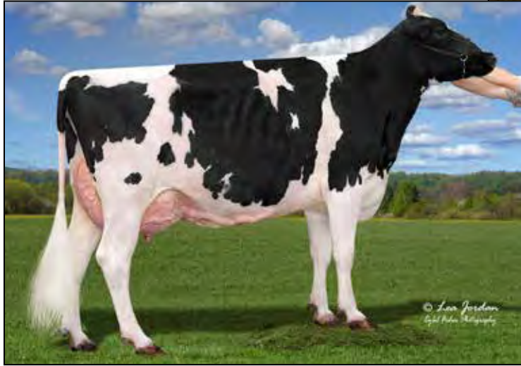
WENDY-OAKS DOORMAN DRAMATIC EX-90 EX-MS SELLS AS LOT 3