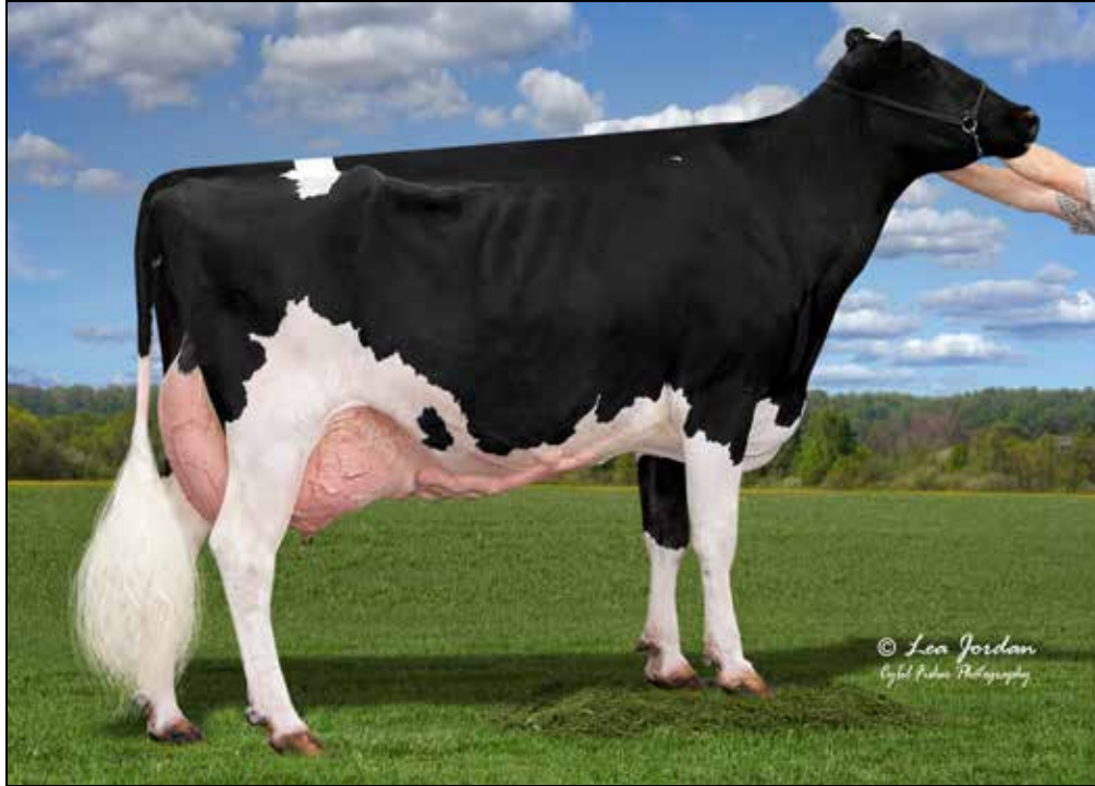
WENDY-OAKS DOORMAN DARLA EX-90 EX-MS SELLS AS LOT 1 DAM OF LOT 2