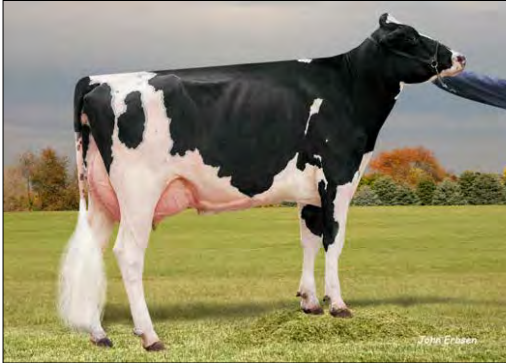
WENDY-OAKS DOC DAYLITE VG-85 VG-MS @ 2-03 SELLS AS LOT 9