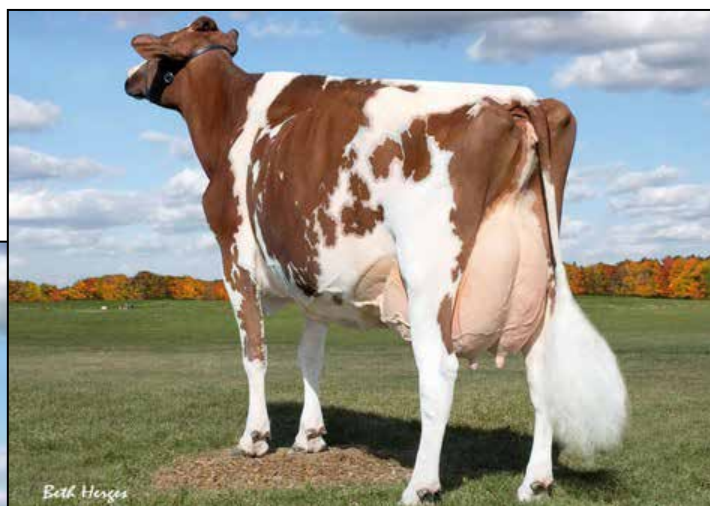
LAVENDER RUBY REDROSE-RED EX-96 EEEEE 4E 3RD DAM OF LOT 41