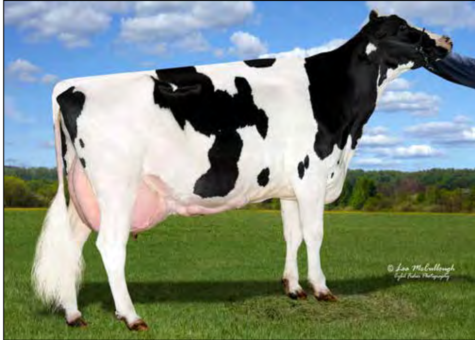
WENDY-OAKS TIME MATRIX EX-92 EEEEE 2E DAM OF LOT 56 2ND DAM OF LOT 57