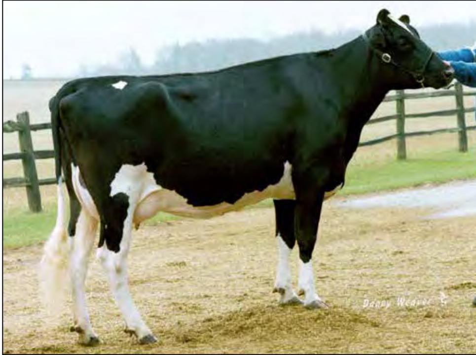
PINEHURST CARESS-ET EX-93 EX-MS 4E GMD 6TH DAM OF LOT 85