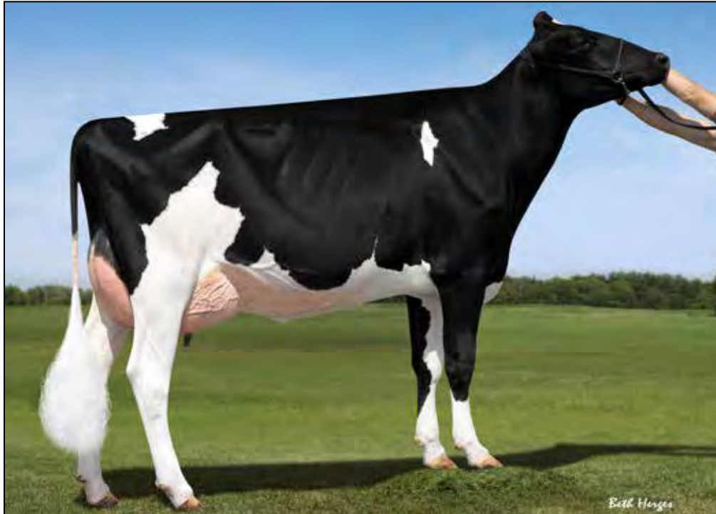
PIERSTEIN GOLD CHIP ROCKSTAR VG-89 VG-MS 2ND DAM OF LOT 50 3RD DAM OF LOT 51