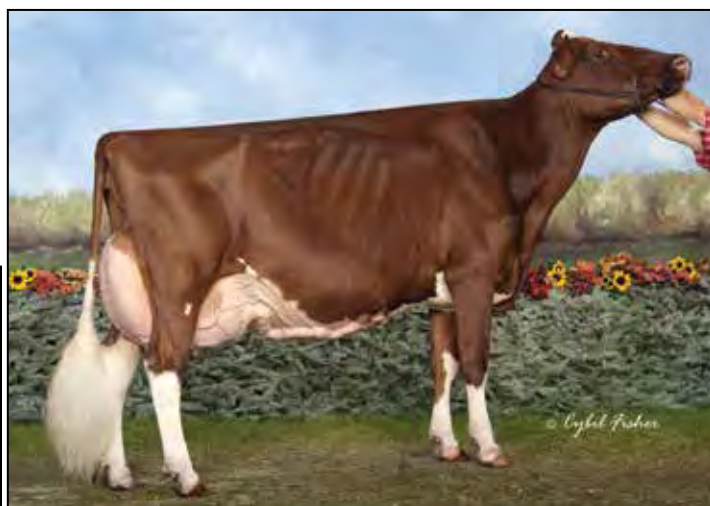
KHW REGIMENT APPLE-RED-ET EX-96 4E DOM 3RD DAM OF LOT 44