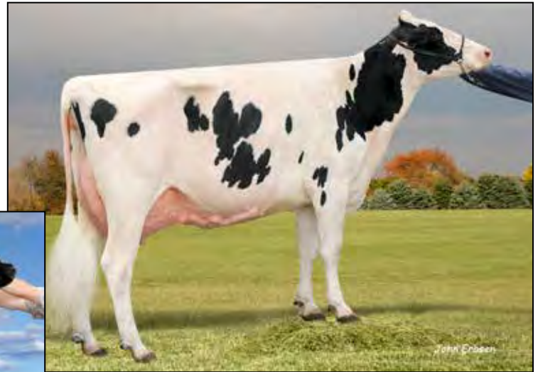
WENDY-OAKS TATTOO DUBAI VG-85 VG-MS @ 2-07 SELLS AS LOT 4