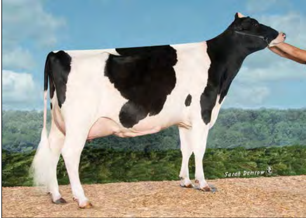
KINGSMILL ATWOOD ASHLEY EX-92 EX-MS 2E DAM OF LOT 38