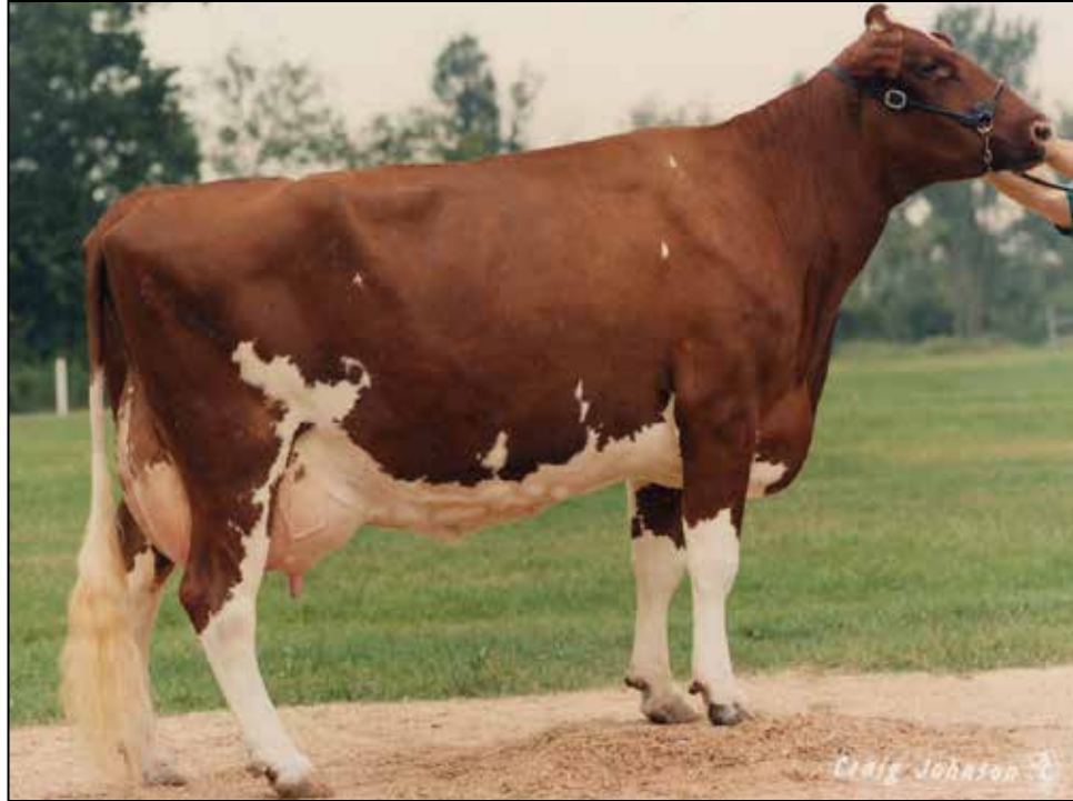
PINEHURST BEAUJOLAIS-RED-ET EX-94 EEEEE 3E 5TH DAM OF LOT 86