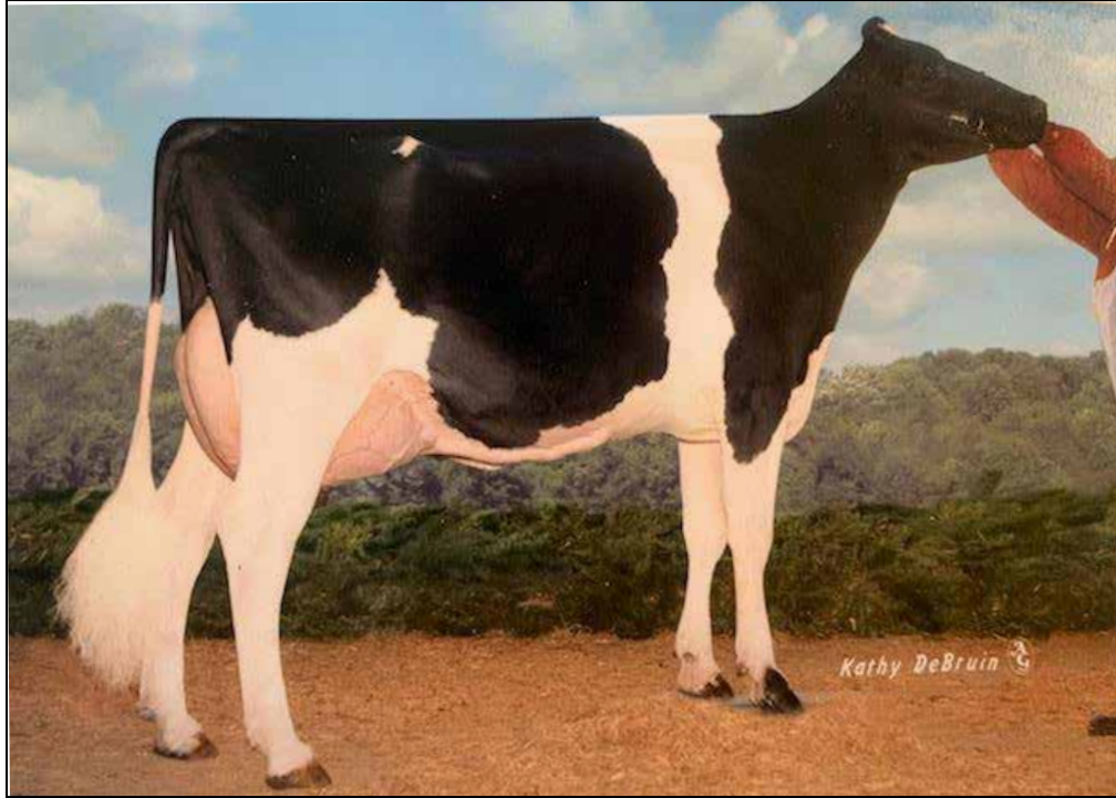
MISS-LONG-GREEN ALEXISUE EX-91 EX-MS 3E 2ND DAM OF LOTS 34 & 35