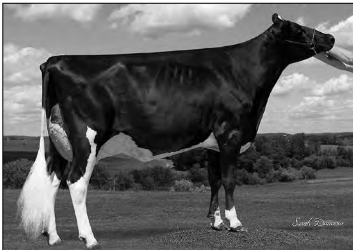
MS APPLES ANISSA-ET EX-91 EX-MS 2ND DAM OF LOT 44