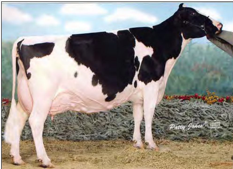
FRIENDLY-ACRES LJET MURPHY EX-96 EEEEE 3E DOM 5TH DAM OF LOT 8