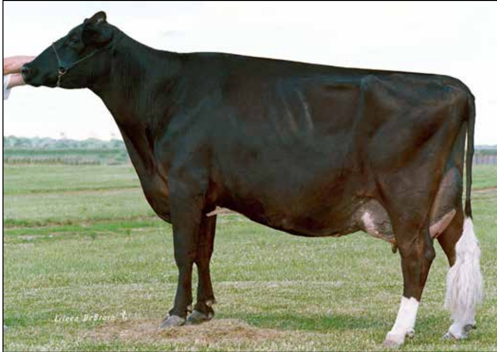
WENDY-OAKS GARWOOD MARCY EX-91 EX-MS 3E 4TH DAM OF LOT 67