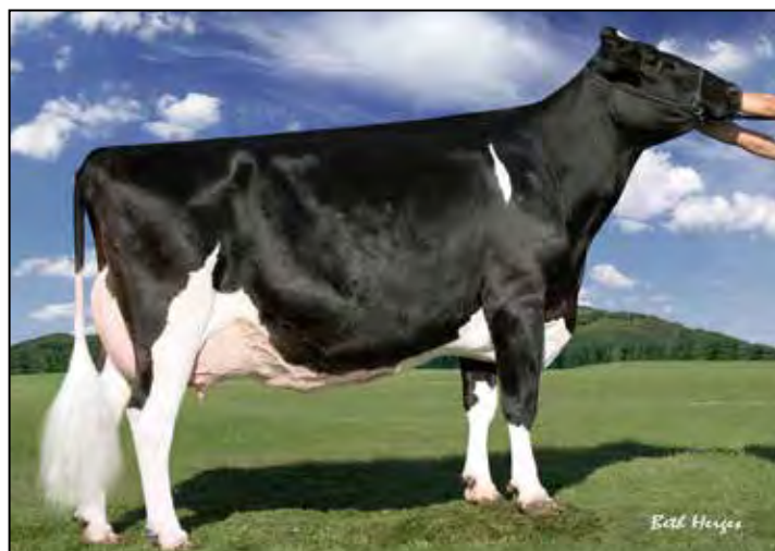
REGANCREST-PR BARBIE-ET EX-92 EEEEE GMD DOM 5TH DAM OF LOT 47