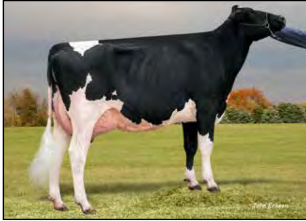
WENDY-OAKS CHEERS ABERDEEN VG-85 VG-MS @ 2-08 SELLS AS LOT 36