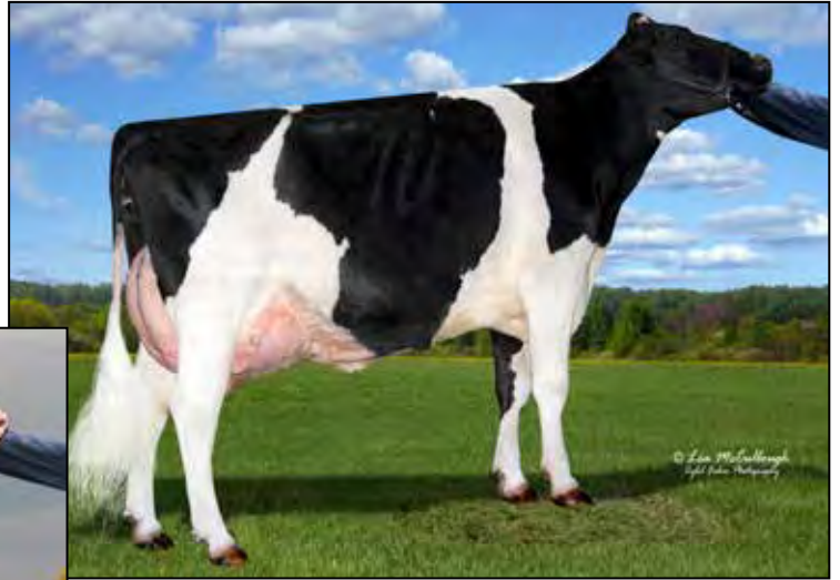
WENDY-OAKS SNCHZ DANI-ET EX-91 EEEEE 2E 2ND DAM OF LOT 23