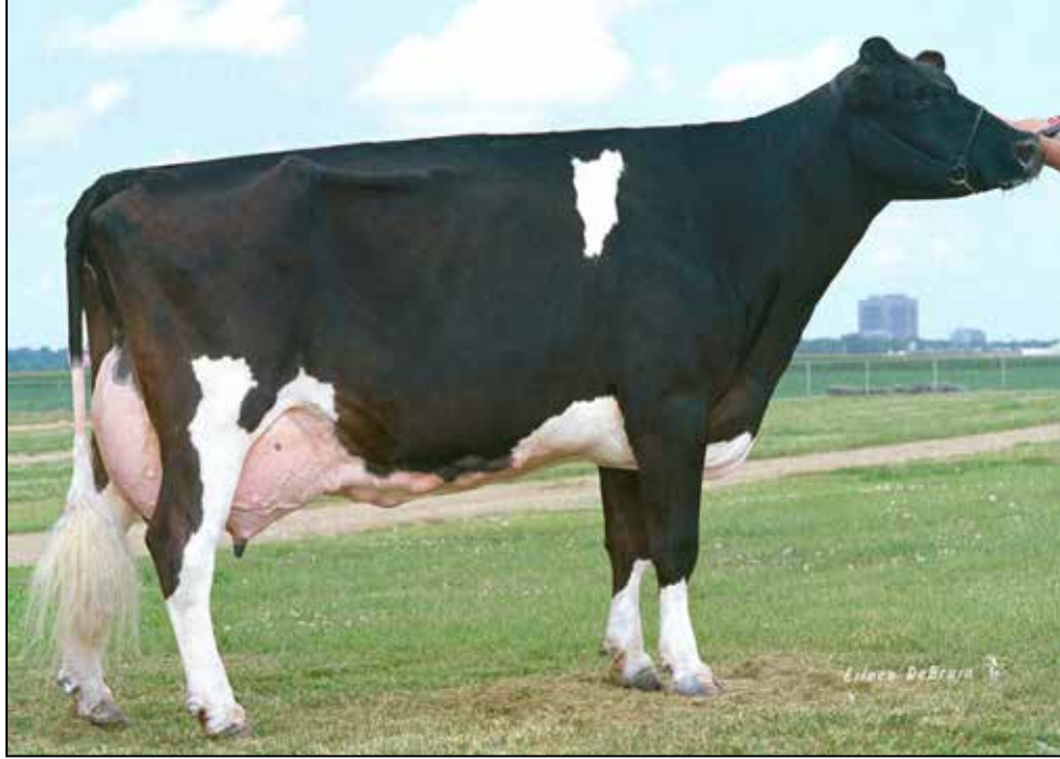
AB SUNBUCK MYSTIC EX-92 EEEEE 2E DOM 5TH DAM OF LOT 58