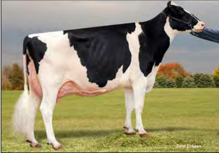
WENDY-OAKS DOORMAN DAYDREAM VG-88 VG-MS @ 3-07 SELLS AS LOT 24