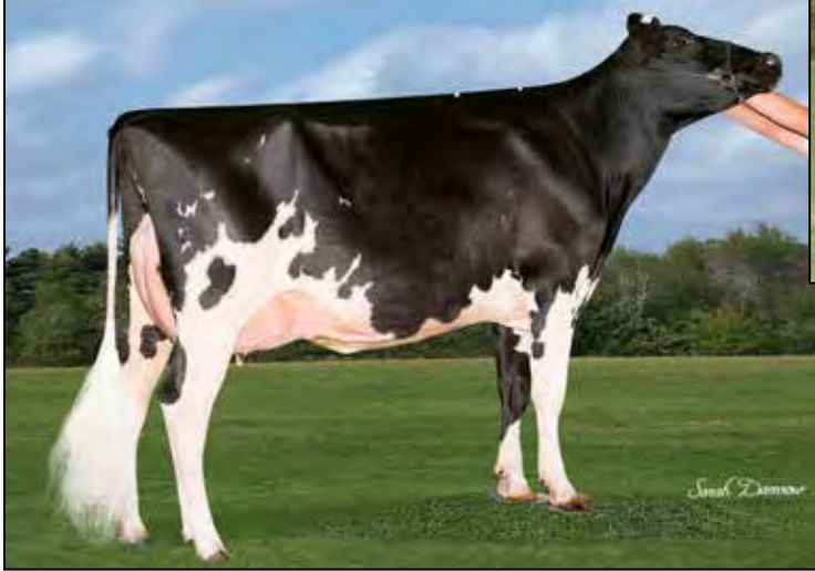
WENDY-OAKS CHELIOS MOOLA EX-92 EX-MS 2E SELLS AS LOT 21