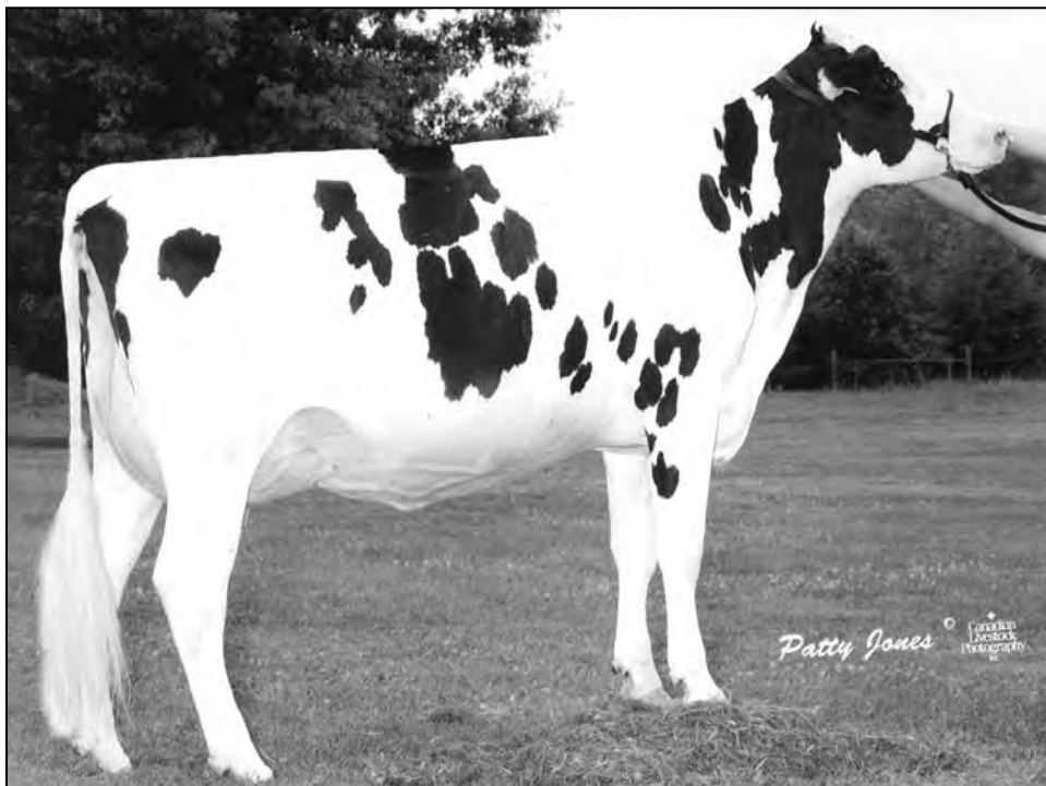
AMLAIRD SKYCHIEF MIRACLE-ET EX-91 EX-MS 4TH DAM OF LOT 7