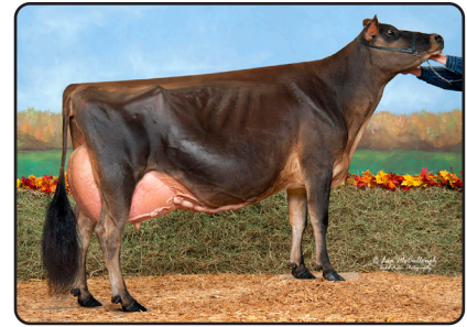
Harmony Corners Fozzy "EX-95"

2x HM Grand Champion All-American Show 2014 Maternal Sister to Dam of Lot 113