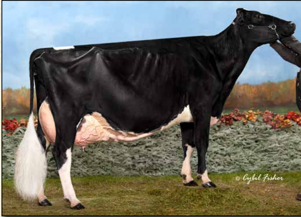
STONE-FRONT IRON PASTA EX-96 2E 5TH DAM OF LOT 12 All-American 125,000 Lb Cow 2011