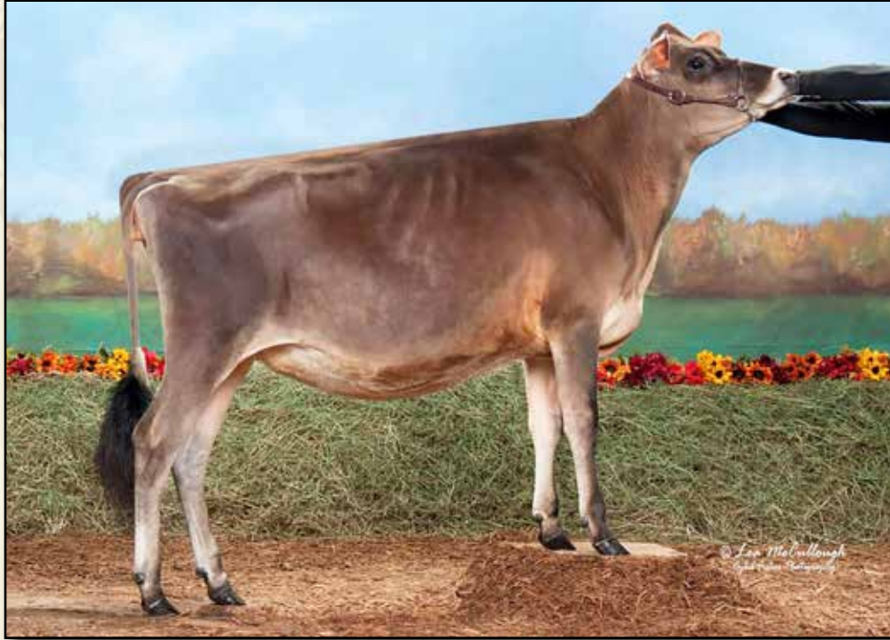
TIERNEYS GETAWAY TO LONDON VG-85% 2ND DAM OF LOT 25 National Junior Champion 2014