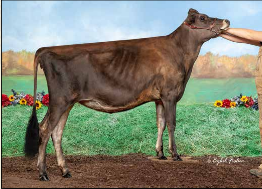
AU-SUM-VIEW RAZBERI VG-86% DAM OF LOTS 35 & 36