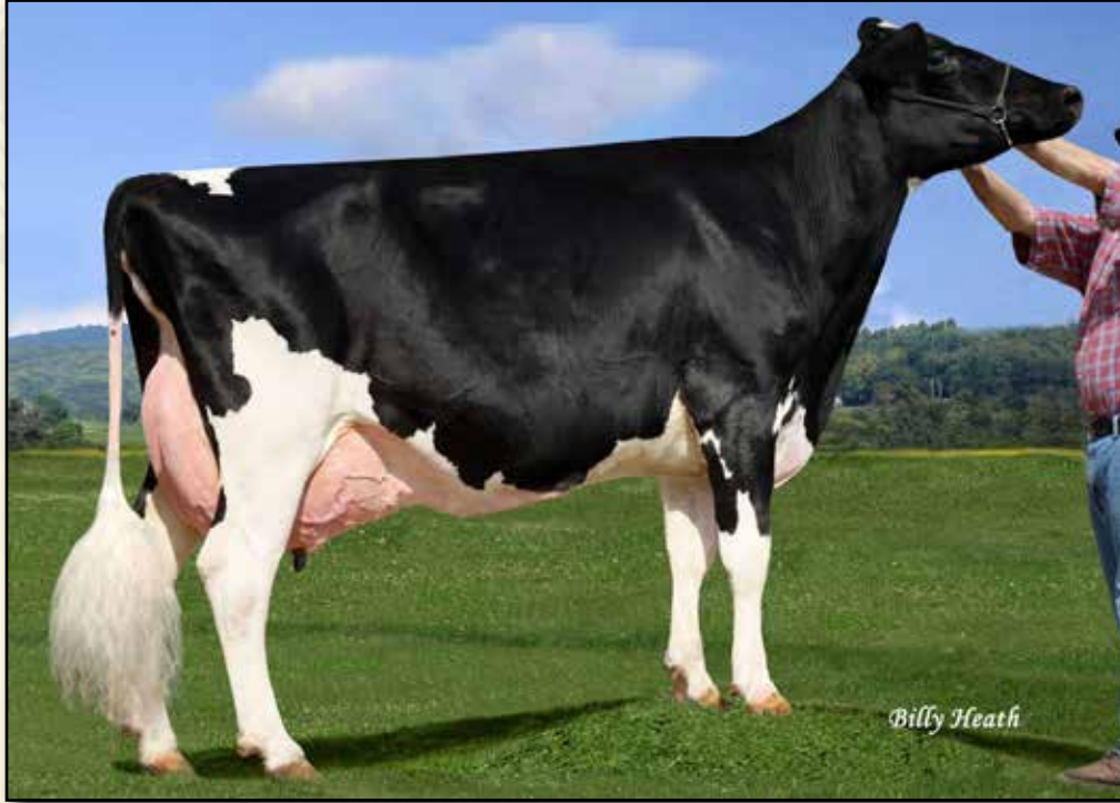
MS ANDIS SHOTTLE ANEEDA-ET EX-95 2E 3RD DAM OF LOTS 4 & 5 1st 5-Year-Old, Northeast Fall National 2009