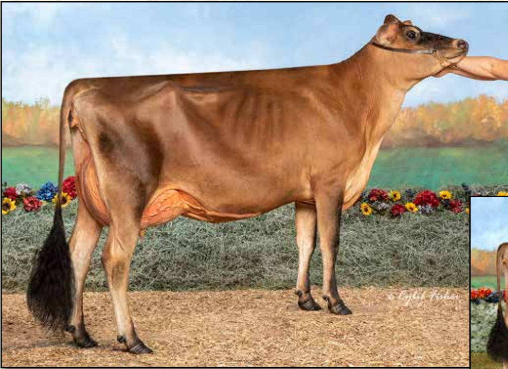
GL&SC TEXAS LYDIA VG-88% SELLS AS LOT 23

Intermediate Champion, Premier National Junior Show 2022