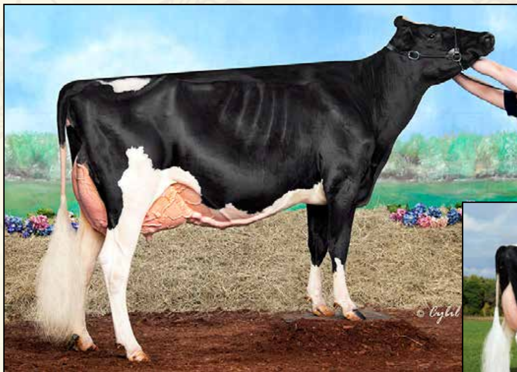
MS ABSOLUTE BLISS-ET EX-94 2E 3RD DAM OF LOT 3

Nominated All-American Senior 2-Year-Old 2016