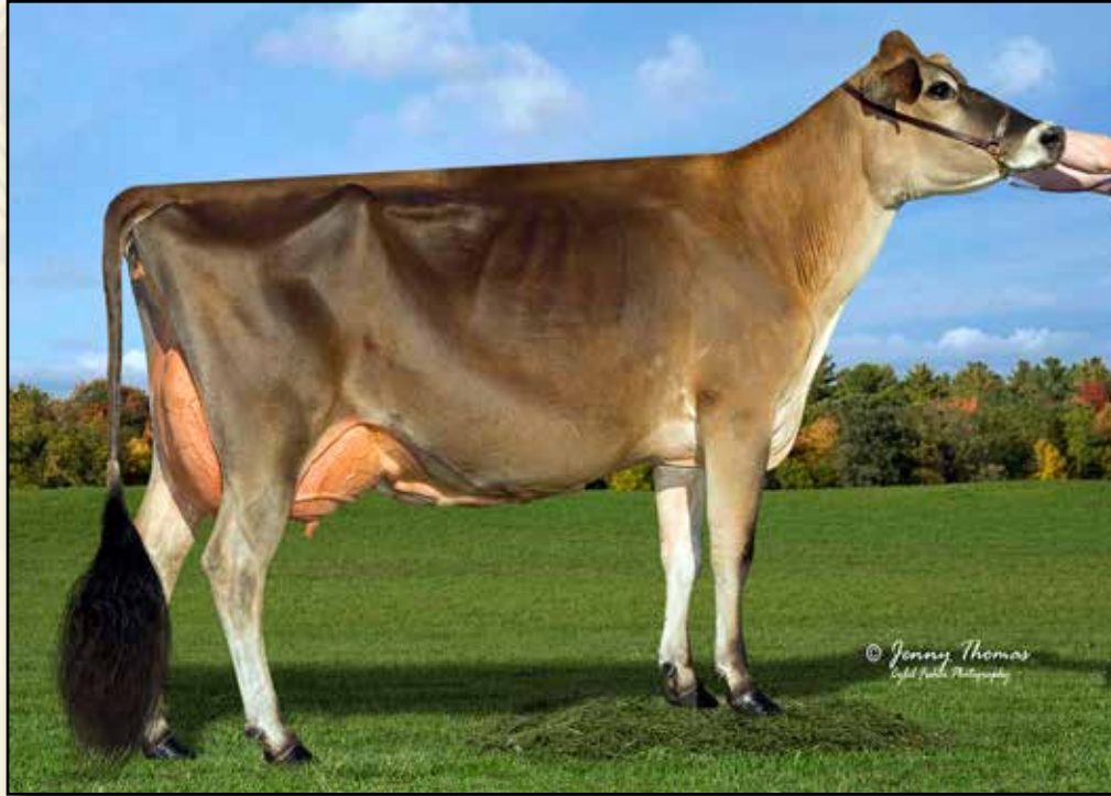
TIERNEYS INCENTIVE LUAU EX-92% 2ND DAM OF LOT 28 1st Aged Cow, Eastern States 2022