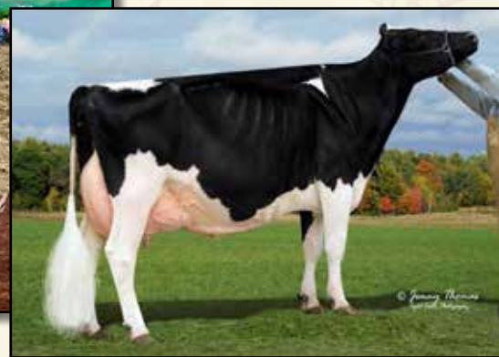
MS EXELS DUNDEE BEAUTY EX-95 3E 5TH DAM OF LOT 3

Nominated All-American Senior 2-Year-Old 2016