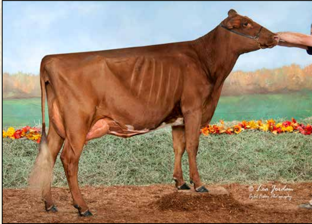
OLD-BANKSTON JC LIPSTICK-ET EX-90 DAM OF LOT 18 HM All-American Yearling in Milk 2018