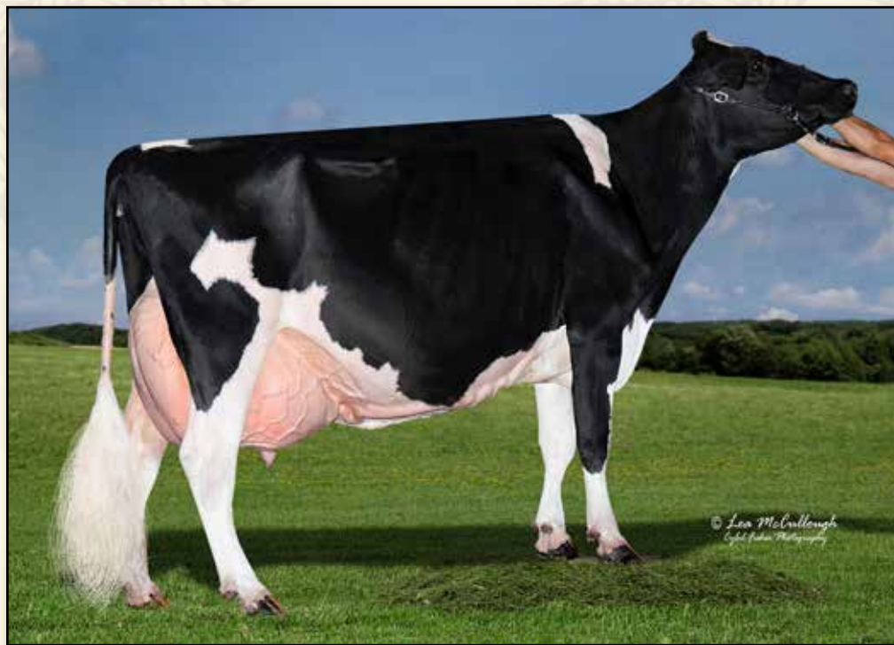
IN-TIM-IDATE LILLIE WILD-ET EX-94 2E 4TH DAM OF LOT 10