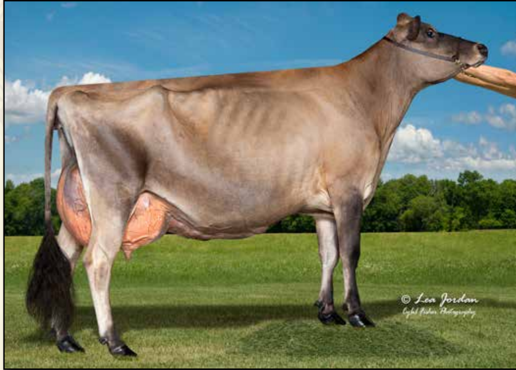
FOUR-HILLS RESPONSE BAHAMA-ET EX-92% FULL SISTER TO 3RD DAM OF LOT 37 Nominated Junior All-American 5-Year-Old 2020