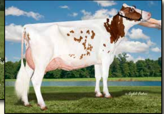
RAG-EM AWESOME ALLEY-RED-ET EX-91 DAM OF LOTS 1 & 2