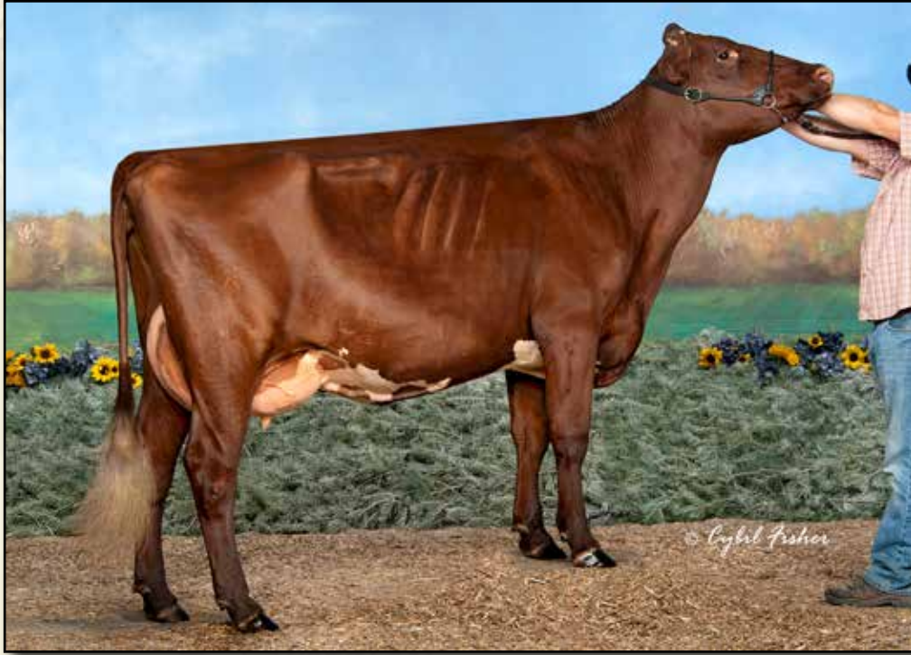
CHERRYLOCK LOVERS LIRIANO EX-90 2E 2ND DAM OF LOT 17

Reserve Junior All-American Jr 2-Year-Old 2015