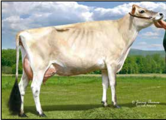
TIERNEYS DUAISEOIR TOPAZ EX-91% 3RD DAM OF LOT 26