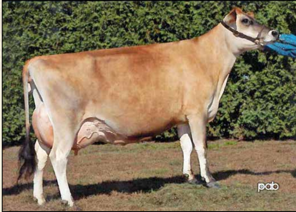
TIERNEYS JUDE LETICIA {5} EX-94% SAME FAMILY AS LOT 27 1st Aged Cow, Eastern States 2009