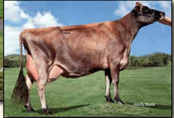
SHEER GRACE EX-95% 2ND DAM OF LOT 21; 3RD DAM OF LOT 22 Nominated ABA All-American 5-Year-Old 2006