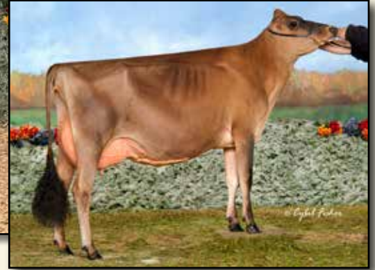
ROLLING SPRINGS VR LAYLA EX-93% 2ND DAM OF LOT 23

Intermediate Champion, Premier National Junior Show 2022