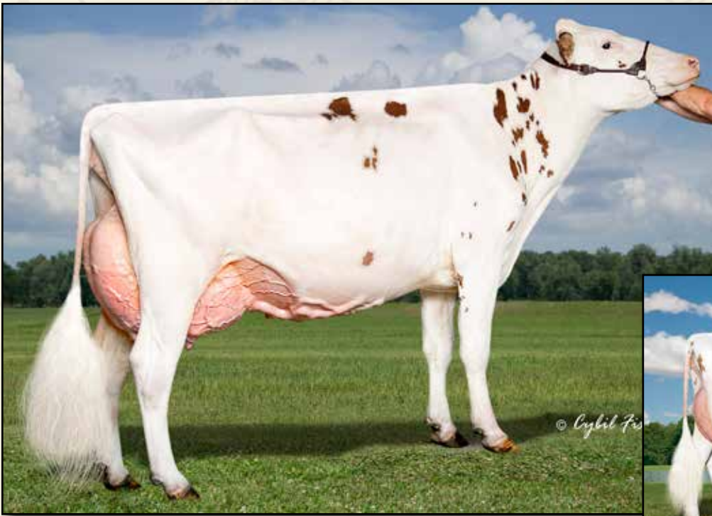
MS ROLL-N-VIEW ALTHEA-RED-ET EX-94 2E 2ND DAM OF LOTS 1 & 2 Nom All-American R&W Junior 2-Year-Old 2015