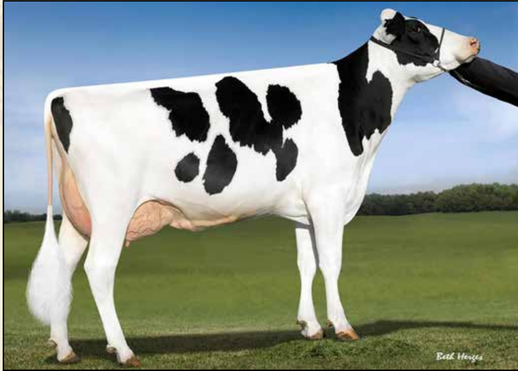
OCD SUPERSIRE 9882-ET VG-86 2ND DAM OF LOT 11