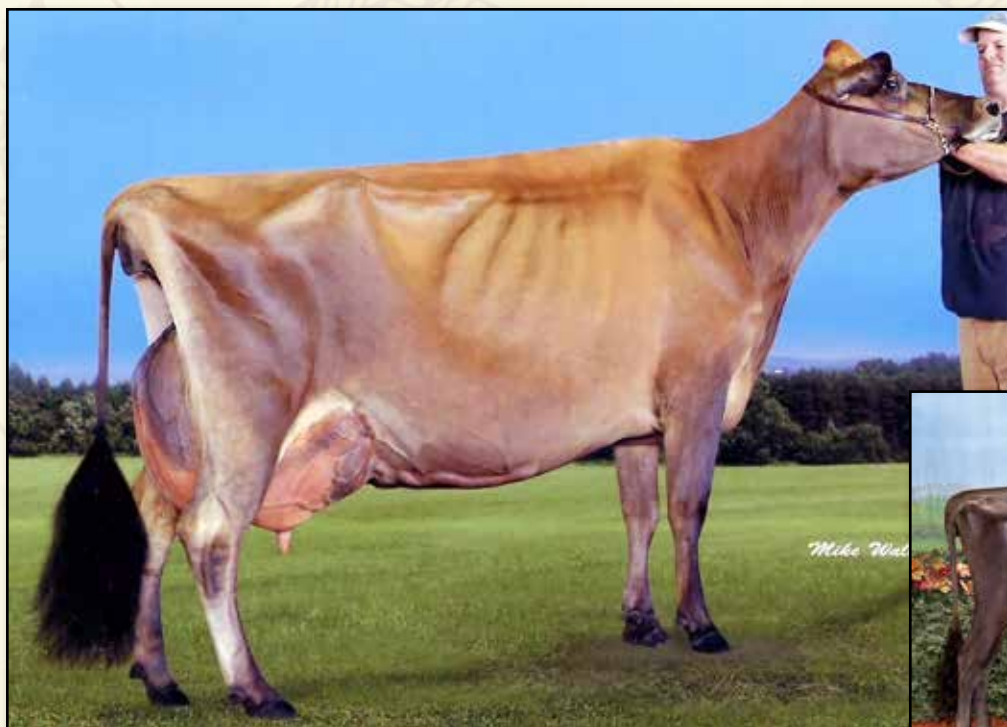
TIERNEYS TEQUILA LADA EX-95% 4TH DAM OF LOT 29 Grand Champion, Franklin Co. (NY) 2016