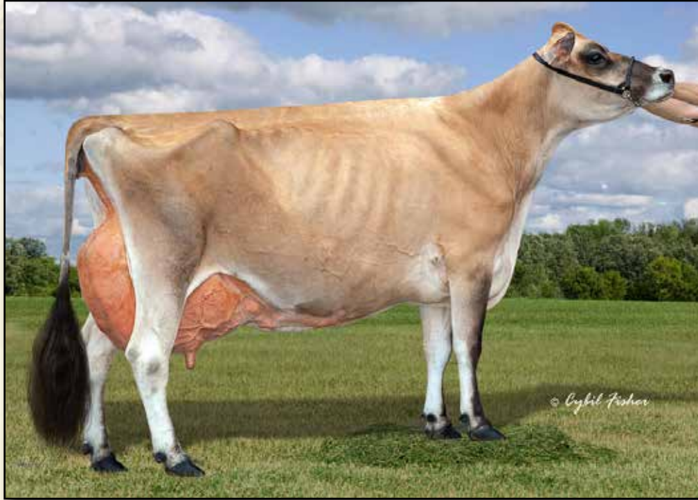
EDN-RU GETAWAY JEMINIS JINGER EX-95% DAM OF LOT 24