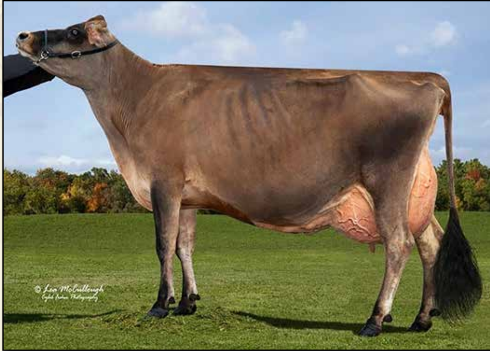
KLINEDELL H GUN PALINE EX-95% SAME MATERNAL FAMILY AS LOT 42