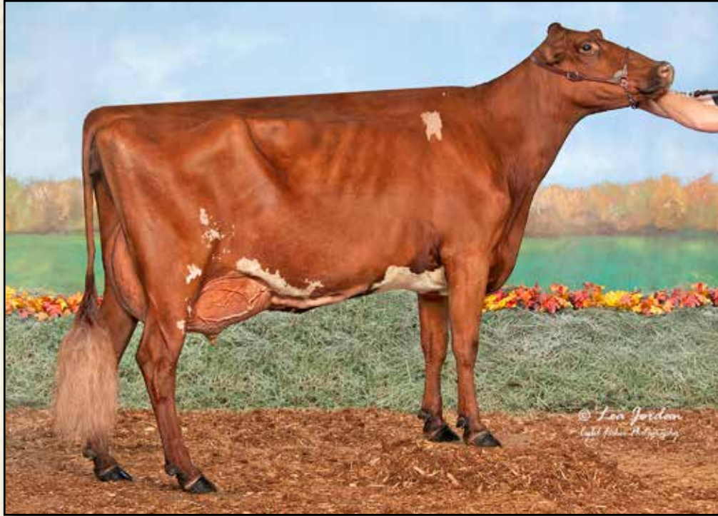
ECUAFARM ADVENTURE NAOMI EX-90 2ND DAM OF LOT 16