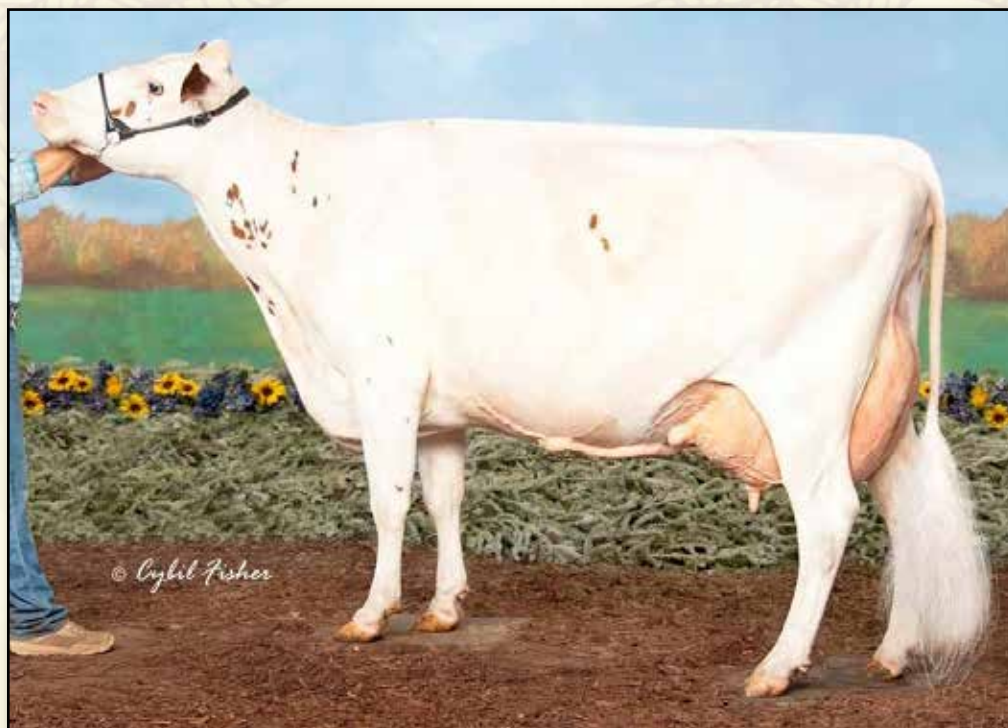
JOMILL POKER KEEGAN EX-94 4E DAM OF LOT 15