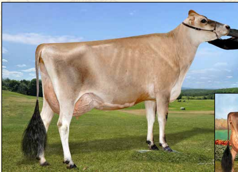
REXLEA JOEL KAROLINE EX-93% 2ND DAM OF LOT 38