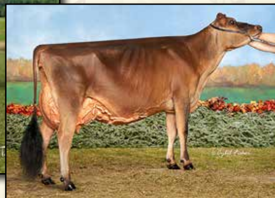
REXLEA JOEL KARAUSEL VG-89-CAN FULL SISTER TO 2ND DAM OF LOT 38

ABA Reserve All-American 4-Year-Old 2021