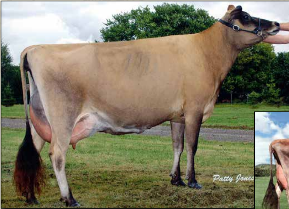
PREMONITION GRACE EX-95-2E-CAN 3RD DAM OF LOT 21; 4TH DAM OF LOT 22 All-Canadian 5-Year-Old 2004