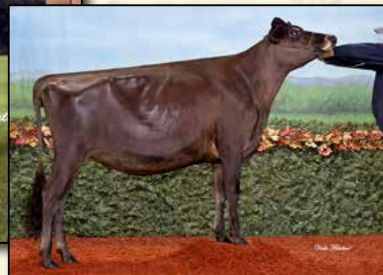
TIERNEYS COMERICA LADY A VG-85-CAN FULL SISTER TO 2ND DAM OF LOT 29 Junior Champion, Royal Winter Fair 2017