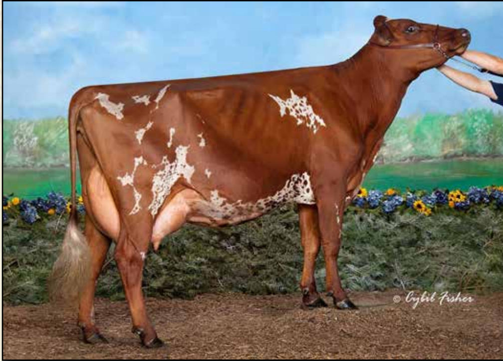
SPRING-VALE BURDETTE APPLE EX-91 DAM OF LOT 14

1st Senior 2-Year-Old, Mid-Atlantic Junior Show 2012