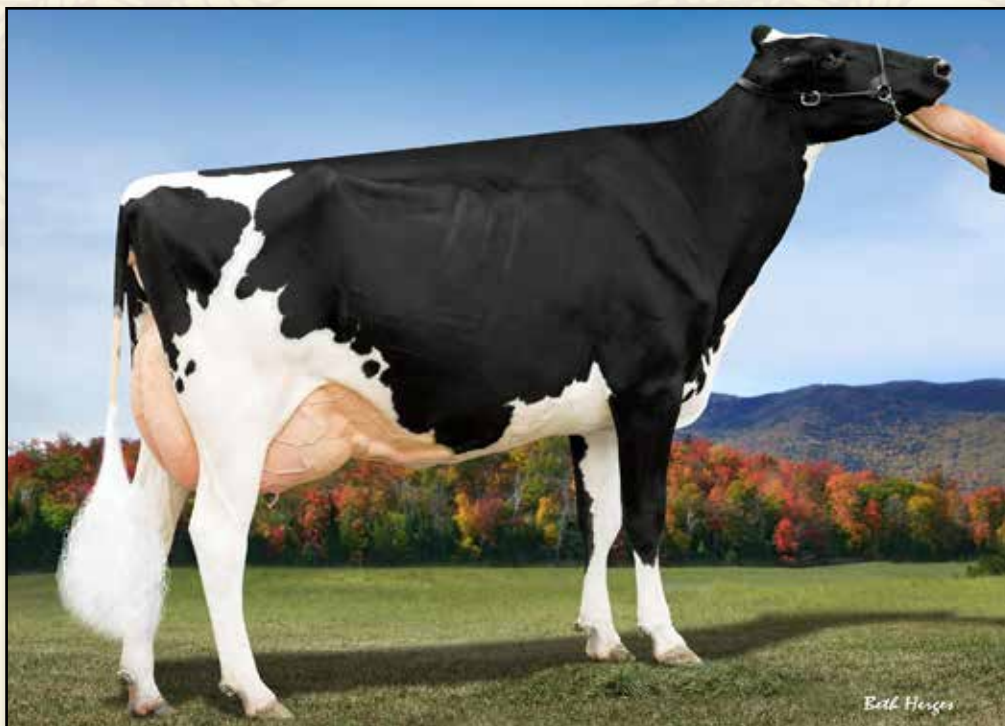
REGANCREST-GVH ARIZONA-ET EX-94 3E 3RD DAM OF LOT 13