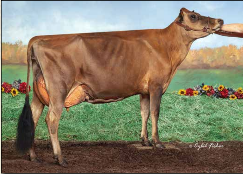
RAVINEST PREMIER JADA EX-90% DAM OF LOT 30