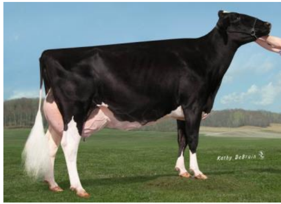
MGD: Gloryland-I Goldwyn Locket

Sire: Silverridge Endure Dam: Ms Golden-Oaks Miss Lady-ET VG-85 MGS: Mountfield Ssi Dcy Mogul-ET TR TV TL TY TD MGD: Gloryland-I Goldwyn Locket EX-94 04-11 3x 365d 37310m 5.0 1855f 3.4 1264p MGGS: Braedale Goldwyn TV TL MGGD: Gloryland Lakota Rae-ET VG-88 DOM 02-03 2x 365d 22850m 3.8 857f 3.3 751p