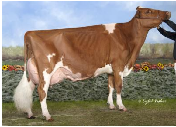
Dam: Wilstar-Rs TLt Limited-Red

Sire: Scientific B Defiant-ET RC TV TL TY TD Dam: Wilstar-Rs TLt Limited-Red MGS: Ladino Park Talent-Imp-ET RC TV TL EX-90 MGD: Wilstar-Rs Kite Lover-Red MGGS: Markwell Kite-ET RC TV TL MGGD: Wilstar-Rs Rub Lazer-Red-TW EX-91 02-11 2x 365d 30530m 3.5 1074f 3.2 973p