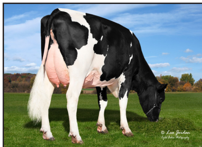
AOT Mark Hotshot-ET *RC "VG-87" (Granddam of Lots 48 & 49)