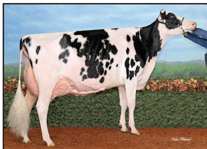
Idee Windbrook Lynzi-ET "EX-95 4E" Supreme Champion Royal Winter Fair 2019 (Granddam of Lots 62 & 63)