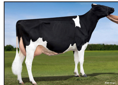
Lylehaven Atwood Lyllly-ET "EX-95 3E" (Dam of I & J)

68655585 Excellent-95 EEEEE 3E *TL *TD 5-11 2x 365d 41,280 4.4 1831 3.2 1334 8-00 2x 365d 37,190 4.5 1683 3.3 1221 4-04 2x 365d 32,570 4.5 1461 3.4 1098 Life: 2794d 224,400 4.7 10467 3.4 7740" •1st 5 Yr Old & HM Sr. Ch. NY Spring Show 2015 •4th Aged Cow Northeast Fall National 2016 •2nd 150,000 lb. Cow Northeast Fall Nat'l 2018 •Topped Lylehaven Dispersal at $70,000 S: Maple-Downs-I G W Atwood-ET