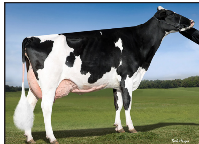
MDF Goldwyn Breezier 39-ET "EX-94 3E" (Dam of O & P)