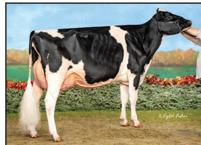
S-S-I Doc Have Not 8783-ET "EX-92" Nom. All-American Milking Yearling 2019 (Full Sister to Granddam of Lots 17 - 23)