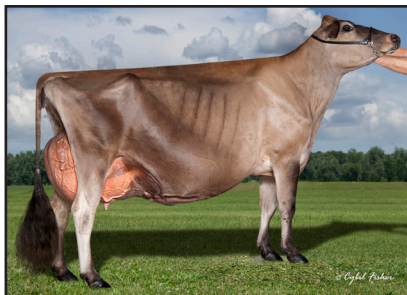
Edgebrook Tequila Madison-ET "EX-93" All-American Sr. 3 Year Old 2016 (Granddam of Lot J13)

Bred 1/21/23 to Milksource Metallica (sexed semen)