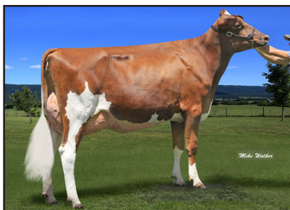
Sunspark Apple Crumble-Red-ET "EX-92 2E" (Dam of Lot 57)

Bred 7/15/23 to Cherry-Lily Zip Luster-P-ET 7HO14160 GTPI +2902