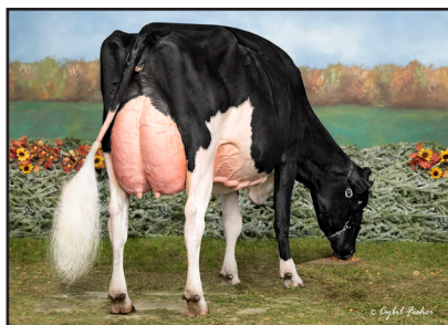
S-S-I Doc Have Not 8784-ET "EX-96"