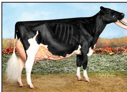
Rosiers Blexy Goldwyn-ET "EX-97 3E" Supreme Champion World Dairy Expo 2017 (Dam of Lot 30)