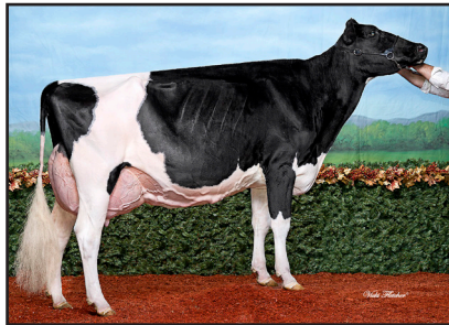
St-Jacob Goldwyn Hazel-ET "EX-94 4E" Grand Champion Autumn Opportunity 2015 (Maternal Sister to Lots 35 & 36)

•Sold for $15,000 2023 Shades of Excellence