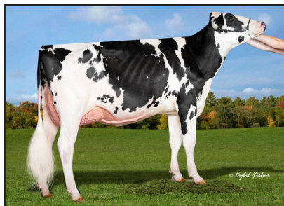
Ducketharvue Cvet Gigi-ET "EX-94" (Maternal Sister to Dam of Lot 45)

Bred 3/23/23 to Cherry-Lily Zip Luster-P-ET 7HO14160 (Due 12/30/23)