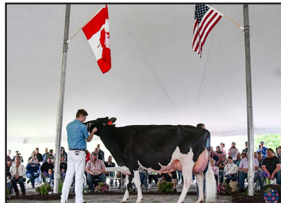
S-S-I Doc Have Not 8784-ET "EX-96" Sold for $1,925,000 in 2022 (Dam of Lot 9)

3235342386 *TP *TC *TL *TD GTPI +3031 PTA +1411M +.14% +94F +.07% +64P 81R 8/23 PTA +834NM +4.1PL 3.05SCS -.2DPR 1.6%DCE PTA +2.82T +2.21UDC +1.46FLC 80R 8/23 A2/A2 • BB 2-00 2x 52d 3,890 4.5 176 3.0 115"RIP S: Siemers Rengd Perfect-ET