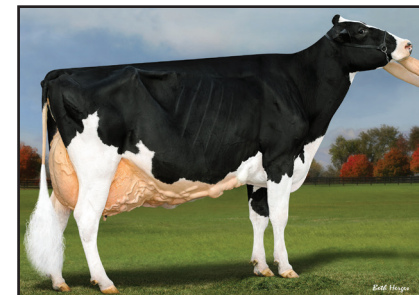
Blondin Goldwyn Subliminal-ETS "EX-97 4E" 2022 Global Cow of the Year (Granddam of Lot 40)