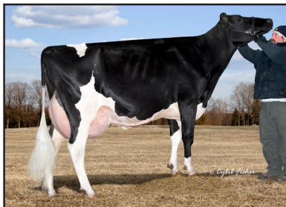
Welk-Crest W Pro Dazzler-ET "EX-92" (Third Dam of Lot 73)

Bred 6/12/23 to Regancrest Dundee-ET 94HO10276 (sexed semen) due 3/17/24