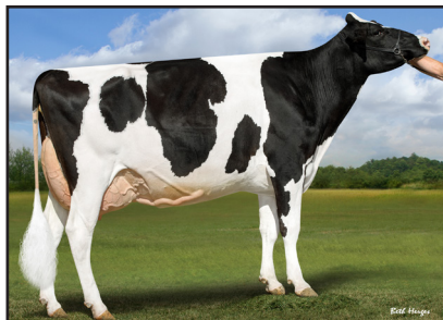
Luck-E Doc Anacond-ET "EX-92" (Lot 29)