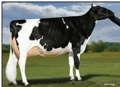
Idee Doorman Lysa "EX-94 2E" Res. AA & Res. AC Jr. 3 Year Old 2019 (Dam of Lots 62 & 63)