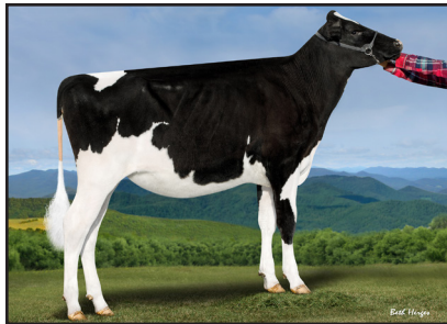
Blexys Sidekick Blex-ET "VG-86" (Dam of Lot 34)