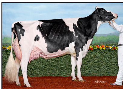
Pierstein Windbrook Alacazam "EX-94 2E" (Lot 37, Dam of Lot 38)