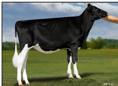
Duckett Hayk Holly 1233-ET (Full Sister to Dam of A)

Buyer is purchasing rights to control the next IVF session(s). Buyer is guaranteed IVF sessions until a minimum of 8 #1 or #2 IVF embryos are produced. Embryo grades are determined at the time of transfer if fresh embryos or at time of freezing if freezing is requested by buyer. Buyer keeps all resulting embryos from these controlled IVF sessions. Buyer is responsible for all costs of the aspiration and mating sire decisions. Holly 1230 is housed at Woodmansee Holsteins.