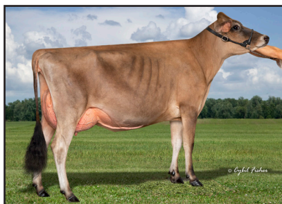
GMBV Joel Dazzle-ET (Dam of Lot J12)

Bred 9/13/23 to River Valley Victorious-ET 7JE5032 (sexed semen)