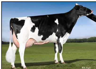
MDF Goldwyn Breezier 39-ET "EX-94 3E" (Lot 39)