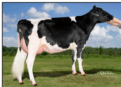
Maple-Downs-DT Doc Joyride "VG-87" (Dam of Lot 47)