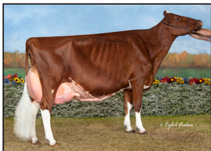
KHW Regiment Apple-Red-ET "EX-96 4E" Grand Champion International R&W Show 2011 (Third Dam of Lot 58)

Bred 8/22/23 to Mr Ansly Addiction-P-Red-ET 594HO895 GTPI +2057 (sexed semen)