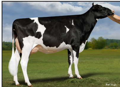
Duckett Perfect Hallie-ET