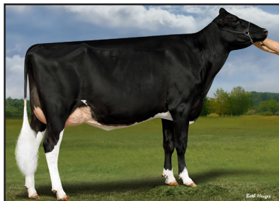
Duckett Perfect Holly-ET (Dam of Lots 11 - 14)