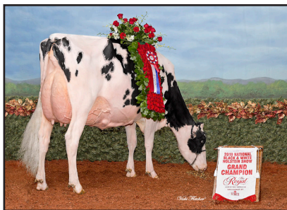
Idee Windbrook Lynzi-ET "EX-95 4E" Supreme Champion Royal Winter Fair 2019 (Full Sister to Dam of Lot 69)