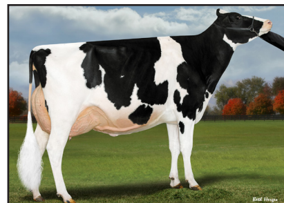
Ladyrose Caught Your Eye-ET "EX-94" 2x All-American (Granddam of F - H)

3224437486 *TR *TP *TC *TY *TV PTA +974M +84F +54P 81R 8/23 PTA +3.27T +3.23UDC +1.11FLC GTPI +3003