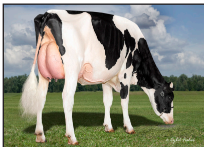
Duckett Tstruck Hannah-ET All-Wisconsin Milking Yearling 2023 (Lot 1 & Dam of Lot 2)