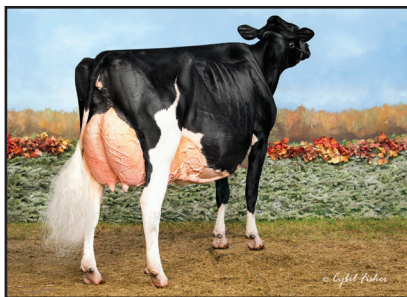
Rosiers Blexy Goldwyn-ET "EX-97 3E" Supreme Champion World Dairy Expo 2017 (Granddam of Lot 32)