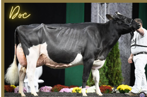
A TATOO son from the record setting cow and Reserve AA 4YO S-S-I Doc Have Not 8784, EX-96