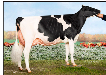
Jacobs Gold Chip Attorney-ET "EX-94 2E" HM All-Canadian Sr. 3 Year Old 2019 (Same Cow Family as Lot 60)

Bred 9/15/23 to Cherry-Lily Zip Luster-P-ET 7HO14160