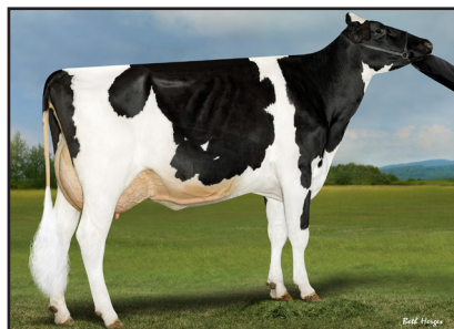
Jacobs Unix Viola-ET "VG-85" (Dam of Q & R)