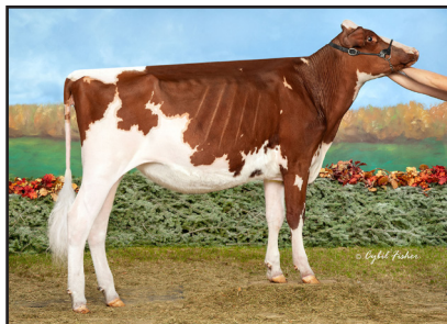
Sagerbrae RS Cha Cho-Red-ET "GP-84" Nom. All-American R&W Spring Yrlg. 2021 (Dam of Lot 58)