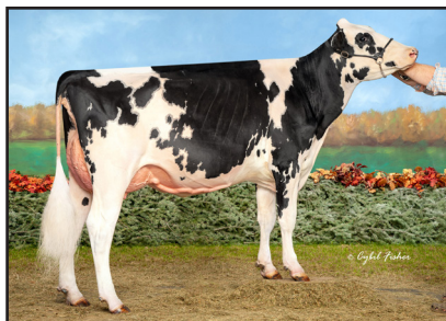
Rose Vega Emilio Joan "EX-92" HM All-American Summer Jr. 2 Year Old 2021 (Dam of Lot 59)

Bred 9/13/23 to Jacobs Vogue-ET 94HO18485 GTPI +1668 (Doorman x Valana)