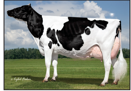
Dubeau Dundee Hezbollah "EX-92" Int. Champion International Show 2009 (Granddam of L - N)