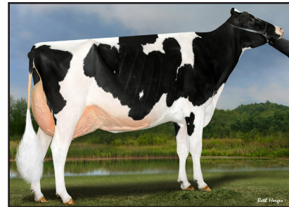
Ms Sid Blexy-ET "EX-94" HHM All-American Jr. 3 Year Old 2020 (Maternal Sister to Dam of Lot 34)