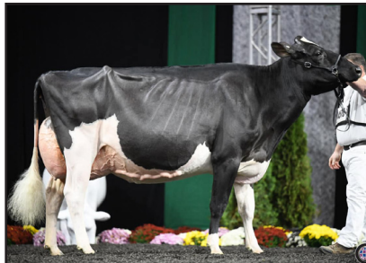
S-S-I Doc Have Not 8784-ET "EX-96" Res. All-American 4 Year Old 2022 (Dam of Lots 24 & 25)