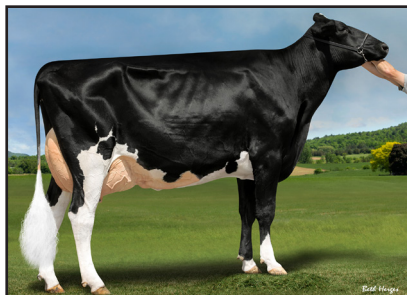
Midas Touch Solomon Cher-ET "EX-91 2E" Res. All-American Spring Calf 2017 (Dam of Lot 46)

•Res. All-American Fall Calf 2019 •Nom. All-American Milking Yearling 2020