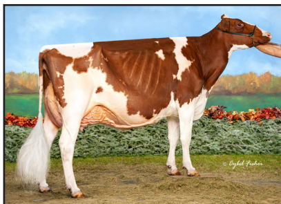
Fantasy-Found Luxury-Red "EX-94" Res. All-American R&W 5 Year Old 2021 (Dam of Lot 71)