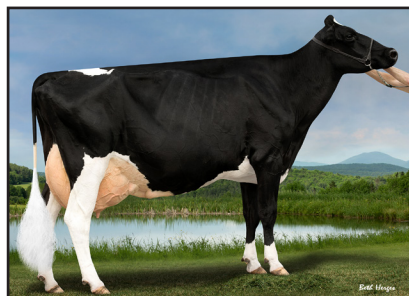
VT-Pond-View Gold Autumn-ET "EX-93 3E" (Dam of S)