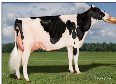
Duckett Tstruck Hannah-ET All-Wisconsin Milking Yearling 2023 (Lot 1 & Dam of Lot 2)