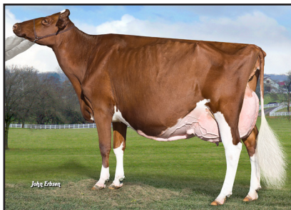
KHW Regiment Apple-Red-ET "EX-96 4E" Grand Champion International R&W Show 2011 (Granddam of Lot 52, Third Dam of Lots 53 - 56)

840 3260842977 99%RHA-I *RC Born September 9, 2022 H.N. 1184