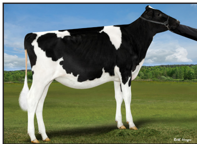
Oakfield Tatoo Fancylike-ET (Dam of C)

•Res. All-Wisconsin Summer Yearling 2021