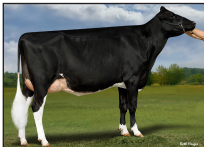
Duckett Perfect Holly-ET (Dam of Lots 11 - 14)