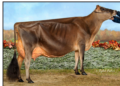
Elliotts Blackstone Charlotte "EX-94" ABA All-American 5 Year Old 2017 (Maternal Sister to Lots J2 - J5)