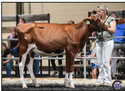
Jakks Analyst Comet-Red-ET (Lot 44)

•1st Winter Calf MD State Fair R&W Show 2023