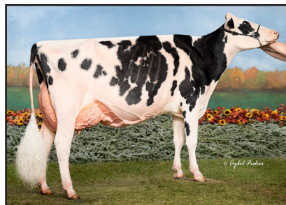
Sweetview Dempsey Hurryup "EX-94" All-American Summer Jr. 2 Yr Old 2019 (Dam of Lot 61)

Bred 9/18/23 to Oh-River-Syc Wichmann 551HO4738