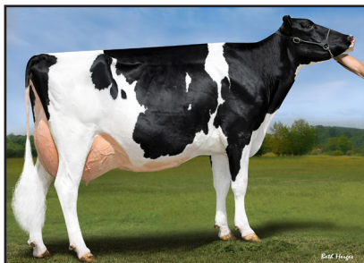
Miss Wndbrk Blessing-ET (Lot 33)