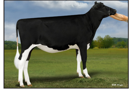
Duckett Conway Hope-ET (Dam of Lots 17 - 23)