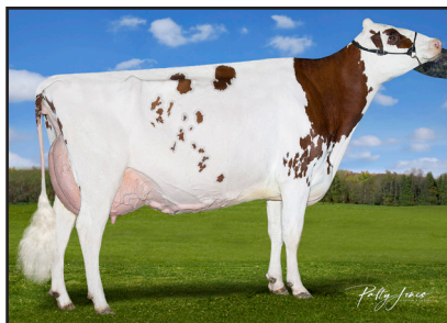
Vogue Loyola Macy PP-Red-ET "EX-94" (Dam of B)

Buyer is purchasing rights to control the next IVF session(s). Buyer is guaranteed IVF sessions until a minimum of 8 #1 or #2 IVF embryos are produced. Embryo grades are determined at the time of transfer if fresh embryos or at time of freezing if freezing is requested by buyer. Buyer keeps all resulting embryos from these controlled IVF sessions. Buyer is responsible for all costs of the aspiration and mating sire decisions. Macy is housed at Duckett Holsteins.