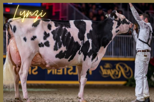
A CHIEF son from Canadian Cow of the Year and RAWF Champion Idee Windbrook Lynzi, EX-95