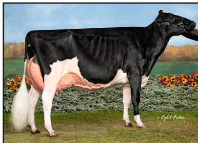
S-S-I Doc Have Not 8784-ET "EX-96" Res. All-American 4 Year Old 2022 (Dam of Lot 3, Granddam of Lot 4)

GTPI +2857 PTA +1814M -.02% +64F -.01% +54P 80R 9/23 PTA +677NM +3.0PL 3.01SCS -.04DPR 2.1%DCE PTA +3.04T +2.53UDC +1.96FLC 80R 9/23 A2/A2 • AB