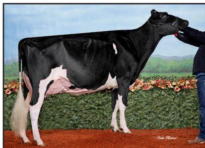
Knonaudale Orangecrush "EX-93 5" Nom. All-American & All-Canadian 2017 (Granddam of Lots 50 & 51)