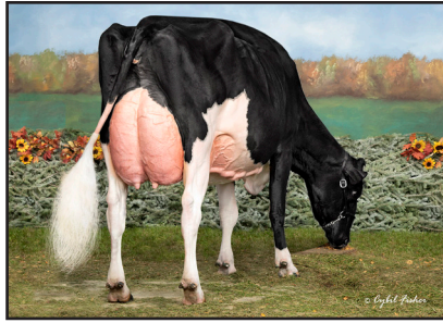
S-S-I Doc Have Not 8784-ET "EX-60" Res. All-American 4 Year Old 2022 (Dam of Lots 24 & 25)