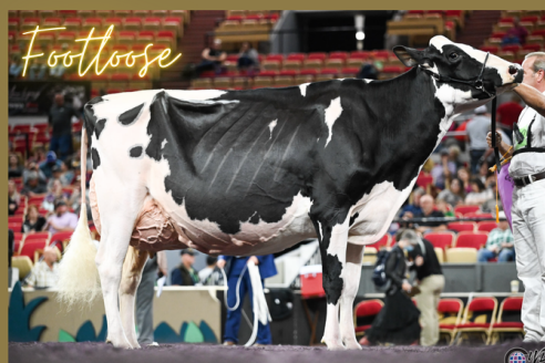
A TATOO son from the 2022 WDE Supreme Champion Oakfield Solomon Footloose, EX-96