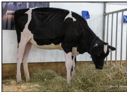
Duckett Energy 1158 Dee-ET (Dam of E)