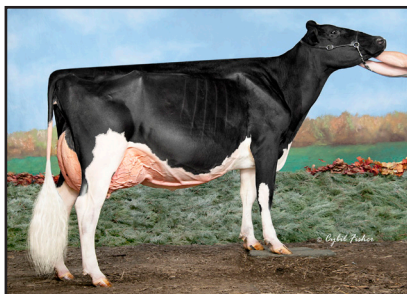
Savage-Leigh Style In-ET "EX-92" HM All-American Sr. 3 Year Old 2020 (Dam of Lot 41)

145571588 99%RHA-I Born December 10, 2022 H.N. 3