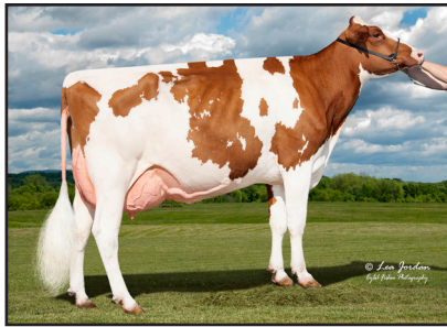
Intense Jordy Camille-Red-ET "EX-91" (Dam of Lot 44)