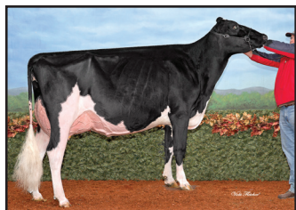
Midas-Touch Jedi Jangle-ET "EX-95 2E" HM All-American Jr. 2 Year Old 2018 (Third Dam of Lot 47)