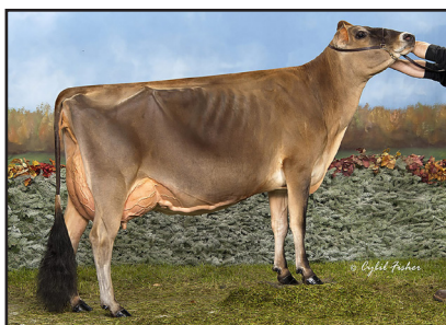
Elliotts Cosmo Action-ET "EX-93" ABA All-American Sr. 3 Year Old 2014 (Maternal Sister to Lots J2 - J5)