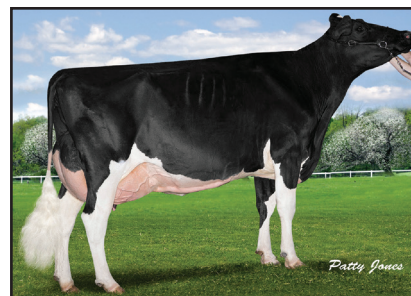
Ms Apples Applause-ET *RC "EX-94 2E" (Granddam of Lot 57)

CAN12075586 Excellent-92 EX-MS 2E 6-09 7-02 2x 365d 30,930 4.4 1373 3.5 1085 4-00 2x 337d 28,120 4.6 1305 3.5 979 5-01 2x 342d 27,580 4.6 1270 3.5 969 6-02 2x 306d 25,590 4.3 1113 3.5 905 3-00 2x 329d 23,930 4.4 1051 3.6 850 Life: 2098d 155,430 4.5 6979 3.5 5482 S: Tiger-Lily Ladd P-Red-ET