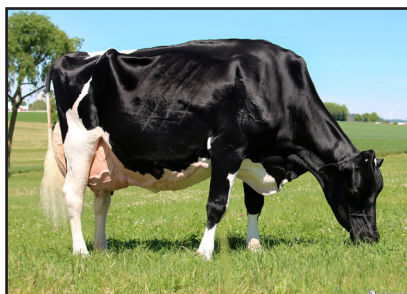
Rosiers Blexy Goldwyn-ET "EX-97 3E" Supreme Champion World Dairy Expo 2017 (Dam of Lot 31)

Ms Sid Blexy-ET EX-94 MS:96 •HHM All-American Jr. 3 Year Old 2020 •Grand Champion Mideast Fall National 2021