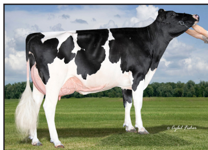
AOT Salvatore Hiccup-ET *RC "VG-88" (Third Dam of Lots 48 & 49)