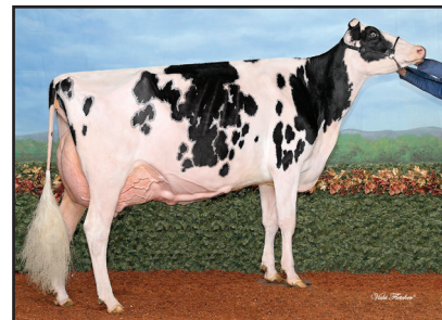
Idee Windbrook Lynzi-ET "EX-95 4E" Canadian Cow of the Year 2020 (Granddam of Lot 64)