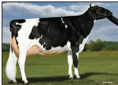
Idee Doorman Lysa "EX-94 2E" Res. AA & Res. AC Jr. 3 Year Old 2019 (Dam of Lot 64)