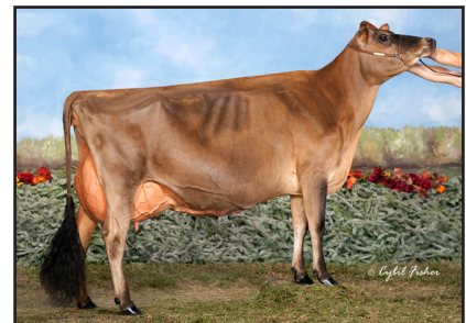
Milo Vindication Season "EX-94"