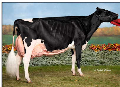
Ms Beautys Black Velvet-ET "EX-96 2E" Unanimous All-American 2021 & 2022 (Granddam of Lot 42)

840 3272442010 99%RHA-I Born March 13, 2023 H.N. 1271