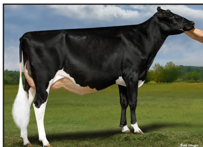
Duckett Conway Hannah-ET (Dam of Lot 16)

GTPI +2879 PTA +1905M -.01% +71F +.00% +59P 80R 9/23 PTA +715NM +2.5PL 3.03SCS -1.2DPR 2.0%DCE PTA +2.89T +2.67UDC +1.81FLC 80R 9/23 A2/A2 • AB