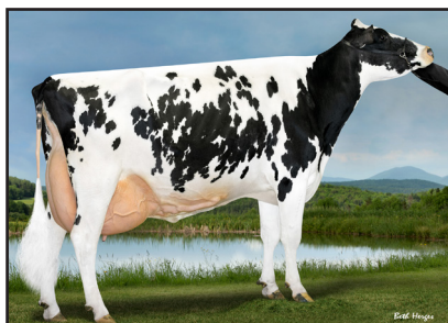
Comestar Alyska Aftershock-ET "EX-93 2E" (Dam of Lot 74)