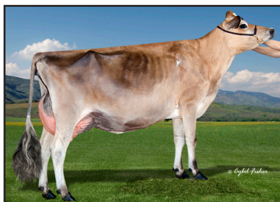
South Mountain Colton Ravish "EX-92" (Dam of Lot J9)

840 3232222755 JH1F JNS-TF Born March 1, 2023 AMID 1204