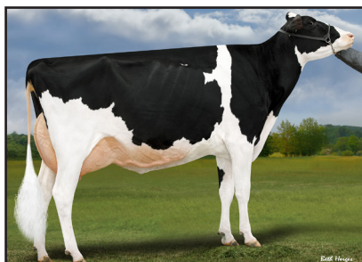
Garay Unix Brisca-ET "EX-91 EX-MS" (Dam of Lot 70)