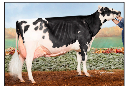
Harvue Atwood Ginger "EX-95 2E" Nom. All-American 5 Year Old 2018 (Granddam of Lot 45)

Harvue Duckett Drmn Gin-ET EX-94 Ducketharvue Cvet Gigi-ET EX-94 Duckett-Harvue Solo Gina EX-92 Ducketharvue Slim Gaby-ET EX-92