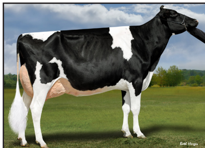
Kingsway Dempsey Nora "EX-95" (Dam of Lot 43)

840 3272442011 Born March 7, 2023 H.N. 1272