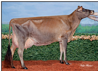
Arethusa Veronicas Comet-ET "EX-95" Grand Champion Royal Winter Fair 2010 (Dam of Lots J2 - J5)

840 3232222766 JH1F JNS-TF Born June 1, 2023 AMID 1215 S: Chilli Action Colton-ET