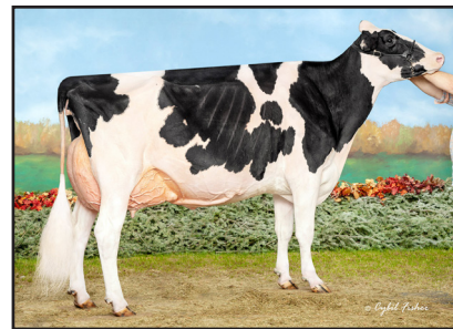
Jacobs Doorman Victoire-ET "EX-95 2E" All-American & All-Canadian Sr. 3 Yr Old 2019 (Granddam of Q & R)