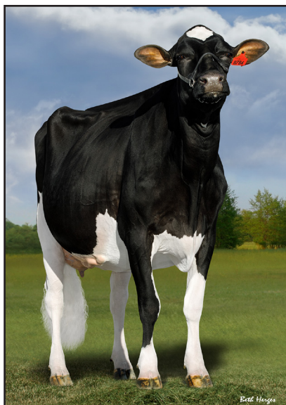
S-S-I Doc Have Not 8784-ET "EX-96" Res. All-American 4 Year Old 2022 (Granddam of Lots 20 - 23)

S-S-I Doc Have Not 8784-ET EX-96 EEEEE GTPI +2758 A2/A2 • AB PTA +1645M +49F +54P +558NM 84R 8/23 PTA +3.6PL 3.03SCS -.7DPR 2.1%DCE PTA +3.00T +2.58UDC +.97FLC 84R 8/23 4-05 2x 320d 35,670 3.9 1404 3.1 1094 3-06 2x 297d 33,720 3.6 1218 3.1 1043 •Res. All-American 4 Year Old 2022 Fly-Higher Jedi Havenot-ET VG-87-5Y-CAN 3-05 3x 365d 31,495 3.2 994 3.2 1000 Cookiecutter Masy Hashes VG-85 VG-MS 3-11 3x 365d 39,630 3.6 1436 3.1 1209 Life: 1393d 121,290 3.9 4762 3.0 3691 Cookiecutter Mom Halo-ET VG-88 EX-MS DOM 2-00 2x 365d 35,280 5.2 1819 3.7 1304 •Global Cow of the Year 2019 Cookiecutter Gld Holler-ET VG-88 DOM 2-03 2x 365d 40,730 3.5 1411 3.1 1250 •Nom. Int'l Cow of the Year 2016 Ms Kings-Rnsm Champ Haley-ET EX-90 GMD DOM 3-11 3x 365d 43,690 3.7 1625 2.9 1274 Regancrest-JDV Hanna-ET EX-90 GMD DOM 4-07 3x 365d 45,110 4.3 1922 3.0 1364 Long-Haven Rudolph Dee-ET 2E-90 GMD DOM 2-11 2x 365d 32,720 4.8 1565 3.8 1252 Life: 2306d 166,900 4.3 7099 3.5 5884 Regancrest Elton Disrael-ET VG-88 GMD DOM 2-04 2x 365d 33,617 4.5 1499 3.5 1169 Snow-N Denises Dellia EX-95 2E GMD DOM 7-06 2x 365d 35,610 4.0 1431 3.1 1103 Life: 2558d 180,240 3.9 7108 3.4 6065 •Grand Champion WI Spring National 1991 •Global Cow of the Year 2005 Snow-N Dorys Denise EX-90 2E GMD DOM 5-09 2x 365d 33,350 3.8 1256 3.1 1038