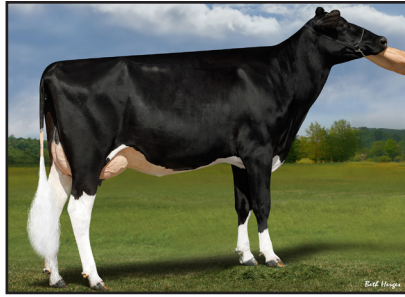
Duckett Perfect Heidi-ET (Lot 3 & Dam of Lot 4)