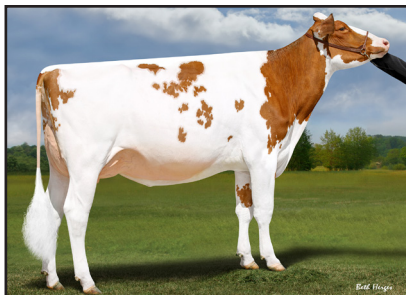
Beaver Ray Unstpbul Alamak-Red "EX-90" HM Int. Champion Mideast Spring R&W 2021 (Lot 52, Dam of Lots 53 - 56)