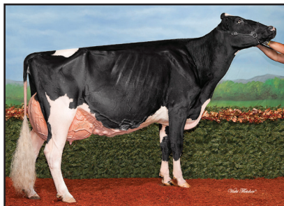
Ms Goldwyn Alana-ET "EX-96 2E" All-Canadian Mature Cow 2015 (Dam of Lot 37, Granddam of Lot 38)