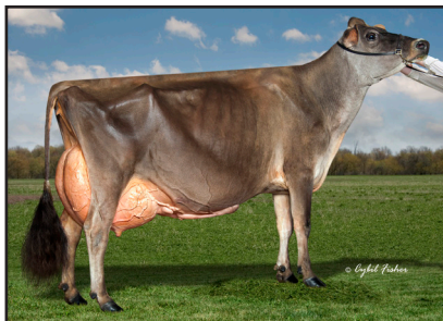
Arethusa HG Victoria-ET "EX-95" ABA All-American Jr. 2 Year Old 2014 (Dam of Lots J7 & J8)

Arethusa Vieja Tequila EX-93 Arethusa Impression Vena-ET EX-91 Arethusa Premier Valance EX-90 Arethusa Tequila Vaunt-ET EX-90