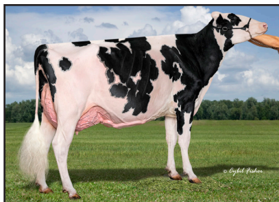
Duckett Doorman Ona-ET "EX-92" (Maternal Sister to Dams of Lots 50 & 51)

Bred 1/26/23 to MB-Luckylady Eye Candy-ET 7HO16104 and Duckett Pfct Has It All-ET 7HO16295 (due 11/02/23)