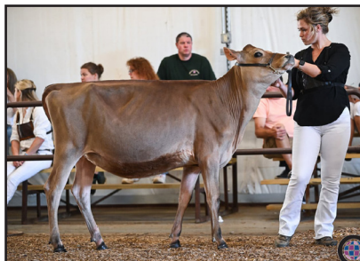
Arethusa Shut Out Silver-ET