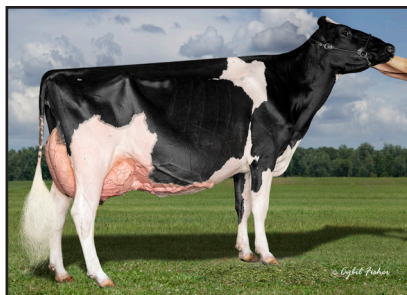
Peace&Plenty Doc Jubie16-ET "EX-94" Grand Champion Southern Spring Nat'l 2022 (Dam of Lot 28)

Showbox Sires & Milk Source LLC P.O. Box 619, Enosburg Falls, VT 05450 802.238.1142 • tim@abbottcows.com 715.299.4651 • eddiebue@milksource.net