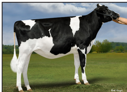
Duckett Ranger 1132-ET *RC (Lot 15)

GTPI +2731 PTA +987M +.03% +46F +.05% +45P 79R 8/23 PTA +645NM +4.4PL 2.89SCS -.7DPR 2.0%DCE PTA +2.71T +2.28UDC +1.23FLC 78R 8/23 A1/A2 • BB