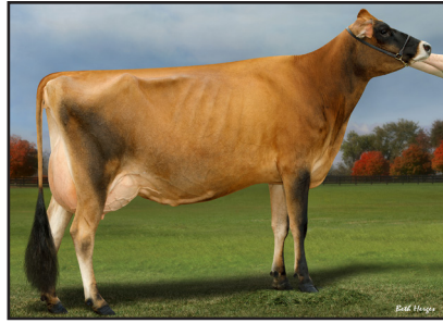
Woodmohr-Townside Sheriff Vision "EX-92" Junior Champion Southern National 2019 (Dam of T & U)