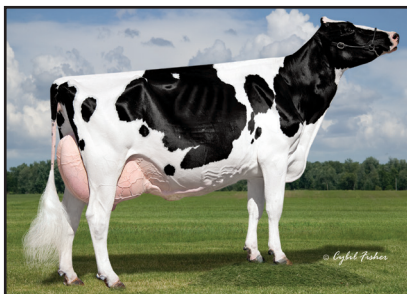
Dubeau Dundee Hezbollah "EX-92" All-American & All-Canadian Sr. 2 Yr Old 2009 (Dam of Lots 35 & 36)