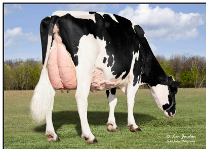
Budjon-Vail HP Drm Style-ET "EX-93 2E" (Dam of Lot 40)

840 3257828156 99%RHA-I Born December 1, 2022 H.N. 730