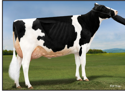
Hez Hezbollahs Honour-ET "EX-94" (Dam of L - N)