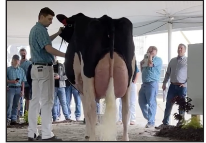
S-S-I Doc Have Not 8784-ET "EX-96" Res. All-American 4 Year Old 2022 (Granddam of Lots 17 - 19)