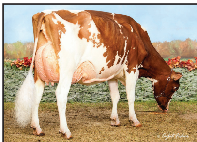
Ms-AOL Cntndr Revive-Red-ET "EX-94" All-American R&W 5 Year Old 2019 (Maternal Sister to Lot 72)