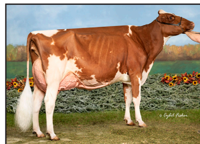
Garay Red Diamond-Red-ET "EX-93" Grand Champion International R&W Jr. Show 2022 (Maternal Sister to Dam of Lot 70)