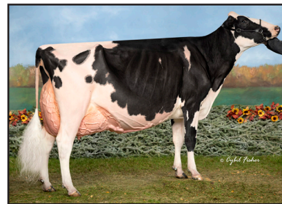
Oakfield Solom Footlose-ET "EX-96 2E" Supreme Champion World Dairy Expo 2022 (Granddam of C)