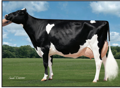
Comestar Larion Goldwyn-ET "EX-95 2E"

2x All-American & All-Canadian (Granddam of Lot 75)