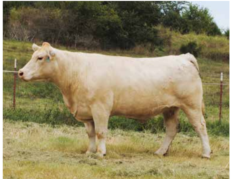
JDJ MS SAFELITE S648 Dam of Lot 115

115A: Pld bull calf # 2027, born 4/9/20, BW 78, sired by JK Rockmont 402, M904915. Rockmont is a WC Milestone 5223 son out of an LT Rio Bravo daughter. Ms Safelite is out of the show sire and a superb producer at Hudspeth Farm, S468. Her sire, Safelite M620, may be one of the thickest, stoutest made bulls to come out of DeBruycker's program. His sire, Productive G1308 was used heavily in their program and was sired by LHD Silver Mark A35, used in the M6 program.