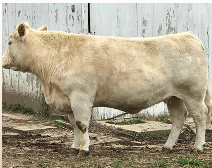
RE-CF MS CLASSIC 964 Dam of Lot 128

Sells Open, ready to breed. This sharp Affinity heifer is out of a Maximo daughter, (he is homozygous Polled), and sold for $60,000. Ms Classic 964 is out of a full sib to LHD Cigar E46, the Classic Bell158 donor cow. 964 is a big stout powerful Illusion daughter, a paternal sib to BHD Reality T3136 and BHD Sly Illusion T3132. Athena has that long extended neck and clean front end for a very desirable feminine look.