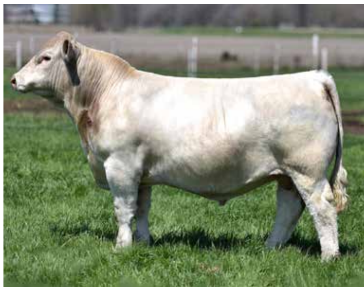
WR FOREMAN D602 Sire of Lots 119 & 120