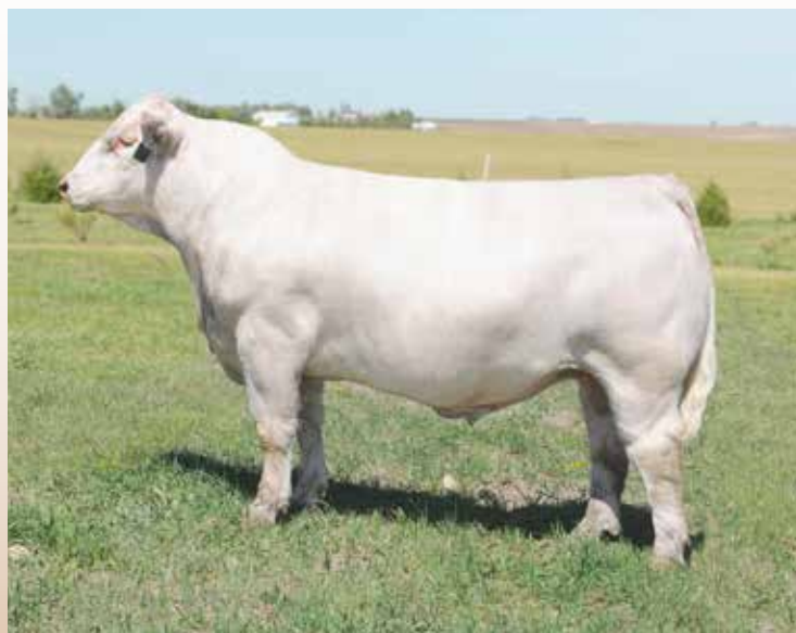
RBM TR RHINESTONE Z38 Sire of Lot 113

Selling Full Interest and Full Possession, Fertility Tested. A very clean, extremely correct structured, and fancy eye-appealing son of Ghost Rider, a HooDoo Slasher 1144 son. His dam is out of the Freedom bull that sired several AIJCA National Champion heifers. Super dam of 420 ranks in the very top 9% for CE, 15% BW, 15% WW, 8% YW, 15% Milk, 7% MTL, 4% CW, 6% Marb, and 4% for TSI to rack up a super impressive foundation for 420!