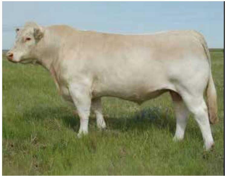
LT LEDGER 0332 P Sire of Lot 129

Observed bred on 11/30/19 to DC Payweight P. This top Ledger cow adds superb Marbling to her numbers, ranking in the top 15% and the top 20% for TSI comparisons. The Allison cow family is a mainstay of the Clark program. Raile 2250 T077 adds great carcass ability, with a top 20% for CW, 6% for REA, 15% for Marbling, and 20% for TSI. Take advantage of this top young cow in the prime production years of her life span.