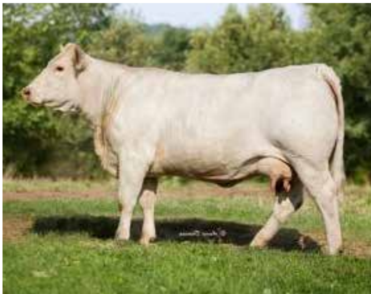
DESCO OD DUKE DUANNE 213 P Dam of Lot 108

108A: Pld Bull # 12 born 3/6/20, bw 73, sired by OW Lead Time 6294 Pld, M875419. Lead Time is owned by JMar Genetics, Leachman Cattle, and ABS Global, and bred by Oakwater Farms. He is in the top 1% EPDs for Marbling, top 20% for REA, and 15% for TSI. This highly maternal young heifer offers a top 7% for Milk and MTL to be a great blend in this mating. Very powerful and proven genetics in this very special offering.