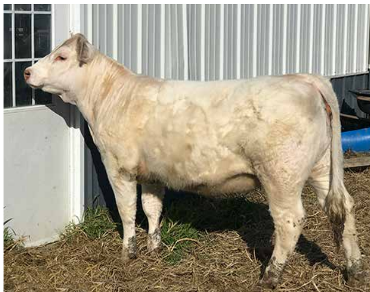
BC CLASSIC AHENA P Sells as Lot 127

Sired by Stipe's great herd sire, SCM Double Joe D96, a line-bred son of SCV Joe Montana. Dam of Miss Marbler, C76, is a combination of Eaton and DeBruycker genetics. She is also the dam of SCM Montana Marbler G216, used by Stipe, Sonderup, and JMar. Miss Marbler has a great calving interval of 3/07; 5/07-ET; 5/08; 3/09, 3/10; and 10/13. One Penny ranks in the top 3% for YW, 6% CW, 15% REA, 1% Marbling, and 1% TSI! Great Mating!!