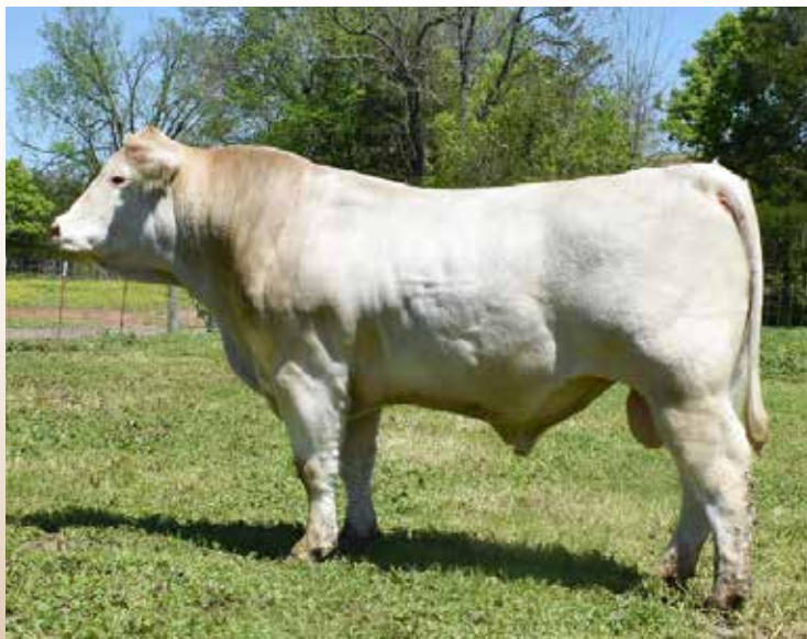
LWF DUKE'S HADLEY 11258 Sells as Lot 106

Sells Open , ready to breed, 2-units of DC/BHD King F2503, goes with heifer for breeding. King was the high selling bull in the 2019 DeBruycker Bull sale at $24,000 for half interest. He is homozygous poll and his calves are being described as fantastic. Another great "Duke" daughter with excellent udder development and strong maternal genetics. Her growth numbers are excellent, and her dam has a very solid blend of genetics.