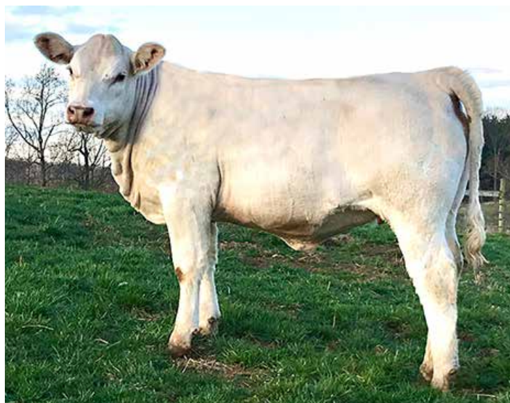
JMAR NANCY 2B89 Sells as Lot 140

Sells PE to DC/BHD Finance F2500 P ET, safe in calf and due Fall 2020. This heifer reflects the great calving ease of her sire and the Wrangler influence. She also ranks in top 20% for WW, 25% for both YW and Milk, 15% for MTL for breed EPD comparisons. Her dam topped the 2013 Southern Connection sale at $7,000 from Tipton's great DVCR Lady Cigar 2070 that also topped the Southern Connection sale and maybe one of the greatest Cigar's!