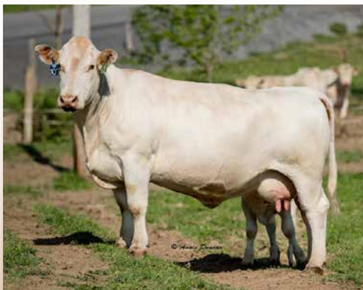
WCR MS DUKE 6025 P/S Donor Dam of Lot 110 & 111 Embryos

Selling Choice of 3-Embryos from mating of WCR Ms Duke 6025 P/s and LHD Cigar or CCC WC Resource 417. Either choice would be an excellent opportunity to add quality to any herd's program. The Resource mating would be from Sexed Heifer Semen! Embryos are conventional and will be at the sale or you can have shipped at cost. One pregnancy is guaranteed if implanted by an AETA certified Vet.