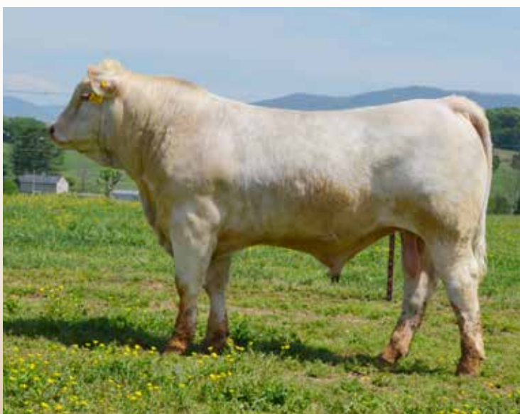
DC BHD FINACE E2500 PET Service Sire on Lot 138