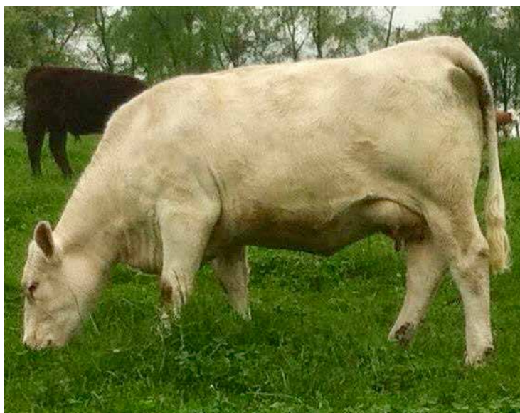
VPI CAMEO GIRL 006X Donor Dam of Lot 124 & 125 Embryos

Bells & Whistles has been one of the most popular bulls in the M6 program. He is sired by one of the top performance bulls in the industry, M6 Cool Rep 8108. Cameo Girl has 7 calves registered with AICA and is sired by another great breeding sire, Free Lunch. Her dam is by one of best sires of milking daughters, LT Easy Pro 1158 and a blend with Rio Blanco assures even stronger maternal ability. Guarantee of 2-pregnancies.