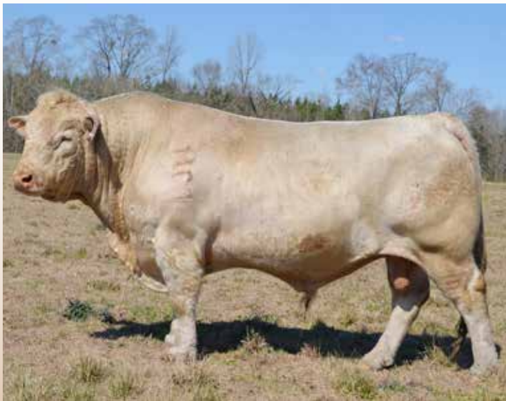
WCR SIR COUNTYLINE 551 P Sire of Lots 132, 133, 135 & 136