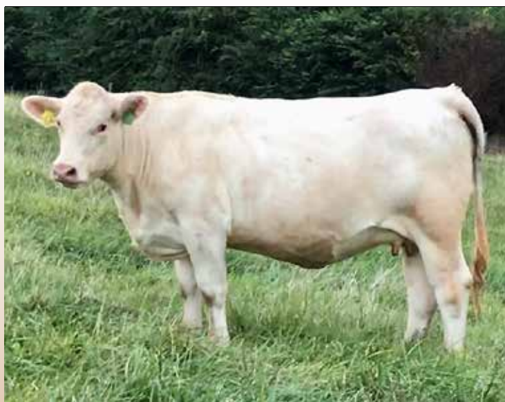
Full Sib to Lot 125 Embryos

Cameo Girl ranks in the top 15% for WW, 5% for YW, 20% for Milk, 2% for CW, 1% for Marbling, and top 3% for TSI EPD rankings in the breed. Gridmaker 010 enforces great EPDs with his top 10% for WW and YW, top 8% for Milk, 2% for MTL, 7% CW, 8% for REA, 1% FAT, and 8% for TSI comparisons. He also has the strong maternal genetics of Mac 9176 for Milk and Marbling. One of the most important opportunities for Marbling genetics!