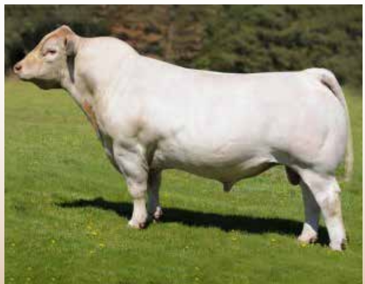
TR MR FIREWATER 5792 RET Sire of Lots 130 & 131

Sells Open, a full sib to lot 130 so you see this is not a fluke mating, but a well-designed masterful mating. You can choose to show these full sibs or make superb club calf cows that obviously can produce winners. Almost everyone in the beef industry will tell you this is one of the most profitable matings in cattle today!