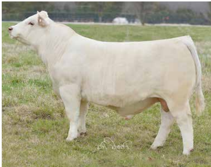
CCC WC RESOURCE 417 P Sire of Lott 38 Embryos