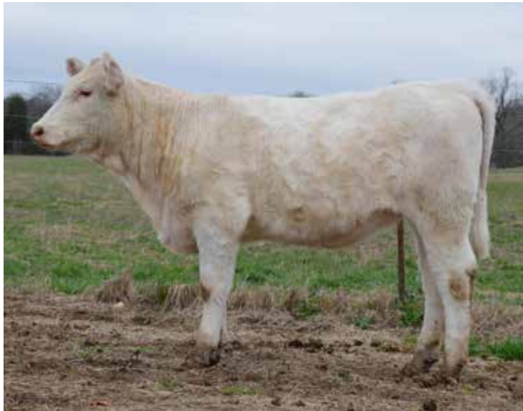
LWF DUKE'S LADY COBALT 5219 Sells as Lot 105

Sells Open , ready to breed to bull of your choice. These powerful "Duke" daughters are making fantastic cows. Duke is a full sib to M6 Ms E46 Duke 248, the legendary Donor cow for Double-H and Southern Cattle. Her donor dam, Ms Cobalt Z251, was the high selling lot in the 2016 Little W sale at $10,000 from Candy Sullivan. Little W and Spencer Wright teamed up to own her. This heifer is loaded with pedigree and very good numbers.