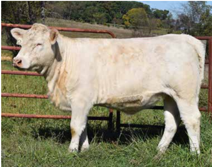
CF JACQUELINE 632 P Maternal Sib to Lot 134

PE from 3/30/20 to sale time to RDK Samson 723 P. One of the most popular and proven line of Wienk genetics is the Countyline influence. Countyline 551 is an excellent calving sire and his daughters are making superb broodcows. This very feminine, quality heifer super numbers for CE and BW, and very satisfying performance numbers for both WW and YW.