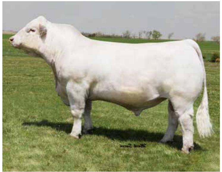
TR PZC TURTON 0794 ET Sire of Lot 114

Bred A-I on 2/5/20 to SSF Corks White Squall, EM741049, the AICA Reserve National Champion bull in Ft Worth owned by Shadow Springs Farm. Another D&D Cover Girl cow family representative for additional eye-appeal and style. Sired by the AICA National Champion Bull Turton 0794 and blended with Cover Girl gives you a great pedigree to produce winning offspring in the show trail.