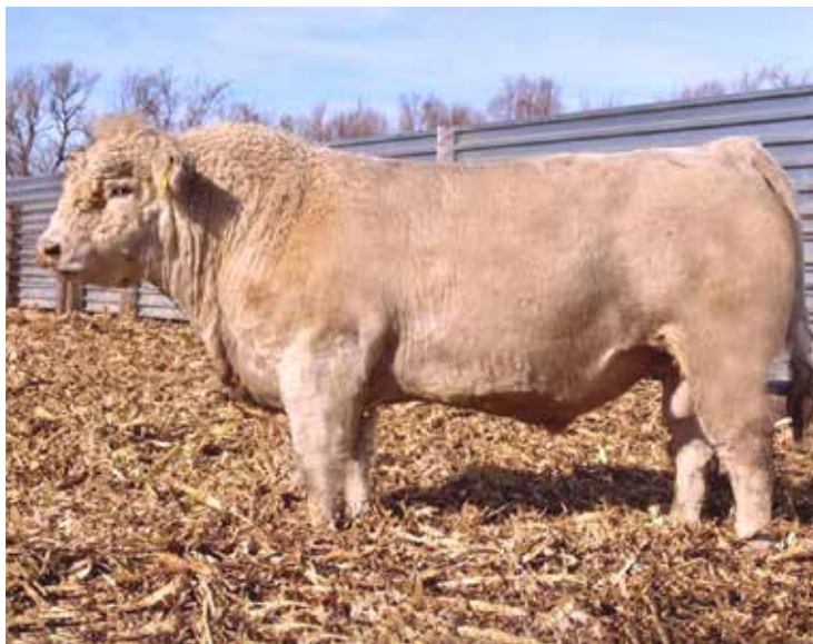
JMAR BENAIAH Breeding Privileges Sell with Lots 122 & 123