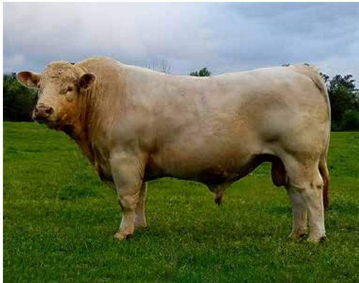
RDK SAMSON 523 P Service Sire on Lots 132-136

Sells PE from 3/30/20 to sale to RDK Samson 723 P. Adding these strong maternal heifers to your program will be an excellent way to move your herd forward or to add great current young genetics to the program. With this heifer tracing to Duke 914 and WCR Sir Tradition you know you have an exceptional strong background to her pedigree. The excellent calving ease genetics and blended with Samson insures exceptional quality genetics.