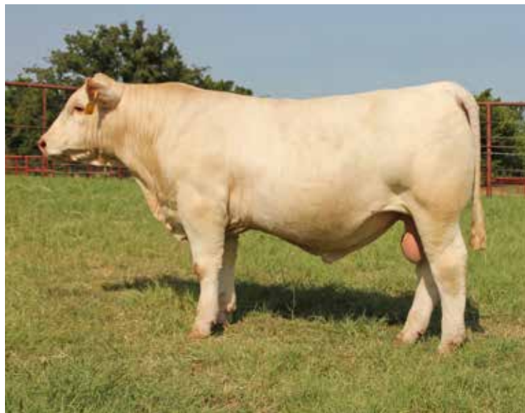
M6 LAW & ORDER 577 P Dam of Lot 139