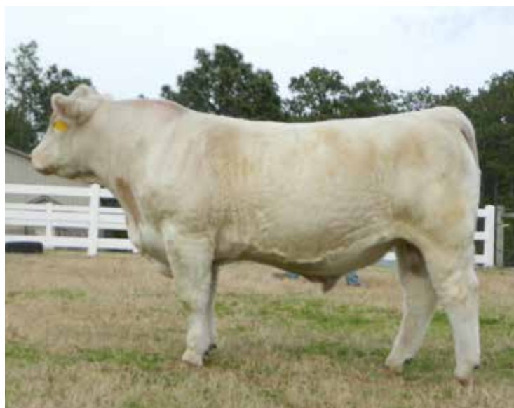
JK 420 Sells as Lot 112

Selling Choice of 3-Embryos from mating of WCR Ms Duke 6025 P/s and LHD Cigar or CCC WC Resource 417. Either choice would be an excellent opportunity to add quality to any herd's program. The Resource mating would be from Sexed Heifer Semen! Embryos are conventional and will be at the sale or you can have shipped at cost. One pregnancy is guaranteed if implanted by an AETA certified Vet.