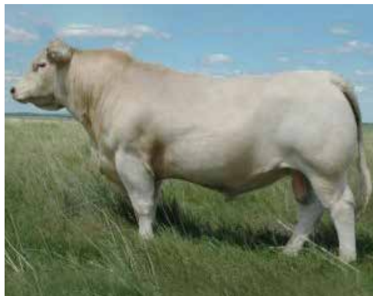
LT VENTURE 3198 PLD Paternal Grand sire of Lot 137

Selling Full Interest and Full Possession. Fertility tested and ready to breed. Very solid numbers with a good birth weight of 85 lbs, the kind of good start you need to get those big weaning weights. The Venture calves have good thickness and expression of muscle. The Rocco 3030 was a top Cigar son used several years in the Welcome Grove program. The Welcome Grove's Ms Impressive 405 is a mainstay of their ET program!