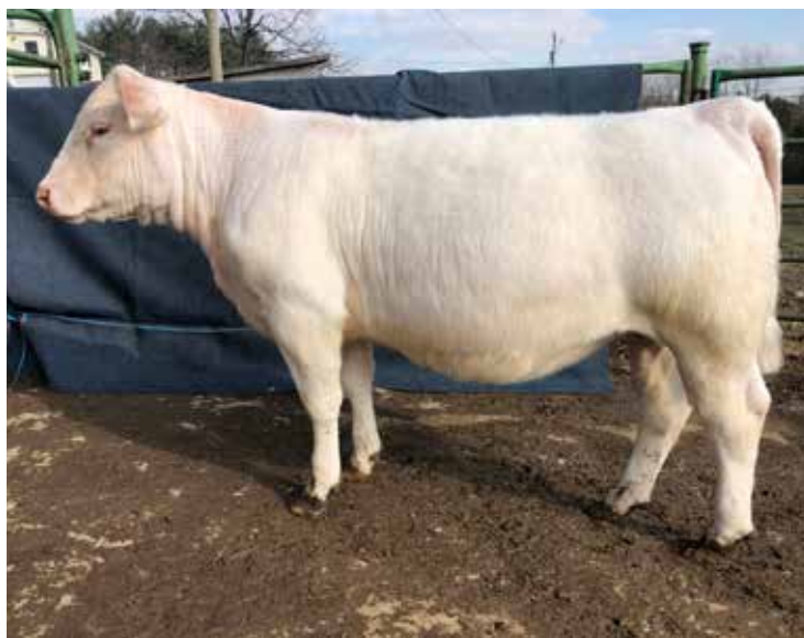
DESCO LADY THUNDER 904 P Sells as Lot 109

Sells Open. A beautiful designed heifer with great EPDs, ranks in top 3% for WW, 2% YW, 9% Milk, 1% MTL and Carcass ranks top 3% for CW, 7% for REA, 15% Marbling, and 4% for TSI rankings in the breed. Quite the credentials that will put a program in the lead quickly. She is also endowed with the very proven background of the donor cow, DESCO OD Duke Duanne 213 P. Halter-Broke!