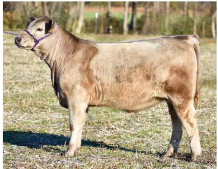
BRAVO CHAI 902 ET Sells as Lot 130

Sells Open, a super fancy composite heifer, halter-broke, with tremendous skeletal correctness, depth and spring of rib. She also has that very popular sought-after color by all beef industries. Sired by one of the most proven show sires in the breed, a many time Show Sire of the Year, and sire of AICA and AJCA National Champions. Dam is a very powerful purebred Angus cow with excellent credentials.