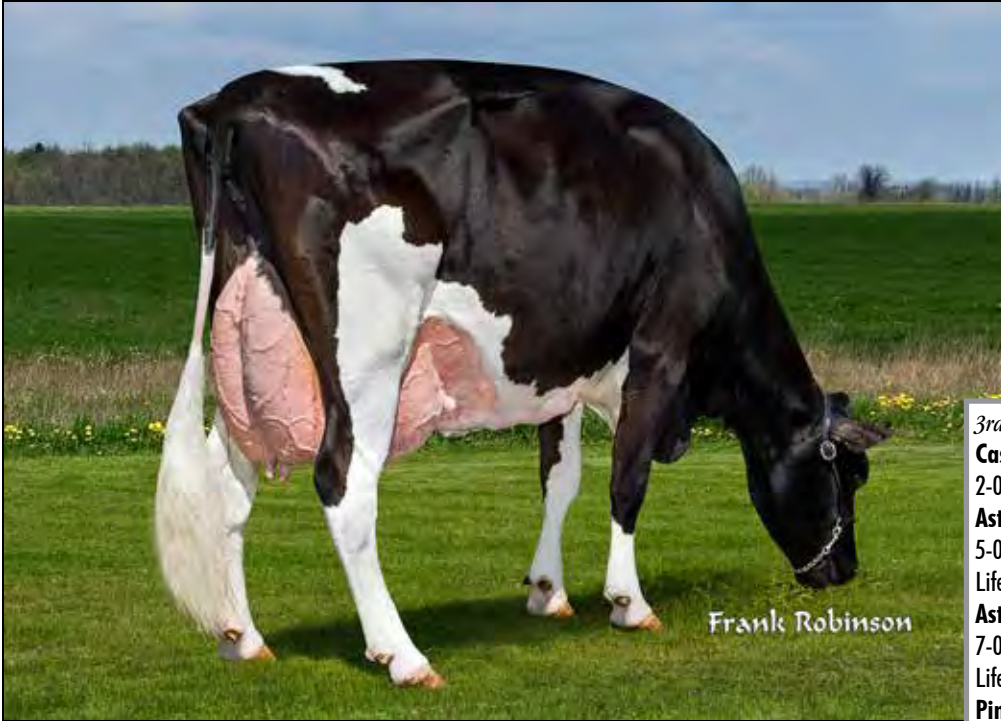
OAKFIELD-PRONTO RITZI EX-93 EEEEE 2E SAME FAMILY AS LOTS 1-