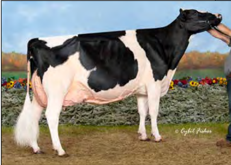
WHITAKER STORMATIC RAE-ET EX-94 MATERNAL SISTER TO DAM OF LOT 9