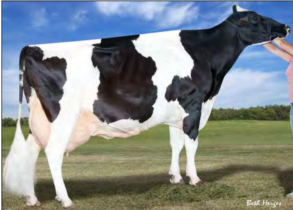
MS ROCK-HOME GOLD ROXETE-ET EX-90 EX-MS 5TH DAM OF LOT 14