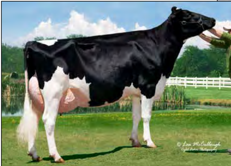
BUDJON-JK DURHAM EPISODE-ET EX-92 EX-MS DOM DAM OF LOTS 146-153