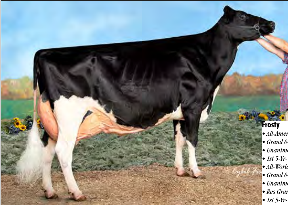
DUCKETT-SA GOLD FAME-ET EX-94 EX-MS 2E 3RD DAM OF LOT 18