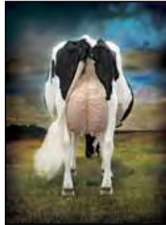
OCEAN-VIEW SANCHEZ DIX EX-93 EX-MS 2E 2ND DAM OF LOT 97 & 3RD DAM OF LOT 97A