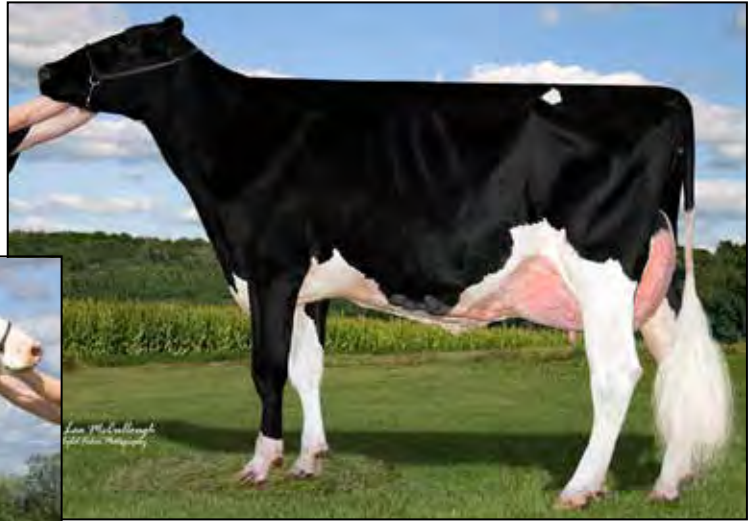
DEL-HOLLOW JOLENE DSTRY-ET EX-93 EX-MS 2E 2ND DAM OF LOTS 22-25