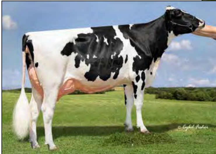
MIDAS-TOUCH DM CHINKS-ET EX-92 EEEEE MATERNAL SISTER TO DAM OF LOT 21