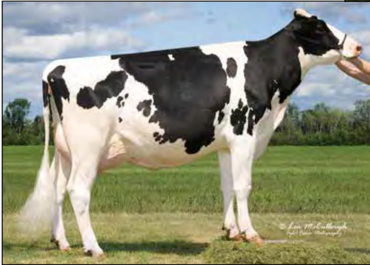
MS DEL-HOL JODIE GIBSON EX-92 EEEVE 3E *RC 3RD DAM OF LOTS 22-25