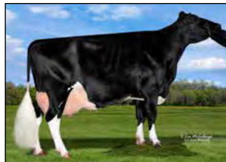
WELK-SHADE DURHAM KIT-ET EX-91 EX-MS 2E 2ND DAM OF LOT 28

840003210920371 99%RHA-I *RC *TC *TL Born: November 4, 2019 • Herd No. 508 2-06 2x 313d 22395 3.9 866 3.1 702 Fresh: June 1, 2022 Due: September 20, 2023 to Show-Mar Krusty-Red-ET 120H03673