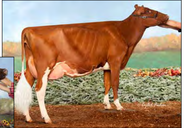
MS APPLE ANASTACIA-RED-ET EX-94 EEEEE DAM OF LOT 87