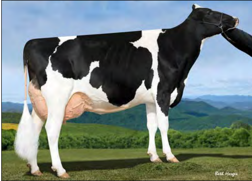
CAVANALECK SPRITE DELL EX-94 EEEEE 3E DAM OF LOT 27