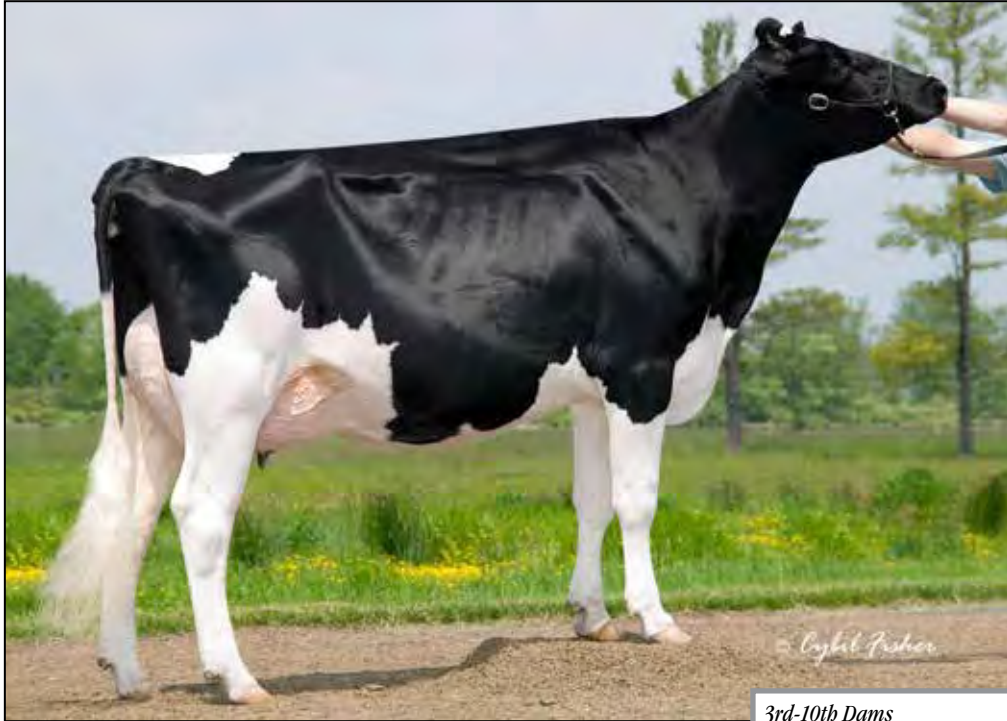
BUDJON-JK DURHAM EPISODE-ET EX-92 EX-MS DOM 3RD DAM OF LOTS 15 & 16