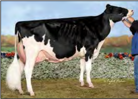
BVK ATWOOD ABBIE-ET EX-95 MATERNAL SISTER TO DAM OF LOT 155