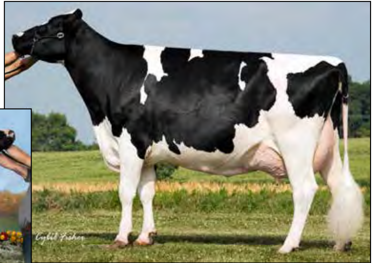
MA-TOM-BA ASPEN RAE 526 EX-91 EX-MS 2ND DAM OF LOT 9