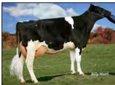
CS-REDVUE MRBURN CARLA-ET EX-92 EEEEE 2E GMD*RC 3RD DAM OF LOT 132