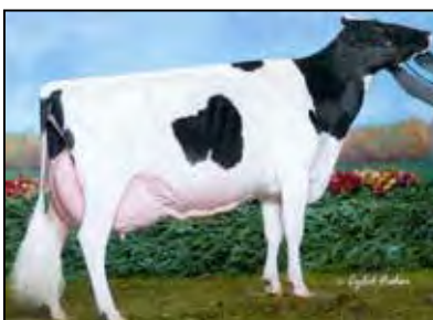
EK-OSEEANA AMBROSIA-ET EX-95 EEEEE 2E GMD 5TH DAM OF LOT LOT 35

Registration Pending Born: July 27, 2022 • Herd No. 1705