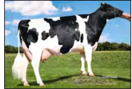
STUMP-VALLEY DURHAM SWEET EX-90 EX-MS GMD 4TH DAM OF LOT 46

Due: July 5, 2023 to Show-Mar Krusty-Red-ET 120H03673