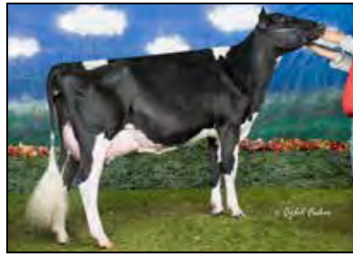
MS GIBSON PATTIE-CAKE-ET EX-90 EEEVE 3RD DAM OF LOTS 32-33A

Registration Pending Born: November 7, 2021 • Herd No. 1684