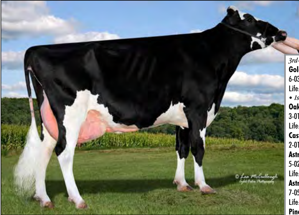
GOLDEN-ROSE BRAX RAIZEL-ET EX-90 EX-MS 2ND DAM OF LOT 1