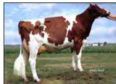
HICKORYMEA ODELIA-P-RED-ET EX-91 EX-MS 3E 2ND DAM OF LOT 90 & 3RD DAM OF LOTS 91 & 92

840003143487375 Very Good-87 VG-MS *RC Born: June 8, 2018 • Herd No. 1520 2-05 2x 365d 27822 4.5 1247 3.7 1020 4-01 2x 326d 26643 4.5 1204 3.6 950 RIP Fresh: July 22, 2022 Milking: 68# 6.1F 4.1P SCC 71,000