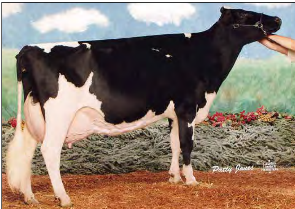
BUDJON-JK ELECTRAFY EX-93 EEEEE GMD 3RD DAM OF LOT 17 & 4TH DAM OF LOTS 15 & 16