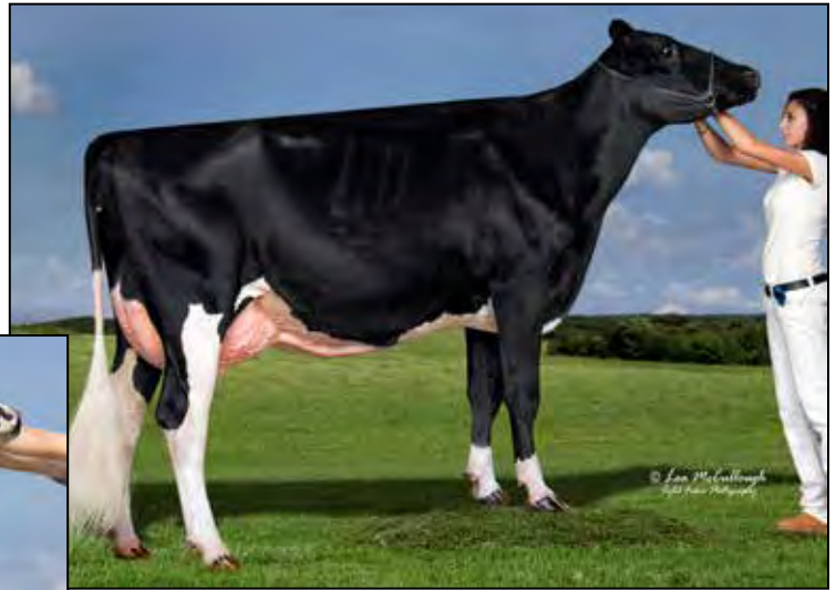
REGANCREST CHANEL-ET EX-92 EX-MS DAM OF LOT 21