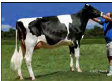
VISION-GEN GABOR CANDIES-ET EX-90 4TH DAM OF LOT 36

840003209822206 Pending Born: August 12, 2021 • Herd No. 1671 Due: August 15, 2023