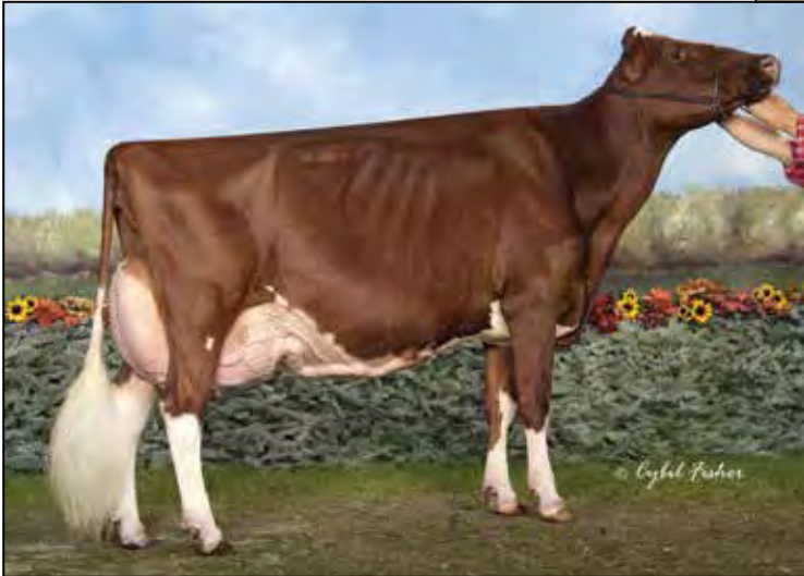
KHW REGIMENT APPLE-RED-ET EX-96 EEEEE 4E DOM 2ND DAM OF LOT 87