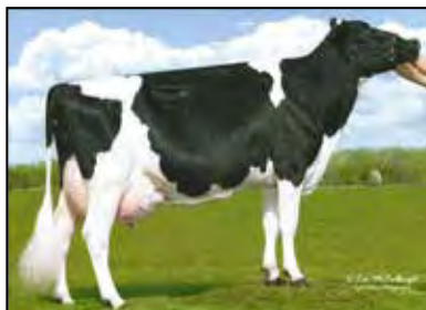
GAJAN CHISM JEAN EX-91 VEEVE 2E MATERNAL SISTER TO DAM OF LOT 29

840003009533223 VG-87 *TR *TP *TM *TC *TY *TV *TL PTA +1933M +34F +37P 99R 4/23 PTA +1.9PL 3.04SCS +.0DPR 2.4%DCE PTA +.98T +1.78UDC +.22FLC 99R 4/23 GTPI +2462G