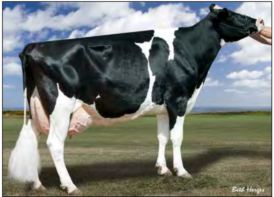
BVK DURHAM DUCHESS-ET EX-90 DAM OF LOT 155