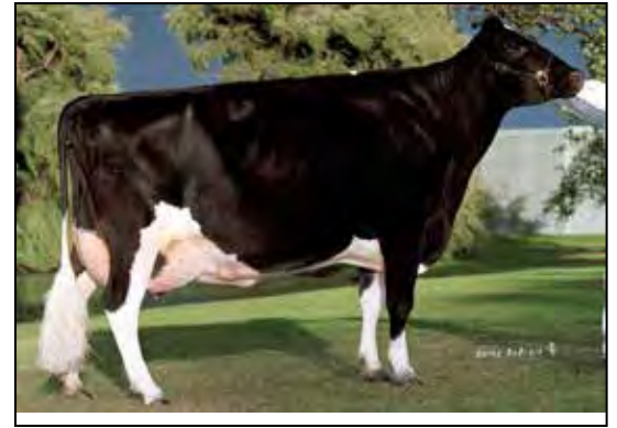
KRULL BROKER ELEGANCE EX-96 3E GMD DOM 3RD DAM OF LOT 154