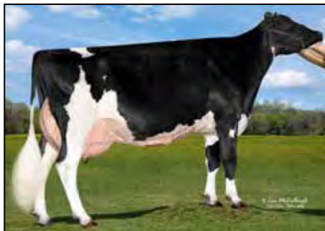
AMMON FARMS MAC CLASSIC-ET EX-92 EX-MS 2E 3RD DAM OF LOT 50