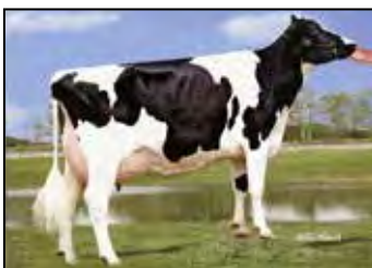
LADYS-MANOR RUBY D SHAWN-ET EX-90 EX-MS GMD DOM MATERNAL SISTER TO DAM OF LOT 1

Due: June 19, 2023 to Quinndale Wish List