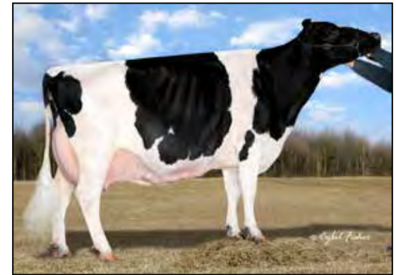
BUDJON-JK LINJET EILEEN-ET EX-96 EEEEE 4E GMD DOM 2ND DAM OF LOT 154