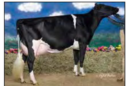
B&R STOMATIC TRISH-ET EX-94 2E 4TH DAM OF LOTS 47 & 48