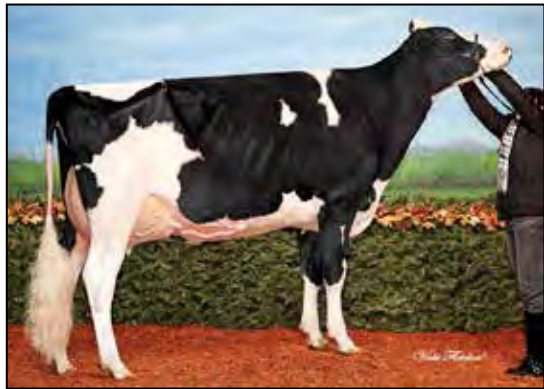
BVK ATWOOD ARIANNA EX-94 MATERNAL SISTER TO DAM OF LOT 155