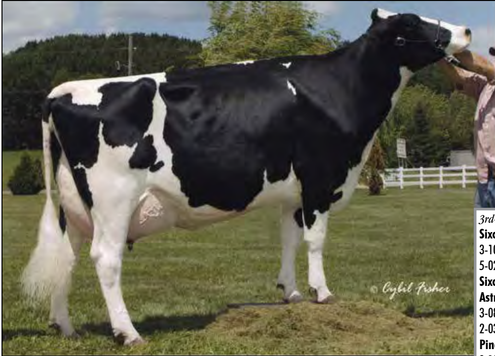
ASTRAHOE LJ ROSA ROYALTY-ET EX-93 EEEEE 2E 5TH DAM OF LOT 8 & 6TH DAM OF LOT 8A