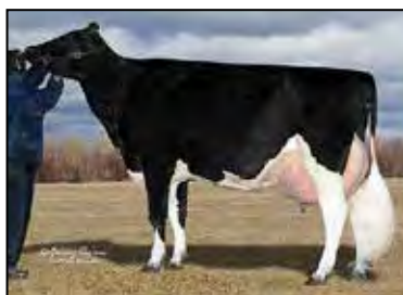
COYNE-FARMS BKEYE YVONNE-ET VG-87 4TH DAM OF LOT 100