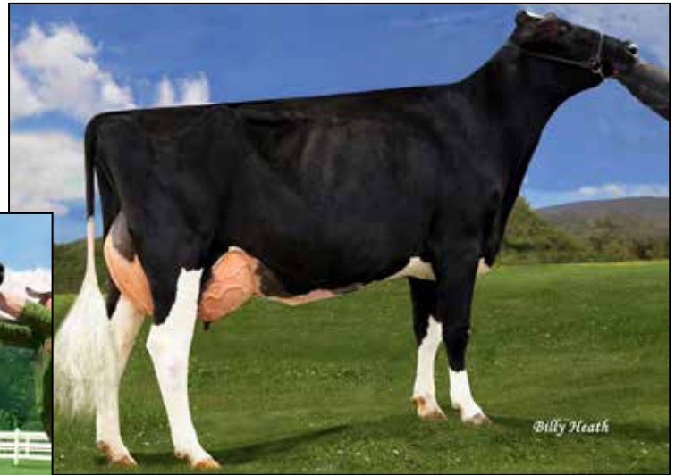
ARETHUSA JASPER EVENING-ET EX-93 EEEEE MATERNAL SISTER TO LOTS 146-153