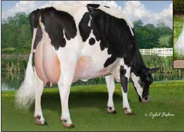
HILLCROFT LEADER MELANIE EX-96-CAN 3E EEEEE 2* 3RD DAM OF LOT 86