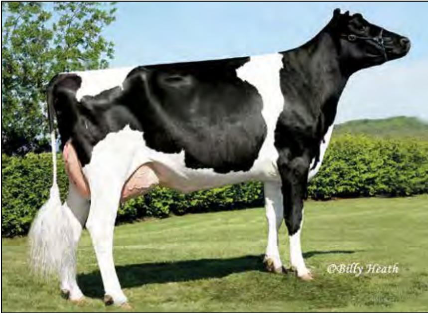
BUDJON-JK GIBSON ENJOY-ET EX-93 EEEEE DAM OF LOT 154