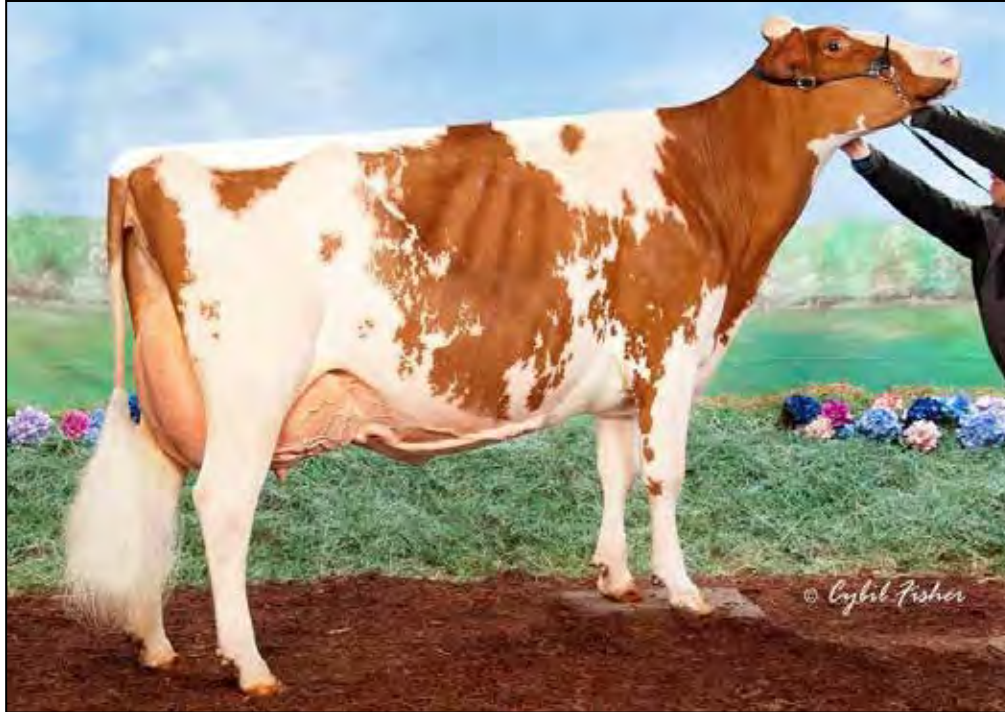
REDTAG DESTRY SNEEZY-RED-ET EX-94 EEEEE 2ND DAM OF LOT 20