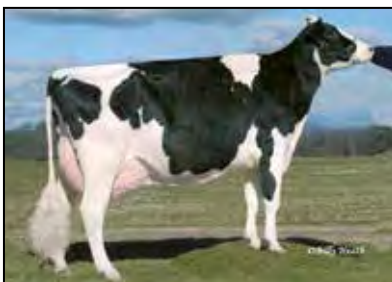
WINDSOR-MANOR RUD ZIP EX-95 4E GMD DOM 4TH DAM OF LOT 34

840003149695856 Very Good-85 VG-MS Born: February 26, 2018 • Herd No. 245 4-01 2x 365d 26962 5.4 1455 3.7 989 3-00 2x 305d 24420 4.8 1175 3.1 753 2-00 2x 305d 20930 4.3 910 3.0 630 Fresh: June 4, 2023 Milking: 74# 5.2F 3.4P SCC 20,000