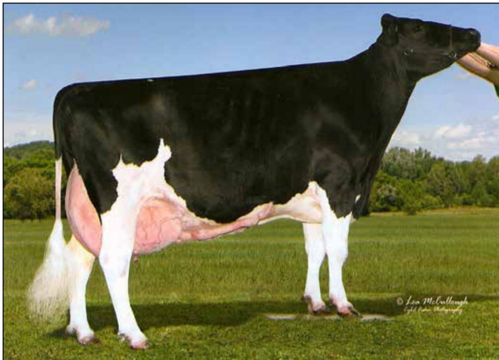
HONEY-TREE ALLEN RAELENE-ET EX-90 2E 3RD DAM OF LOT 13