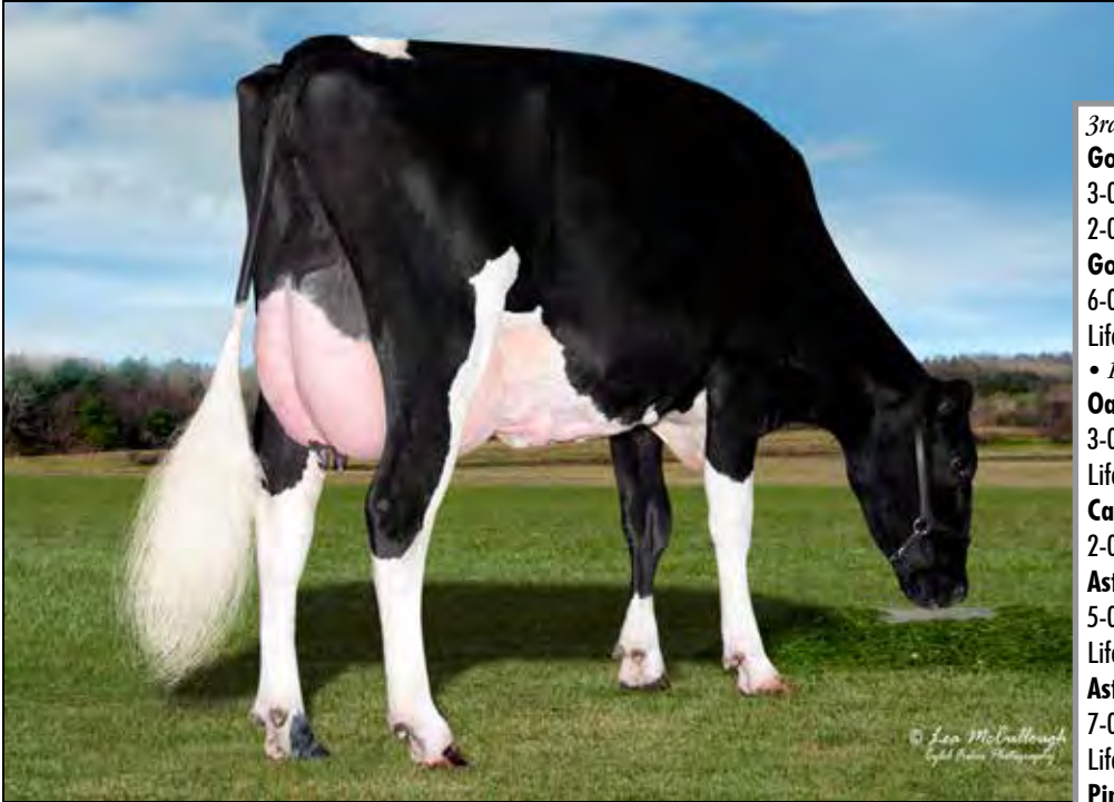
GOLDEN-ROSE ATWOOD RITZI EX-93 EX-MS 2E GMD SAME FAMILY AS LOTS 1-