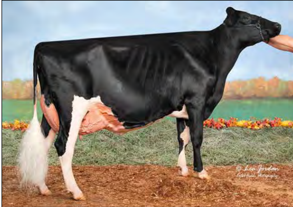
TOPPGLEN DEFIANT WOWWEE EX-93 SAME FAMILY AS LOT 26