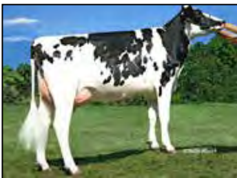
UFM-DUBS SHERAY-ET VG-88 DOM 5TH DAM OF LOT 37

142738287 Very Good-85 VG-MS 5-08 2x 305d 28430 3.0 852 2.8 810 6-08 2x 305d 27970 3.2 898 2.7 764 4-05 2x 305d 26790 4.2 1121 2.8 762 3-06 2x 273d 24170 3.7 897 2.9 707 2-06 2x 305d 23120 4.1 937 3.0 698 Life: 1591d 137060 3.7 5010 2.9 3959