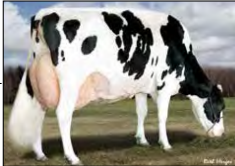
SPRUCE-EDGE OUTSIDE TANA EX-94 EEEEE 2E GMD FULL SISTER TO 3RD DAM OF LOT 62

840003151398826 99%RHA-I VG-87 VG-MS Born: October 29, 2018 • Herd No. 117 3-05 2x 365d 34455 3.5 1207 3.3 1122 2-00 2x 305d 21430 3.8 820 3.2 680 Due: August 18, 2023 to Quinndale Wish List