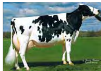
LONG-HAVEN STORMATIC NANCY EX-94 EEEEE 4E 2ND DAM OF LOT 30

Due: January 30, 2024 to Amighetti Numero Uno-ET 200H007450