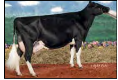
PAVUE MAD BB LEEANNE EX-94 EEEEE 3E 4TH DAM OF LOT 42

Due: September 18, 2023 to Show-Mar Krusty-Red-ET 120H03673