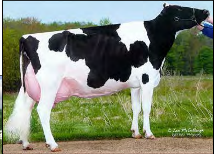
ARETHUSA DUNDEE MALLORY-ET EX-94 2E EEEEE MATERNAL SISTER TO 2ND DAM OF LOT 86