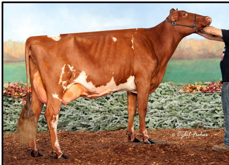
Kuszmar SR Primrose Siggy-96 EX91 2 nd Dam of Lot 15 Reserve All-American Yearling in Milk - 2017 1 st Sr. 2 Year Old – Eastern National Show 2018