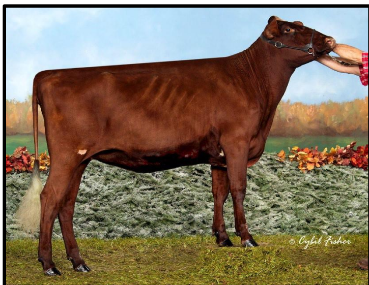
Cherrylock Robin JayJay EXP ET VG88 Full Sister to Dam of Embryos Res. Jr. All-American Winter Yearling – 2016