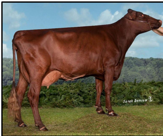
Cherrywood Judeas Jerusalem-ET EX92 2 nd Dam of Embryos Nom. All-American Sr. 2 Year Old – 2010