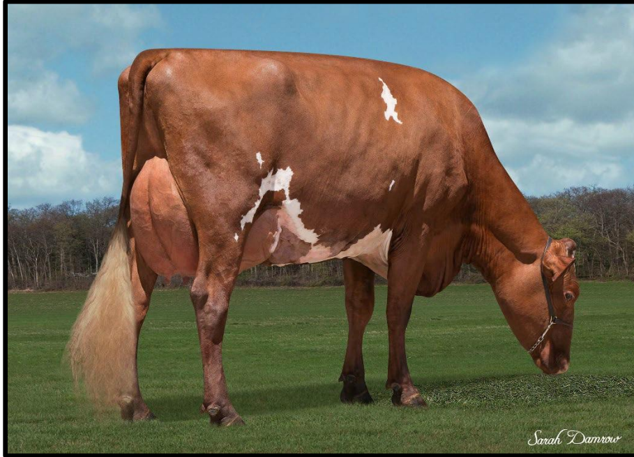
Krauses Wildcard Della VG88 EX90MS Same Maternal Family as Lot 10B