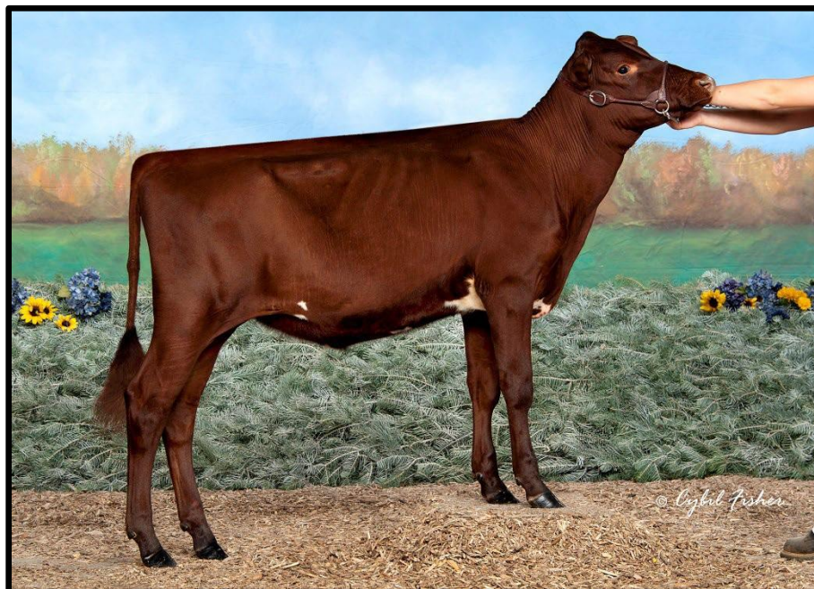
Windswept Farm Dutch Adalaide EX90 Dam of Lot 11

Reserve All-American Jr. 2 Year Old – 2017 Nominated All-American Spring Calf - 2015