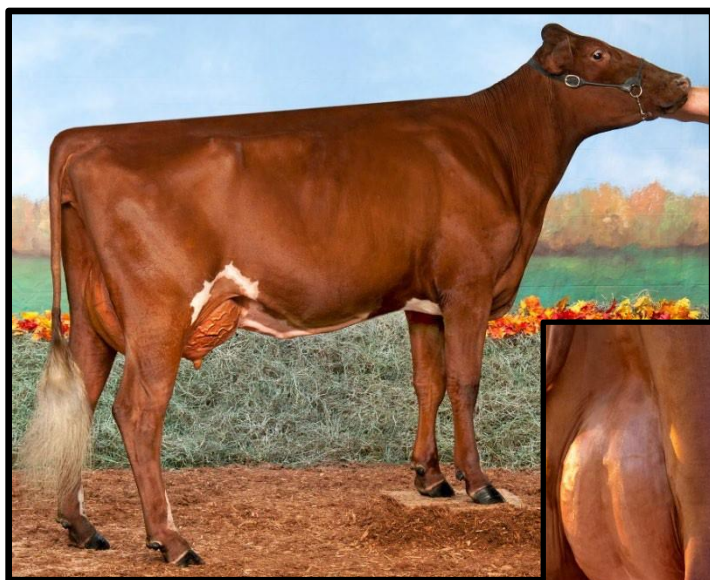
Cherrywood Presto Lady EXP VG87 Dam of Embryos