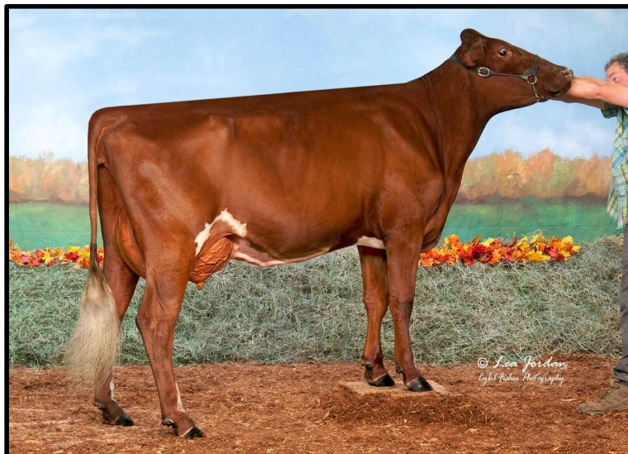
Cherrywood Presto Lady EXP VG87 Dam of Lot 19