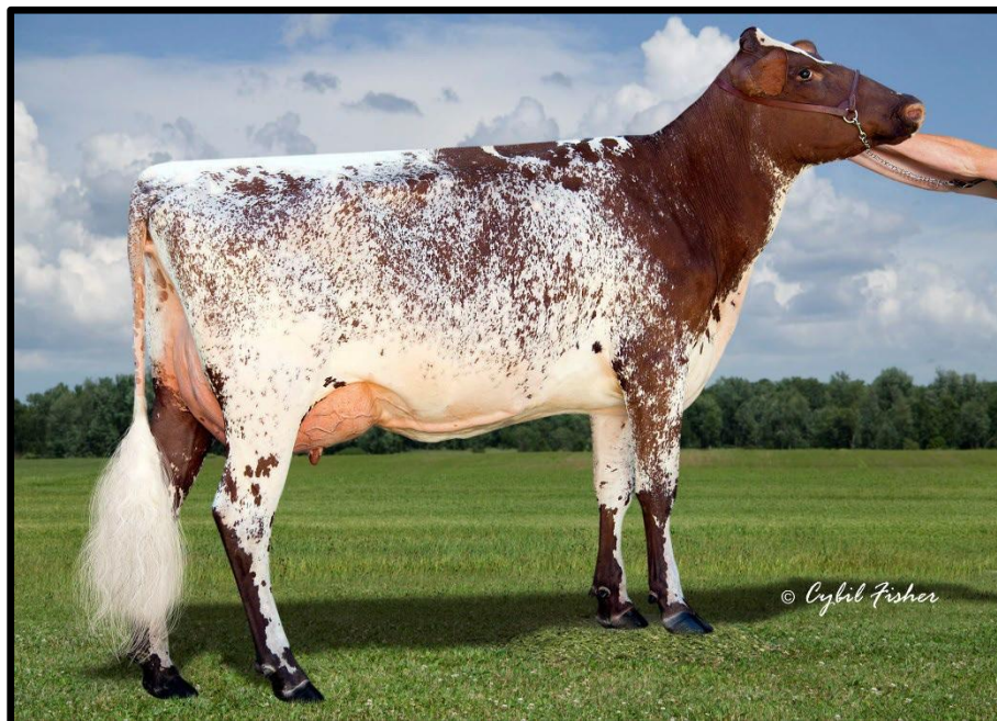
Lazy M RR Zeus Brelynn 2E91 2 nd Dam of Lot 16