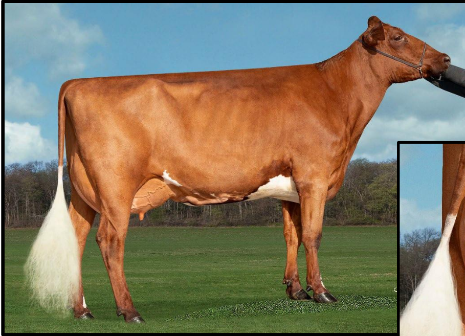
Krauses Sec Temptation 668 GP84 85MS #8 PPR Cow in the Breed! Sells as a Choice with Lot 10B