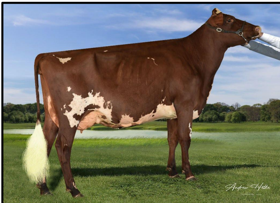
Gin-Val RR Zeus Crebrulee VG86 Dam of Lot 23

Honorable Mention Intermediate Champion – Northeast Nat'l 2021