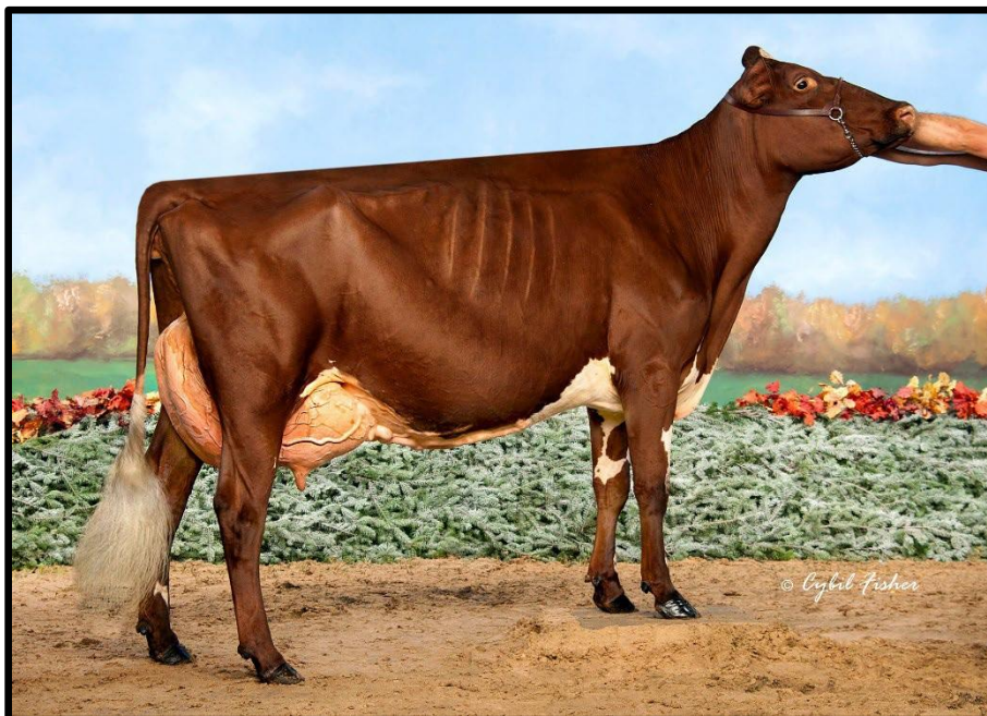
Trilow Zeus Lala ET 3E94