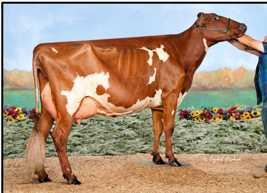
Valley View Oakleigh 2390 EXP EX92