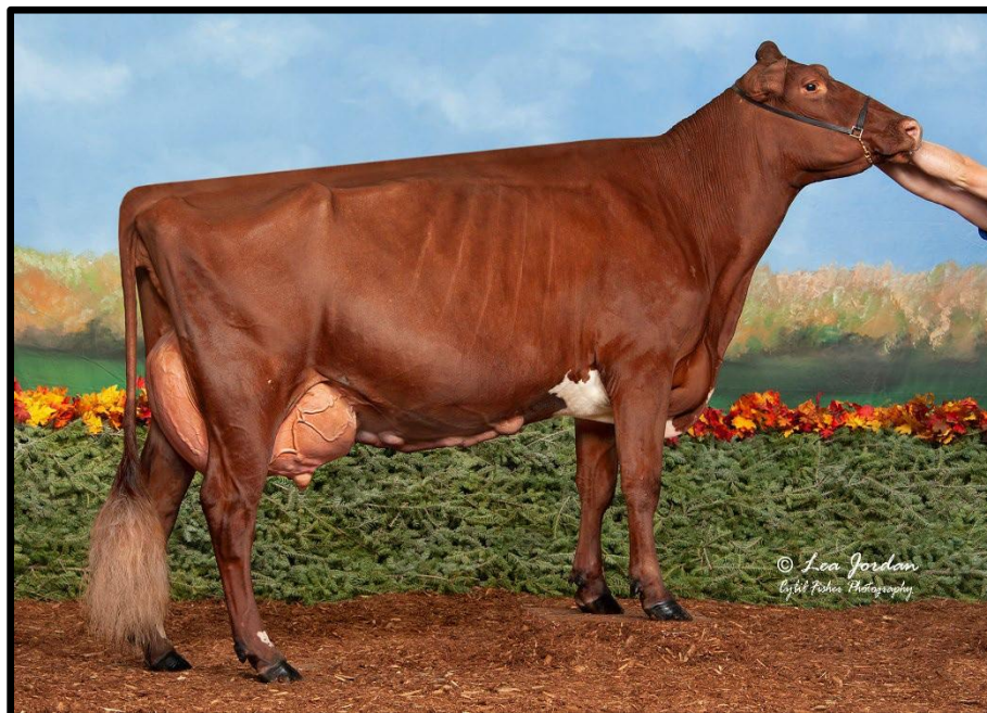
Weissmann Belero Bonnie EX93 Dam of Lot 5