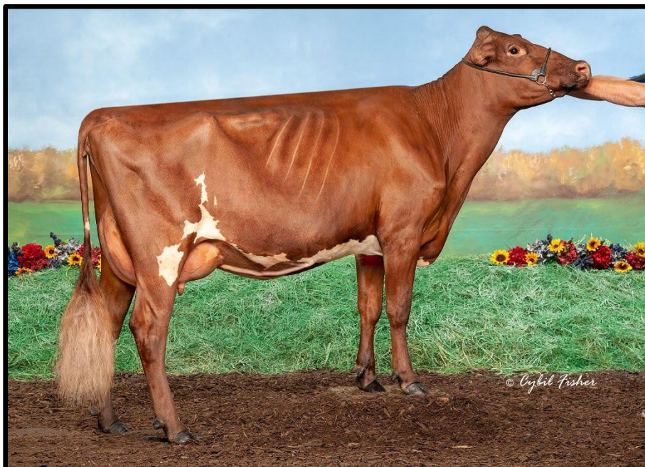
Briar-Rose R Alibi EX90 Dam of Lot 25

Intermediate & Reserve Grand Champion – Eastern Nat'l 2021 Nominated All-American Jr. 3 Year Old – 2021