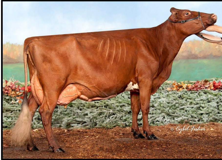
Hard Core ORaely ET 3E95 3 rd Dam of Lot 13