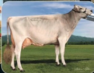
Double W Star Seguin VG-86 1st score