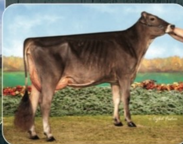
Double W DD Prosper