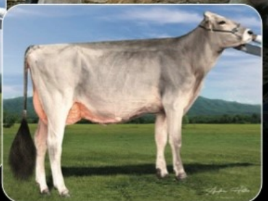
Double W Kickstart Nanett Ex 90 @ 3 yrs