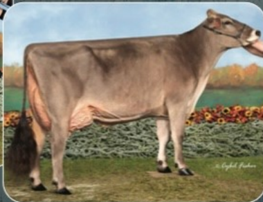
Double Star DD Clare EX91

4X Nominated All-American in Milking Form