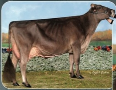
CIE Double W Em Favor EX95