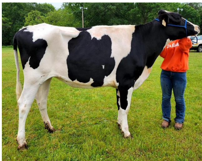
Supreme Project Heifer 2023 Clemson Spring Dairy Show