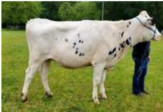
Supreme Project Heifer 2022 Clemson Spring Dairy Show