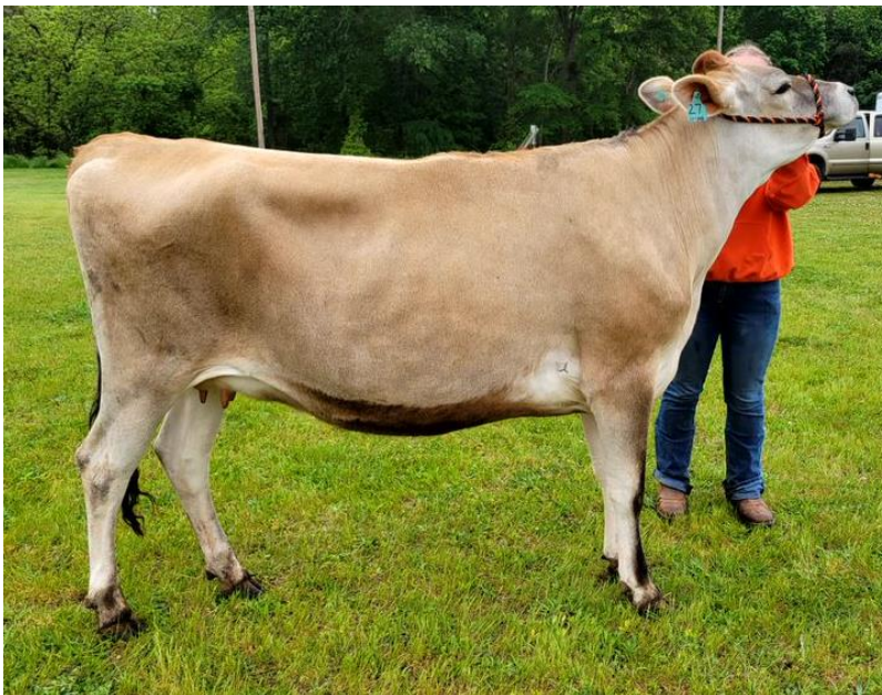
Second Place Heifer Project 2023 Clemson Spring Dairy Show