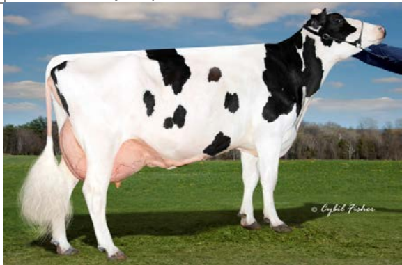
Lars-Acres Jabir Tinks-ET GP-83 VG-MS