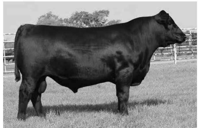
DEER VALLEY ALL IN

Another daughter sired by the Select Sires bull Deer Valley All In out of a very attractive Connealy Capitalist dam. Nice set of heifers that are very similar in age, size and EPD's. She sells open and ready to breed.