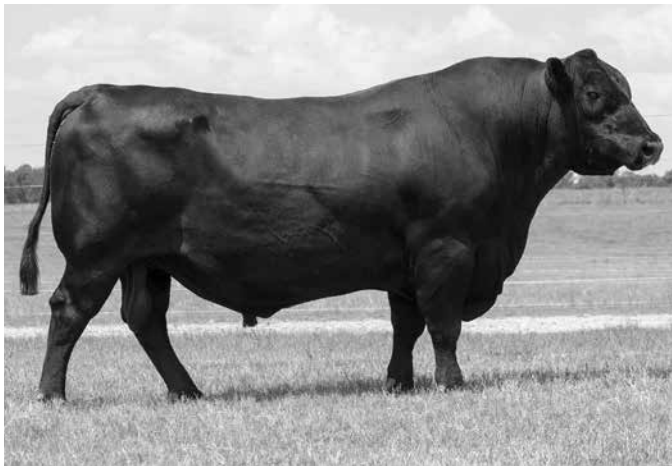
YON FINAL ANSWER W494