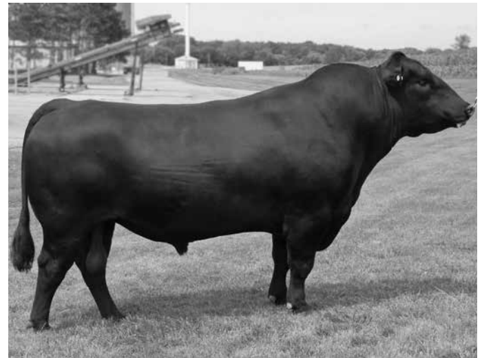
PA SAFEGUARD 021