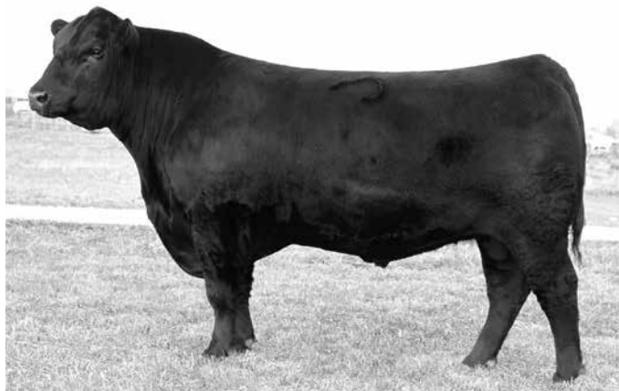
CONNELY BLACK GRANITE

This bred cow is all about production. She just weaned a 700 lb Deer Valley All In heifer that was retained in our herd. She is due 4/9/17 to KCF Bennett X48 whose EPD's are +11 -1.9 +54 +87 +23.