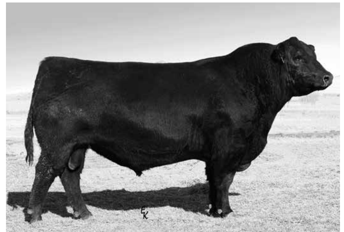
GDAR GAME DAY 449