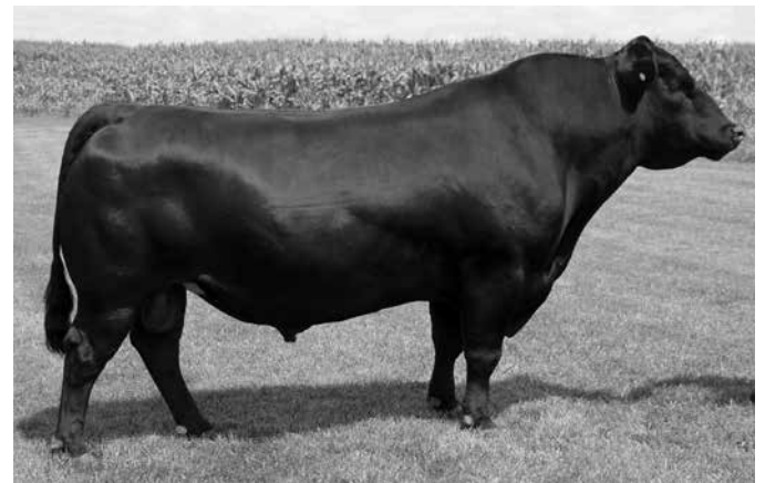
K C F BENNETT ABSOLUTE