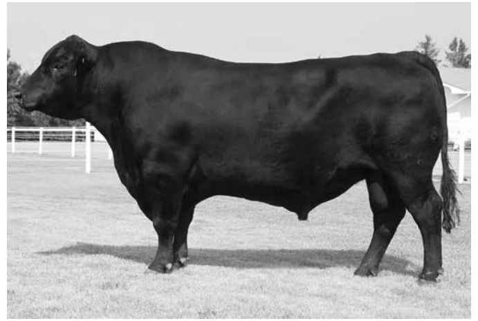
SITZ RAINMAKER 11127