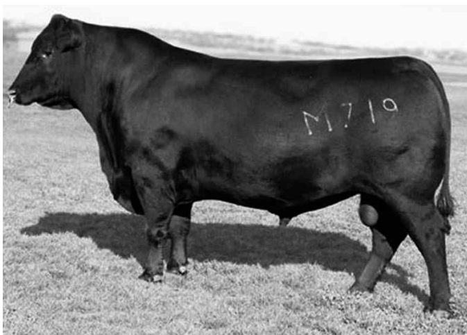
S S FAST TRACK M719

A daughter of VT Objective DAF 802 who is a graduate of the SWVAA bull testing program. He has left many good progeny in the Lucas Farm herd. She descends from the Lucas Lady cow family. Powell Farms has brought some really nice young females for this sale. Sells due on 12/17/16 to Deer Valley Ten X 3014 whose EPD's are +16 -.9 +70 +122 +28 $B 155.26.