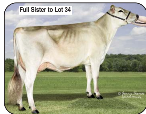
Full Sister to Lot 34 La Rainbow Bfly Delight ET 'V87 - V88ms' Her Son: La Rainbow Bfly Dynamite at Accelerated His PPR: +147 PTAT: +1.4 UDC: +1.63