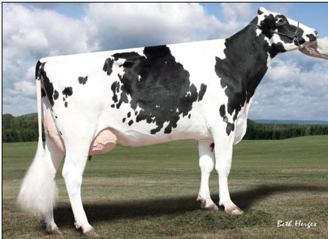
Morningview Shttl Mikki-ET (2E-92 EX-MS GMD DOM) Dam of Lot 82