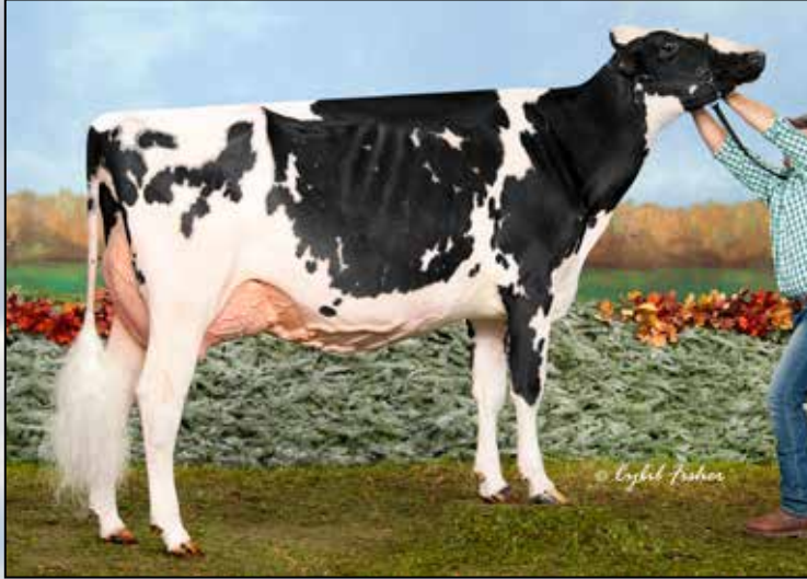
WALKERBRAE DOORMAN LOCKET-ET EX-94 DAM OF LOT DD